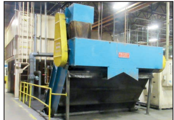
HENRY 1200 SEP COOLANT FILTRATION SYSTEM