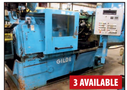
GILDEMEISTER AA32M-8 AUTO BAR MACHINES