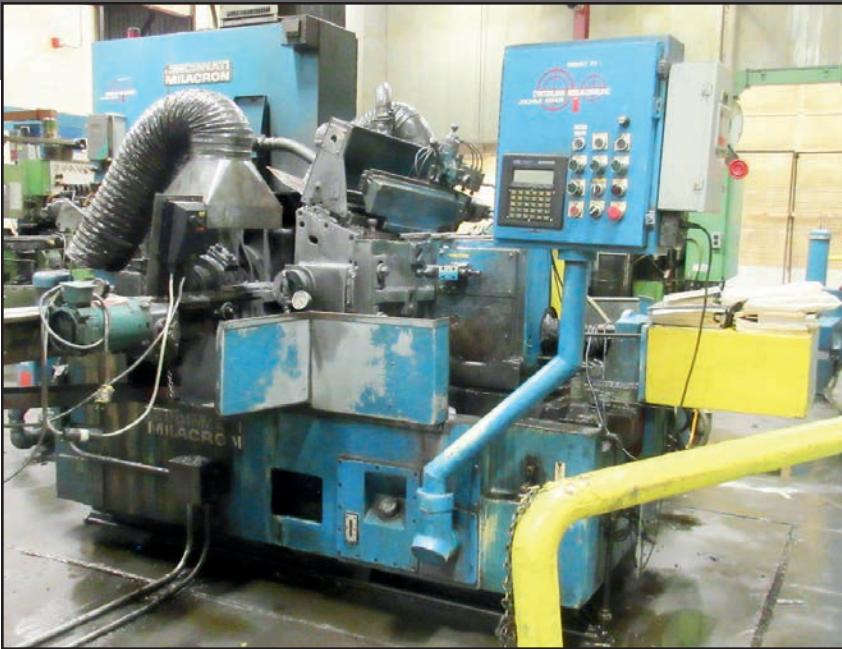
(1 OF 3) CINCINNATI AE-340-20 TWIN GRIP CENTERLESS GRINDERS