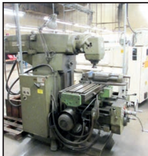
CINCINNATI MILACRON 2MK UNIVERSAL MILL