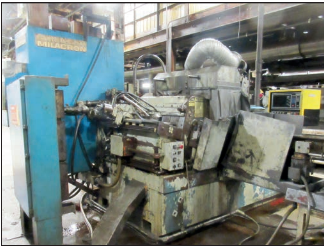
(1 OF 3) CINCINNATI NO 3 TWIN GRIP CENTERLESS GRINDER