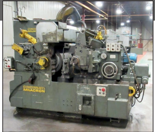
(1 OF 3) CINCINNATI NO 3 TWIN GRIP CENTERLESS GRINDER