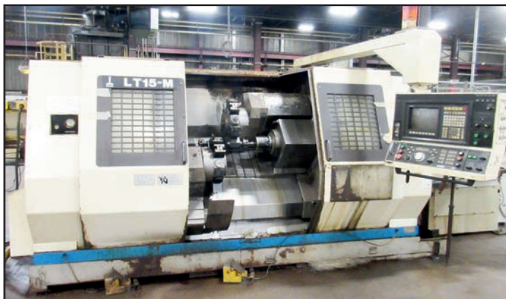
OKUMA LT15-M TWIN-SPINDLE TURNING CENTER