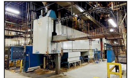
TEK-MOR 7-STAGE IRON PHOSPHATE WASH