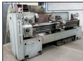
STANDARD MODERN 19/80 19" X 80" ENGINE LATHE