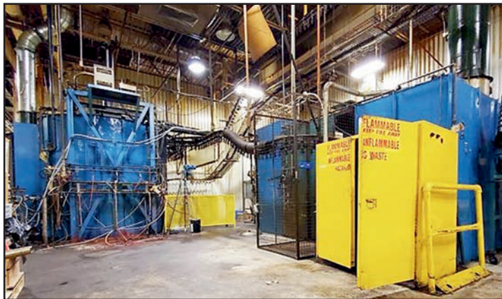
RANSBURG ELC-D-36019-500 ELECTROSTATIC PAINT SYSTEM