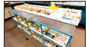
CARBIDE TOOLING AND INSERTS