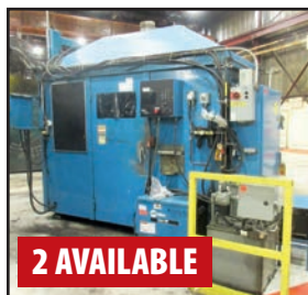
2 AVAILABLE FH FX-110 360 DEG. ROBOTIC WELDERS