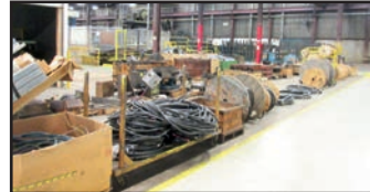
VIEW OF CONSUMABLES