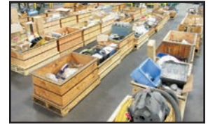
SPARE MOTORS AND PARTS