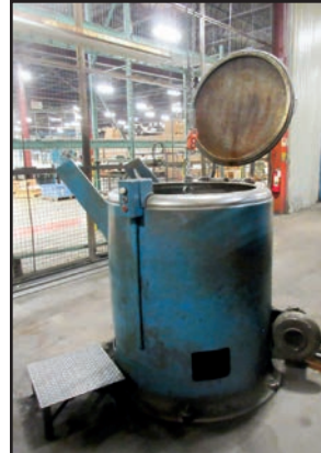
BARRETT 1100-E EXTRACTOR CENTRIFUGE