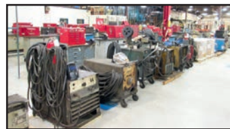
WELDERS AND SUPPORT EQUIPMENT