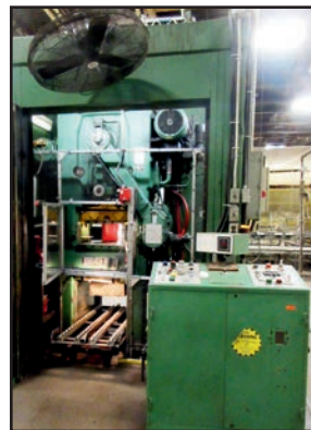
BRUDERER BSTA 30II 30-TON HI-SPEED PRESS

Day 1 Sale Date: Tuesday, August 25 at 9:00 AM ET