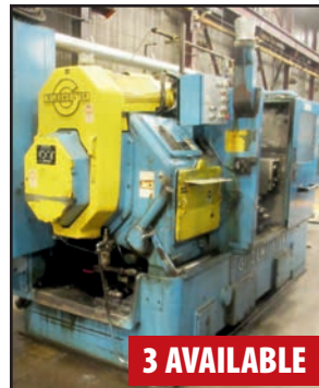
GILDEMEISTER AA32M-6 AUTO BAR MACHINES