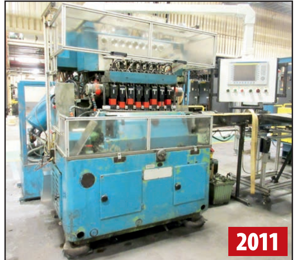
(1 OF 4) SUPFINA SM464 SUPERFINISHERS

Inspection: Monday, August 24 from 8:30 AM to 4:30 PM ET or By Appointment