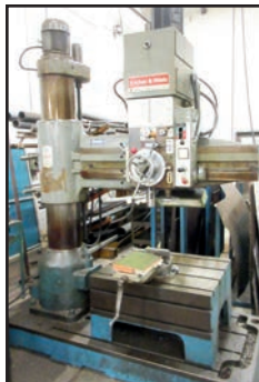
KITCHEN & WADE E32 MARK II 12/54 RADIAL ARM DRILL