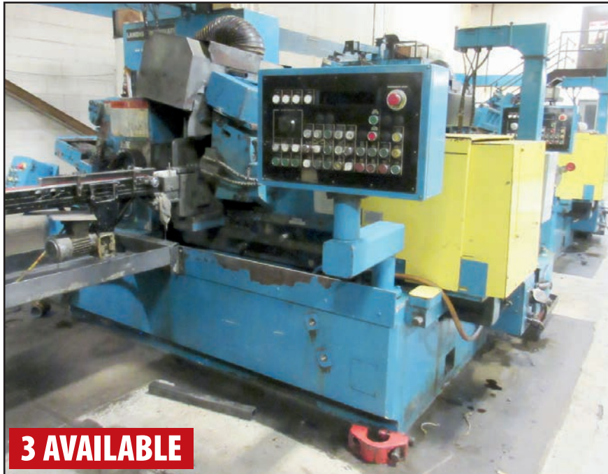
LANDIS CINCINNATI RK SERIES 350-20 TWIN GRIP CENTERLESS GRINDER

HENRY 1200 SEP COOLANT FILTRATION SYSTEM , s/n 3962, w/Koolant Coolers SAR-60,000-SP-CL-SW-R407C-M Chiller, s/n 18770 (Sold Separately)