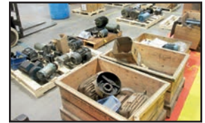
SPARE MOTORS AND PARTS