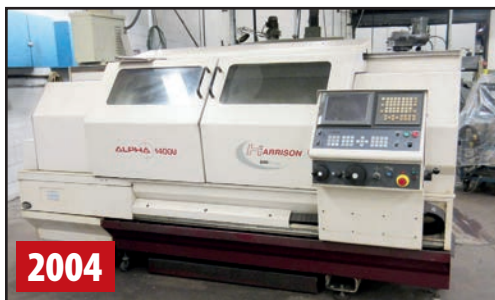
2004 HARRISON ALPHA 1400 CNC LATHE