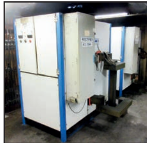
(2) NORTH AMERICAN RECTIFIER 6PF-F 12,000 AMP RECTIFIERS