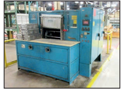
BEM BASKET TYPE ULTRASONIC WASHER

There will be no onsite participation in this Webcast-only auction. All bidders will be able to place live, real-time bids using a desktop or mobile device (the exact same way Webcast bidders have participated in previous sales) and can listen live in real-time to the auctioneer's audio stream.