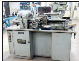
HARDINGE HLV-H PRECISION LATHE

BRUDERER BSTA 30II 30-TON HI-SPEED PRESS, s/n RU2048; BLISS C-110 OBI PRESS, s/n H-66571; (2) FH FX-110 360 DEG ROBOTIC WELDERS, w/Miller Invision 456P Mig Welder, Miller Automatic M Microprocessor Weld Control, Miller Coolmate 3 Chiller; MITCHELL MONOTUBE COLD FORMING MACHINE, s/n PP-579, w/48" Stk, 56mm Max. OD, 32mm Min. OD; 2004 HARRISON ALPHA 1400 CNC LATHE, s/n H7T087; STANDARD MODERN 19/80 19" X 80" ENGINE LATHE, s/n 7961; (2) STANDARD MODERN 15/54 15" X 54" ENGINE LATHES, s/n 8104 (w/Taper Attachment), s/n 8102; HARDINGE HLV-H PRECISION LATHE, s/n KLD-8220; CINCINNATI MILACRON 2MK UNIVERSAL MILL, s/n 13J23UIABE-31; TECHLEADER 3VF 3 HP MILL, s/n 6744; BRIDGEPORT 2 HP MILL, s/n 167033, w/Power Table; GRAND RAPIDS NO. 350 HYDRAULIC SURFACE GRINDER, s/n 350500, w/8" x 24" Mag. Chuck; CINCINNATI NO. 2 TOOL AND CUTTER GRINDER, s/n 1D2F1AAF-229; KITCHEN & WADE E32 MARK II 12/54 RADIAL ARM DRILL; WILSON 2450S GEARED HEAD DRILL PRESS, w/Power Quill Feed; HYDRABEND 2.5M X 3MM HYDRAULIC PRESS BRAKE; DOALL 2612-H VERTICAL BANDSAW, s/n 284-75200; HAMMOND VH600-D-B 6" ABRASIVE BELT GRINDER, s/n 1010; DAKE 5-151 150-TON HYDRAULIC SHOP PRESS, s/n 170852; ALSO: LARGE SELECTION OF VISES, CLAMPING HARDWARE, ROTARY TABLES, MAG CHUCKS, PERISHABLE TOOLING