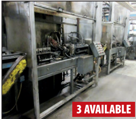
TOCCO ROLL THROUGH BAR HEAT TREAT/TEMPERING LINES