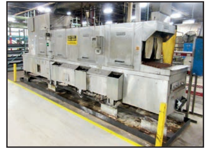
HOBART TUNNEL TYPE WASHER