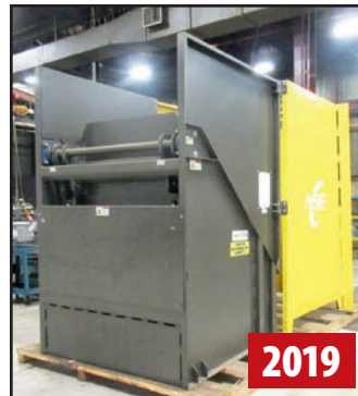
2019 NBE GAYLORD TIPPER (NEW NEVER USED)

To discuss your requirements for an auction, please call Perfection Industrial +1-847-545-6374