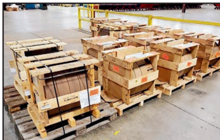
CINCINNATI GRINDING STONES