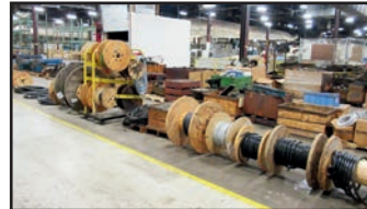
VIEW OF CONSUMABLES

Location: 1800 17th Street East, Owen Sound, ON N4K 5Z9 Canada Inspection: Monday, August 24 from 8:30 AM to 4:30 PM ET or By Appointment