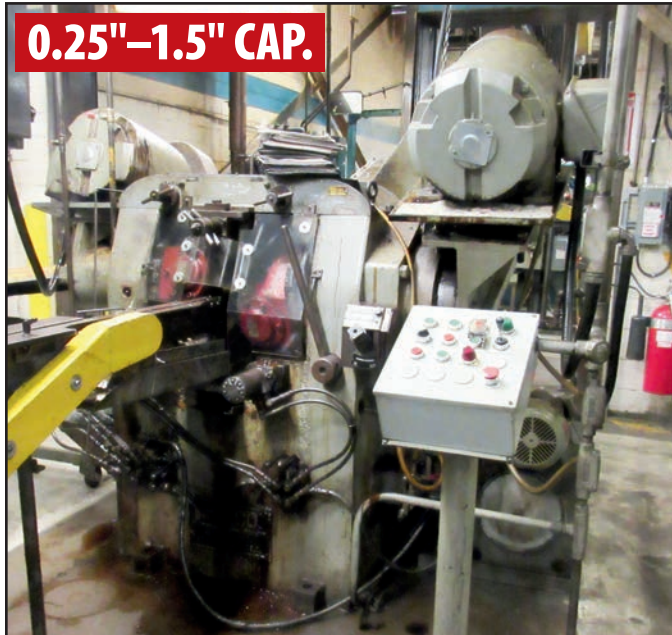
MEECO HD0 2-ROLL 2-MOTOR BAR STRAIGHTENERS

Over 1,000 Lots – Cincinnati Centerless Grinders, Supfina Super Finishers, Meeco Bar Straighteners, Bar Heat Treat/Tempering Lines, Bruderer Hi-Speed Press, Okuma Turning Centers, Acme Gridley & Gildemeister Bar Machines, Vaughn Draw Bench, Wheelabrator 4 Vane Shot Blast, Metallurgical Lab, Plating Line, Paint Line, (19) Forklifts, Machine Shop, Factory Support Equipment