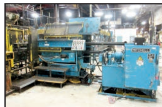
MITCHELL MONOTUBE COLD FORMING MACHINE