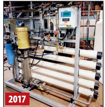
WATTS WATER TECH R24 RO SYSTEM