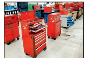
TOOL CHEST AND SUPPORT EQUIPMENT