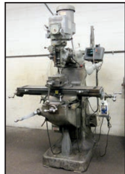
BRIDGEPORT 2 HP MILL