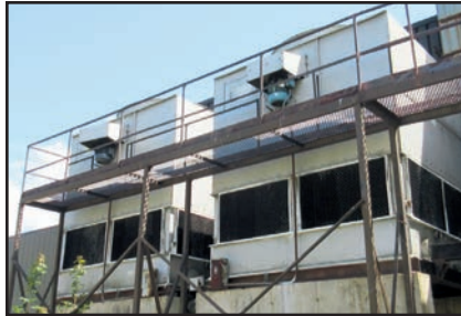
(2) EVAPCO COOLING TOWERS