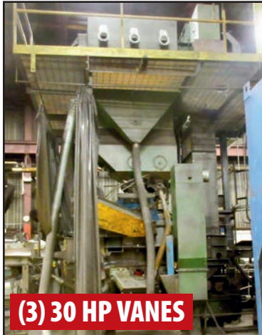
WHEELABRATOR 4 W/A BAR STOCK SHOT BLAST MACHINE

Day 1 Sale Date: Tuesday, August 25 at 9:00 AM ET