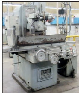
GRAND RAPIDS NO. 350 HYDRAULIC SURFACE GRINDER