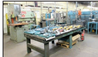
POWER AND HAND TOOLS