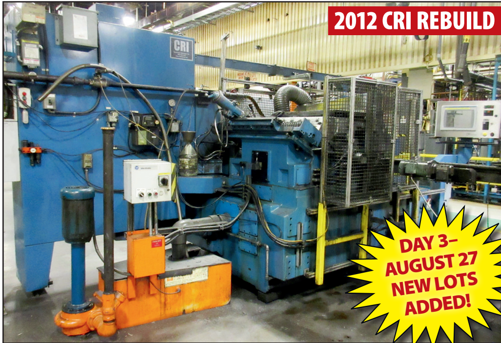
CINCINNATI DE-340-20 TWIN GRIP CENTERLESS GRINDER