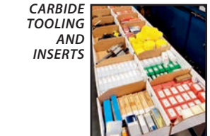
CARBIDE TOOLING AND INSERTS