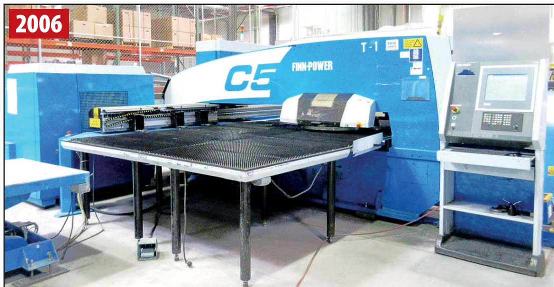
FINN-POWER C5 TURRET PRESS