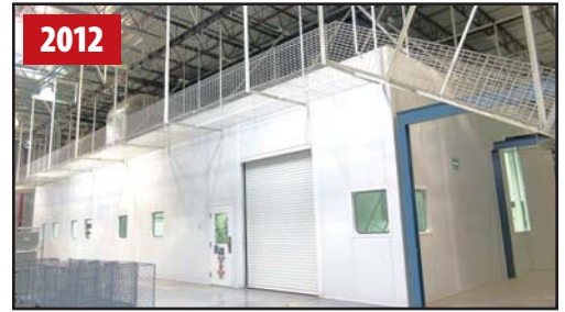
2012 ENVIRONMENTAL AND MASKING ROOM