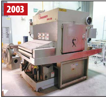
TIMESAVERS 137-2HCMW WET TYPE BELT GRINDER

Online Bidding at www.perfectionindustrial.com