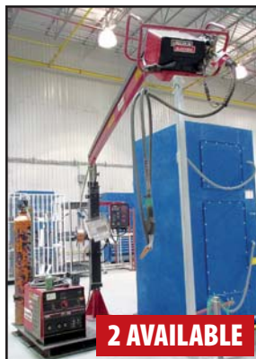
LINCOLN CV-305 MIG WELDER