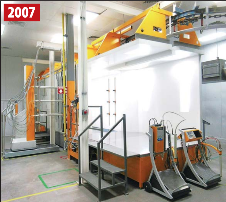
ITW GEMA MAGIC COMPACT BA02 EXTENDED QUICK CHANGE BOOTH

COMPLETE SYSTEM WAS INSTALLED NEW JANUARY TO APRIL 2012 AT A COST OF OVER $1,845,000 USD NOTE: ALL ITW GEMA EQUIPMENT WAS PURCHASED NEW IN 2007/2008 AND INSTALLED NEW 2012