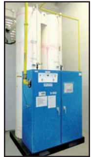
ON-SITE GAS SYSTEM NITROGEN GENERATOR