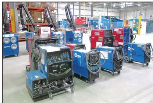
VIEW OF WELDERS AND FUME EXTRACTORS