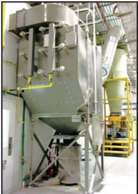
ITW GEMA POWDER RECLAIM SYSTEM