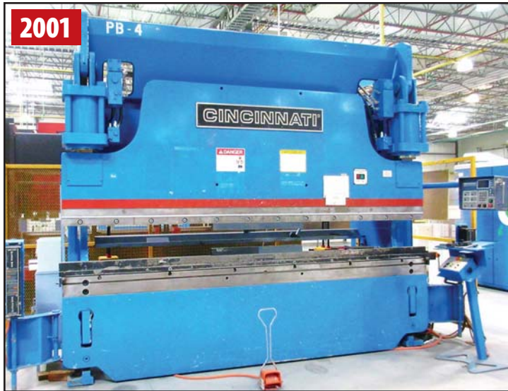
CINCINNATI 230CBII X 10 CNC HYDRAULIC PRESS BRAKE