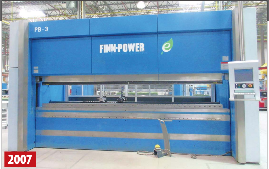
FINN-POWER 200-4100TS3 CNC SERVO-ELECTRIC PRESS BRAKE

Online Bidding at www.perfectionindustrial.com