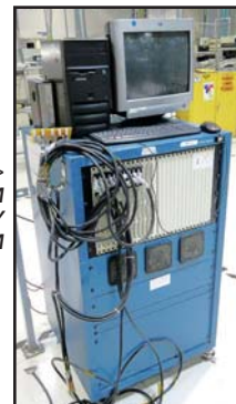
> CABLE TEST SYSTEM MPT-1000 CONTINUITY TEST SYSTEM