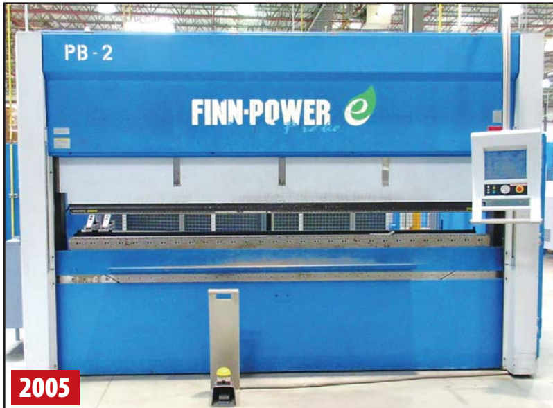
FINN-POWER 100-3100TS1 CNC SERVO-ELECTRIC PRESS BRAKE