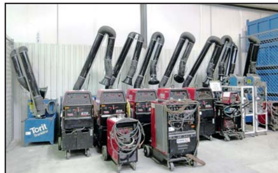
VIEW OF WELDERS AND FUME EXTRACTORS