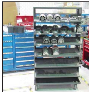
1000+ PIECES OF TURRET TOOLING