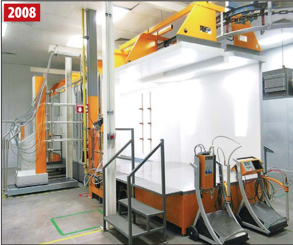
ITW GEMA POWDER COAT PAINT SYSTEM