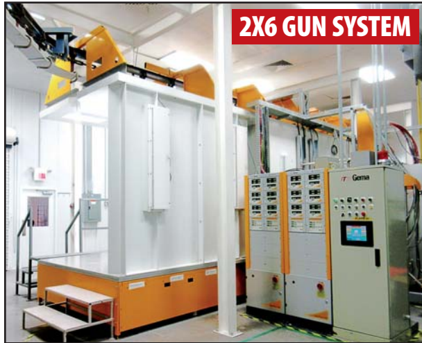
2X6 GUN SYSTEM