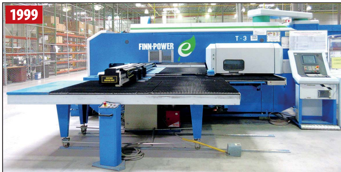
FINN-POWER E5 SBU ELECTRO-SERVO TURRET PRESS