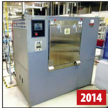
SMARTSONIC 529 STENCIL WASHER

QUAD AVX 500 SOLDER PASTE PRINTER , s/n 500551