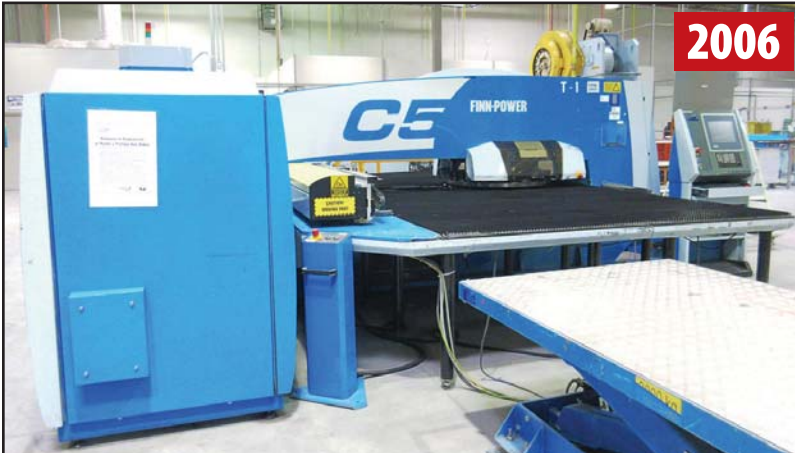
< FINN-POWER C5 TURRET PRESS