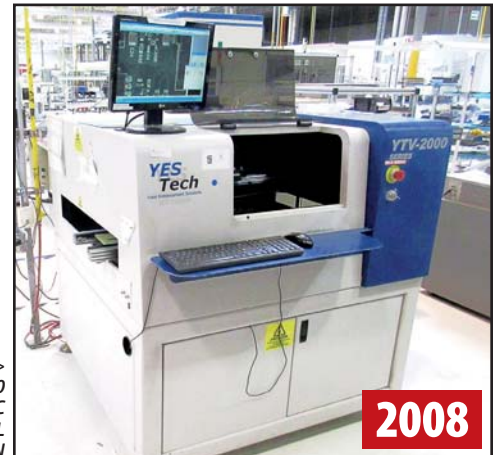
> YESTECH YTV-2000 AUTOMATIC OPTICAL INSPECTION