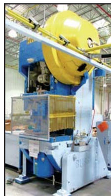
BLISS C100 OBI PRESS