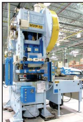
MINSTER G1-110 OBG PRESS