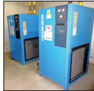
(2) HANKISON AIR DRYERS