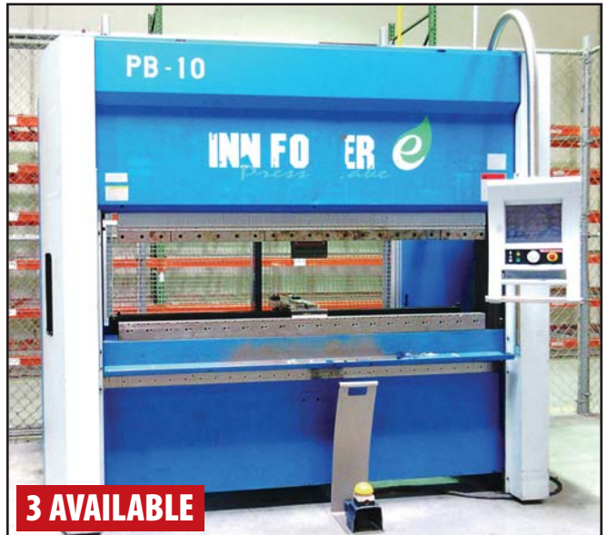
2007 FINN-POWER 50-2050TS1 CNC SERVO-ELECTRIC PRESS BRAKE