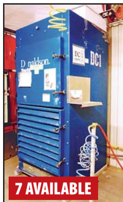
2013 TORIT DONALDSON DUST COLLECTOR