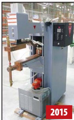
H&H 85 KVA SPOT WELDER