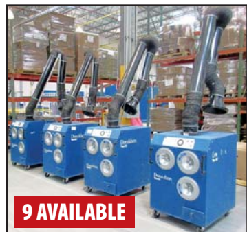
2013 TORIT DONALDSON FUME EXTRACTORS