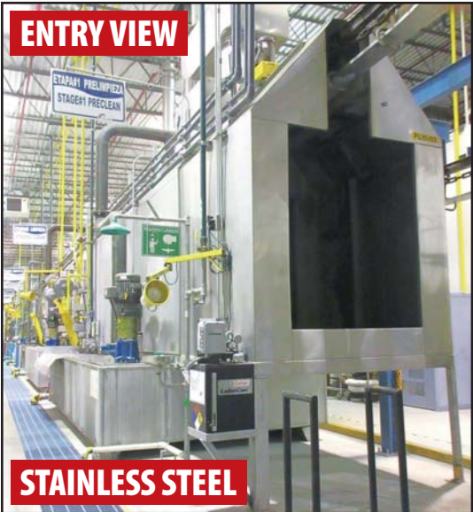
THERMO-TRON-X 8-STAGE PRE-TREATMENT WASHER