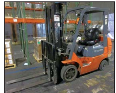
TOYOTA 4,800-LB. FORKLIFT

View our current auction schedule at www.perfectionindustrial.com