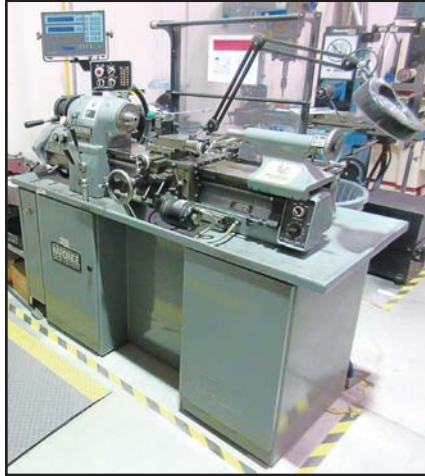
HARDINGE PRECISION LATHE

ALSO: HARDNESS TESTERS, DIGITAL HEIGHT GAUGES, MICROMETERS, VERNIERS, THREAD AND DEPTH GAUGES, GRANITE SURFACE PLATES, KURT VISES, SINE PLATES, MAGNETIC CHUCKS, DBL END GRINDERS, CARBIDE GRINDERS, DISC/BELT SANDERS, MAG BASE DRILLS, PERISHABLE TOOLING INCLUDING DRILLS, REAMERS, CUTTERS, CARBIDE INSERTS, TAPS, V FLANGE TOOLS HOLDERS, BORING BARS, HAND AND POWER TOOLS, ETC.