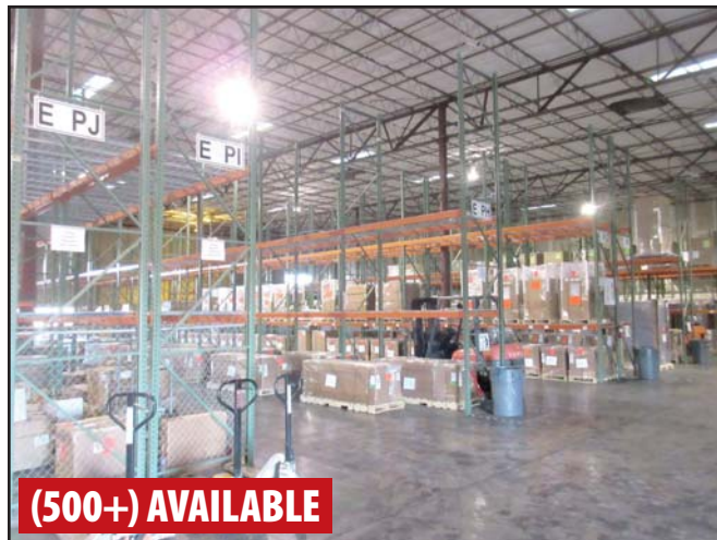
VIEW OF ADJUSTABLE PALLET RACKS

View our current auction schedule at www.perfectionindustrial.com