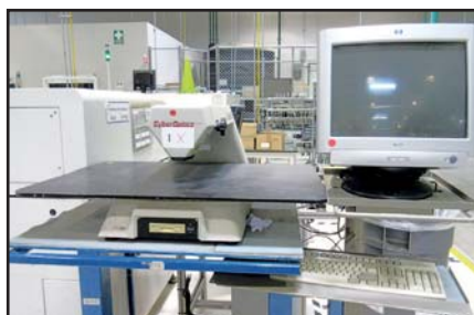
< CYBER OPTICS LSM2 SOLDER PASTE INSPECTION UNIT