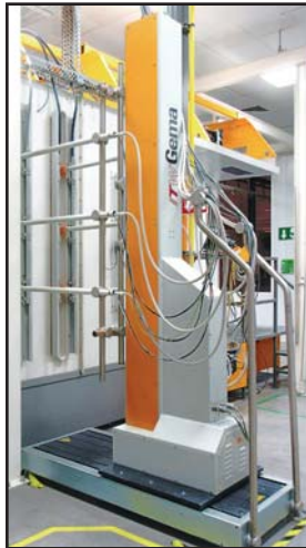
6 OPTIGUN-AX RECIPROCATING ELECTROSTATIC SPRAY GUNS