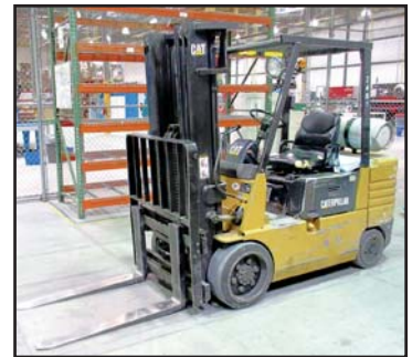
CATERPILLAR 5,800-LB. FORKLIFT