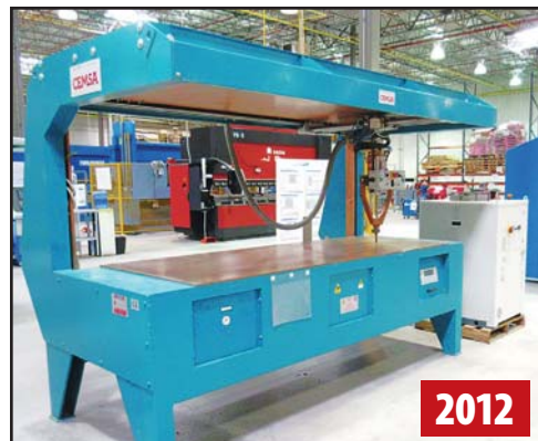
CEMSA 180 KVA SPOT WELDER

ALSO: LARGE SELECTION OF NEW WELDING SUPPLIES INCLUDING MASKS, PROTECTIVE CLOTHING, WHIPS, GUNS, CABLES, WIRE, TOOLS, ETC.