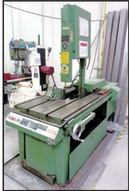
MARVEL VERTICAL BANDSAW