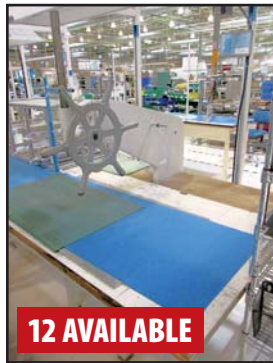
GREENERD NO 3B DEEP THROAT ARBOR PRESSES

2000 SURFACE MOUNT TECHNIQUES 2444BAM SOLDER PASTE PRINTER , s/n 1872