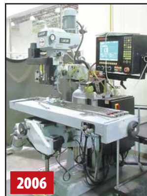
LAGUN CNC MILL