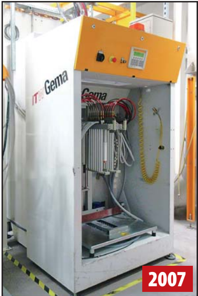
PZ POWDER CENTER W/GEMATIC CONTROL

To discuss your requirements for an auction, please call Perfection Industrial 847-545-6374