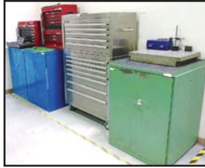
VIEW OF CABINETS AND TOOL CHEST