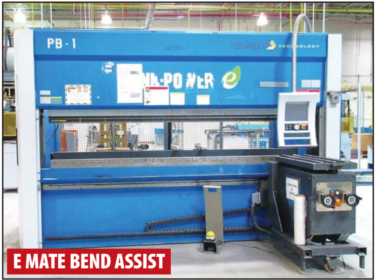
2008 FINN-POWER 100-3100TS1 CNC SERVO-ELECTRIC PRESS BRAKE