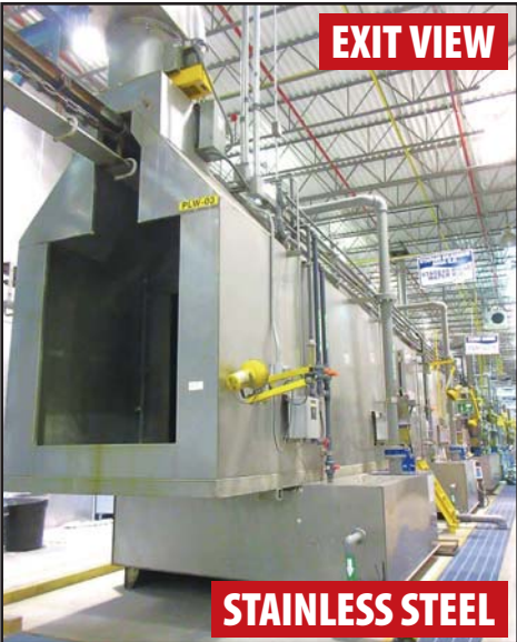
THERMO-TRON-X 8-STAGE PRE-TREATMENT WASHER