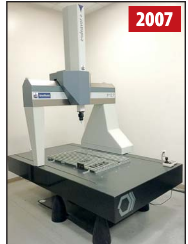
SHEFFIELD ENDEAVOR + 9.12.7 CMM

250,000 LB ASSORTED SHEET STOCK OF ASSORTED STAINLESS STEEL, ALUMINUM, PERFORATED, HOT AND COLD ROLLED, PNO, ETC.