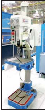
KNUTH GEARED HEAD DRILL