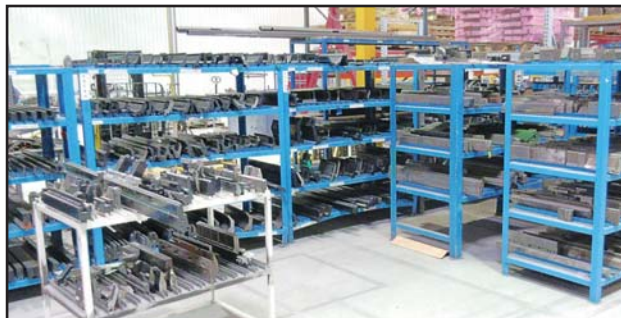
500+ PIECES OF BRAKE DIE TOOLING

View our current auction schedule at www.perfectionindustrial.com