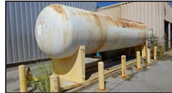
72" X 26' STEEL STORAGE TANK