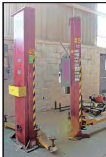
MOHAWK SYSTEM IA 9,000 LB FLOOR-MOUNT HYDRAULIC VEHICLE LIFT