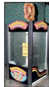
SUPER PRETZEL WARMING OVEN