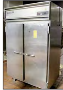
VICTORY 52" DOUBLE-DOOR REFRIGERATOR