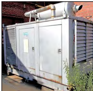
ONAN 230 0 DFP-17R-20074L ELECTRIC STAND-BY GENERATOR