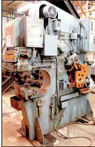
BUFFALO NO. 1-1/2D UNIVERSAL IRONWORKER