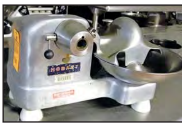
HOBART FOOD PROCESSOR