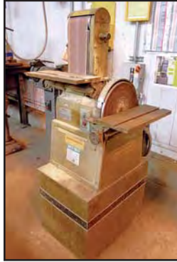
POWERMATIC 30B BELT SANDER