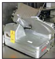
HOBART MEAT SLICER