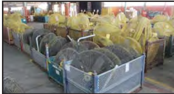
HUNDREDS OF SHOP FANS