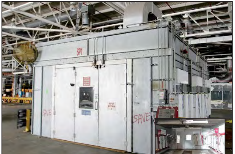
H.M. WHITE 18' X 26' PAINT DRYING BOOTH

ALSO AVAILABLE: PAINT DRYER HEATING UNITS, PAINT GUN WASHERS AND MORE