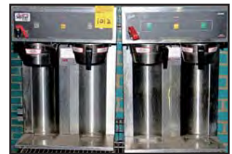
CURTIS COFFEE MAKERS