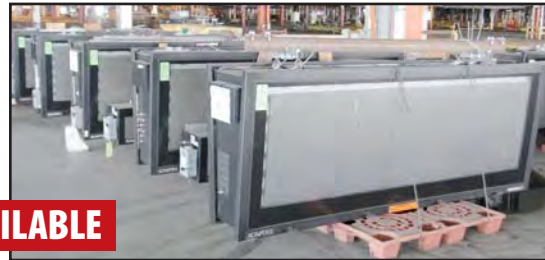
ADAPTIVE AND SCC PROGRAMMABLE ELECTRONIC DISPLAYS