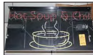
LIGHTED FOOD SIGNAGE