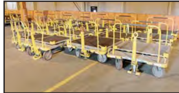
TOWABLE SHOP CARTS