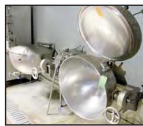
32" STEAM KETTLES