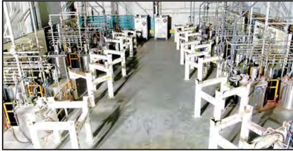
COMPLETE PAINT KITCHEN

Inspection: The inspection for assets located in all days of this sale will be held on Monday, October 17, 2016 from 8:00 AM to 4:00 PM EDT