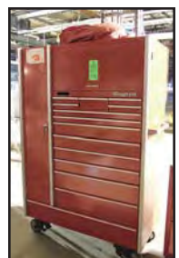
SNAP-ON MOBILE TOOL CHEST

View our current auction schedule at www.perfectionindustrial.com