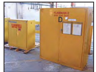
VIEW OF FLAMMABLE CABINETS