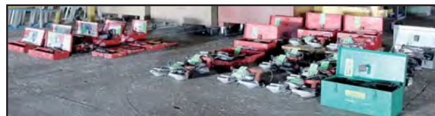
VIEW OF MILWAUKEE BANDSAWS AND JOB BOXES

ALSO AVAILABLE: SNAP-ON AND KENNEDY TOOL BOXES, LYON TOOL CABINETS, FLAMMABLE LIQUIDS CABINET AND MORE