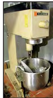
BLAKESLEE DD-801 HEAVY-DUTY MIXER