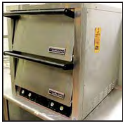
GARLAND CP0-ED-24H DOUBLE PIZZA OVEN