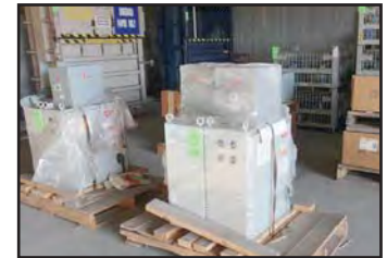
SQUARE D TRANSFORMERS AND SWITCHBOXES