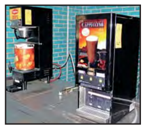
CAPPUCCINO AND ICED TEA MACHINES