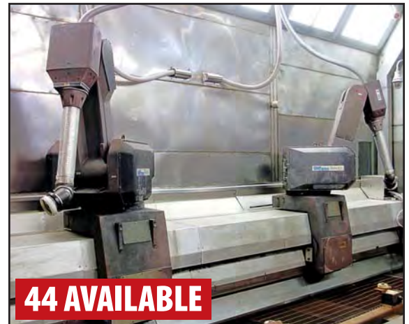
LK METRE FOUR COORDINATE MEASURING MACHINES