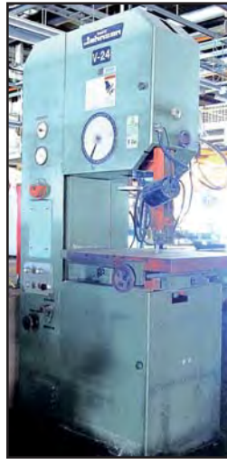
DAKE-JOHNSON V-24 24" VERTICAL BANDSAW