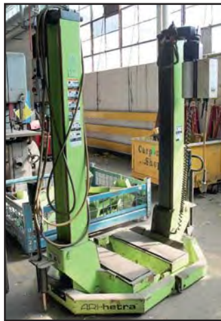
ARI-HETRA HDML-8-2 15,000 LB MOBILE VEHICLE LIFT

RITE-HITE HYDRAULIC DOCK LEVELERS W/VEHICLE RESTRAINT AND CONTROL PANEL