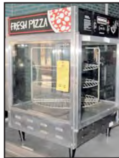
NEMCO PIZZA WARMER