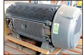
600 HP US ELECTRIC MOTOR