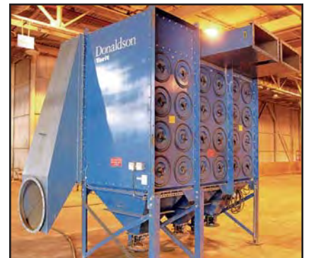
DONALDSON TORIT DFT4-48 24-CARTRIDGE DUST COLLECTOR

To discuss your requirements for an auction, please call Perfection Industrial 847-545-6374