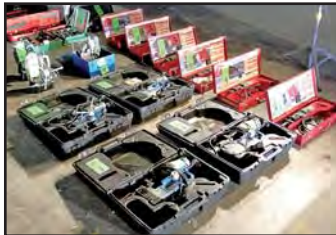
MAG DRILLS AND SAWZALLS

(15) HILTI CORDLESS DRILLS, Hammer Drills and Rotary Hammers