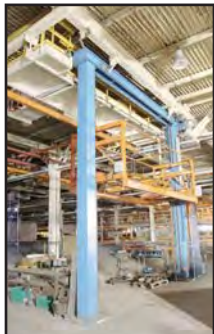
14' CENTER RIDING HYDRAULIC PLATFORM LIFT