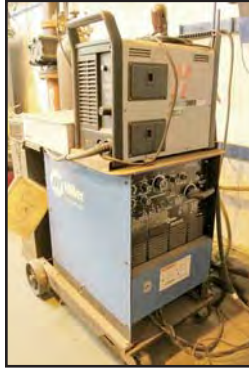
MILLER SYNCROWAVE 250 W/HYPERTHERM POWERMAX 1250