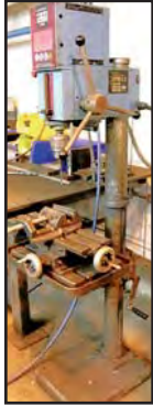
ARBOGA A 2608W DRILL PRESS

ALSO AVAILABLE: LARGE SELECTION OF GREENLEE PIPE BENDERS, PIPE THREADERS, PAINT POTS AND ACCESSORIES AND MUCH MORE