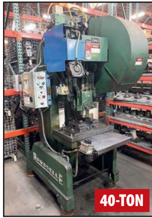
ROUSSELLE NO. 4 OBI PRESS