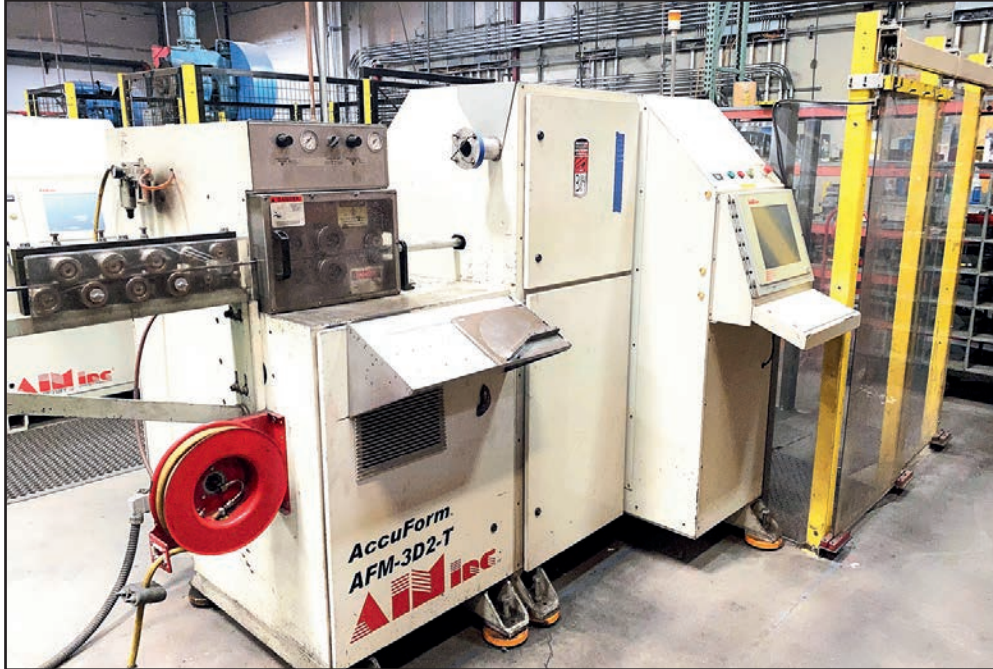
AIM ACCUFORM AFM-3D2-T CNC WIRE BENDER