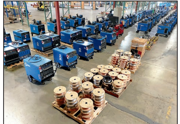
COMPLETE WELDING DEPARTMENT

Sale Closing From: Wednesday, May 27 at 10:00 AM PDT