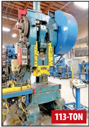
E.W. BLISS 28-1/2 OBI PRESS