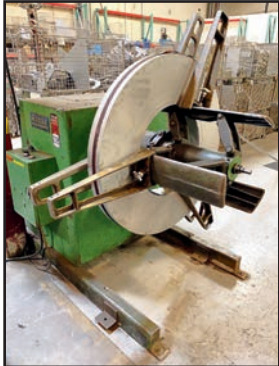
REGAL 6000-18 SRP UNCOILER