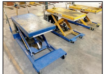
ASSORTED LIFT TABLE CARTS