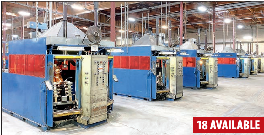
ROBOTIC WELDING CELLS W/ABB ROBOTS

FEATURING: AIM Accuform AFM-3D2-T CNC Wire Bender, Robotic Welding Cells w/ABB IRB1600 & 1400 Robots, Welders, Haven 873 Tube Cut Off System, Eagle EPT-100-XPH CNC Tube Bender, Presses, Coil Equipment, Tool Room, Shop Presses, Plant Support & More