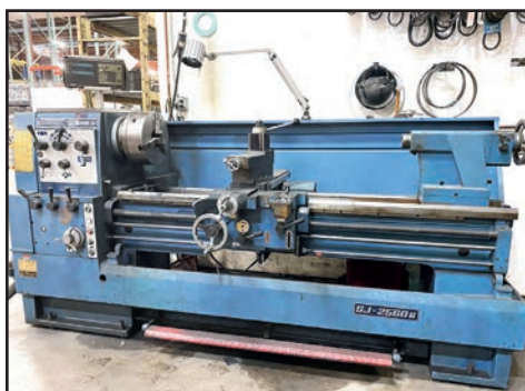
SHEN JEY OSAMA SR SJ-25600 LATHE