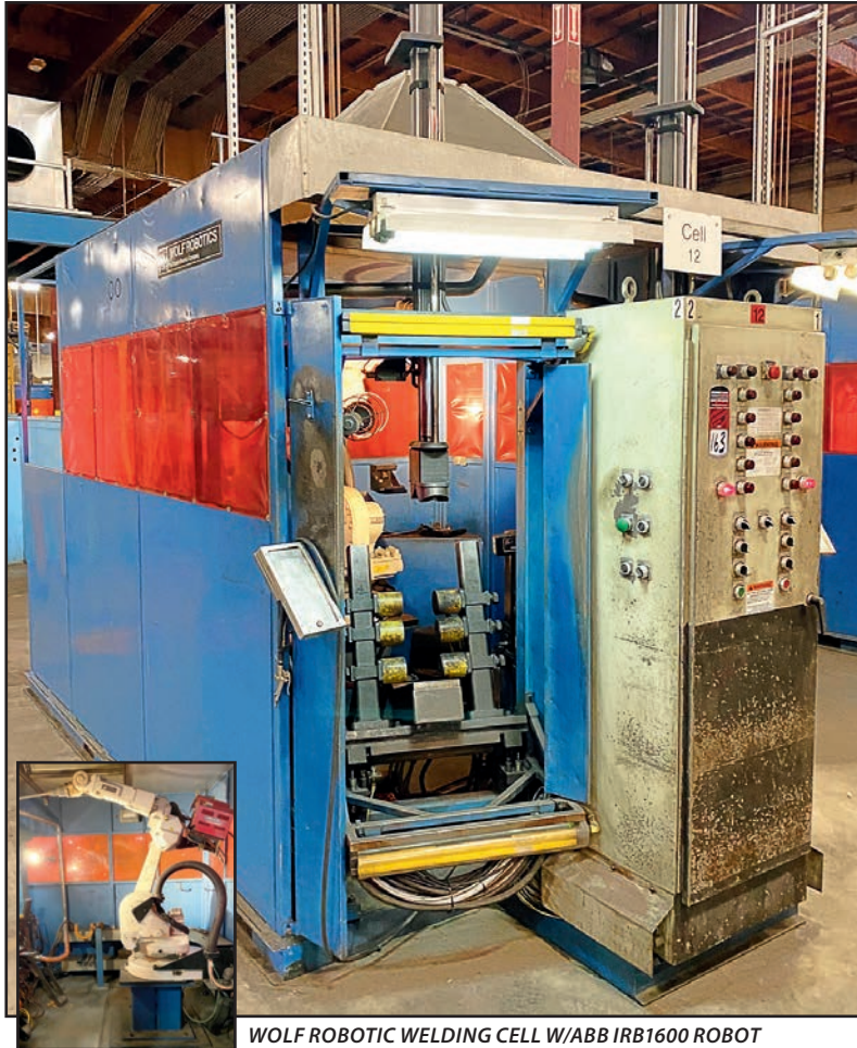
WOLF ROBOTIC WELDING CELL W/ABB IRB1600 ROBOT