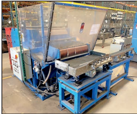
VIBRATORY CHUTE FEEDER SYSTEM