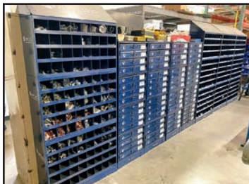
HARDWARE CUBBIES W/ASSORTED CONTENTS