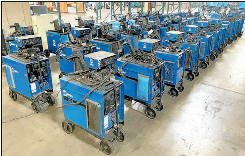
HUGE SELECTION OF WELDERS

Online Bidding at www.perfectionindustrial.com