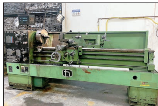
NARDINI ND 1760 E LATHE