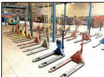
VIEW OF PALLET JACKS