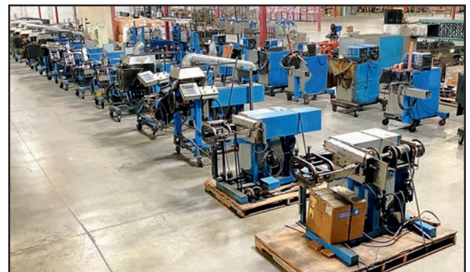
ASSORTED ROTATING, SEAM AND END CAP FINISH WELDING SYSTEMS