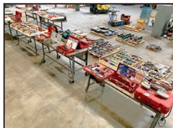
SELECTION OF POWER, PNEUMATIC AND HAND TOOLS