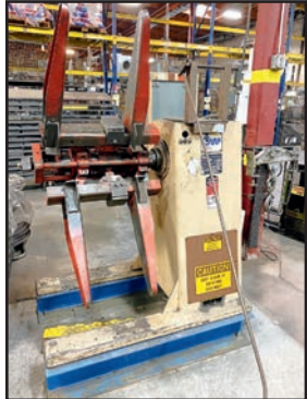
CWP 5000-18M UNCOILER

ALSO AVAILABLE: CWP FEEDER/STRAIGHTENERS AND ASSORTED UNCOILERS