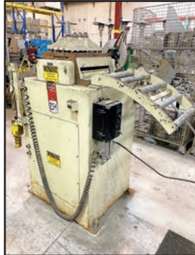
CWP 12A FEEDER/STRAIGHTENER