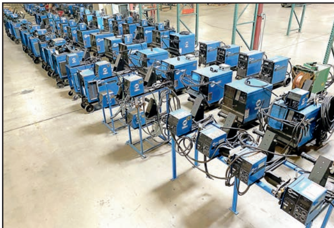
ADDITIONAL VIEW OF WELDERS

ALSO AVAILABLE: MILLER ROBOTIC INTERFACES, MILLER AND LINCOLN WIRE FEEDS, WIRE REELS, VARIOUS WELDING WIRE, WELD GUNS, FIXTURES