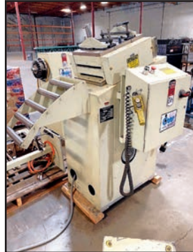
CWP SE12B STRAIGHTENER