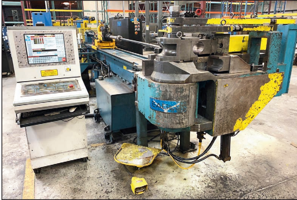
EAGLE EPT-100-XPH HYDRAULIC CNC TUBE BENDER

MSC 0951-1654 VERTICAL BANDSAW , s/n 9460050, 27" x 29" Table, 24" Throat, Blade Welder