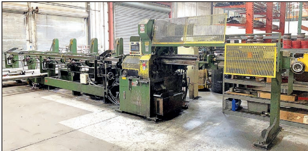
HAVEN 873 TUBE CUTTING SYSTEM