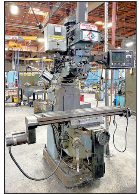
CLAUSING KONDIA FV-1 VERTICAL MILL