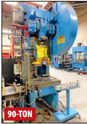
VERSON NO. 75 OBI PRESS