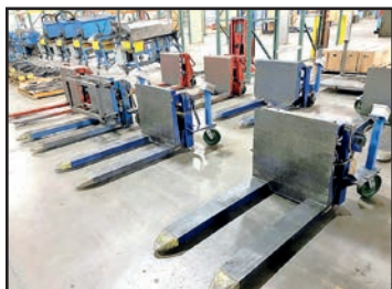
ELECTRIC PALLET JACKS AND CONTAINER TILTERS