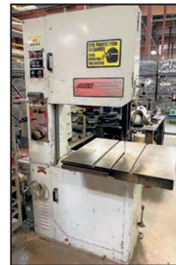
MSC 0951-1654 VERTICAL BANDSAW