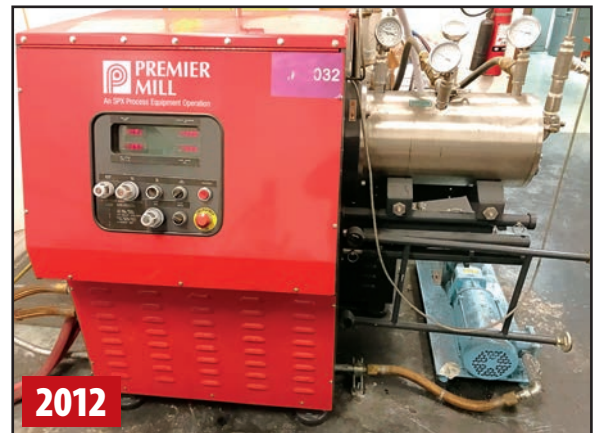
PREMIER MILL SM-15 25 HP MEDIA MILL