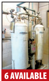
ULTRA-AIR REGENERATIVE AIR DRYERS