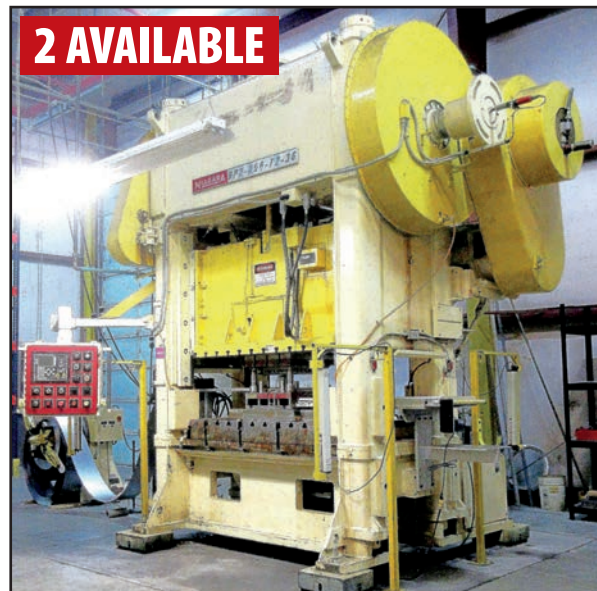
NIAGARA BP2-200-72-36 STRAIGHT SIDE PRESS

V&O 35-TON HI-SPEED OBI PRESS , s/n 35ST-187, w/125-250 SPM, Coil Feed, Pallet Uncoiler