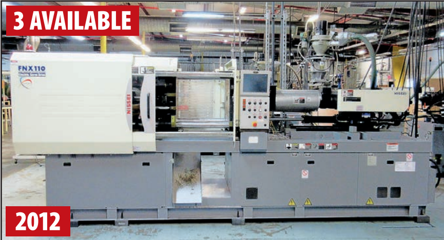
NISSEI 123-TON SERVO ELECTRIC MOLDER

FEATURING: (25) INJECTION MOLDERS, (5) BLOW MOLDERS, (4) EXTRUDERS, STAMPING, EDMS, SWISS TYPE SCREW MACHINES, CNC TURNING, GRINDING & MACHINING, CONVENTIONAL MACHINE TOOLS, INSPECTION, (5) PREMIER MILL HORIZONTAL MEDIA MILLS, INK MIXING/PROCESSING, PLATING, WASTE WATER PLANT, FACTORY SUPPORT, FORKLIFTS, MATERIAL HANDLING & MORE