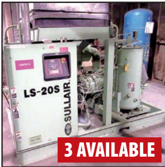
SULLAIR 100 HP AIR COMPRESSOR

(2) ULTRA-AIR LFE-620DU REGENERATIVE AIR DRYERS, s/n NA