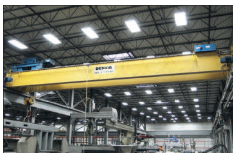
DEMAG 40 TON