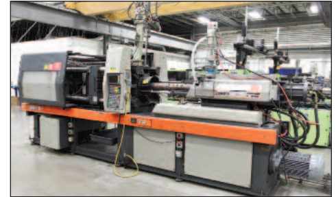
SANDRETTO 75 TON