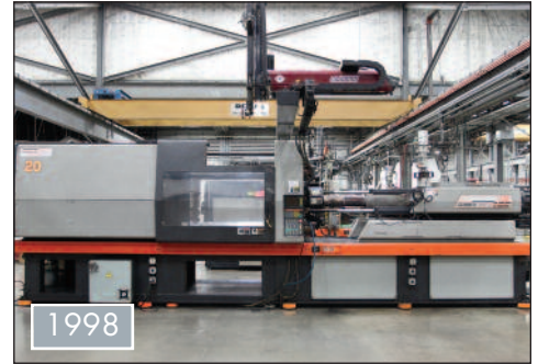
SANDRETTO 425 TON, 44 OZ