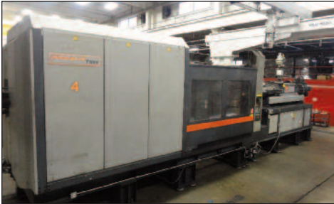
SANDRETTO 1000 TON