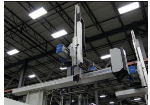
SEPRO SUCCESS 22