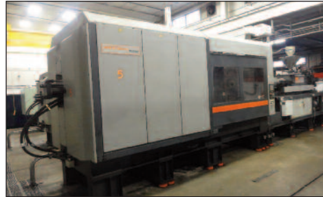
SANDRETTO 750 TON