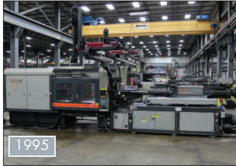
SANDRETTO 600 TON, 72.6 OZ