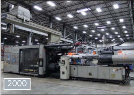
SANDRETTO 2,000 TON, 285 OZ