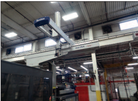
YUSHIN YA II-1300