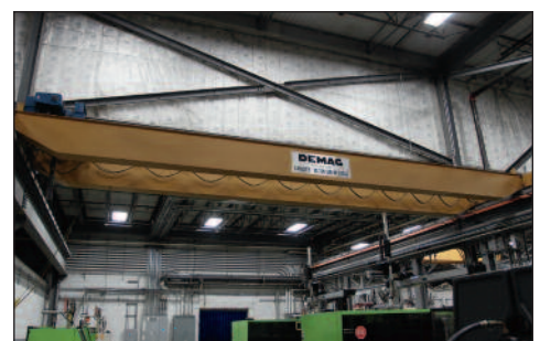
DEMAG 10 TON