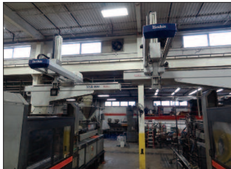
YUSHIN YA II-800