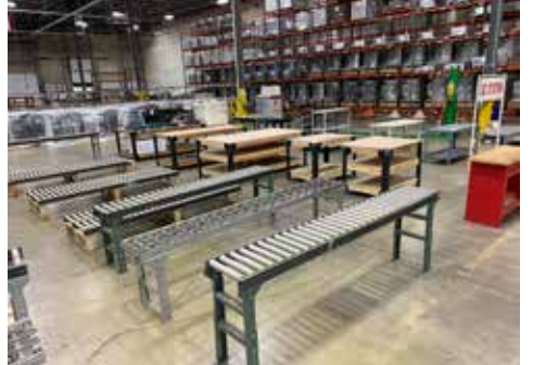
VIEW OF ROLLER CONVEYOR