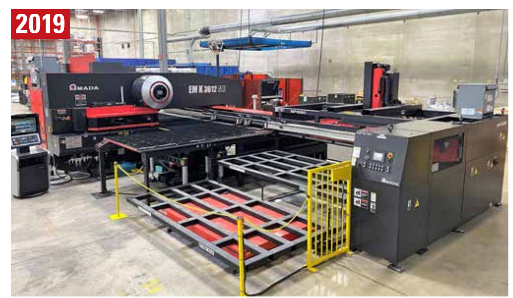
1 OF 2 AMADA EMK3612M2 TURRET PUNCH PRESS