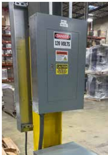
VIEW OF ELECTRICAL