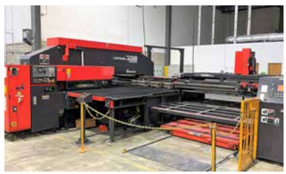
AMADA VIPROS 358 KING TURRET PUNCH PRESS