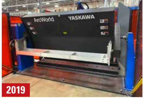
ARCWORLD MRM2-250STN POSITIONER

All bidders will be able to place live, real-time bids using a desktop or mobile device (the exact same way Webcast bidders have participated in previous sales) and can listen live in real-time to the auctioneer's audio stream.