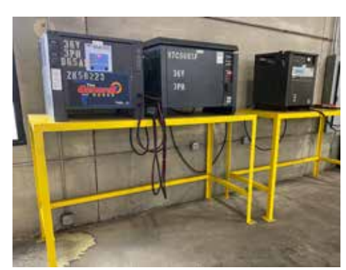
FORKLIFT BATTERY CHARGERS