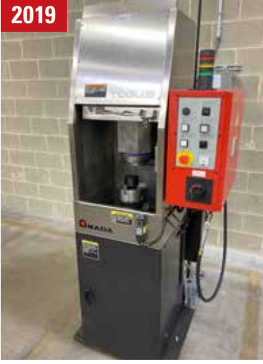
AMADA TOGU-III TOOL GRINDER

(2) Amada MP1225NH Sheet Load/Unload Systems 2019 AMADA TOGU-III Automatic Tool Grinder, s/n 30231560