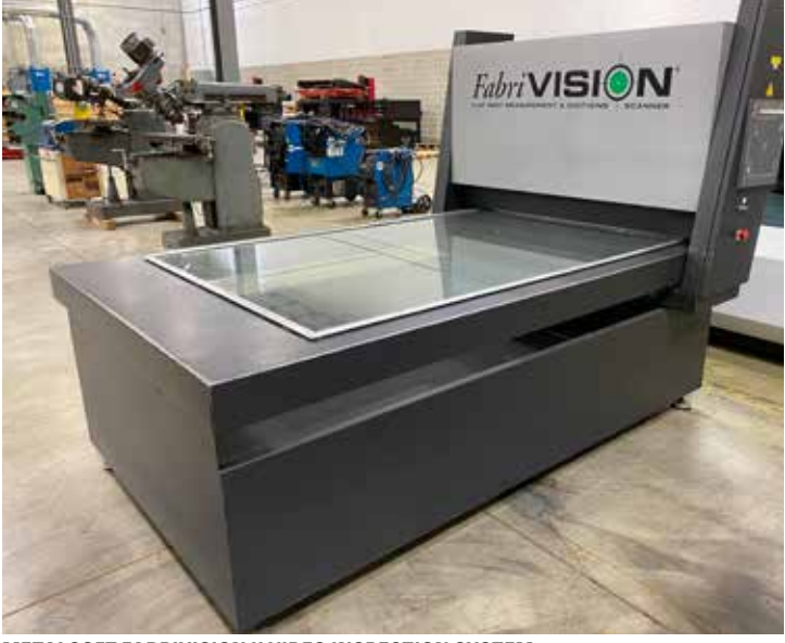
METALSOFT FABRIVISION II VIDEO INSPECTION SYSTEM

To avoid any public gatherings, there will be no onsite participation in this Webcast-only auction.