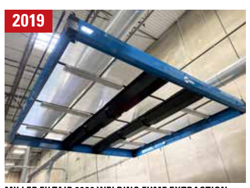
MILLER FILTAIR 6000 WELDING FUME EXTRACTION