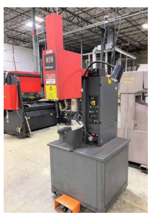
HAEGER 618-1L INSERTION MACHINE

All bidders will be able to place live, real-time bids using a desktop or mobile device (the exact same way Webcast bidders have participated in previous sales) and can listen live in real-time to the auctioneer's audio stream.