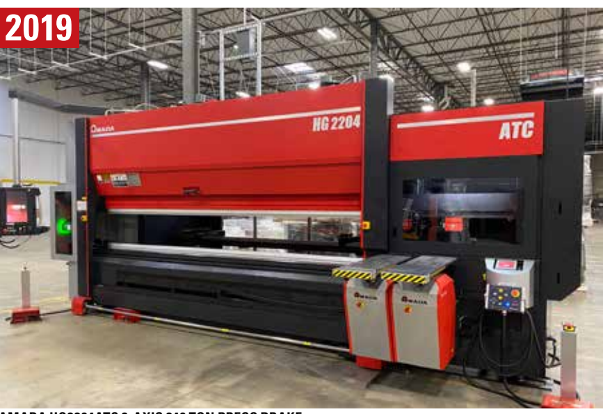
AMADA HG2204ATC 8-AXIS 240 TON PRESS BRAKE

(3) AMADA RG-80 88 Ton CNC Press Brakes, s/n 811650, 811057, 807768, NC-9EXII Control, 94.6" Table Length, 98.7" Max Bending Length, 80.8" Distance Between Uprights, 15.76" Throat Depth, 3.94" Stroke, 14.58" Open Height