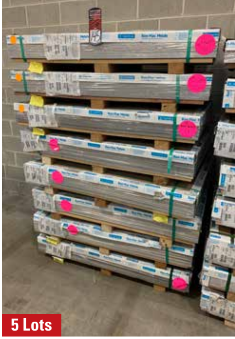
36" X 52" 5052 ALUMINUM SHEET STOCK