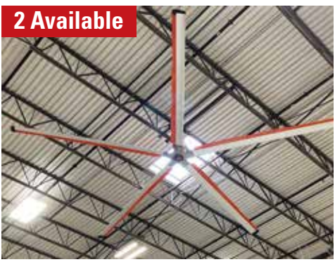
GO FAN YOURSELF 24' FAN