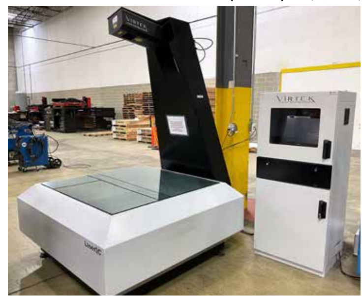
VIRTEK LASER QC LASER INSPECTION MACHINE

2000 METALSOFT FABRIVISION II Video Inspection System, s/n 2179, 8-Camera, 4' x 6' Table, 1800 Lb. Capacity