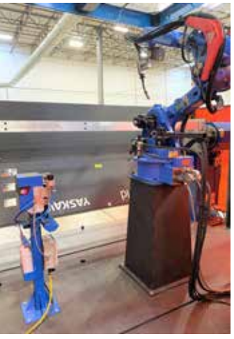
YASKAWA MOTOMAN HP20D WELDING ROBOT

To avoid any public gatherings, there will be no onsite participation in this Webcast-only auction.