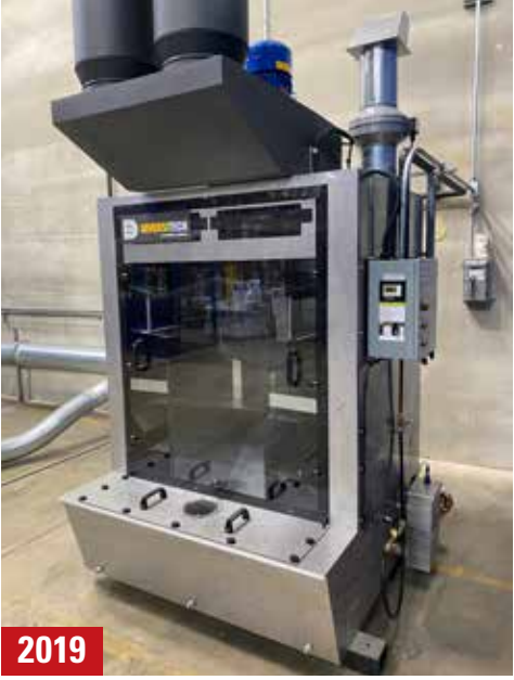
DIVERSITECH TYPHOON WX-6500 WET TYPE DUST

To discuss your requirements for an auction, please call Perfection Industrial at +1-847-427-3333