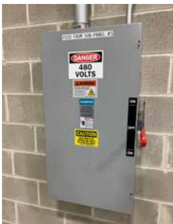
VIEW OF ELECTRICAL