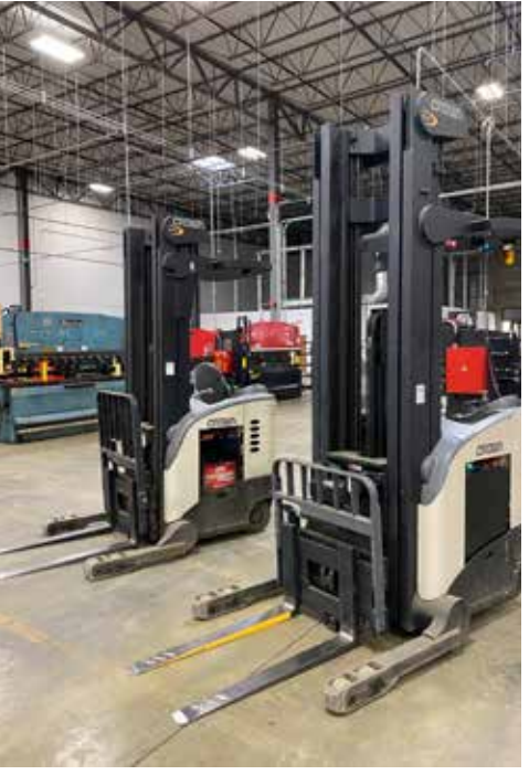
(2) CROWN ELECTRIC REACH TRUCKS

CROWN RD5220-30 3000 lb. Electric Narrow Aisle Forklift, s/n 1A310176, 3000 Lb. Capacity, Triple Mast, Double Reach, w/ Charger