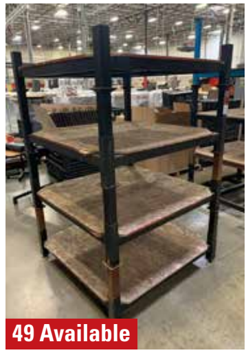
48" X 48" METAL STAKE PALLETS