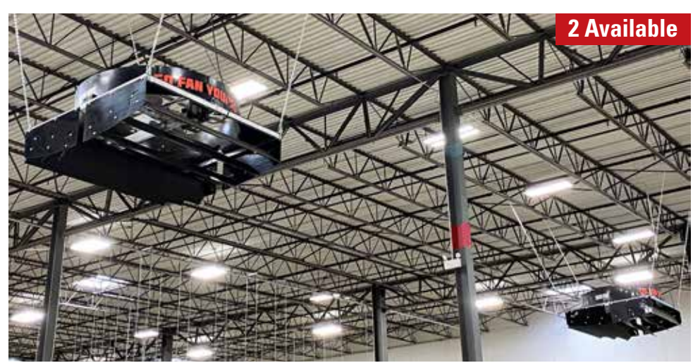
GO FAN YOURSELF 72" FANS

ALSO; Large Assortment of Dismantled Pallet Racking, Pallet Jacks, Banding Sets, Flammable Liquids Cabinet, Lift Table, Power Tools, and More