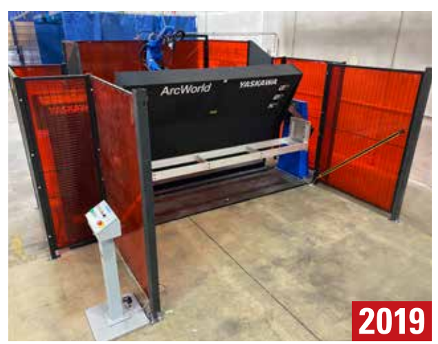
YASKAWA MOTOMAN ROBOTIC WELDING CELL & POSITIONER

FRONIUS CMT TRANSPULS SYNERGIC 4000 Multi-Process Power Source, s/n 28429424 ARCWORLD MRM2-250STN Positioner, Robot Riser