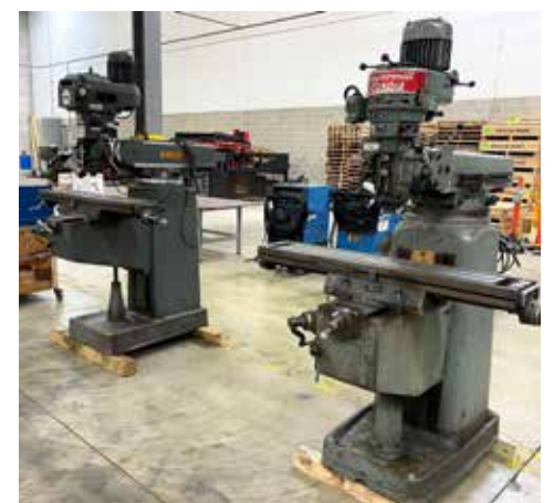
KONDIA & LAGUN MILLS

Complete Catalog and More Info Available at bit.ly/perfection-northstar