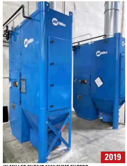
(2) MILLER FILTAIR 6000 FUME FILTERS

2014 MILLER MILLERMATIC 350P MIG Welder, s/n ME081096N