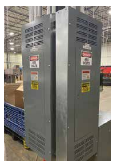
VIEW OF ELECTRICAL