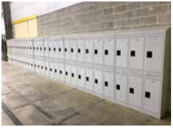
VIEW OF LOCKERS