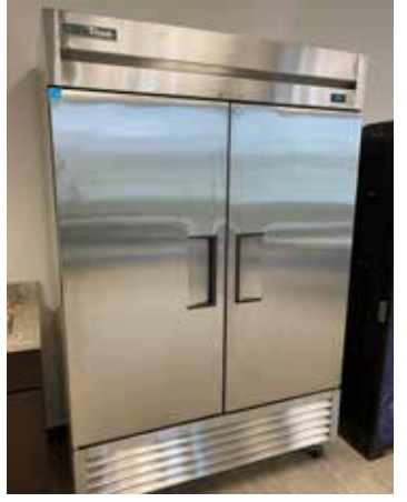
TRUE T-49-HC REFRIGERATOR