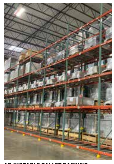
ADJUSTABLE PALLET RACKING (69 SECTIONS AVAILABLE)