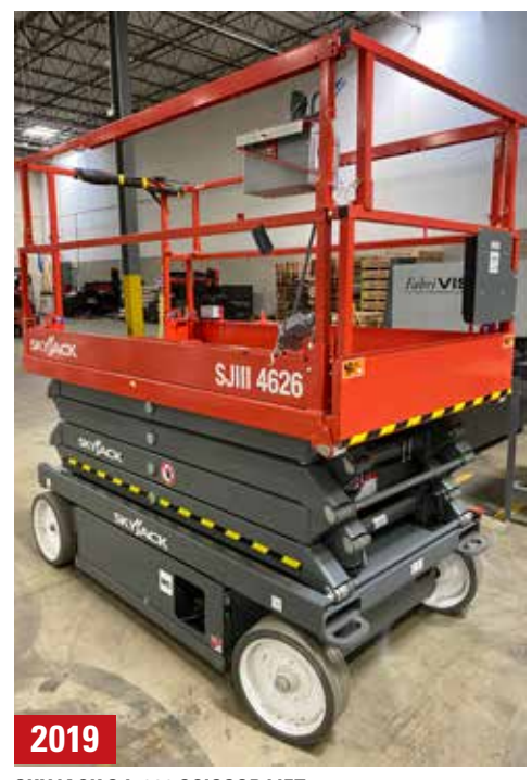
SKYJACK SJ4626 SCISSOR LIFT