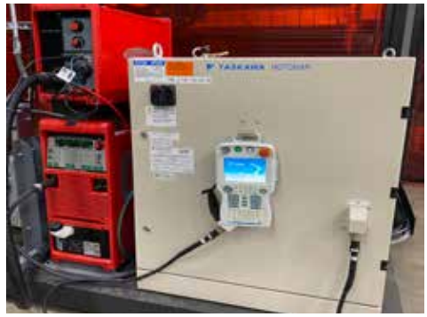
YASKAWA MOTOMAN CONTROL & WELD POWER