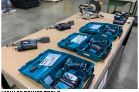
VIEW OF POWER TOOLS

OVER $250,000 Invested in New 2019/2018 Electrical Services Installed to Provide Machine Power Including: SQUARE D, SIEMENS and HAMMOND Transformers – up to 100 KVA; SQUARE D and SIEMENS Switchgears & Safety Switches – up to 600 amp; 1000 + Feet of Cable, Wire and Conduit, Cable Trays, Disconnects; Electrical Hardware, Etc.