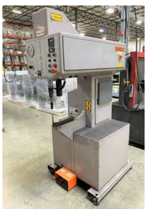
AUTO-SERT AS-7 INSERTION MACHINE