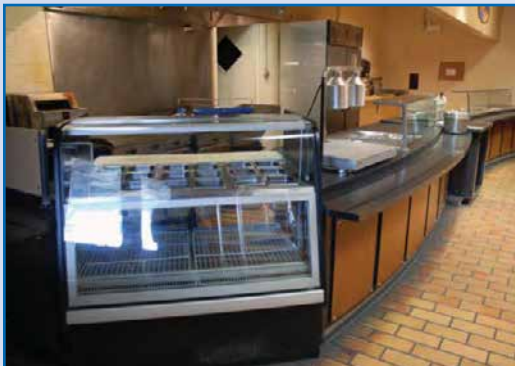
COMPLETE KITCHEN & CAFETERIA