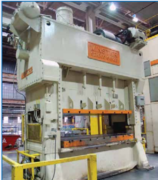
MINSTER S2-200-96-48 STRAIGHT SIDE DBL CRANK PRESS