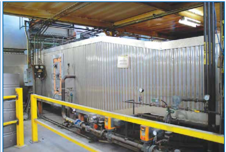
HEAT EXCHANGE SYSTEM

CONTROLLED PYROLYSIS PRC412 4722 Dbl Door Burn-Off Oven , s/n n.a., 52" w x 100" h x 120" d, 4' x 10' Car, Gas Fired