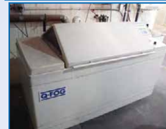
Q-FOG 600 LITER CYCLIC CORROSION TESTER