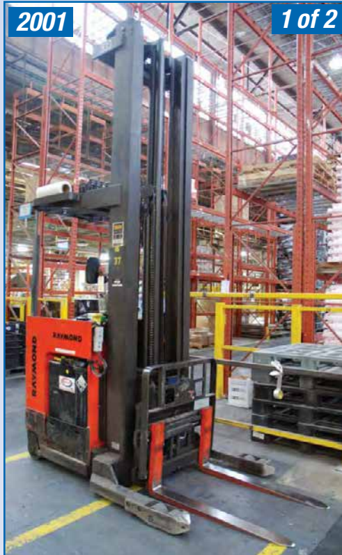
RAYMOND EASY R40TTM 4000LB. REACH TRUCK