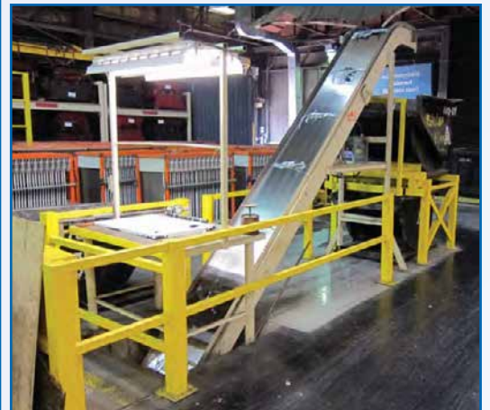
ERIEZ 250' MAGNETIC SLUG CONVEYOR SYSTEM