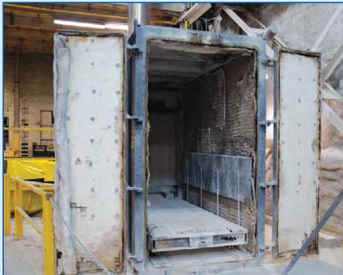
CONTROLLED PYROLYSIS PRC412 4722 DBL DOOR BURN-OFF OVEN