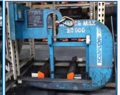
MOTIVATION 20,000 LB CAP COIL HOOK