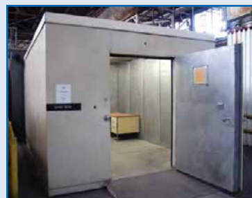
MODULAR SOUND ROOM