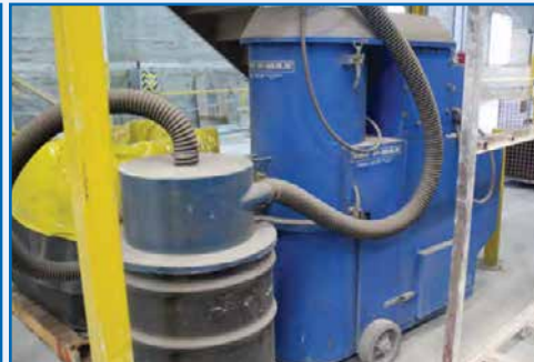
VACUMAX 1010P FINE MATERIAL VACUUM