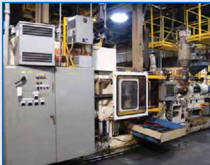
CINCINNATI 500 TON HYD INJ MOLDER