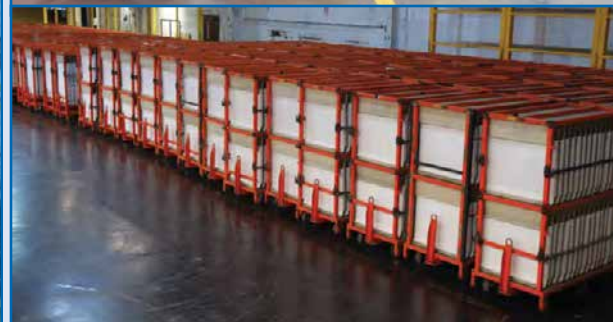
TAYLOR DUNN E0-034-51 ELECTRIC TUGGER TRUCKS PLUS TUGGER CARTS