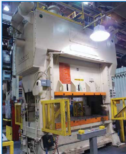
MINSTER S2-200-84-48 STRAIGHT SIDE DBL CRANK PRESS