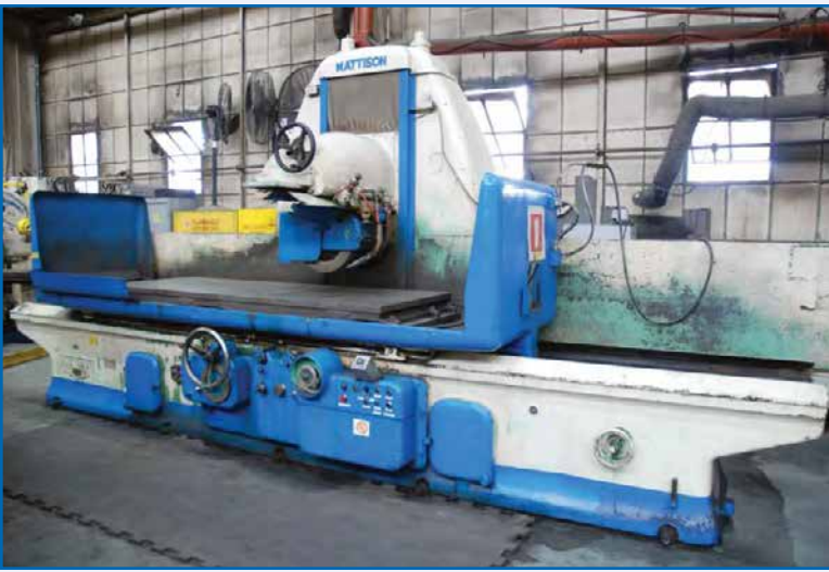
MATTISON 36"X 90" HYD. SURFACE GRINDER