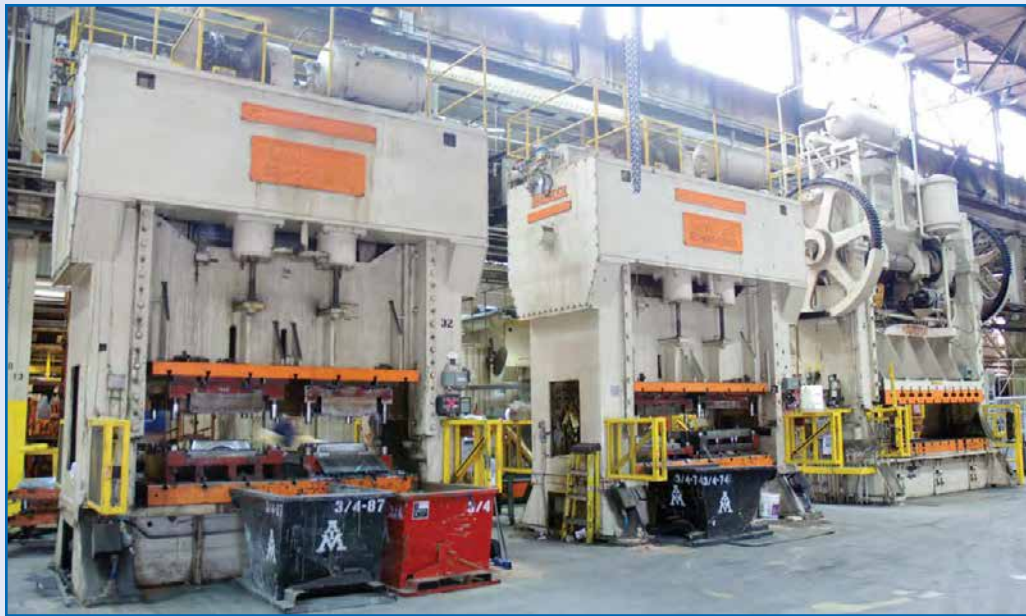
VIEW OF 2 MINSTER 400 TON & HAMILTON 1,000 TON STRAIGHT SIDE PRESSES

HAMILTON 1000 Ton Straight Side Press, s/n 1412, w/ 140"x 60" Bed, 15" Stroke, 8" Adj., 28" Shut Height