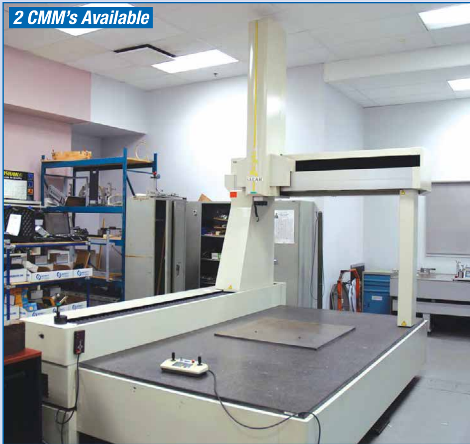
MITUTOYO BRIGHT 1220 CMM