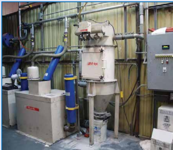
MOULDETEK 40 HP VACUUM LOADER & DISTRIBUTION SYSTEM