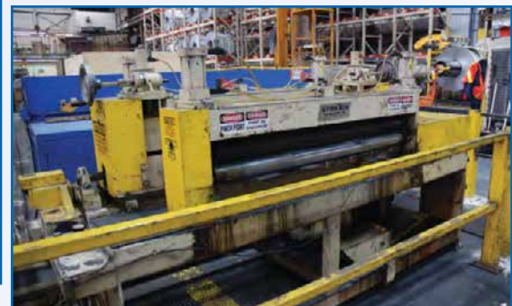
STRILICH 48"X .125" EDGE TRIMMER