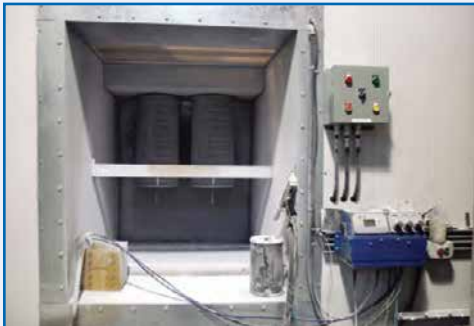
NORDSON SURE-COAT TOUCH UP BOOTH