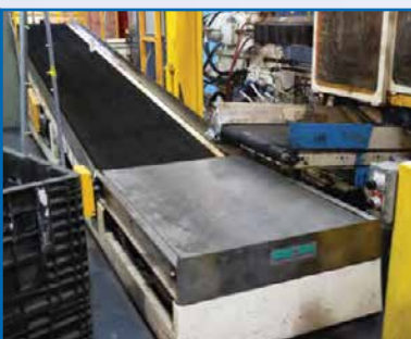
PARTIAL VIEW OF PLASTICS SUPPORT