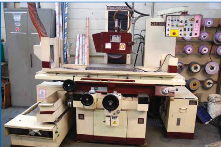
CHEVALIER 12"X24" HYD. SURFACE GRINDER