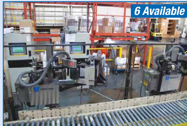
LABEL-AIR LABEL APPLICATORS