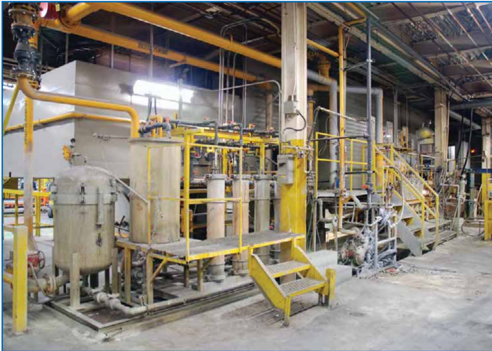
COMPLETE EISENMANN E COAT LINE