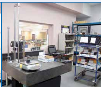
PARTIAL VIEW OF INSPECTION EQUIPMENT