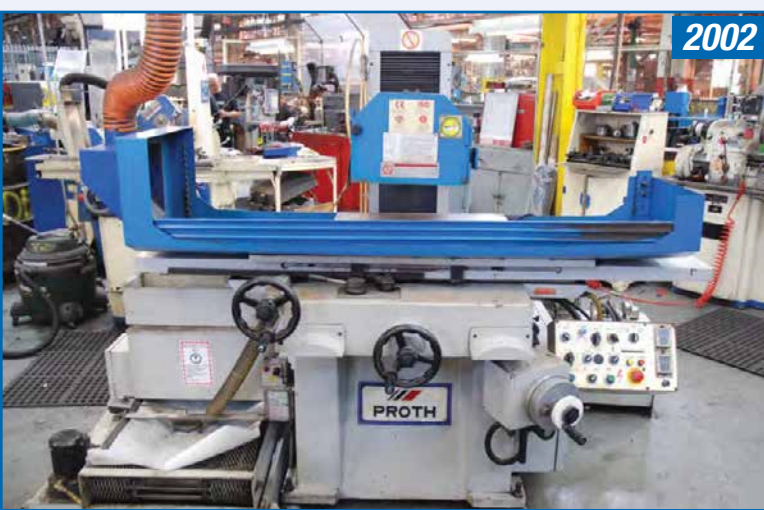
PROTH 12"X24" HYD. SURFACE GRINDER