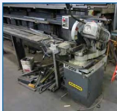
HYD-MECH P-350 COLD SAW