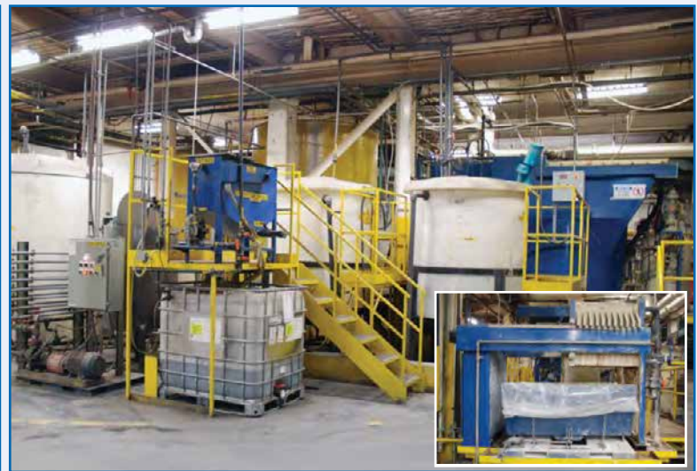
WASTE WATER TREATMENT SYSTEM