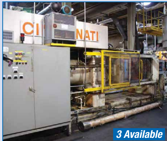
CINCINNATI 700 TON HYD INJ MOLDER

We will be happy to bid on your behalf if you are unable to attend our auction. Please call our office at 1-866-669-8893, or visit infinityassets.com to submit a proxy bid.