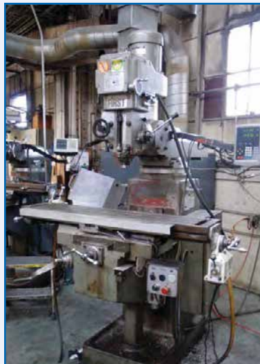
1 of 2 Mills