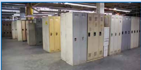
PARTIAL VIEW OF EMPLOYEE LOCKERS

ALSO: Huge Quantity of Shoe Dies, Molds, Raw Material, Tool Steel, Etc, Approx 500+ Tons