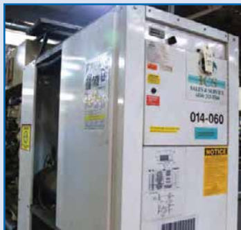
ICS CHILLER MODEL JSW.015 SCS