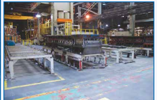
PARTIAL VIEW OF CLAMP SETS