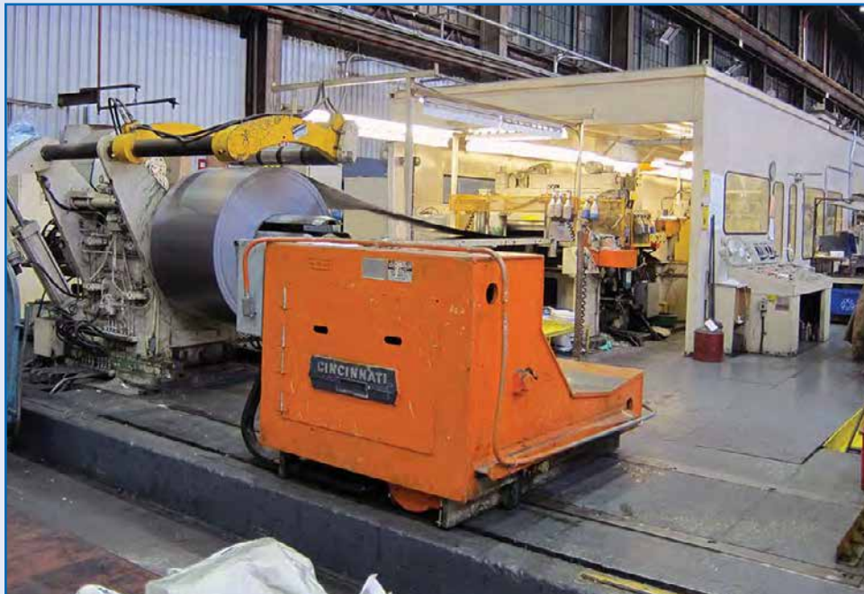
CININNATI .075"X 48"X 20,000 C-T-L LINE