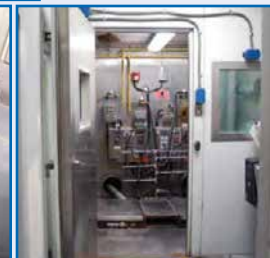
ENVIROTRONICS TEST CHAMBER