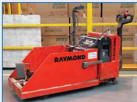
RAYMOND BATT-R-EASE II 3000 LB. ELECTRIC WALK TYPE BATTERY CHANGER