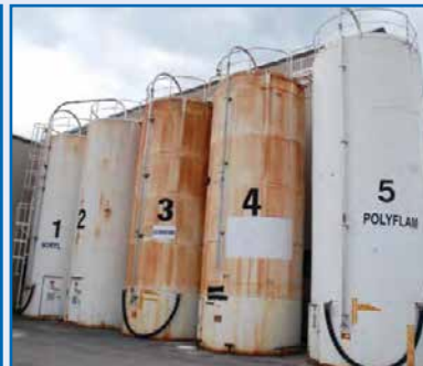
ANPLAST 30'X 12' SILOS