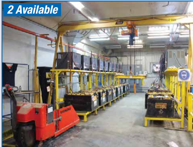
BATTERY HANDLING SYSTEMS HRS 120 BATTERY SERVICE STATION