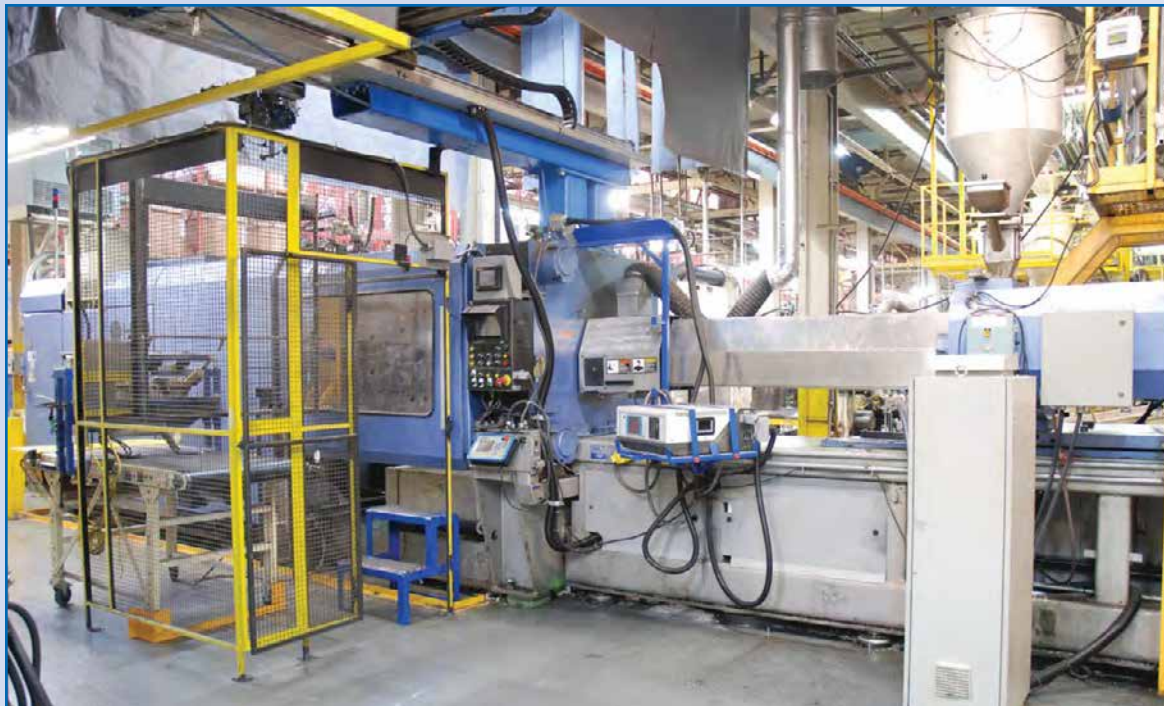
HPM 730 TON HYD INJ MOLDER, MODEL MLH 730-WP 120 20/1