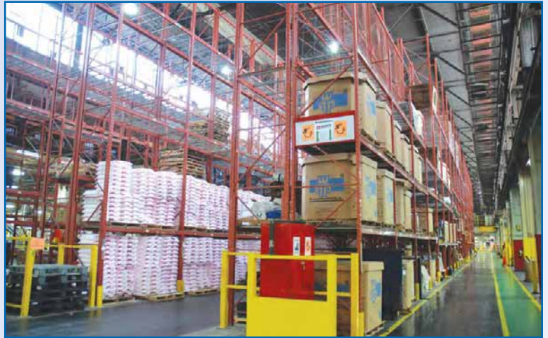
160 SECTIONS OF ADJUSTABLE PALLET RACKING: 35' X 4' X 9'