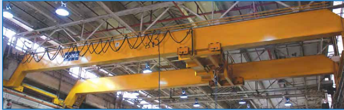
KONE 25 TON X 65' BRIDGE CRANE