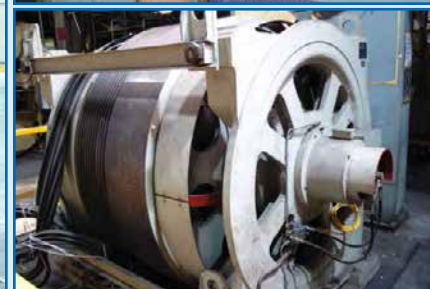
400 HP SPARE MOTOR FOR SCHULER PRESS

This brochure is meant merely as a guide. Infinity Asset Solutions & Perfection Industrial Sales make no guarantee, expressed or implied, as to the accuracy of the information in this brochure. Buyers should inspect the goods beforehand to satisfy themselves.