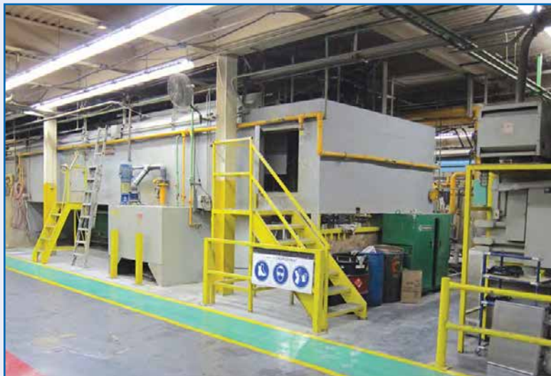
8 STAGE WASH SYSTEM