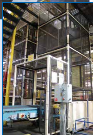
DS HANDLING ROLLING SLAT ELEVATORS

ALSO; Transfer Conveyor; Roller & Belt Conveyor; Gravity Conveyor; DS HANDLING Rolling Slat Elevators; Robotic Pick & Place Handling Machines; Overhead Assembly Feed Chain Conveyor; Bar Code Readers & Printers, etc.