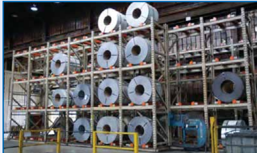
HEAVY DUTY COIL STORAGE RACKS