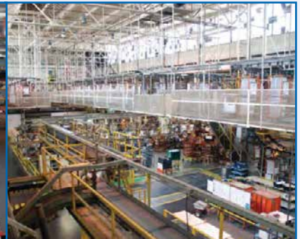
PARTIAL VIEW OF ASSEMBLY AREAS & CONVEYOR SYSTEM