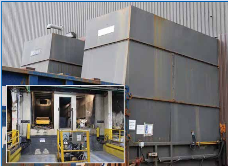
DURAPAC CPF 350 HD -0610-17/18, HYDRAULIC COMPACTORS