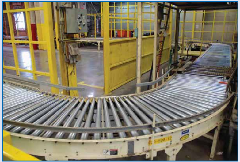
PARTIAL VIEW: 10,000' + HYTROL, MATHEWS, ROACH, MOODY POWER ROLLER AND BELT CONVEYOR