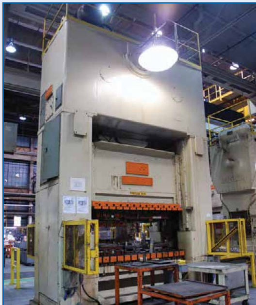
BLISS SE2-350-84-36 STRAIGHT SIDE DBL CRANK PRESS

ALSO Die Clamping Sets; Die Rigging Hardware