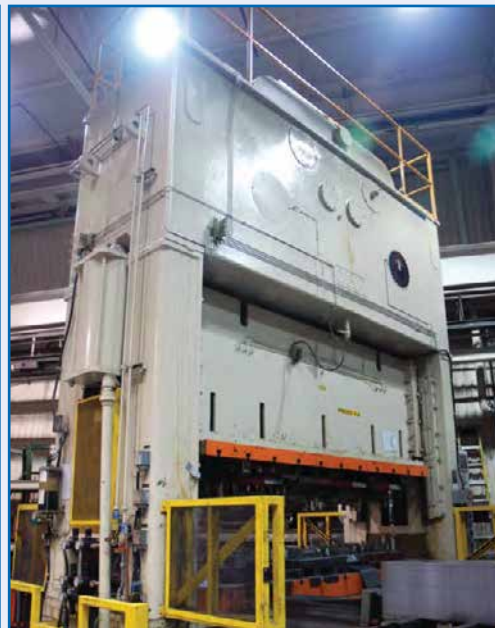
VERSION S2-300-144 STRAIGHT SIDE DBL CRANK PRESS