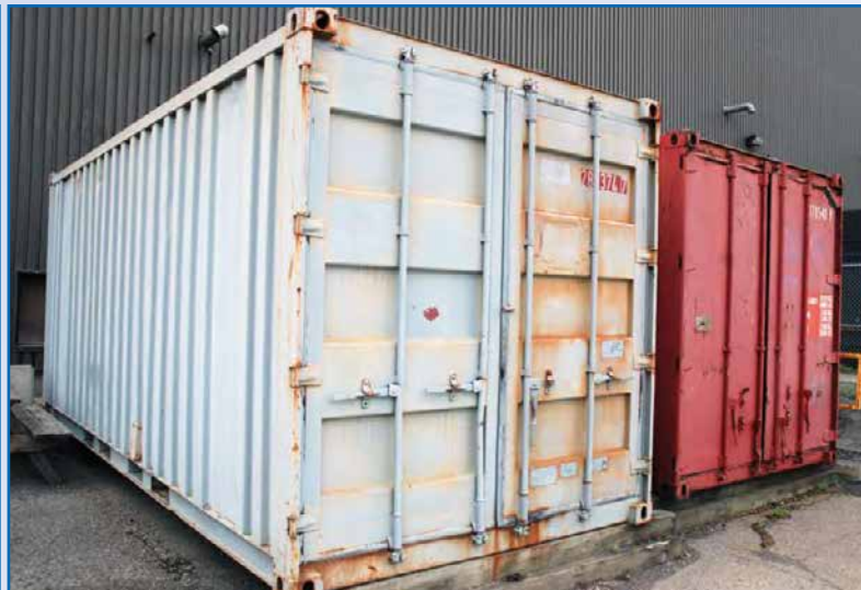
20' SEA CONTAINERS