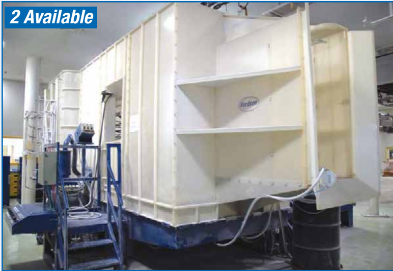
NORDSON EXCEL 2000 MODEL 2002S ELECTROSTATIC POWDER COAT PAINT BOOTH SYSTEMS