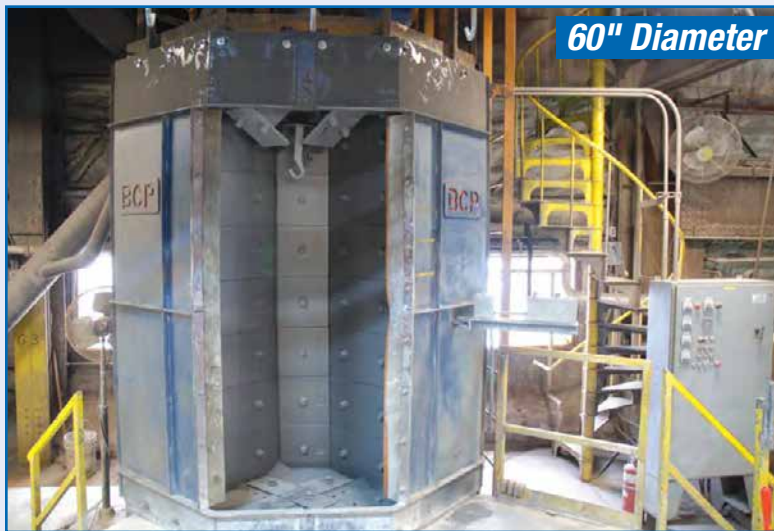
BCP ROTOBLAST SHOT BLAST