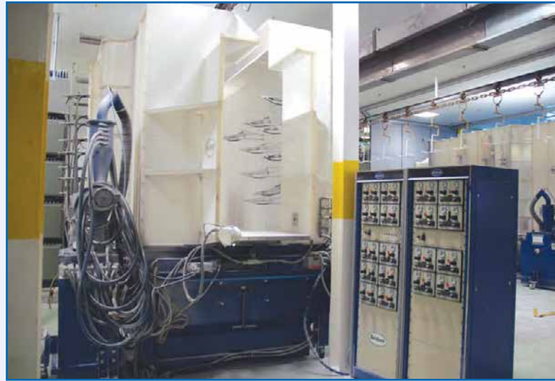
NORDSON HORIZON 4004 ELECTROSTATIC POWDER COAT PAINT BOOTH SYSTEM