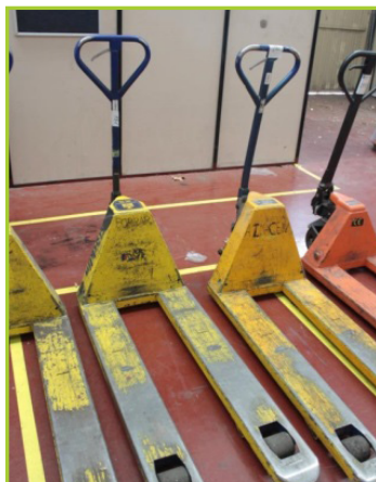
ASSORTED PALLETS JACKS