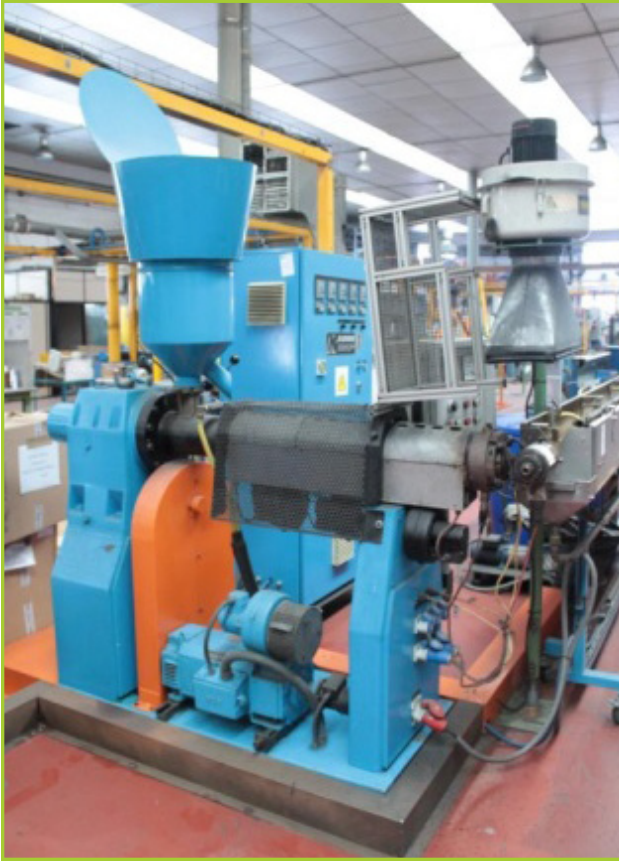
KUHNE K45-24D SCREW DIA: 48 MM. SCREW SPEED: 13-134 RPM. WITH FEED HOPPER, AND FEED AND CONTROL PANELS