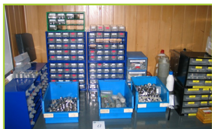
LARGE QUANTITY OF DRAWING DIES OF SEVERAL MAKES