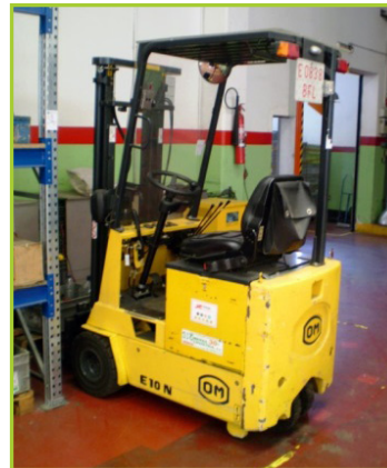
COMPAIR HYDROVANE 43 POWER: 7,5 KW. TOTAL HOURS: 41,680 HR. WITH MTA E800 DRYER AND AIR RECEIVER