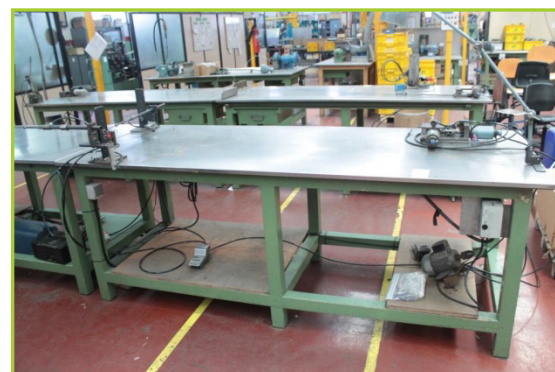
PNEUMATIC TREADLE OPERATED WIRE END FRAGMENTOR, WITH PNEUMATIC TUBE END OPENERS