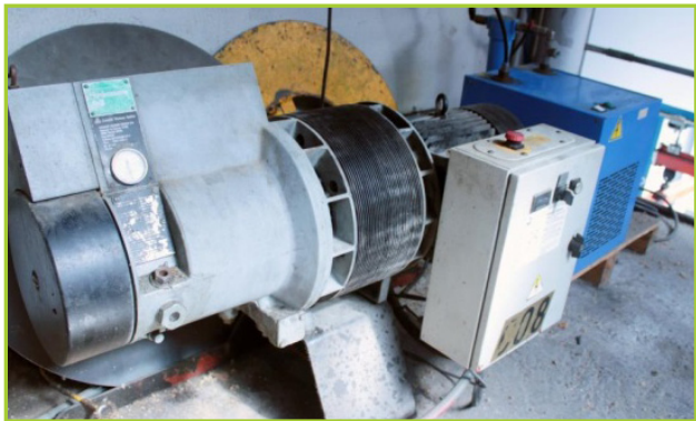
COMPAIR HYDROVANE 43 POWER: 7,5 KW. TOTAL HOURS: 41,680 HR. WITH MTA E800 DRYER AND AIR RECEIVER