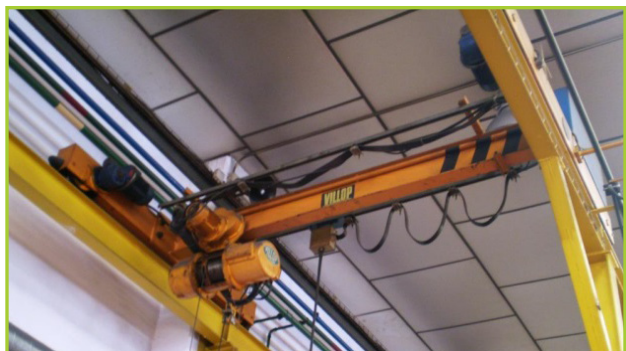
VILLOP 500KG SWL UNDERSLUNG OVER HEAD TRAVELLING CRANE