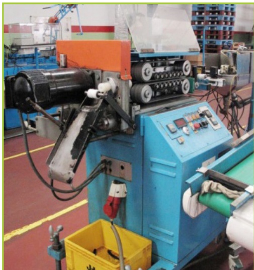
PICOMAT RAM 400 MOBILE BELT TYPE CABLE/TUBE TENSION CONVEYOR ROLLERS, WITH MOTORISED CUT MACHINE AND PHOTOELECTRIC DIAMETER MEASURING DEVICE