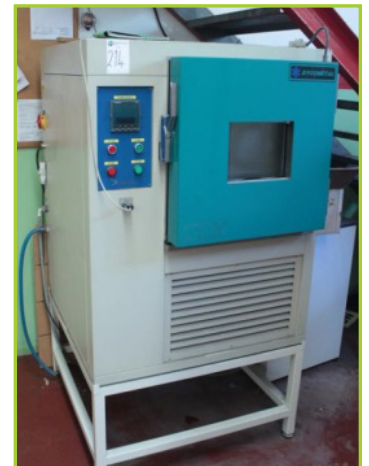
DYCOMETAL CCK SINGLE DOOR FAN ASSISTED CLIMATIC TEST CHAMBER, YEAR: 2009