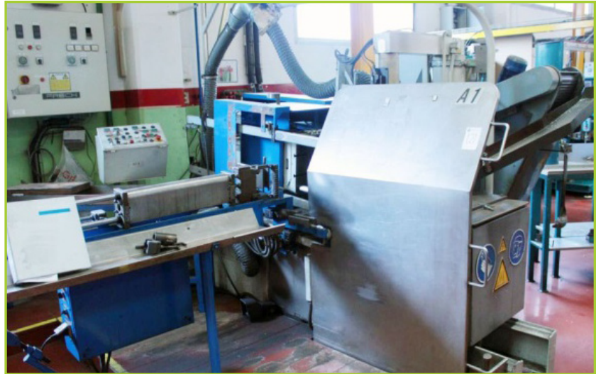
FRECH DAW 20 A SBC 20-TON HOT CHAMBER DIE CASTING MACHINE, WITH 240KN CLAMPING FORCE, 40KN INJECTION FORCE, 250MM X 250MM BETWEEN TIE BARS, 380MM X 380MM PLATEN, 180MM OPENING DISTANCE, SBC 3 CONTROLS, DISCHARGE CHUTE, RODANT MODEL OR-05 MOTORISED INCLINED STEEL BELT & SLAT FEEDER CONVEYOR 300MM WIDE ON BELT, FUME EXTRACTION FAN, FITTED WITH 12 SECTION CABLE DIE AND 12 SECTION SIDE CABLE INSERTING ATTACHMENT