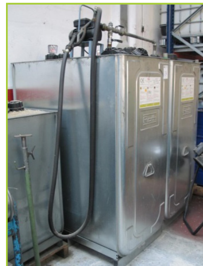
VILLOP 500KG SWL UNDERSLUNG OVER HEAD TRAVELLING CRANE, YEAR: 2007