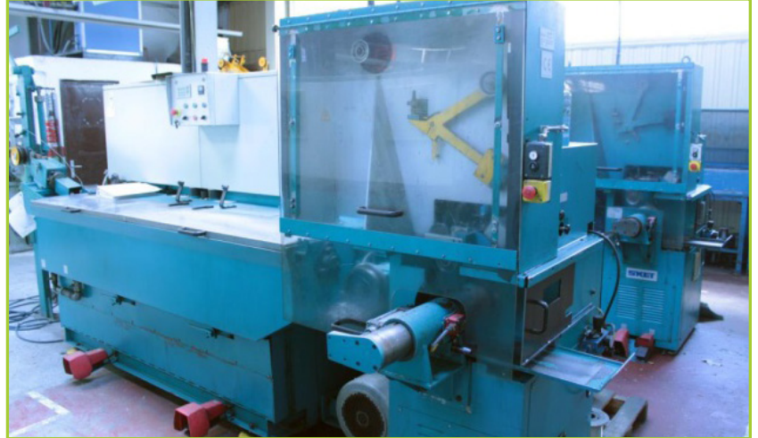
KIESELSTEIN WGTU100/25 & SM251 VARIABLE SPEED DRIVE (3-16 M/SEC). 25 DRAWING STEPS: 23 STEPS FOR 1,7 MM IN TO 0,3 MM OUT, 25 STEPS FOR 1,6 MM IN TO 0,26 MM OUT, 25 STEPS FOR 0,85 MM IN TO 0,14 MM OUT. MACHINE CURRENTLY SET FOR SS WIRE AT 1,2 MM IN TO 0,54 MM OUT. TOTAL RECORDED HOURS: 16,152 HR