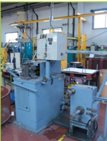
RIBBON FLATTENING MACHINE