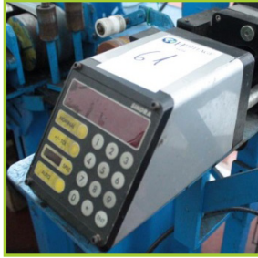
SIKORA PHOTOELECTRONIC DIGITAL DIAMETER MEASURING DEVICE