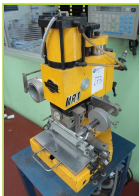
IMPAK 15 BENCH TYPE HOT STAMPING MACHINE