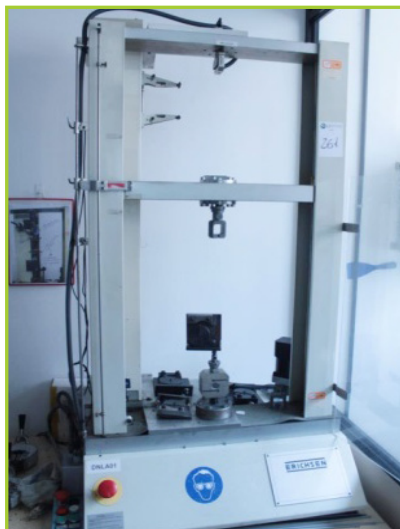
ERICHSEN 476 TENSILE TESTING MACHINE WIT TYPE DA- 630 ATTACHMENT