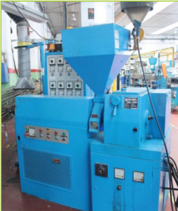
BANDERA PLASTIC TUBE EXTRUSION MACHINE. WITH HOPPER FEED, MATERIAL FEED REGULATOR AND CONTROL PANEL