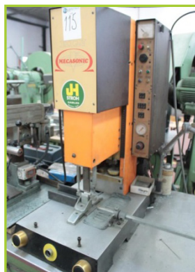
MECASONIC 2010 BENCH TYPE ULTRASONIC CABLE WELDER/MARKING MACHINE