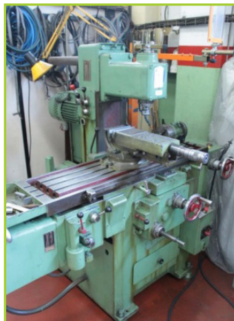
SOMUA Z1C VERTICAL MILLING MACHINE. TABLE: 1200X300 MM.