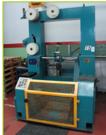
BMS BHSD 700 WIRE PULL: 20-50 KG. MAX WORKING SPEED: 3 M/S. WIRE RANGE: 1-4MM. WITH PNEUMATIC DISC BRAKE AND CONTROLS