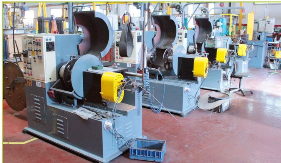
LUCKY WINSUN EAW-1 L ENDLESS AUTO WIRE WINDING MACHINE, WITH CONTROL PANEL, FEED REEL HOLDER, AND MOTORISED SWING ARM SPOOL CHANGE HOIST