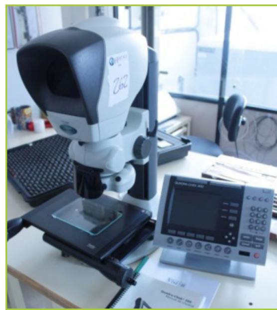
VISION KESTREL MONO DYNASCOPE 2-AXIS NON-CONTACT MEASURING SYSTEM WITH DYNASCOPE, STAGE GLASS. WITH METRONICS QUADRA-CHEK 200 CONTROL. REF NO. 262. YEAR: 2004