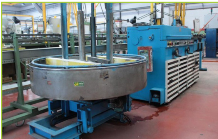
DELISI SIDER 4S CUTTING LENGTH: 1500 MM. WITH STRAIGHTENER AND UNCOILER.