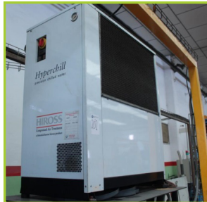
HIROSS HYPERCHILL ICE 010 400/3/50 DHH SINGLE-TOP FAN PACKAGED CHILLER UNIT