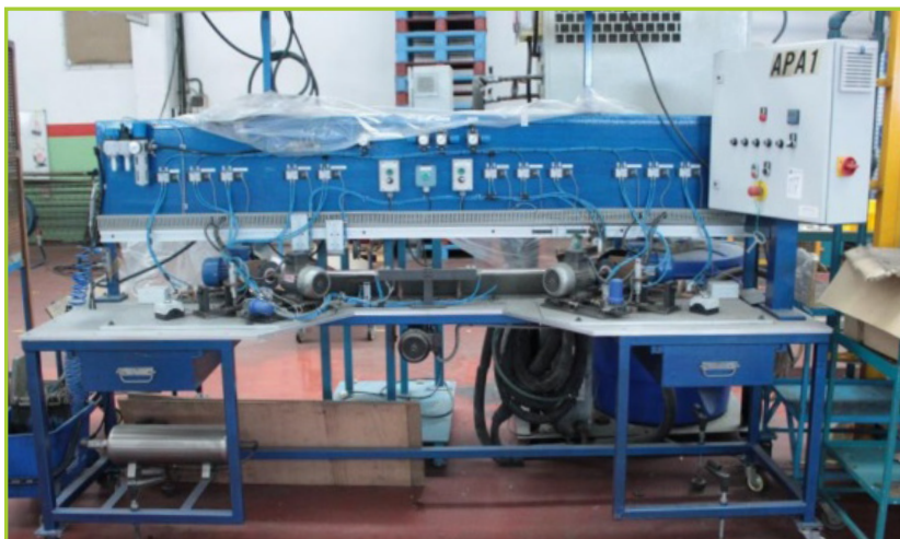
SPECIAL PURPOSE ELECTRO/PNEUMATIC 4-HEAD GRINDING AND DRILLING CABLE FINISHING RIG WITH PNEUMATIC CLAMPS, CONTROL PANEL AND ON ALLOY-TOP BENCH 2.8MTR X 0.65MTR.