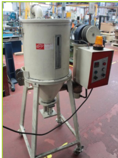
CAUFARTH D 500 MOBILE MATERIALS DRYING HOPPER