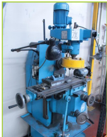
LAGUN F-900 VERTICAL MILLING/SURFACE GRINDING MACHINE. TABLE: 650X170 MM