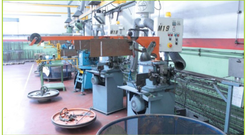
FLATTENING AND WINDING MACHINES, KUSTER CONTROLS UPDATED BETWEEN 2008-2009