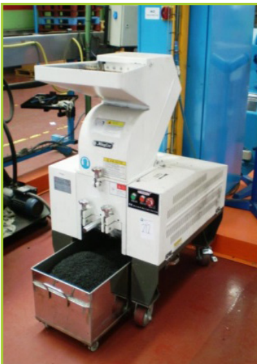
MING LEE ML SC5 111 MOBILE PLASTIC GRANULATING MACHINE 4KW/240X150MM FEED CHUTE & CONTROLS

THERE WILL BE A LIVE PUBLIC PREVIEW SEPT. 17TH, 10:00 AM TO 4:00 PM LOCATION: CARRERVALLÈS, 61, 08820 EL PRAT DELLOBREGAT