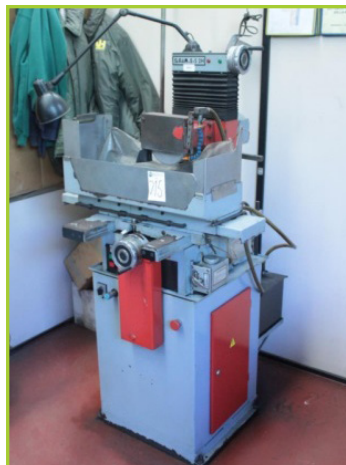
SAIM METAL 5100 2H MAGNETIC CHUCK: 300 X 150 MM. COOLANT PUMP, TANK AND CONTROLS