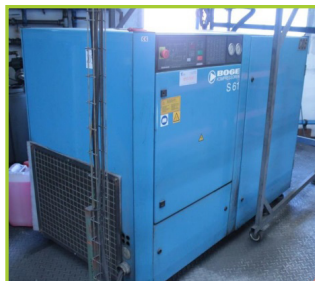
ECOAIR D40 PACKAGED ROTARY SCREW AIR COMPRESSOR, YEAR: 1997