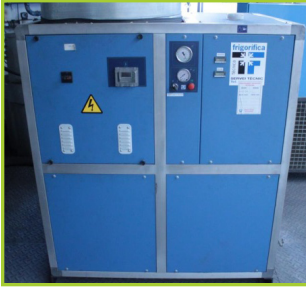
TECNICA FRIGORIFICA CPA 331