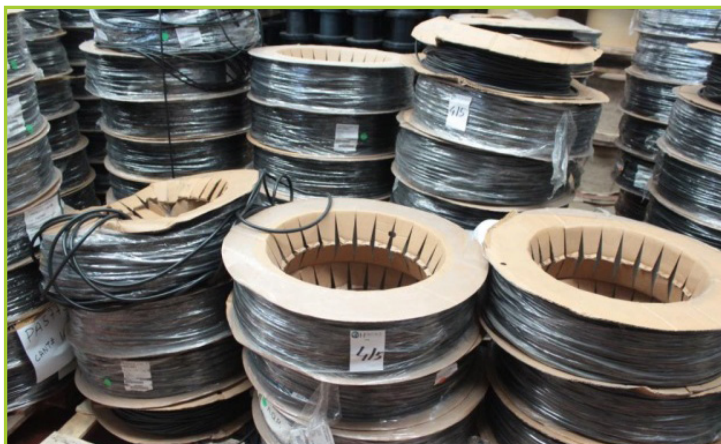
ASSORTED BLACK PLASTIC TUBE REELS