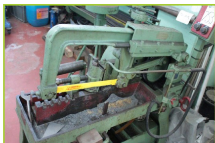
SABI 14 14IN ON BLADE POWER HACKSAWING MACHINE