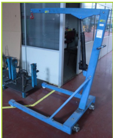
JHT MK500/PDW-S 500KG SWL HAND HYDRAULIC SWAN NECK FLOOR CRANE