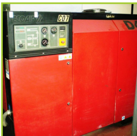
BOGE S61, POWER: 45 KW, YEAR: 1999