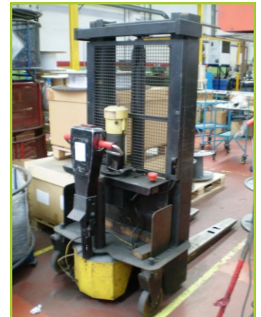
BATTERY ELECTRIC PEDESTRIAN FORK LIFT TRUCK WITH CHARGER