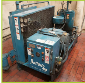
MTA EURO COOL ENERGY SINGLE-TOP FAN PACKAGED CHILLER UNIT