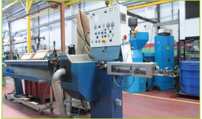
MARCCHI SAWING DISK. CUTTING LENGTH: 2500 MM. WITH ATTACHMENT THAT ENABLES THE MACHINE TO CUT LENGTHS OF LESS THAN 250 MM. ALSO WITH BLOCKED HOLLOW CABLE DETECTOR.