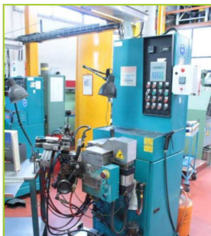
FISHERTECH AM46-K2CZ SEMI-AUTOMATIC HORIZONTAL CABLE INJECTED METAL ASSEMBLY DIE CASTING SYSTEM, MAX INJECTION CAPACITY WITH 3/4 INCH DIA INJECTION UNIT CAN INJECT 5CM 3 (0.3INCHES 3) OF ALLOY, WITH 1INCH DIA INJECTION UNIT CAN INJECT 8CM 3 (0.5INCHES 3) OF ALLOY, WITH ALLEN BRADLEY PANEL COMM CONTROLS AND FEED STAND