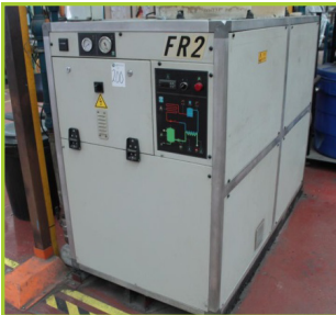
HIROSS HYPERCHILL ICE 010 400/3/50 DHH SINGLE-TOP FAN PACKAGED CHILLER UNIT, YEAR: 2003