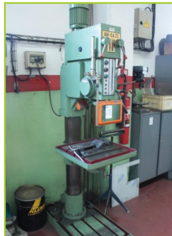
IBA EA 35 700 MM SWING VERTICAL DRILLING MACHINE WITH 9-SPINDLE SPEEDS