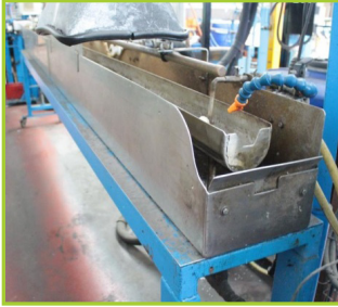
STAINLESS STEEL MOBILE COOLING BATH WITH MOTORISED PUMP