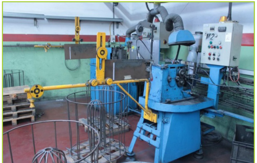
FLATTENING AND WINDING MACHINE, ROMERO CONTROLS UPDATED BETWEEN 2008-2009