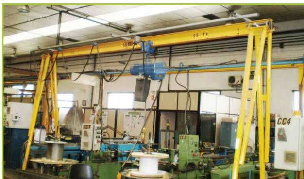
KOLI 500KG SWL A-FRAME LIFTING GANTRY 4MTR WIDE X 2.8MTR HIGH WITH KOLI 500KG SWL ELECTRIC CHAIN HOIST AND PENDANT CONTROL.