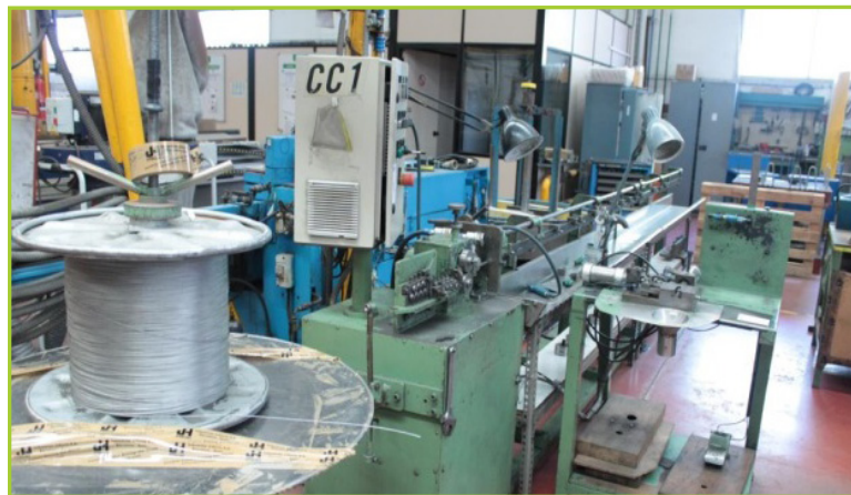
CUT TO LENGTH MACHINE CUTTING LENGTH: 4000 MM. WITH STRAIGHTENER