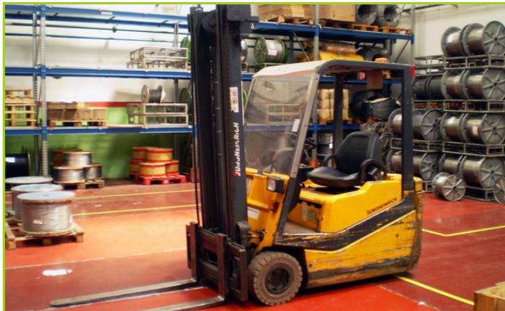
HYSTER E60XM FORKLIFT, 5,750 LB. CAP., ELECTRIC POWERED, 3-STAGE MAST, 193.7" MAX. HEIGHT LIFT CAP., HARD TIRES, OVERHEAD GUARD, W/ CASCADE ROTARY ROLL CLAMP ATTACHMENT, 2,359 HRS.