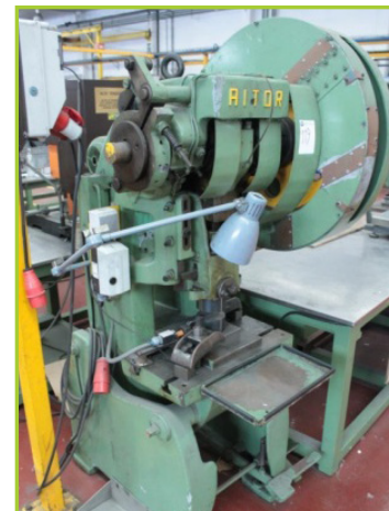
AITOR JMM 25 TON CAPACITY OPEN ENDED INCLINABLE POWER PRESS