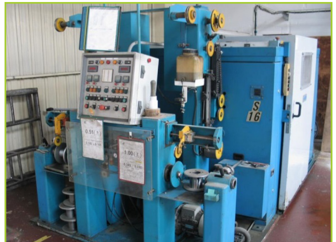
SKET MSDC 2/7X190 SECTION 1: 6+1 WIRES (CURRENTLY AT 1X0,18 + 6X0,165 FOR GALVANISED), 28,254 TOTAL RECORDED HOURS. SECTION 2: 6+1 WIRES (CURRENTLY AT 1X0,345 + 6X0,33 FOR SS), 27,573 TOTAL RECORDED HOURS. SPEED: 8000 RPM. WITH VARIABLE SPEED DRIVE. POWER: 65 KW. WEIGHT: 5785 KG. REF NO. 9. YEAR: 1998