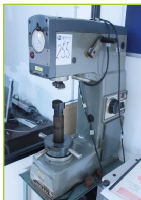
CENTAUR RB2 BENCH TYPE HARDNESS TESTER