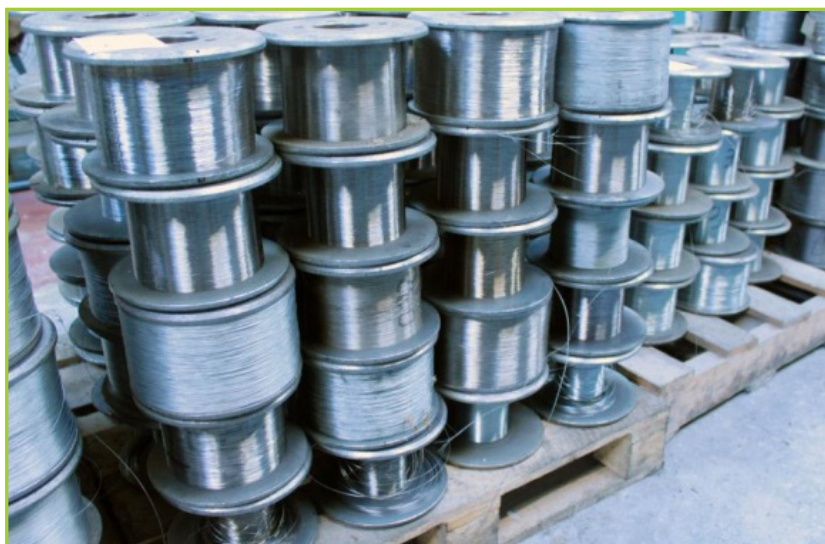
STAINLESS STEEL WIRE SPOOLS, APPROX 110 UNITS. DIFFERENT WIRE SIZES