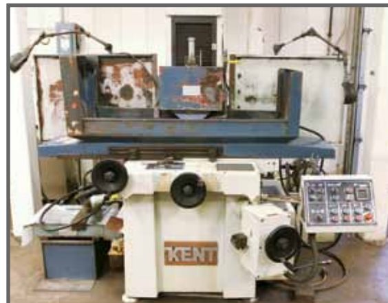
KENT 12" X 24" SURFACE GRINDER