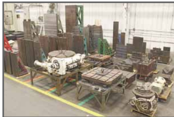
VIEW OF MACHINE ACCESSORIES

ALSO: (1,200) 50 & 40 Taper Tool Holders; 20" x 116" T-Scott Clamping Table; (28) Pair Vee Blocks – Various Sizes; Clamping Hardware; Magnetic Sine Plates; Sine Plates; Magnetic Chucks; Etc.