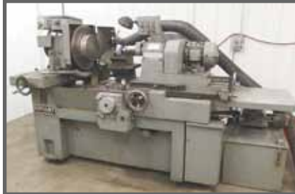
BRYANT UNIVERSAL ID GRINDER