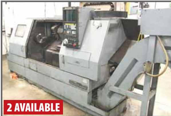
MAZAK QT-20 TURNING CENTER