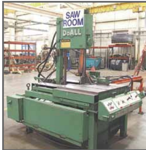
DOALL TF-1421H VERTICAL BANDSAW