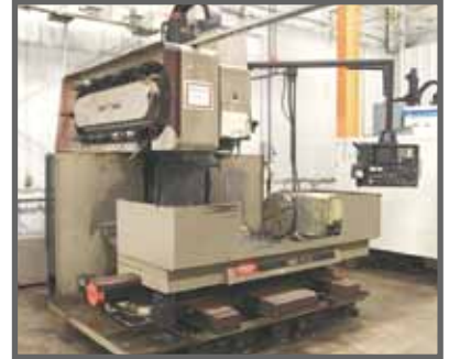
ENSHU VMC-530 VMC