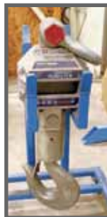
PROTA-WEIGH DIGITAL CRANE SCALE