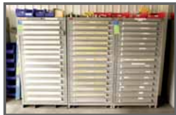
VIEW OF LISTA CABINETS