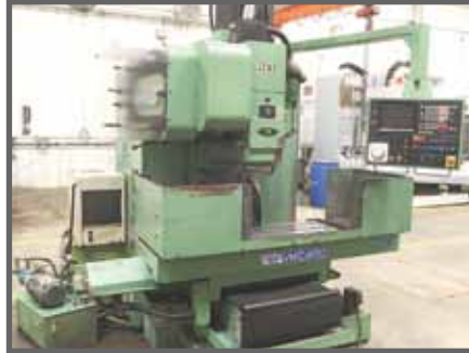
ENSHU 400 VMC