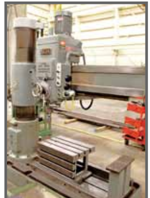
IKEDA RM1500 RADIAL ARM DRILL

View our current auction schedule at www.perfectionindustrial.com