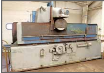
THOMPSON 14" X 78" SURFACE GRINDER