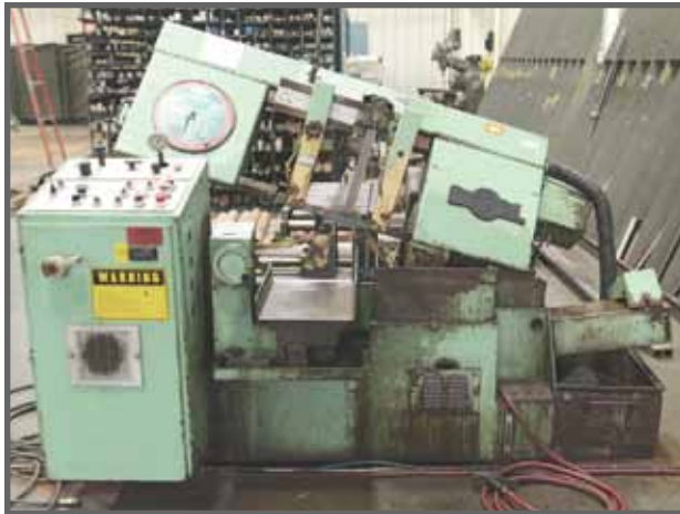
DOALL C-260A AUTO HORIZONTAL BANDSAW