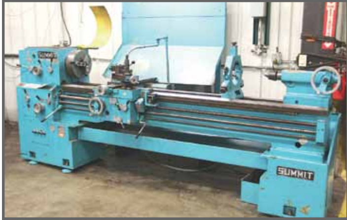
SUMMIT 20" X 80" ENGINE LATHE