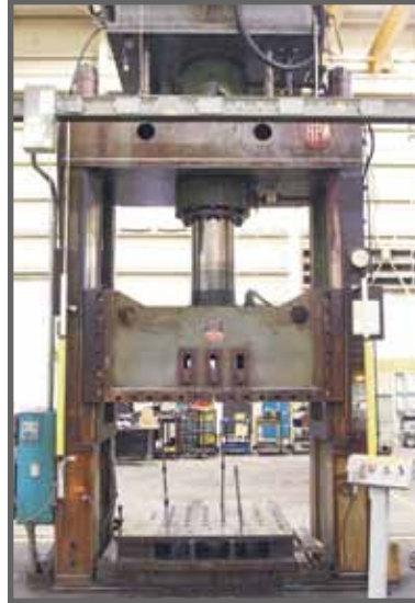
HPM 300 TON HYD. PRESS