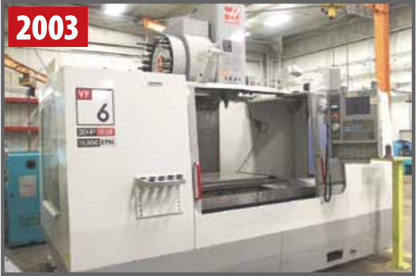
HAAS VF-6/40 VMC