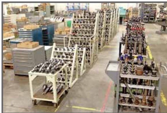
VIEW OF TOOL HOLDERS & CABINETS