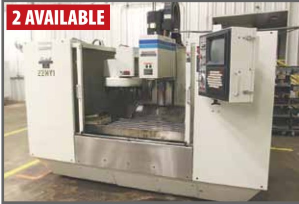
FADAL 4020 VMC