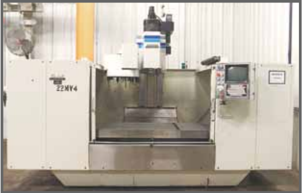
FADAL 6030 VMC