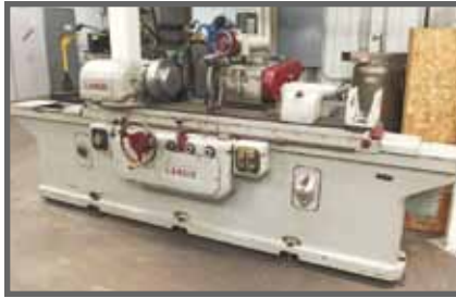
LANDIS 12" X 48" OD GRINDER

IKEDA RM1500 RADIAL ARM DRILL , S/N 77057