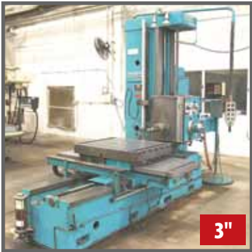
WOTAN B75T BORING MILL