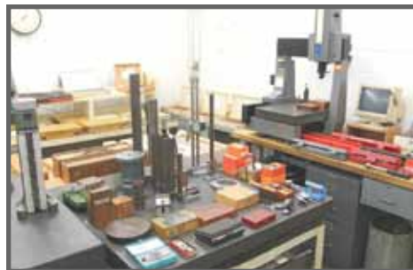
VIEW OF INSPECTION EQUIPMENT

ALSO: (8) Granite Surface Plates; Dial Bore Gauges; Micrometer Sets; Height Gauges; Hardness Testers; Pin Gage Sets; Thread Gauges; Verniers; Test Centers