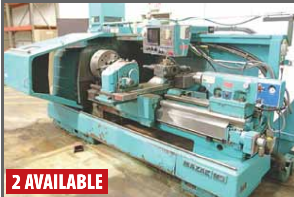
MAZAK M5-1500 CNC LATHE