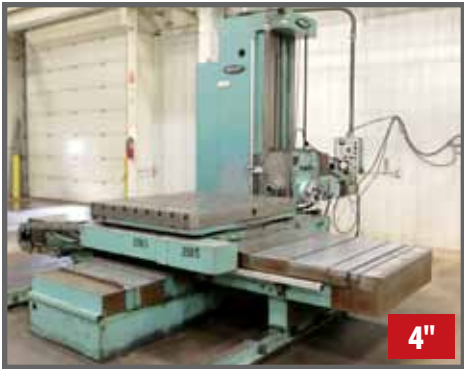
NOMURA B100 RW BORING MILL