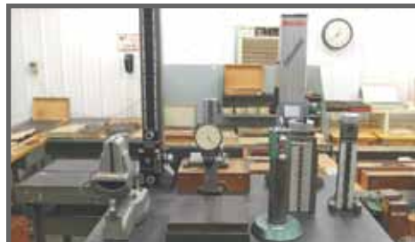
VIEW OF INSPECTION EQUIPMENT