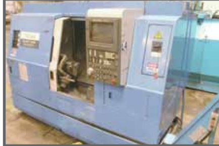
MAZAK SLANT TURN 20-ATC M/C TURNING CENTER