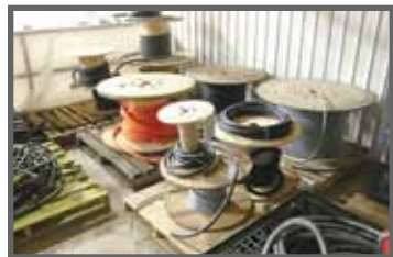
VIEW OF CABLE