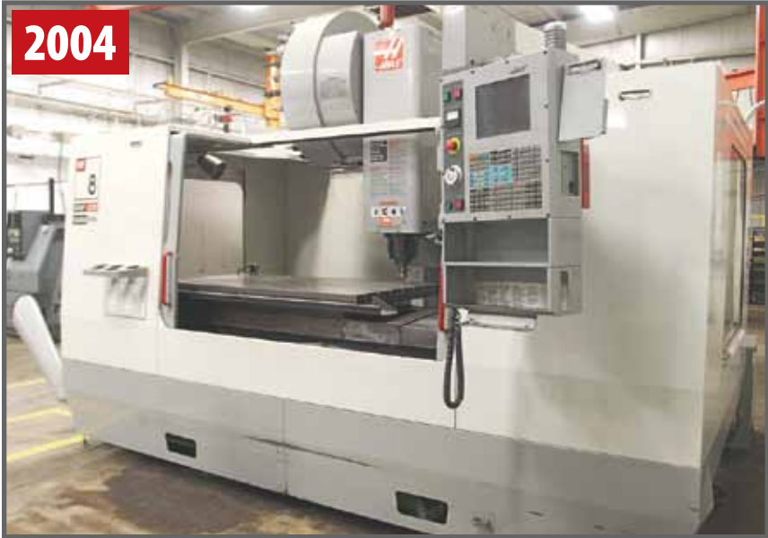
HAAS VF-8/50 VMC