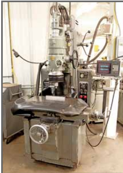
MOORE NO. 3 JIG GRINDER

CLAUSING NO. 2087 VARI-SPEED TABLE TYPE DRILL PRESS