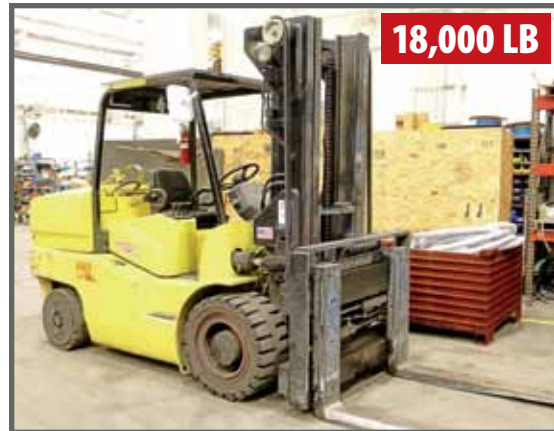
HOIST F180 LPG FORKLIFT

ALSO: 2, 3 & 4 Part Chain Slings, Wire Slings, Mesh Slings, Lifting Rigs, Machinery Skates, Rigging Hardware, Etc.