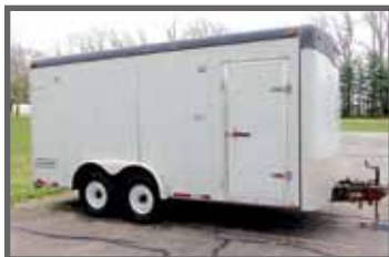
HAULMARK T/A UTILITY TRAILER