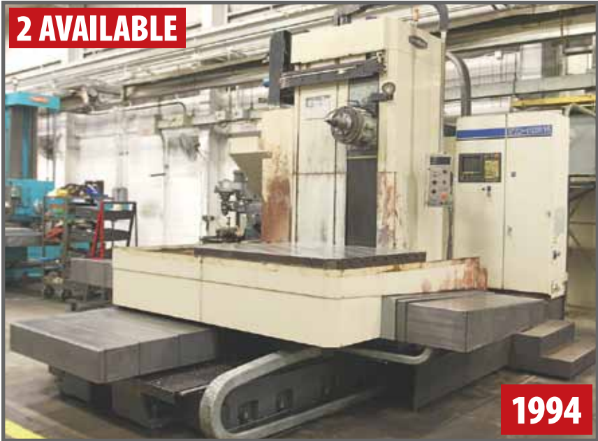
TOHSIBA LTD-11ER16 HORIZONTAL BORING MILL