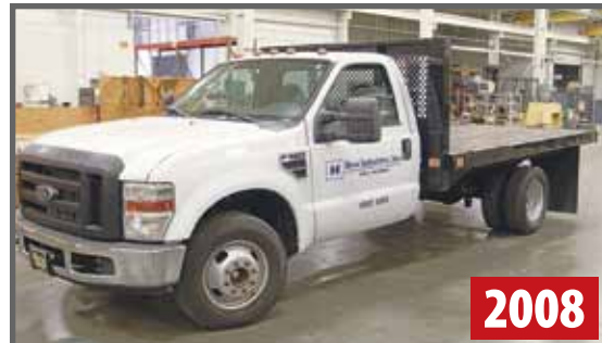
FORD F-350 SUPER DUTY STAKE TRUCK