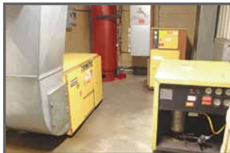
VIEW OF COMPRESSOR ROOM

Large Quantity of Tool & Scrap Steel, Transformers, Motors, Disconnects, Electrical Cable, Cable Track, Connectors, Fuses, Gear Reducers, Drives, Pneumatic Hardware, Hydraulic Fittings & Hose, Stainless Steel Hardware, Bearings, Drill Bits, Taps, End Mills, Ball Mills, Reamers, Carbide Inserts, Gloves, Aprons, Welding Supplies, Etc.