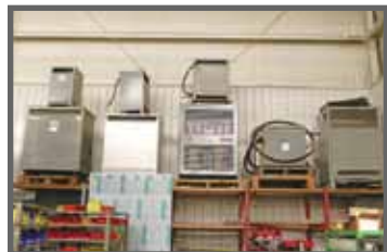
VIEW OF TRANSFORMERS

Excellent Selection of Computers, Printers, Plotters, Office Suites, File Cabinets, Etc.