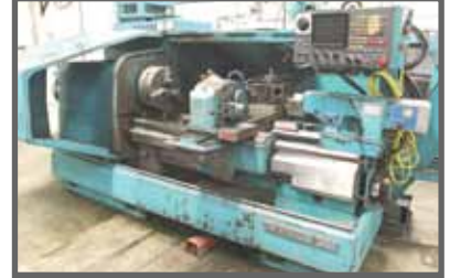
MAZAK M4 CNC LATHE