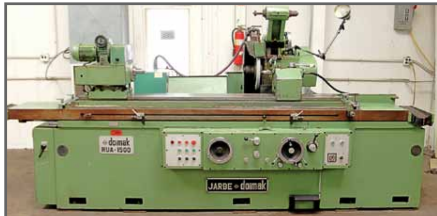
JARBE/DOIMAK RUA 1500 OD/ID GRINDER