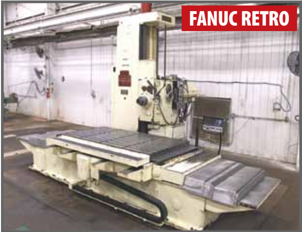
DEVLIEG 5K-96 CNC BORING MILL