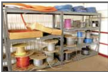
VIEW OF CABLE