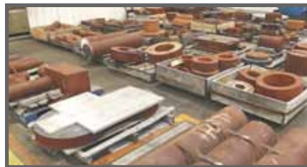
VIEW OF STEEL