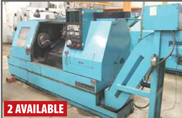
MAZAK QT-20 TURNING CENTER