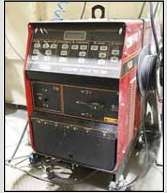
LINCOLN Tig Welder