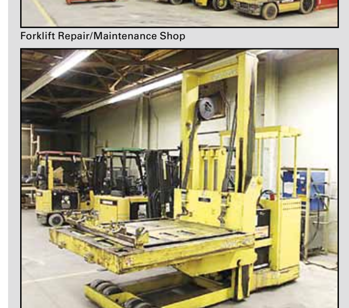
MOTO-TUC 20,000-Lb. Die Changer

EUBANKS No. 4000 Auto Wire Striper Line, w/HUESTIS Payoff & Accumulator