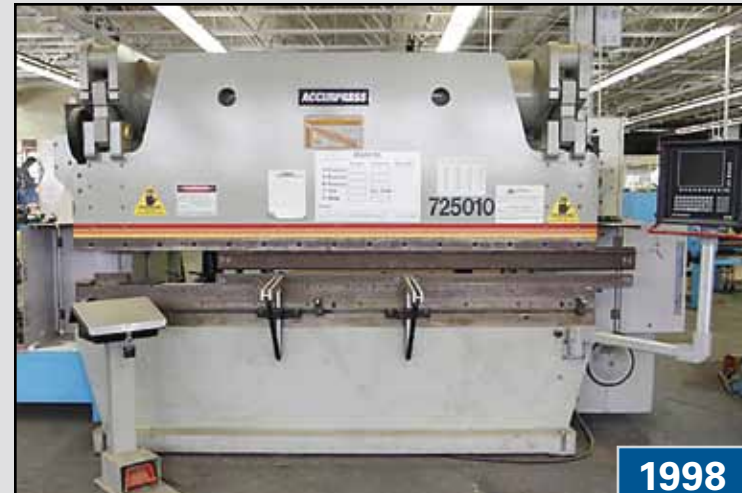
ACCURPRESS 725010 CNC Brake