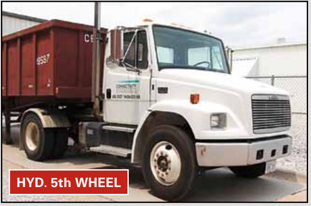
FREIGHTLINER Shunt Tractor