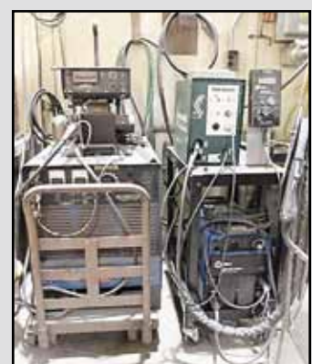
MILLER Mig Welders