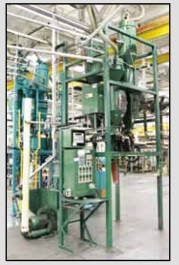
(2) PROCESS CONTROL Weigh Scale Blenders