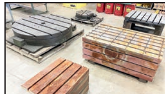
VIEW OF T-SLOTTED TABLES