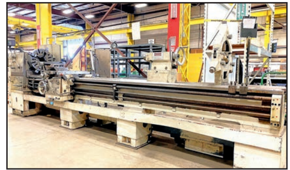
TOOLMEX TUR 710 ENGINE LATHE