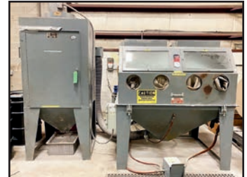
TRINCO 60X48SL/PC DRY BLAST CABINET