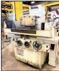
BROWN & SHARPE 1224 MICROMASTER SURFACE GRINDER