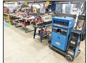
VIEW OF WELDER AND PIPE THREADER