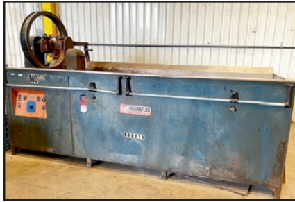
MAGNAFLUX H-720 MAGNETIC PARTICLE INSPECTION MACHINE