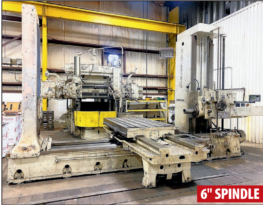
GIDDINGS & LEWIS 350-T HORIZONTAL BORING MILL

FEATURING: G&L Horizontal Boring Mill, Engine & Gap Lathes, 16,000 Lb Hoist Lift Truck, King Vertical Turret Lathe, Tooling, Factory Support