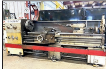
GMC GT-2080 GAP BED LATHE

View our current auction schedule at www.perfectionindustrial.com