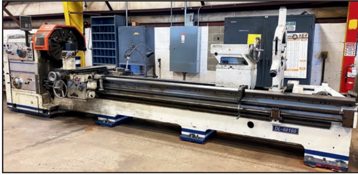
BIRMINGHAM DL40160 ENGINE LATHE