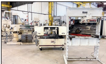
VIEW OF ASSORTED MACHINE TOOLS

View our current auction schedule at www.perfectionindustrial.com