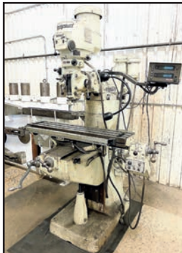
BRIDGEPORT SERIES I VERTICAL MILL

(2) POULAN P-200 HORIZONTAL PULLER PRESSES, s/n 2049 and 20105, 100,000 Lb. Capacity, 11-60" Vertical Adj., 1"-40" Horizontal Adj.