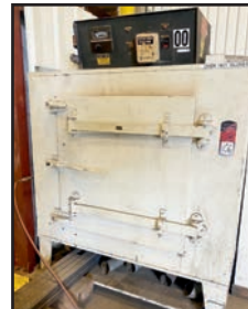
GRIEVE AB-1000 INDUSTRIAL OVEN

ALSO: 60" AND 25" ROTARY TABLES, AIR DRYER, SURFACE PLATE, T-SLOTTED BOX TABLES, IMPACT WRENCHES, POWER AND HAND TOOLS, JIB CRANE, HOISTS, PALLET JACKS, FLAMMABLE LIQUID STORAGE CABINETS, TOOLING, TOOL HOLDERS, ANGLE PLATES, RACKING, TOOL CABINETS, SHOP CABINETS, SHOP CARTS, TABLES, OFFICE EQUIPMENT AND MORE