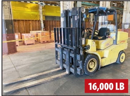
HOIST F160 LP FORKLIFT