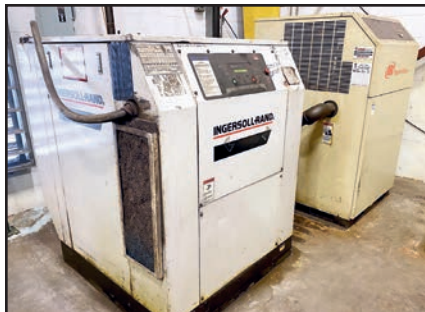
VIEW OF INGERSOLL RAND COMPRESSOR AND DRYER