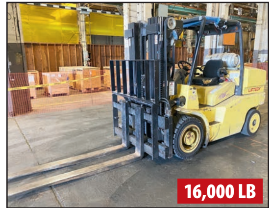
HOIST F160 LP FORKLIFT

FEATURING: G&L Horizontal Boring Mill, Engine & Gap Lathes, 16,000 Lb Hoist Lift Truck, King Vertical Turret Lathe, Tooling, Factory Support