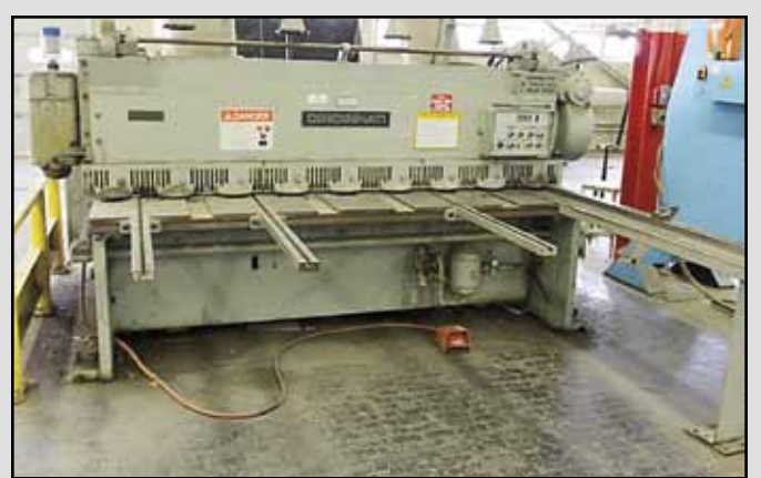
CINCINNATI 8' x .250" Squaring Shear