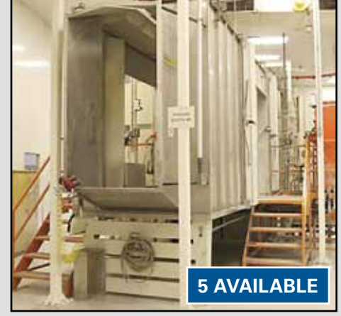
WAGNER (16) Gun S.S. Powder Coat Booth