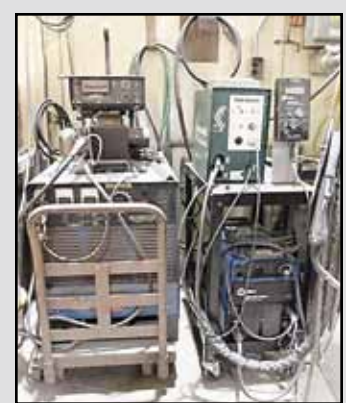
MILLER Mig Welders