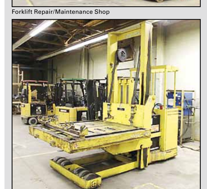
MOTO-TUC 20,000-Lb. Die Changer

EUBANKS No. 4000 Auto Wire Striper Line, w/HUESTIS Payoff & Accumulator