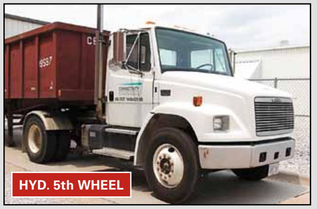
FREIGHTLINER Shunt Tractor