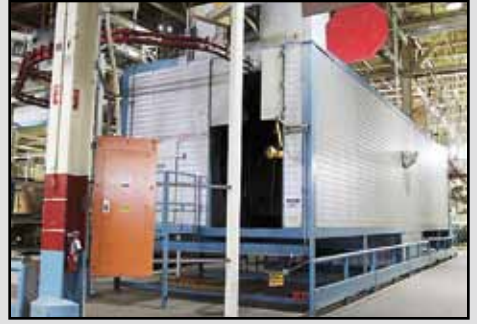
EISENMANN Dry-Off Oven