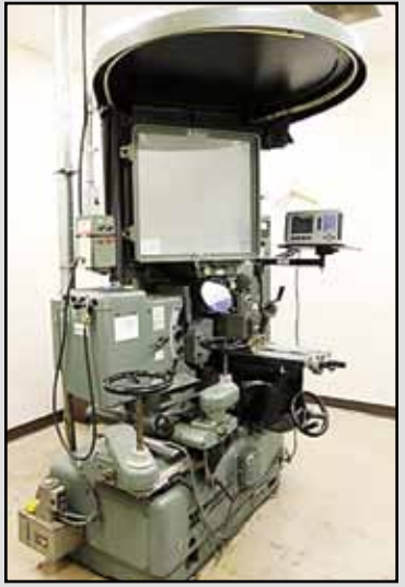
WASINO GLS-125A Optical Profile Grinder