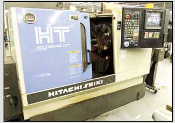
HITACHI SEIKI HT20SII Turning Center