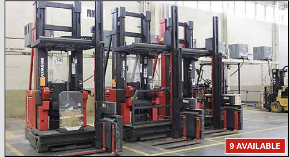
RAYMOND 3,000-Lb. Swing Reach Trucks

RAYMOND R40-040TT Reach-Type Forklift (3) RAYMOND 31R-40TT Reach-Type Forklifts CATERPILLAR GP40 8000-Lb, LPG Forklift CATERPILLAR GP35-LP 7000-Lb. LPG Forklift (2) CATERPILLAR GP30 6000-Lb. LPG Forklifts