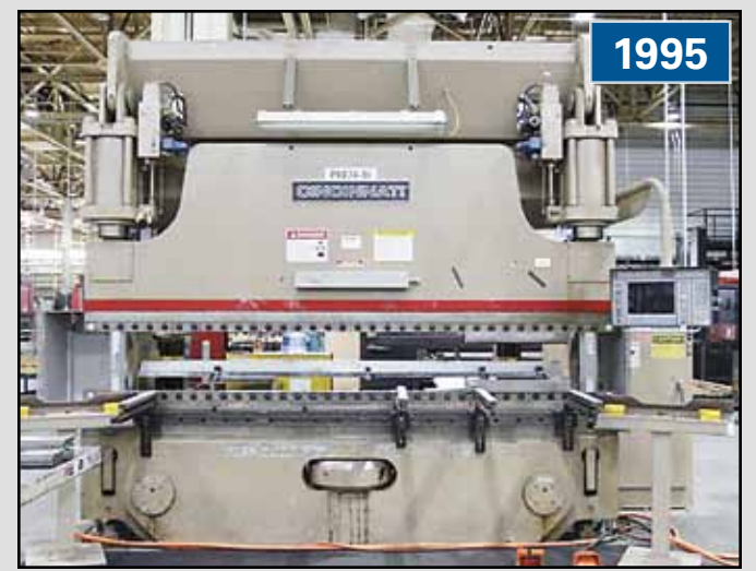
CINCINNATI 230AFX10 CNC Brake