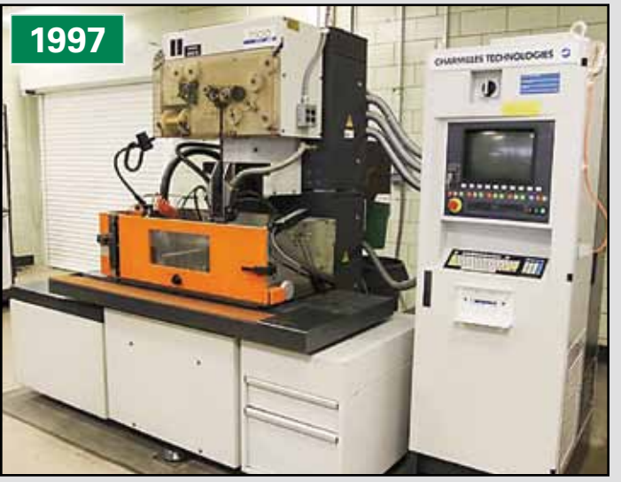
CHARMILLES ROBOFIL 2020.SI Wire EDM

(2) PROCESS CONTROL Weigh Scale Blenders, w/(4) Hoppers