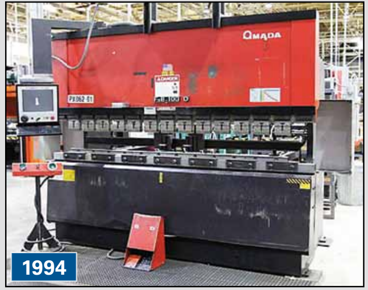
AMADA FBD1030F CNC Brake