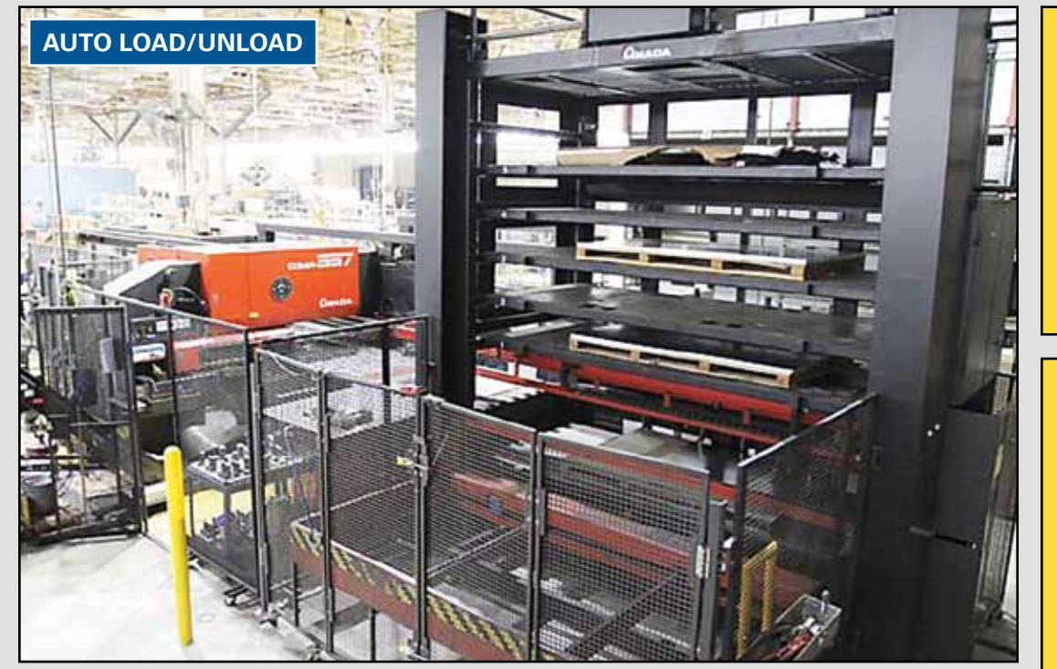
AMADA COMA 557 Turret Press

SALVAGNINI P4-2512 CNC Panel Bender/Folder