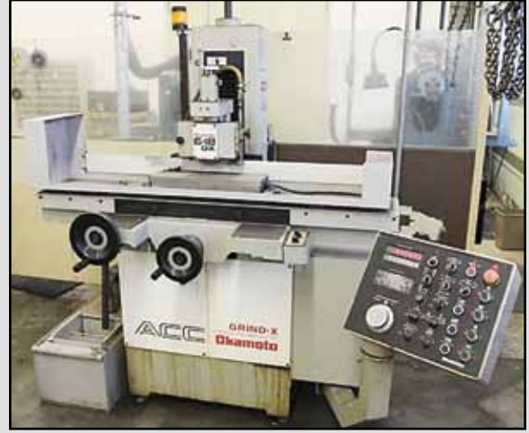
OKAMOTO ACC6.18DX3 Surface Grinder