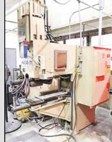
TAYLOR WINFIELD 250KVA Spot Welder