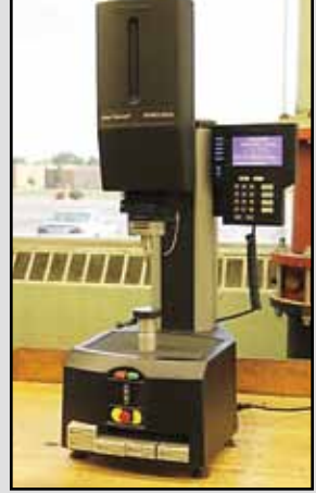
WILSON ROCKWELL Hardness Tester

ALSO: HARDINGE Lathes, PRATT & WHITNEY Engine Lathes, FOSDICK Radial Arm Drills, ARBOGA Geared Head Drills, Belt Grinders, Double End Grinders, Drill Point Grinders, Sandblast Cabinets, Dust Collectors, DiACRO Brakes, Shears & Notchers, Table Saws, Riveters, RIDGID & GREENLEE Tooling/Equipment, Chop Saws, Arbor Presses, Shop Presses, WHITNEY Punches, Hyd. Crimping Presses