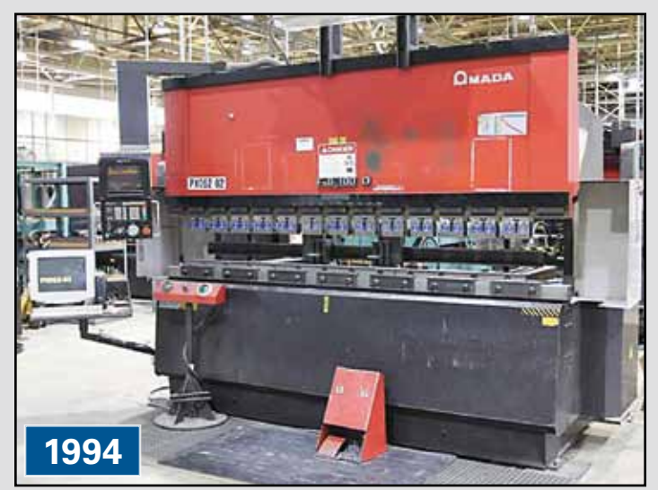
AMADA FBD1030F CNC Brake

(2) 1994 & 1993 AMADA FBD1025F 110T x 98" CNC Press Brakes, s/n 1020573, 1020493 w/NC9-F Control