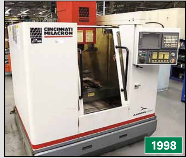
CINCINNATI MILACRON ARROW 500 VMC

1996 BRIDGEPORT No. 760 CNC Vertical Machining Center, s/n 760-22-266, w/22-Station ATC