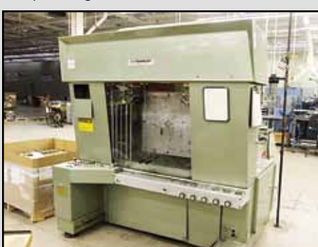
EPE TECH Auto Wire Wrap Machines