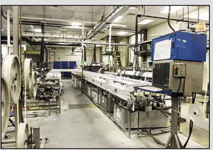
BALL & JEWEL, NELMOR CAROL/WCM Plating Line