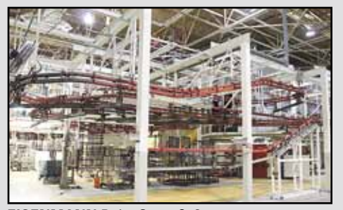
EISENMANN Bake Oven & Conveyor

For details on this auction, please visit our website: www.Go-Dove.com