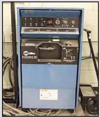
MILLER Tig Welder

ALSO Welding Wire & Rod, Rod Ovens, Protective Clothing, Oxy-Ace Torch Sets, Welding Positioners, Fume Filters/Extractors, Curtains, Etc.