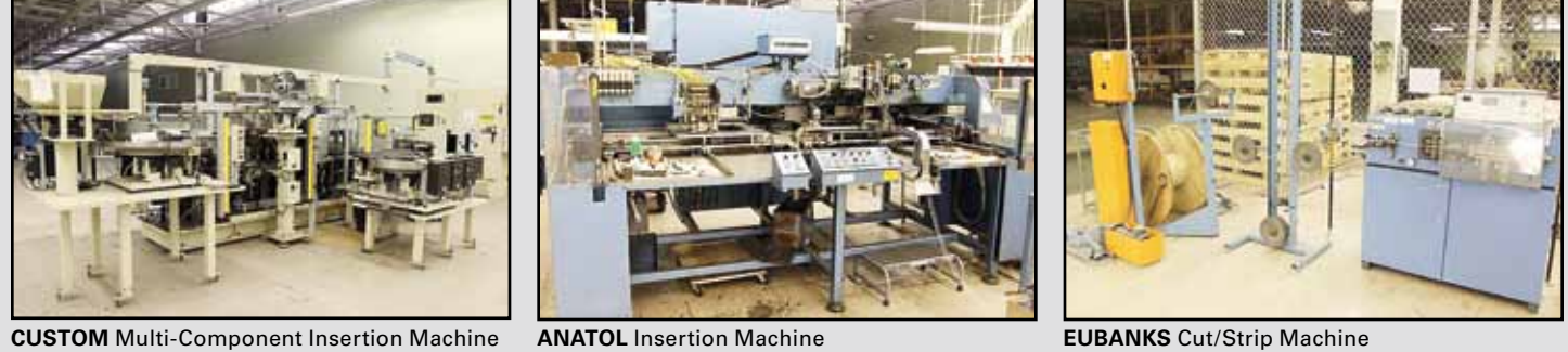
EUBANKS Cut/Strip Machine