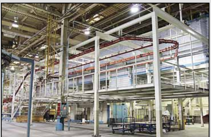
EISENMANN Bake Oven & Conveyor