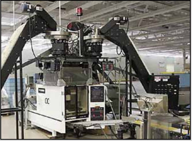
HAYSSEN Ultima CMB Batching/Packaging System

Stations/Benches, MOLEX, AMP, IDEAL, TYCO & PANDUIT Hand Tools, Power Tools, Balancers, Crimpers, Scales, Oscilloscopes, Amp Testers, Volt Testers, Sick Screen Machine, Job Trucks, Robotic Cell Testers, Breakdown Simulators, Etc.