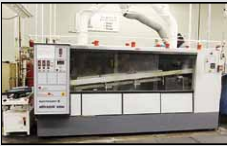
ELECTROVERT Wave Solder Oven