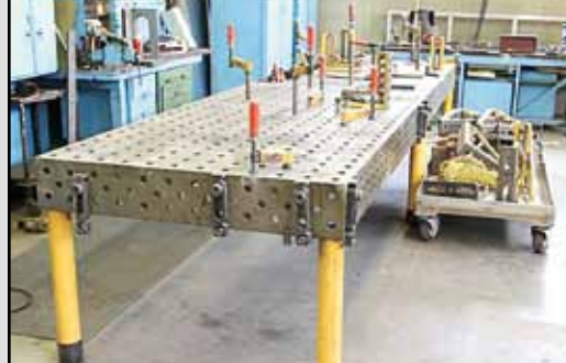
(2) DEMMELER Modular Tables