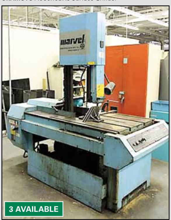
MARVEL MARK II Vertical Bandsaw