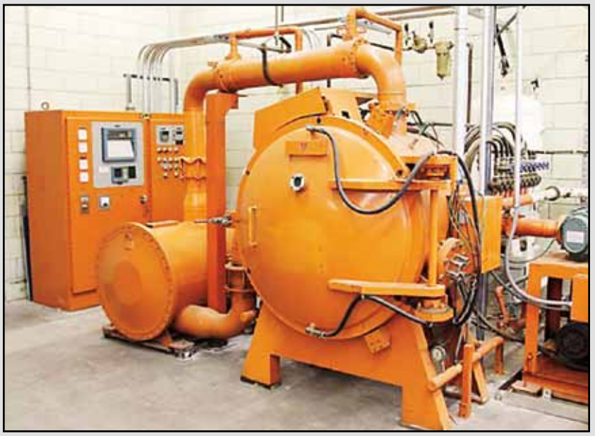
VFS HL26 Vacuum Furnace