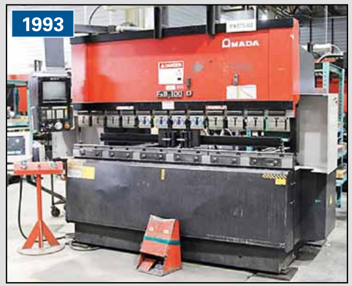
AMADA FBD1025F CNC Brake