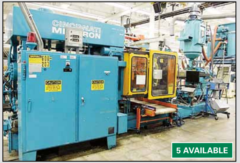
CINCINNATI 375-Ton Inj. Molder