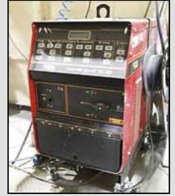
LINCOLN Tig Welder