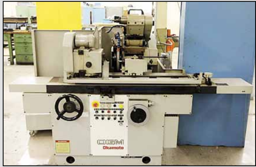
OKAMOTO OGM-8.20UST Cyl. Grinder

(4) BRIDGEPORT EZ TRAK II 2 Hp CNC Mills, s/n EZ2-BMI-957, N.A. HITACHI SEIKI HT2OSII Turning Center, s/n HTS2314HL 2003 FANUC M-410i B160 6-Axis CNC Robot, s/n N.A., w/R-J3iB Control BRIDGEPORT Series II 4 Hp Mill, s/n 4501 OKAMOTO OGM-8.20UST Cylindrical Grinder, s/n 13024 OKAMOTO ACC - 6.18DX3 Surface Grinder, s/n 45390 BROWN & SHARPE 618 MICROMASTER Surface Grinder, s/n N.A., w/2-Axis DRO (6) TAFT-PEIRCE 6x12 Hand Feed Surface Grinders WASINO GLS-125A Optical Profile Grinder, s/n 1638, w/2-Axis DRO VFS HL26 2650°F Vacuum Furnace, s/n VF51, w/18" x 14" x 17" Chamber (3) MARVEL SERIES 8 MARK II Vertical Bandsaws, s/n 825155-W, 852535-W, N.A. DOALL 3612-3 Vertical Bandsaw, s/n 53-701087 DOALL 26-2 Vertical Bandsaw, s/n 54-58381 MOORE No. 2 Jig Borer, s/n 5395