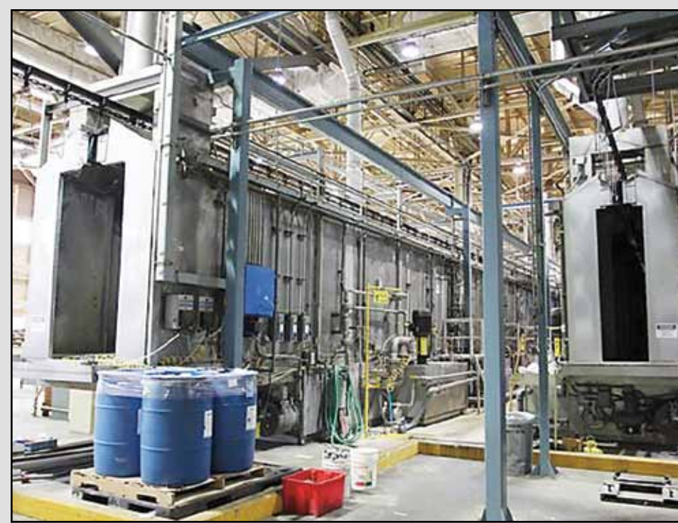
SBS S.S. Wash & Chromate Systems