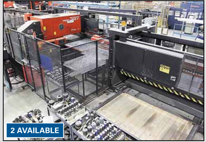
AMADA PEGA 357 Turret Press