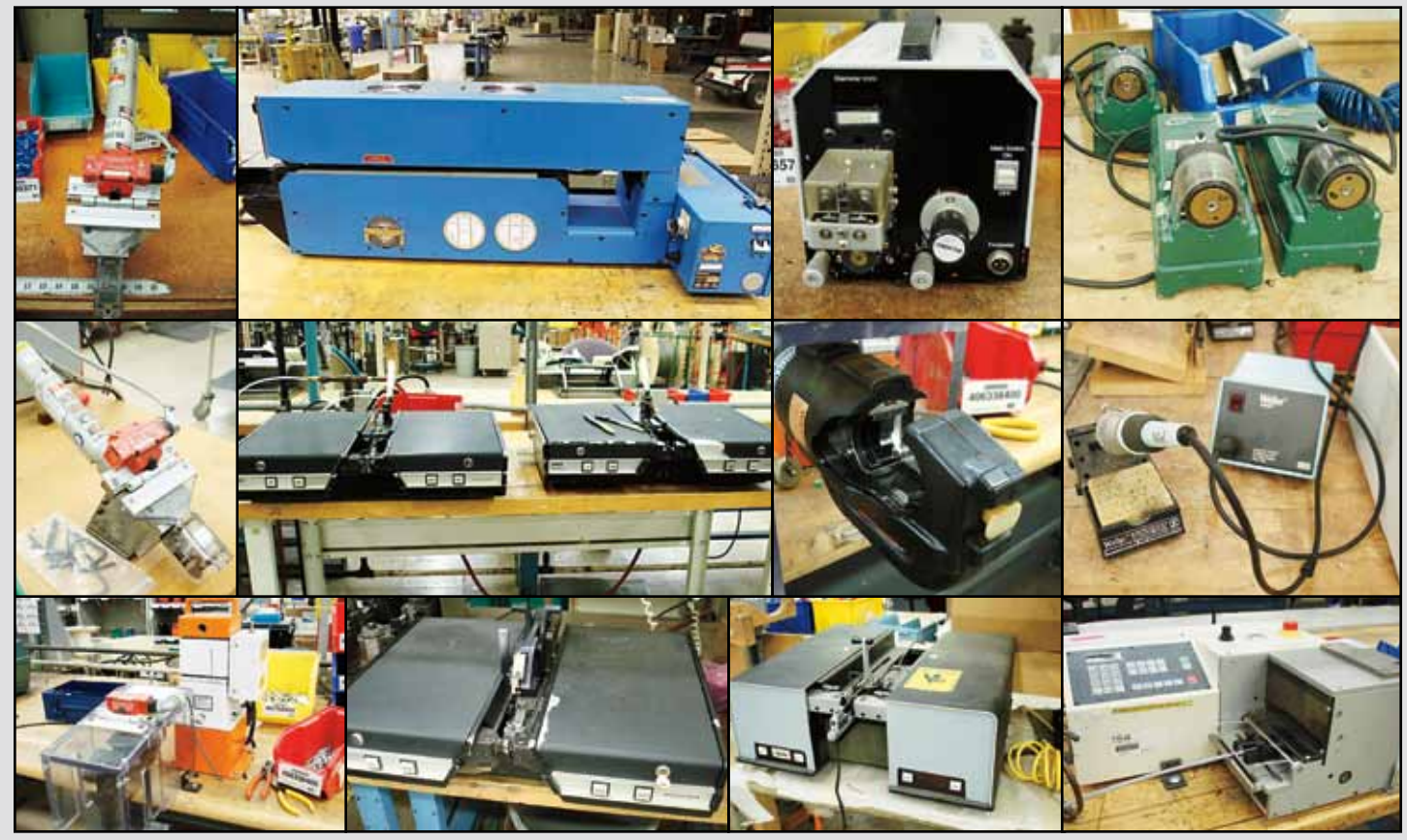
View of Electronic Test/Assembly Equipment

For details on this auction, please visit our website: www.Go-Dove.com