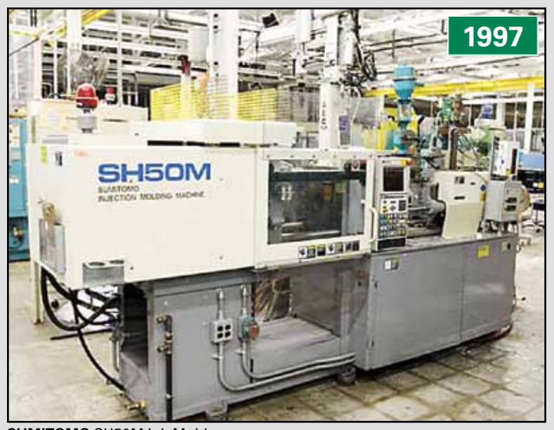
SUMITOMO SH50M Inj. Molder

For details on this auction, please visit our website: www.Go-Dove.com