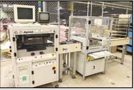
ASYMTEK CNC 2-Axis Solder Dispenser