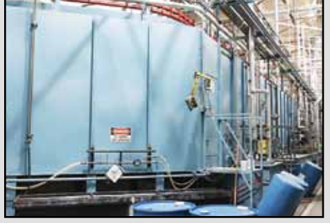
EISENMANN S.S. (7) Stage Wash & S.B.S.