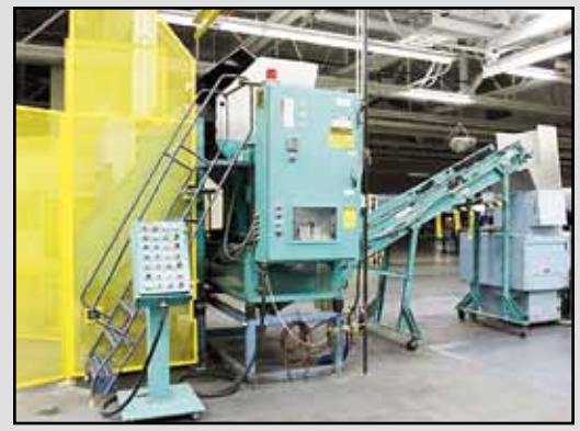
BALL & JEWEL & NELMOR Grinders