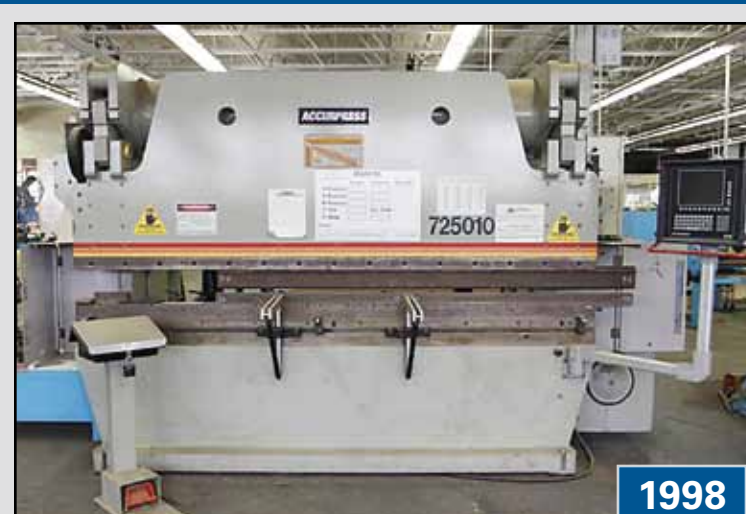
ACCURPRESS 725010 CNC Brake