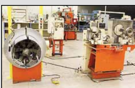
Scrap Coiling Line