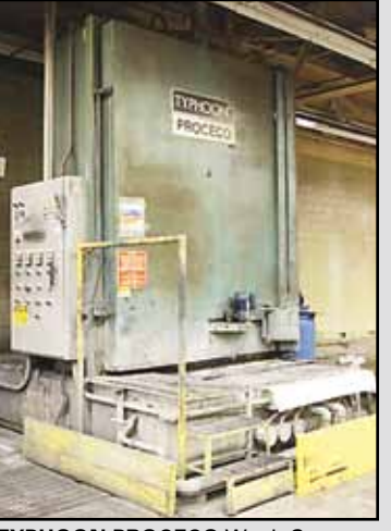
TYPHOON PROCECO Wash System