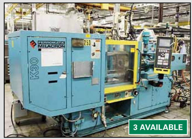
FERROMATIK MILACRON K30 Inj. Molder