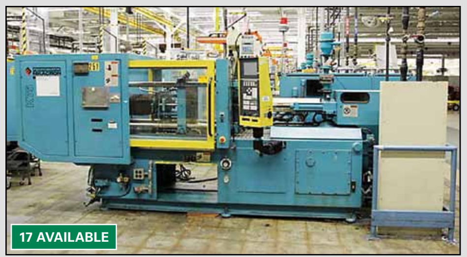
FERROMATIK MILACRON K75 Inj. Molder