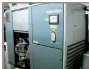
ATLAS COPCO GA90SD FF AIR COMPRESSOR

5,000 LB DATSUN CPF02A25V LP LIFT TRUCK, 130" 2-Stage Mast, 90" Forks