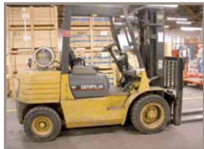
CAT 60 GP30 LIFT TRUCK