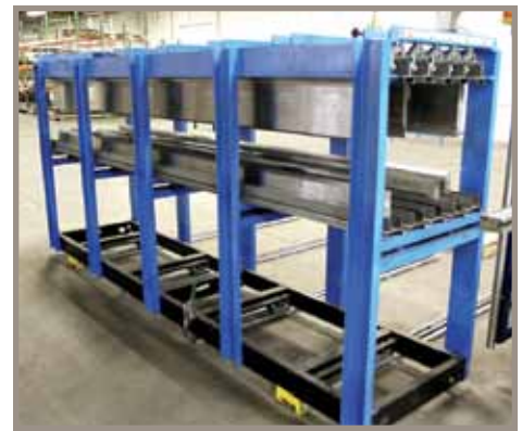
EHT TOOLING CHANGER/STORAGE SYSTEM