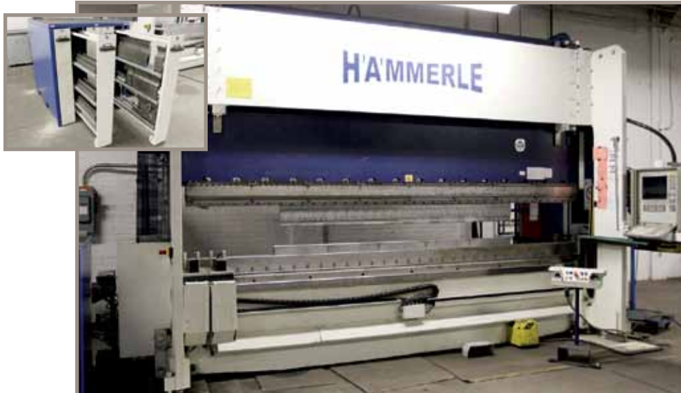
HAMMERLE BM200-4100 CNC PRESS BRAKE – APFEL TOOLING CABINET FOR HAMMERLE (INSET)