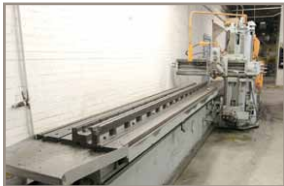
HY-DRAULIC OPEN-SIDED MILL