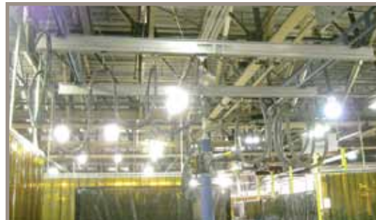
GORBEL 250-LB. CRANE SYSTEM