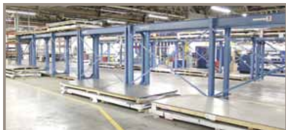
HEAVY DUTY MATERIAL RACKS