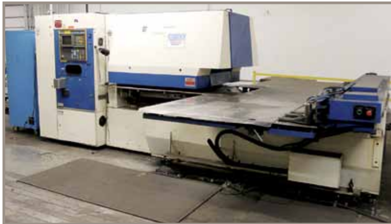
WEIDEMANN CENTRUM 3000/Q TURRET PUNCH