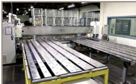
SCHRODER "U" STYLE REAR GAUGING