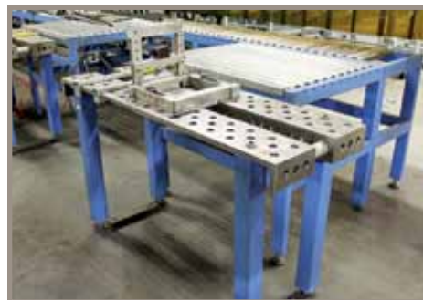
VARIOUS WELDING TABLES