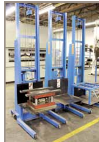
REGAL DIE TRUCKS