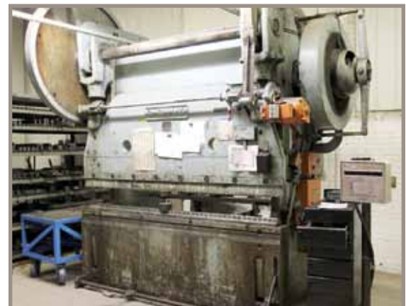
CINCINNATI 90-6 PRESS BRAKE

(2) MILLER MILLERMATIC 251 AND 252 WELDERS