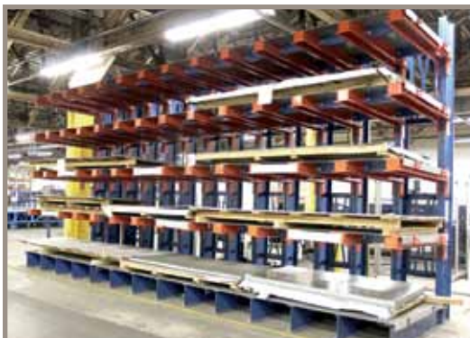
FRAZIER HEAVY DUTY MATERIAL RACKS