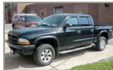
DODGE RAM 4X4 TRUCK

View our current auction schedule at www.perfectionindustrial.com