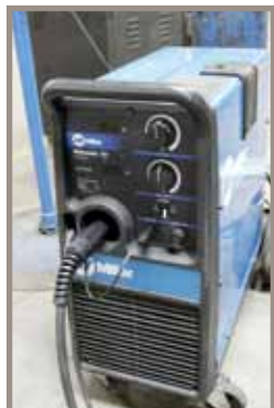
MILLER MILLERMATIC 251 WELDER