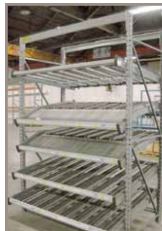
SELECTION OF FLOW RACKING