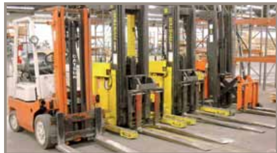
SELECTION OF ELECTRIC LIFT TRUCKS