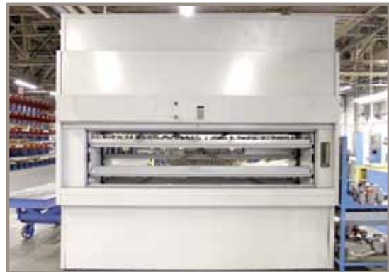
KARDEX RETRIEVAL STORAGE SYSTEM

SIGNODE HBX 4300 AUTOMATIC STRAPPING MACHINE, w/Roller Conveyor