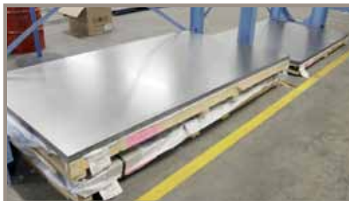
NEW SHEET MATERIAL