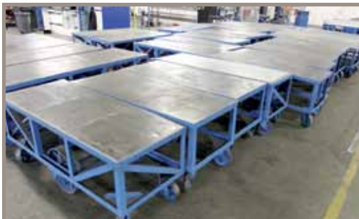
STEEL WHEEL MATERIAL CARTS