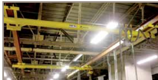
ALTOONA 500-LB. CRANE SYSTEM W/ RUNWAY