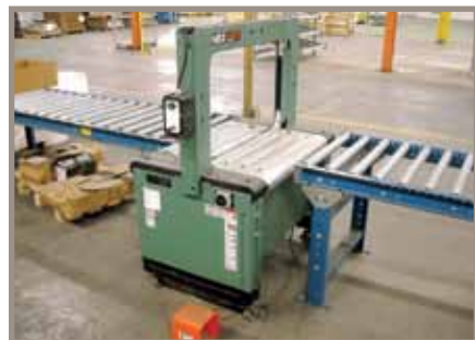
SIGNODE HBX 4300 AUTOMATIC STRAPPER