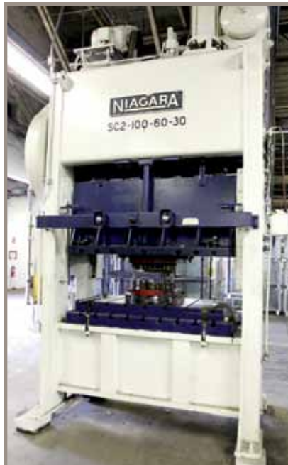
NIAGARA SC2-100-60-30 STAMPING PRESS