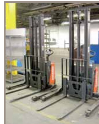
RAYMOND PALLET TRUCKS

DODGE DAKOTA 4 X 4 CLUB CAB, (2003), 6 Cylinder Auto, 82,500 Miles