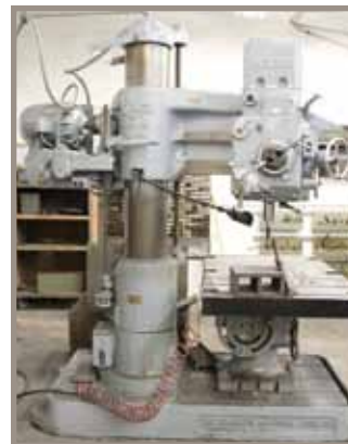
CARLTON 8' RADIAL DRILL