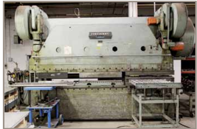
CINCINNATI SERIES 7 X 10 PRESS BRAKE