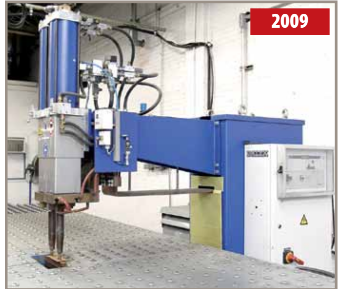
DALEX 273 KVA SPOT WELDER