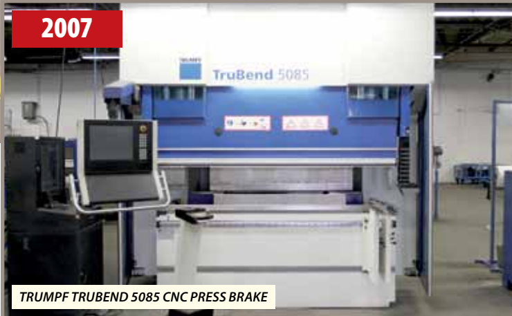
TRUMPF TRUBEND 5085 CNC PRESS BRAKE