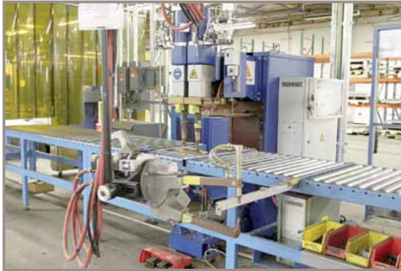
DALEX 405 KVA SPOT WELDER