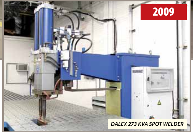
DALEX 273 KVA SPOT WELDER

Sale Date: Tuesday, July 24 Beginning at 10:00 AM Local Time