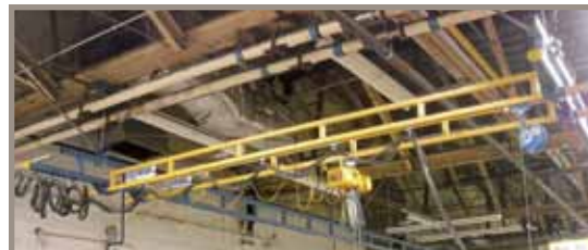
GORBEL 500-LB CRANE SYSTEM

5,800 LB CAT 60 GP30 LP LIFT TRUCK, S/N 7AM00799, Side-Shift, 185 Reach, 3-Stage Mast, 80" Forks, 1700 Hrs