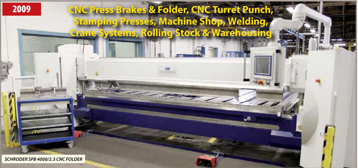
SCHRODER SPB 4000/2.5 CNC FOLDER

CNC Press Brakes & Folder, CNC Turret Punch, Stamping Presses, Machine Shop, Welding, Crane Systems, Rolling Stock & Warehousing