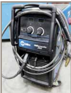
MILLER MILLERMATIC 252 WELDER