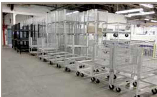
GALVANIZED STEEL PARTS BINS