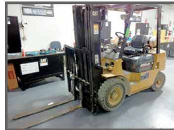
5,000 LB CATERPILLAR GP25 LP FORKLIFT