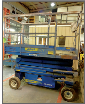
BRIGGS UPRIGHT XL-24DW SCISSORLIFT

BRIGGS UPRIGHT XL-24DW SCISSOR LIFT , S/N 8070, 24' Max. Platform Height