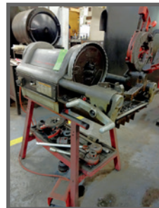
RIDGID 1224 PIPE THREADER