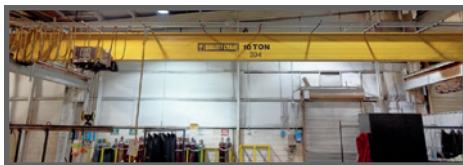
10 TON QUALITY BRIDGE CRANE

5,000 LB CATERPILLAR GP25 LP FORKLIFT, S/N 5AM01753, Side Shift, 171" Lift Height, 80" Mast, 48" Fork Length