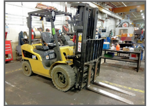
5,450 LB CATERPILLAR 2P6000 LP FORKLIFT