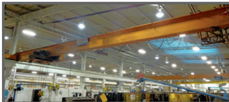
10 TON PLATNICK BRIDGE CRANE