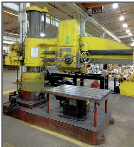
CARLTON 7' X 17" RADIAL ARM DRILL

CARLTON 7' X 17" RADIAL DRILL, 1,000 RPM Spindle Speed, 38" x 56" Table, w/Huge Selection of Tooling