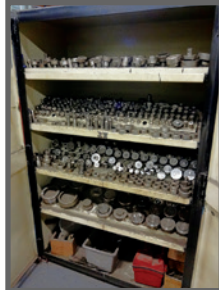
LARGE QUANTITY OF BOSCHERT TOOLING

Sale Closing Date: Thursday May 29, 2014 From 1:00 P.M. EDT