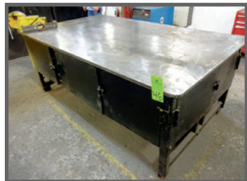
VIEW OF WELDING TABLES