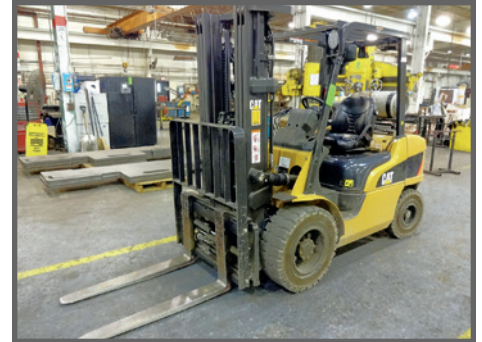
5,450 LB CATERPILLAR 2P6000 LP FORKLIFT