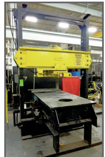
150 TON DAKE STRAIGHTENING PRESS

To discuss your requirements for an auction, please call Perfection Industrial 847.427.3333