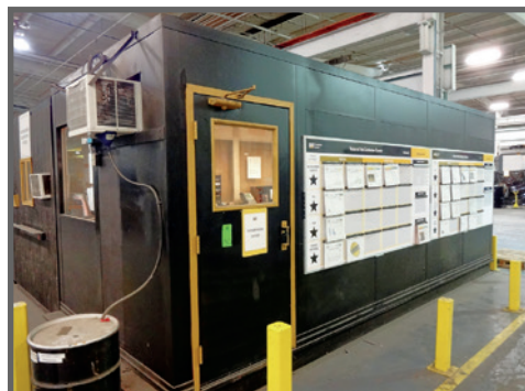
VIEW OF MOBILE OFFICES

OVER 100 HOSE REELS, INCLUDING AIR, OXY./GAS, GREASE AND ELECTRICAL