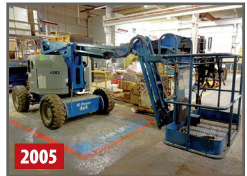
GENIE Z-3422 MANLIFT