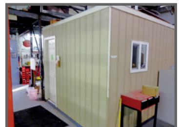
VIEW OF MOBILE OFFICES

View our current auction schedule at www.perfectionindustrial.com