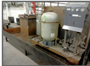
RGF ULTASORB EC WATER RECLAMATION SYSTEM