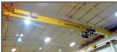
10 TON QUALITY BRIDGE CRANE