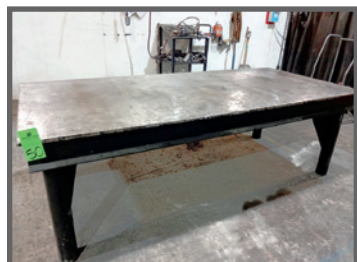
VIEW OF WELDING TABLES