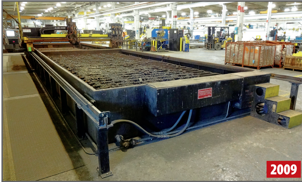
ESAB SABRE SXE PI-4000 CNC PLASMA TORCH CUTTER

2011 ESAB SABRE DXPI-4500 CNC PLASMA AND TORCH CUTTER, S/N 0560947600, 47' x 140" Table, (4) Torch Heads, (1) Plasma Head, w/ESAB Precision Plasmarc 360 Power Source, S/N 0558006832, w/ESAB CC-11 Coolant Circulator, S/N 015-103-1986, (CE Marked)