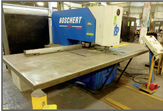
50 TON BOSCHERT CP CNC PUNCH PRESS