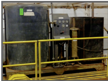
RGF ULTASORB SM WATER RECLAMATION SYSTEM