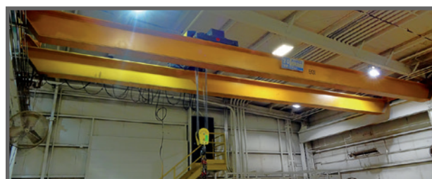
20 TON PLATNICK BRIDGE CRANE