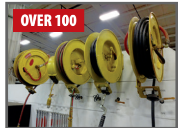
VIEW OF HOSE REELS

Large Quantity of Machine and Bench Type Vises, Mezzanine, Mobile Offices, (2) Autocrib Autolocker Industrial Vending Machines, Shop Fans, Steel Racks, and Much More