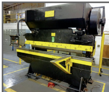
75 TON CHICAGO DREISS & KRUMP 68C 10' PRESS BRAKE