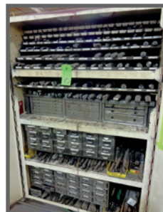
LARGE QUANTITY OF RADIAL ARM DRILL TOOLING