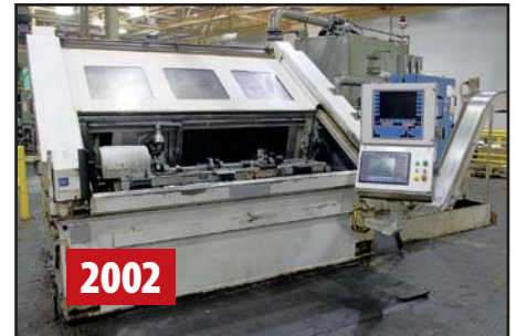
BALANCE ENGINEERING CRH-324 CRANKSHAFT BALANCER