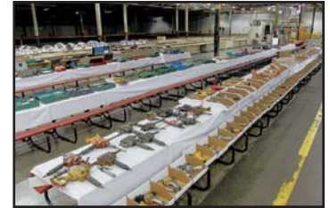
VIEW OF PNEUMATIC TOOLS