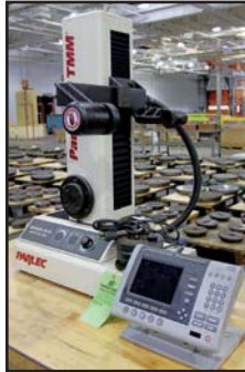
PARLEC TMM PRESETTER

OBERLIN OPF-7 PRESSURE FILTER SYSTEM, S/N TD381C0 (1999), 15 HP Filter Pump and Clean Pump, 200,000 Amp Capacity HYDRAMATION HV-7 FILTER SYSTEM, S/N 7929 HENRY 1500SCX SELF CLEANING LIQUID FILTER SYSTEM, S/N 2104 HENRY 9000SCX FILTER SYSTEM, S/N 2072 HENRY 1200 FILTER SYSTEM, S/N 2103 HENRY 540SCX SELF CLEANING LIQUID FILTER SYSTEM, S/N 2101