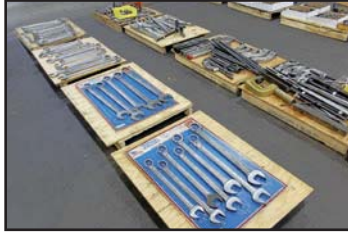
VIEW OF HAND TOOLS