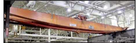
10 TON P & H BRIDGE CRANE