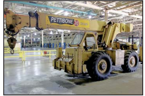
30 TON PETTIBONE 30 MOBILE CRANE

30 TON PETTIBONE 30 MOBILE CRANE , S/N 97-7-A1-7028