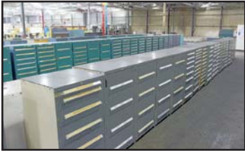
< (OVER 100) BALL BEARING TOOL CABINETS

View our current auction schedule at www.perfectionindustrial.com