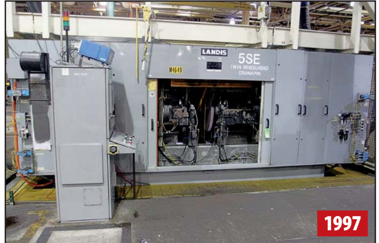
LANDIS 5SE TWIN WHEEL CNC CRANKPIN GRINDER