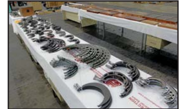
VIEW OF MICROMETERS