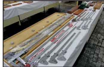
VIEW OF CALIPERS