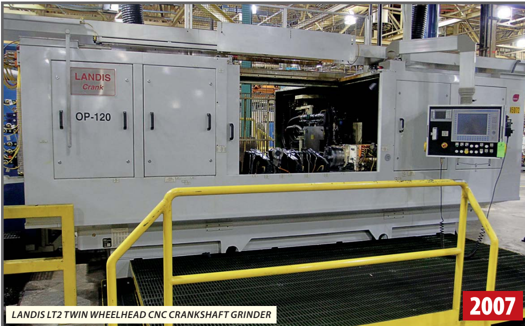
LANDIS LT2 TWIN WHEELHEAD CNC CRANKSHAFT GRINDER

INCLUDING: 1,400+ LOTS OF GEAR & CRANKSHAFT MACHINERY, TOOL ROOM MACHINERY, OVERHEAD CRANES, QUALITY ASSURANCE & INSPECTION EQUIPMENT, FORKLIFTS, MOBILE EQUIPMENT & MUCH MORE