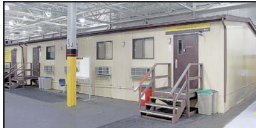
MODULAR OFFICE TRAILER

HOLCRAFT TEMPERING FURNACE , 120"W x 18"H Opening Size, 800 Degree F Max. Temperature, 400 Degrees F Operating Temperature, (3) Zones, Brick Insulated, 6,000 Lbs/Hour Net Heating Capacity, 2.95 Hours Time in Furnace, 53" Entry Conveyor, 78" Exit Conveyor, 41' Overall Length, Electric Heating Source, Equipped w/Barber-Colman 560 Temperature Controllers