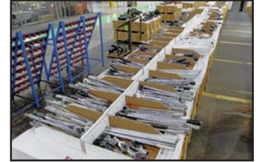
VIEW OF TORQUE WRENCHES