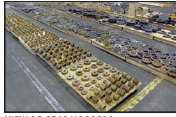
VIEW OF GEAR HOBBERERS