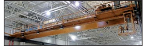
10 TON SHAW-BOX BRIDGE CRANE