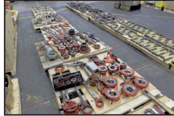
VIEW OF PIPE THREADING TOOLS