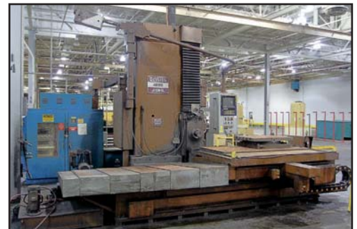
DEVLIEG 4R-80 CNC JIG MILL

ALSO AVAILABLE: Drills Presses; Pedestal Grinders; Mag Drills; Tooling and More