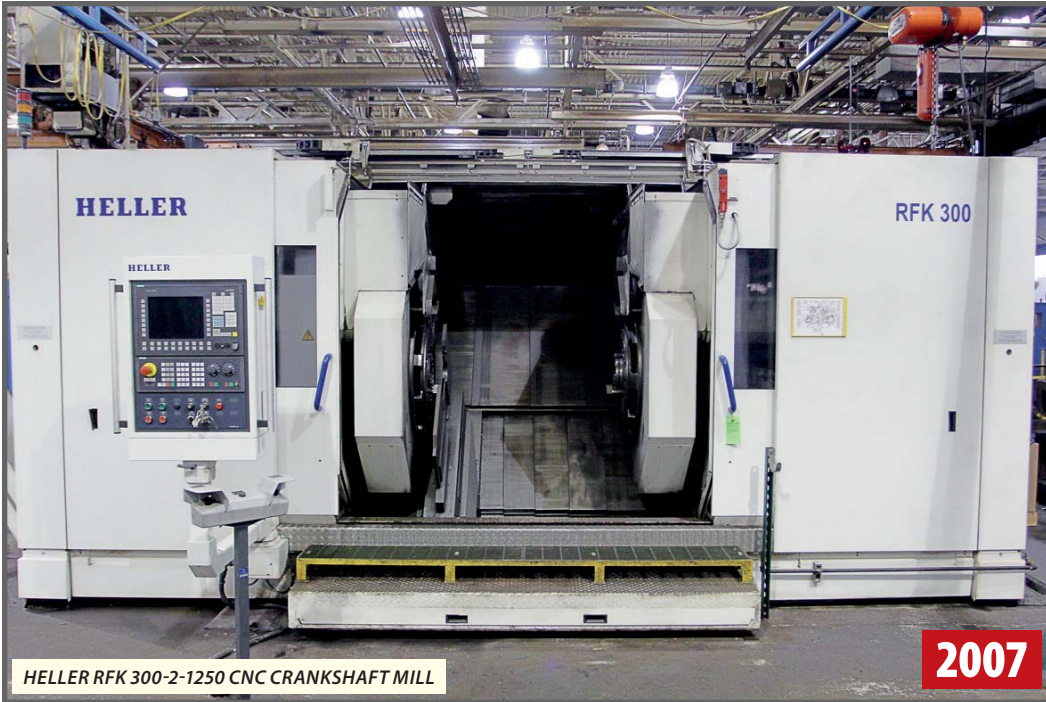
HELLER RFK 300-2-1250 CNC CRANKSHAFT MILL