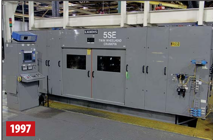
LANDIS 5SE TWIN WHEEL CNC CRANKPIN GRINDER