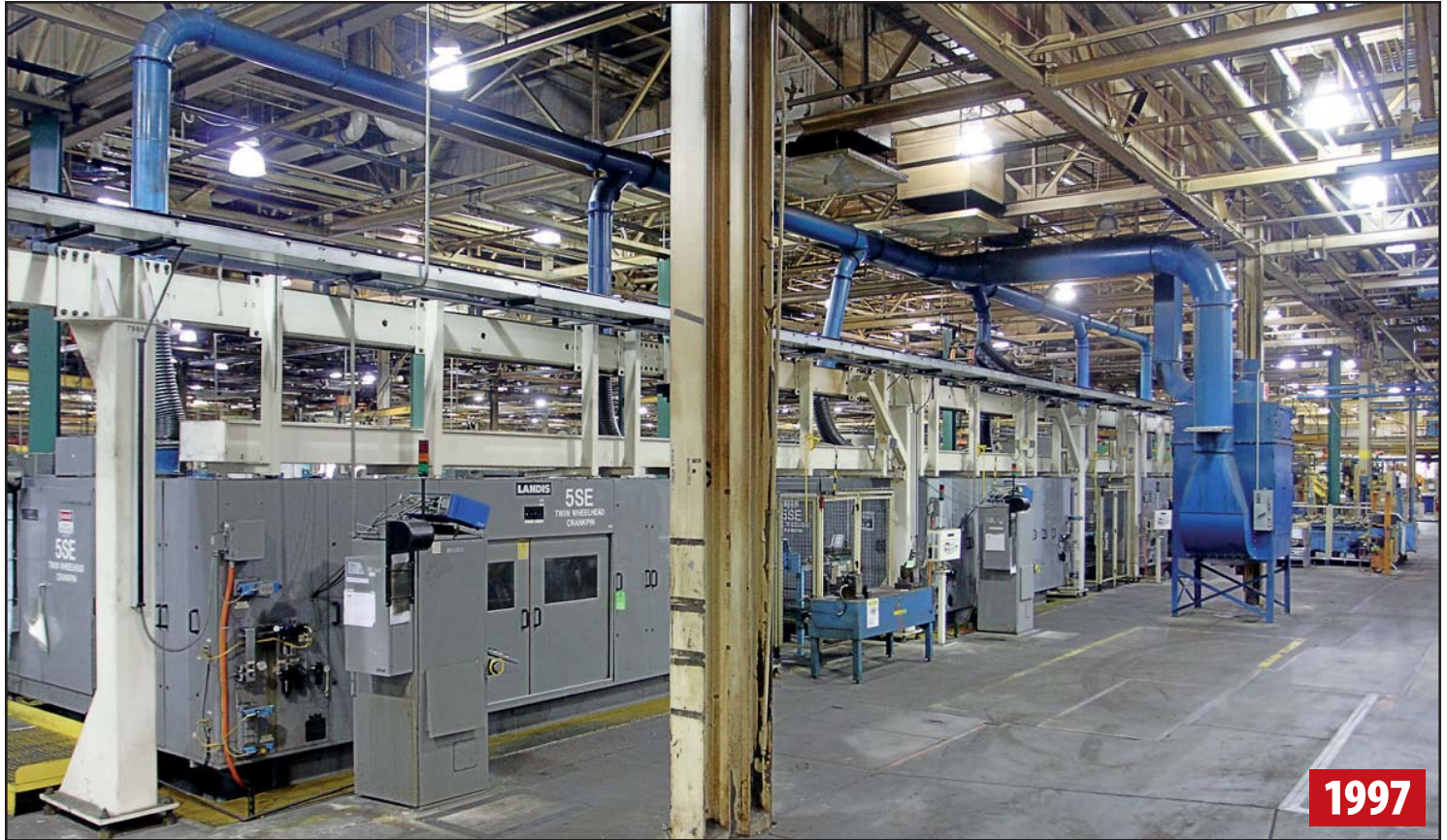
LANDIS 5SE COMPLETE GRINDING CELL