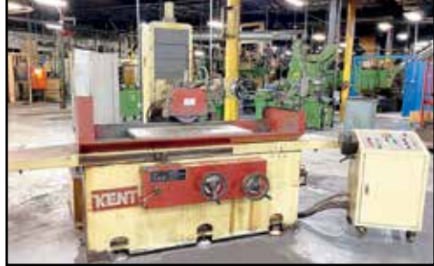
KENT KGS-410AHD 16" X 40" HYDRAULIC SURFACE GRINDER