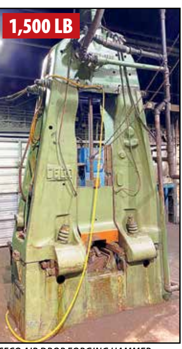
CECO AIR DROP FORGING HAMMER

Inspection of Assets in the Sale is By Appointment Only. Anyone showing up to the site without a scheduled appointment will be denied entry. All coming on site for inspection day must sign a liability waiver and must be wearing long pants, close-toed shoes, and facemask. Call our office at +1-847-545-6374 to schedule your inspection.