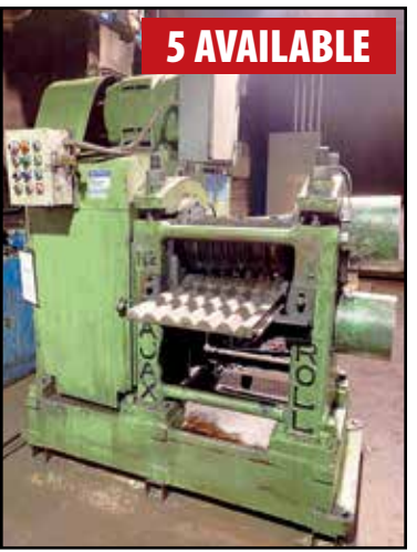
AJAX FORGING REDUCER ROLL