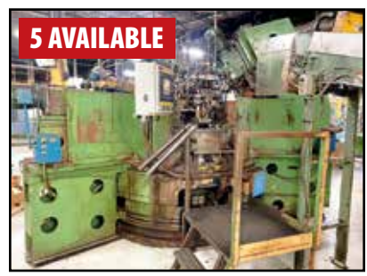
KINGSBURY ROTARY TRANSFER MACHINE

KINGSBURY 22 68" ROTARY TRANSFER MACHINE, s/n B-12380, w/Allen Bradley PanelView 1000 PLC, 4-Mill