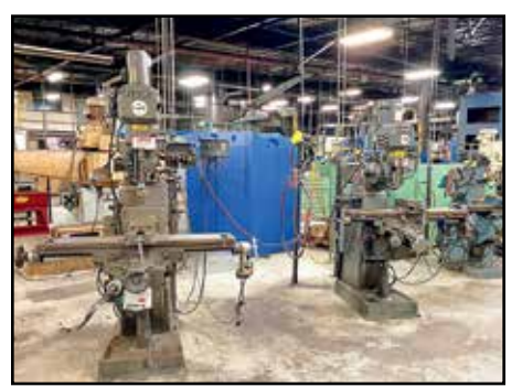
VIEW OF MILLS

Location: 4607 Forge Road, Colorado Springs, CO 80907 Inspection: Monday, August 17 & Tuesday, August 18, By Appointment Only