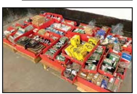
VIEW OF BEARINGS