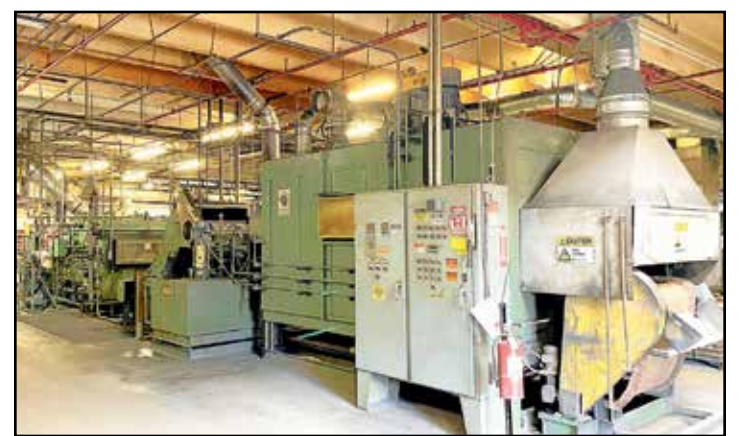
ATMOSPHERE FURNACE CO. HEAT TREAT SYSTEM