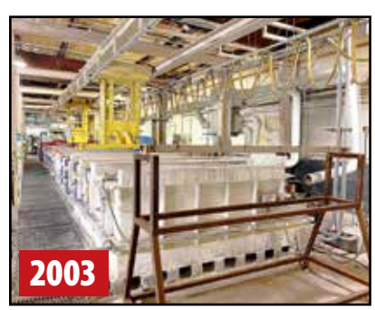
26-STATION E-COAT LINE