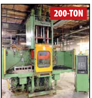
ENGEL ES600/200VSH VERTICAL INJECTION MOLDER