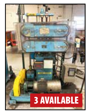
FARRIS C550VT CATERPULLER