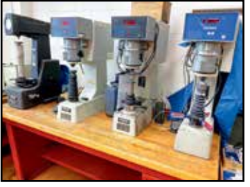
VIEW OF HARDNESS TESTERS