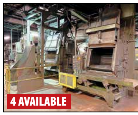
VIEW OF TUMBLE BLAST MACHINES