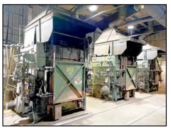
(3) DOW FURNACE CO. SINGLE ANNEAL GAS FURNACES