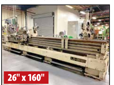
SUPREME ENGINE LATHE