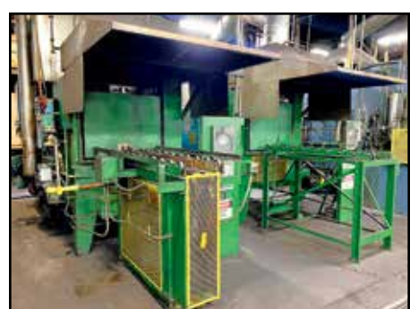
(2) DOW PRS304824 HEAT TREAT FURNACES