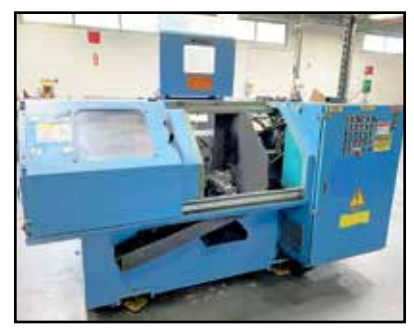
LASCHET PARTNER LP-EF-40-100H PROFILATOR