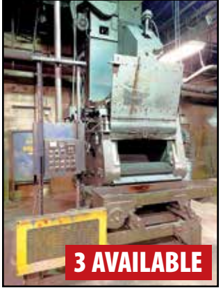
WHEELABRATOR TBR/S6 TUMBLE BLAST MACHINE