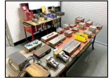
VIEW OF GRINDING ACCESSORIES