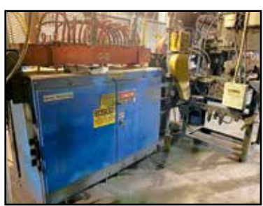
INDUCTION HEATING COILS