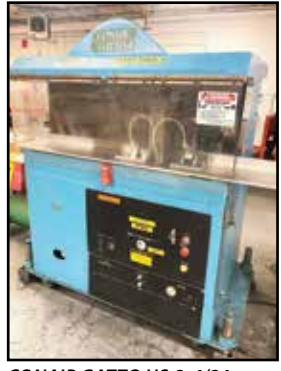
CONAIR GATTO HS-2-4/24 FLYING CUT-OFF