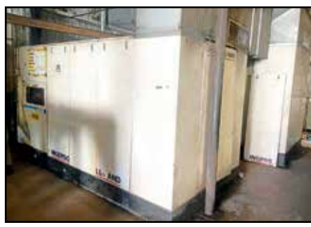
INGERSOLL RAND SSR-XFE300 300 HP ROTARY SCREW AIR COMPRESSOR