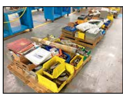
VIEW OF BROWN & SHARPE SPARE PARTS

To discuss your requirements for an auction, please call Perfection Industrial +1-847-545-6374