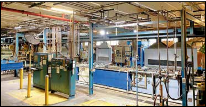
MABCO SYSTEMS NICKEL PLATING LINE