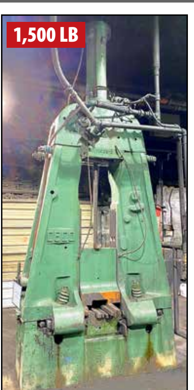
CECO AIR DROP FORGING HAMMER