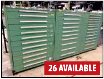
VIEW OF CABINETS