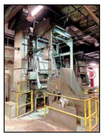
WHEELABRATOR 7 SUPER SHOT TUMBLE BLAST MACHINE