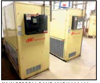
(2) INGERSOLL RAND NVC1200A400 REFRIGERATED AIR DRYERS