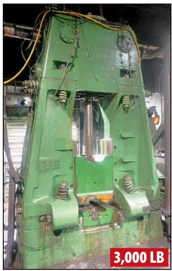
CHAMBERSBURG 12 CDF DIE FORGER