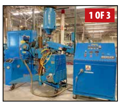
BERLYN 1-1/2 1.5" CO-EXTRUDER