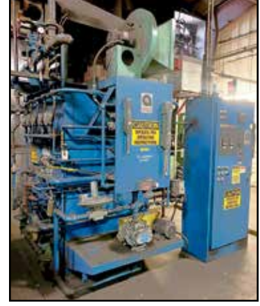
ATMOSPHERE FURNACE CO. 3000CFH ENDOTHERMIC GAS GENERATOR