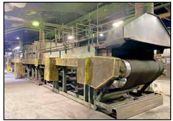
AFC-HOLCROFT NORMALIZING BELT TYPE FLECTRIC FURNACE SYSTEM