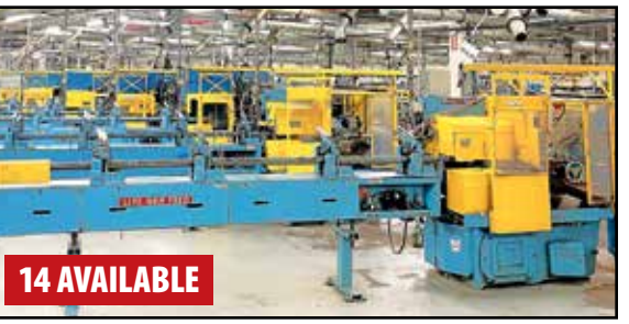
VIEW OF BROWN & SHARPE SCREW MACHINES