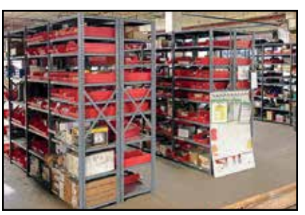
VIEW OF STORES