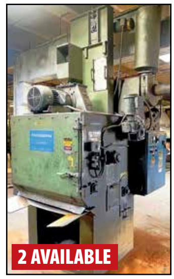
PANGBORN 6GN-6R ROTOBLAST TUMBLE BLAST MACHINE

(2) PANGBORN 6GN-6R ROTOBLAST RUBBER BELT BARREL BLAST CLEANING SYSTEMS, s/n S-931077, S-920766