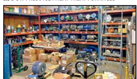
VIEW OF MOTORS