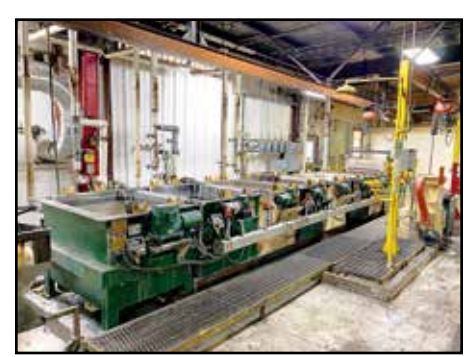
7-STATION BLACK OXIDE BARREL PLATING LINE

Location: 4607 Forge Road, Colorado Springs, CO 80907 Inspection: Monday, August 17 & Tuesday, August 18, By Appointment Only