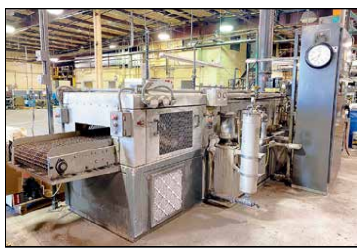
HURRICANE SYSTEMS 5024 PRE-WASH/WASH/RINSE/BLOW-OFF LINE