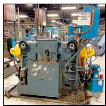
BESLEY .25" – .75" FACE GRINDER

To avoid any public gatherings, there will be no onsite participation in this Webcast-only auction.