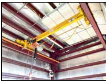
WAZEE 3-TON BRIDGE CRANE SYSTEM