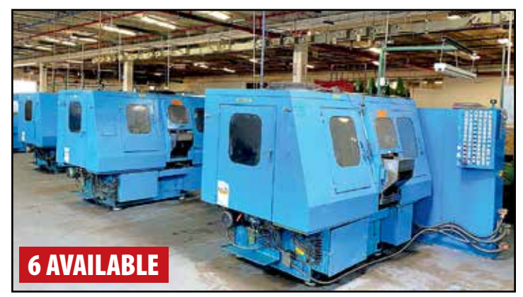
VIEW OF PROFILATORS

LASCHET PARTNER LP-25 PROFILATOR, s/n 3005-HP100