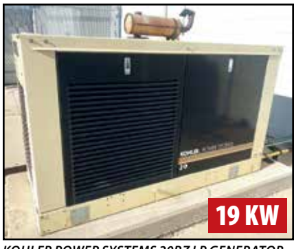
KOHLER POWER SYSTEMS 20RZ LP GENERATOR