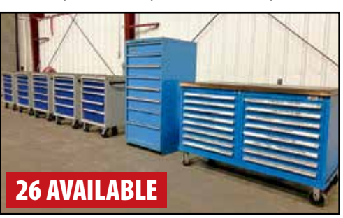
VIEW OF CABINETS

WAZEE 5-TON BRIDGE CRANE SYSTEM, 58' Runway x 49' Span, w/Ace Electric Hoist w/Pendant Control, LISTA ROLLING TOOL CHESTS, BLUE GIANT B6L22-63 2,000 LB ELECTRIC PALLET JACK, 4' X 4' FLOOR SCALE W/ METTLER TOLEDO SC15 BENCH TOP UNIT, ZIP FZB 45 PARTS WASHER, HARDWARE CUBBIES W/LARGE ASSORTMENT OF FASTENERS, PALLET RACKING, SHOP FANS, WORK BENCHES, ETC.