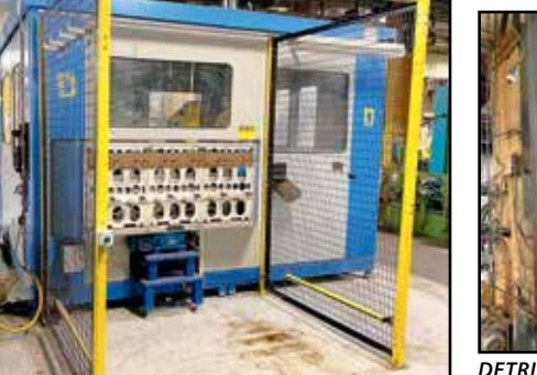
ACT FRC-50.2-T ROBOTIC FINISHING CELL

DETRIOT BROACH 15-TON X 66" DOUBLE RAM BROACH, s/n M-735035, w/Allen Bradley 900 PLC