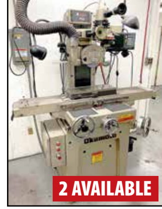
OKAMOTO PFG-618 SURFACE GRINDER