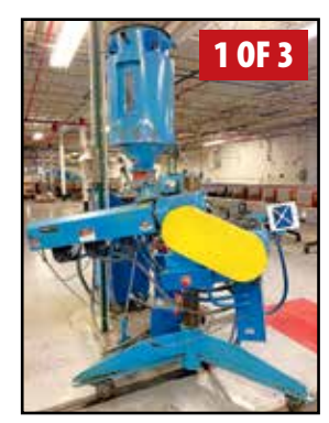
BERLYN 1-1/2 1.5' CO-EXTRUDER