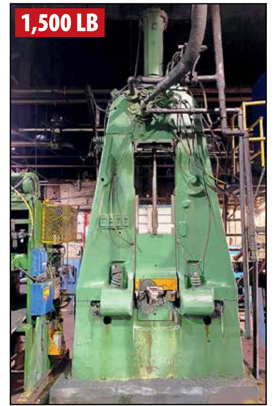
CECO 15CDE AIR DROP FORGING HAMMER

CECO "E" 3,000 LB AIR DROP FORGING HAMMER, s/n 2511-L, w/30" \times 23" Anvil Capacity, 23" \times 26.5", Updated Sensors and Control, (#328, Hammer #7)