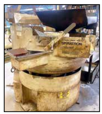
ROTO-FINISH VIBRATORY FINISHER

ROTO-FINISH EXTENDED RANGE SERIES SPIRATRON VIBRATORY FINISHER, s/n 5583\,