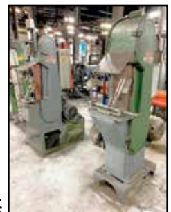
(2) VERTICAL BELT GRINDERS

View our current auction schedule at www.perfectionindustrial.com