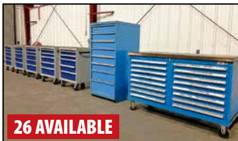
VIEW OF CABINETS

WAZEE 5-TON BRIDGE CRANE SYSTEM, 58' Runway x 49' Span, w/Ace Electric Hoist w/Pendant Control, LISTA ROLLING TOOL CHESTS, BLUE GIANT B6L22-63 2,000 LB ELECTRIC PALLET JACK, 4' X 4' FLOOR SCALE W/ METTLER TOLEDO SC15 BENCH TOP UNIT, ZIP FZB 45 PARTS WASHER, HARDWARE CUBBIES W/LARGE ASSORTMENT OF FASTENERS, PALLET RACKING, SHOP FANS, WORK BENCHES, ETC.