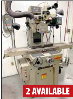
OKAMOTO PFG-618 SURFACE GRINDER