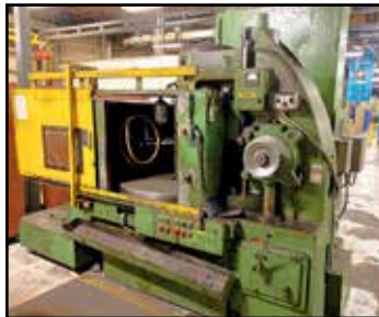
BLANCHARD NO. 18-42 ROTARY SURFACE GRINDER