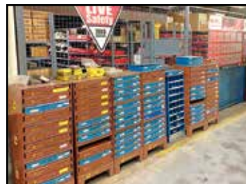
VIEW OF STORES

To discuss your requirements for an auction, please call Perfection Industrial +1-847-545-6374