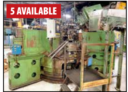
KINGSBURY ROTARY TRANSFER MACHINE

KINGSBURY 22 68" ROTARY TRANSFER MACHINE , s/n B-12380, w/Allen Bradley PanelView 1000 PLC, 4-Mill Station