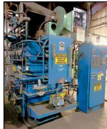
ATMOSPHERE FURNACE CO. 3000CFH ENDOTHERMIC GAS GENERATOR