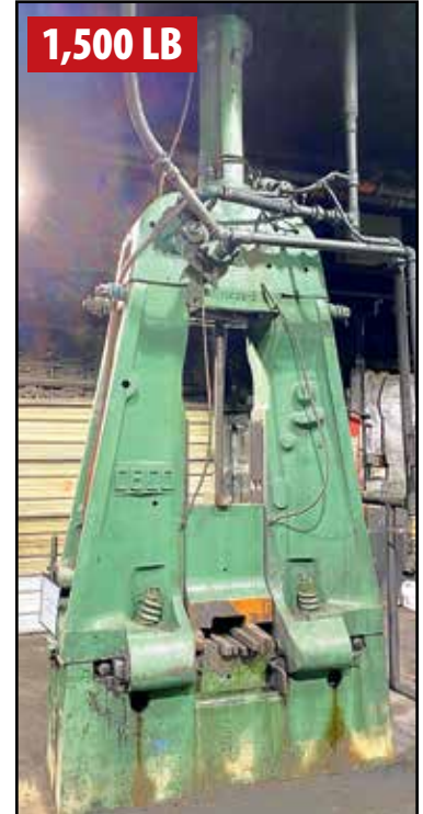
CECO AIR DROP FORGING HAMMER

ALSO: SPARE HAMMER BASES, COLUMNS, CROWNS/ STACKS, ANVILS, CANTILEVER RACKING W/HUGE SELECTION OF BAR STOCK FROM 11/16" TO 2-1/8" DIA. X 20"L., LARGE ASSORTMENT OF DIES AND MORE