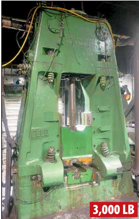
CHAMBERSBURG 12 CDF DIE FORGER