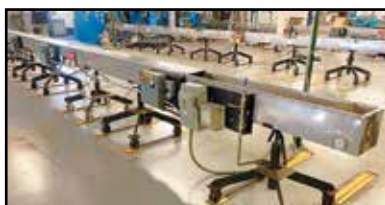
VIEW OF STAINLESS STEEL COOLING TROUGHS