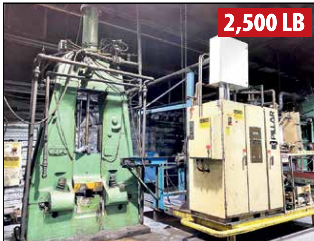
CECO "E" AIR DROP FORGING HAMMERS (ALSO SHOWN: INDUCTION SYSTEMS)

CECO "E" 3,000 LB AIR DROP FORGING HAMMER , s/n 2511-L, w/30" x 23" Anvil Capacity, 23" x 26.5", Updated Sensors and Control, (#328, Hammer #7)