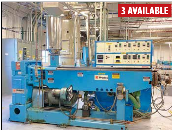
PRODEX TM350-24 3.5\"/>