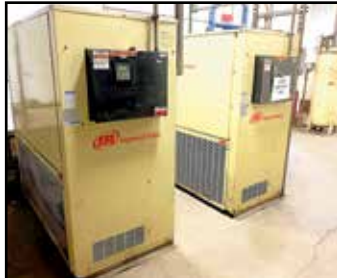
(2) INGERSOLL RAND NVC1200A400 REFRIGERATED AIR DRYERS