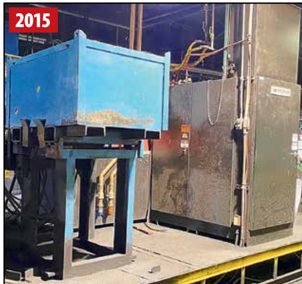
ESC INDUCTION IGBT800-1-3 800 KW INDUCTION HEATING SYSTEM