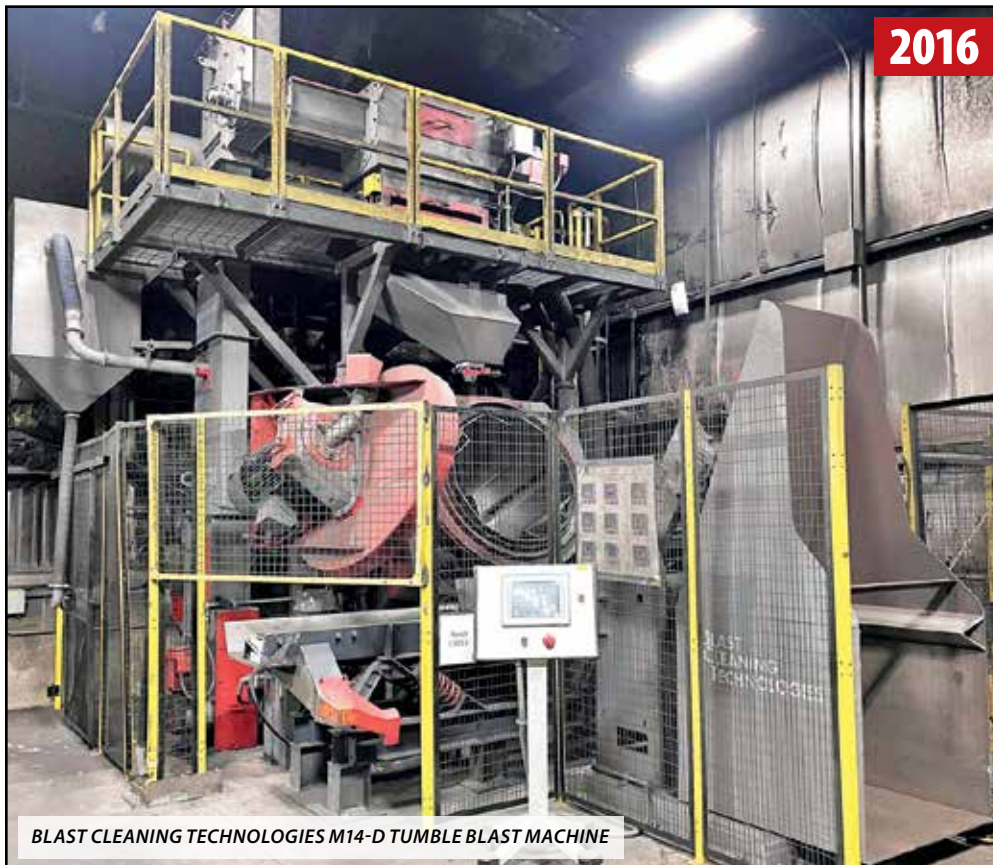
BLAST CLEANING TECHNOLOGIES M14-D TUMBLE BLAST MACHINE

Inspection: Mon., August 17 & Tues., August 18, By Appointment Only