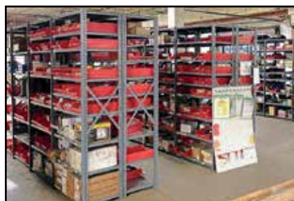
VIEW OF STORES

Day 1 Sale Date: Wednesday, August 19 at 9:00 AM MT