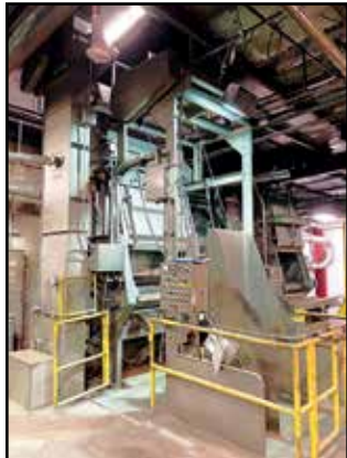
WHEELABRATOR 7 SUPER SHOT TUMBLE BLAST MACHINE