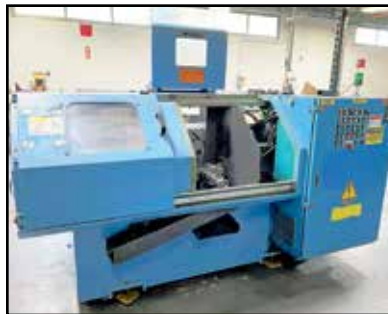
LASCHE PARTNER LP-EF-40-100H PROFILATOR