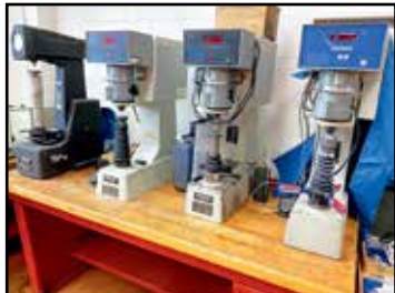
VIEW OF HARDNESS TESTERS