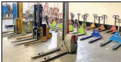
VIEW OF MATERIAL HANDLING