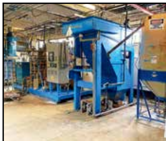
INGERSOLL RAND SSR-EPE150-25 AIR COMPRESSOR