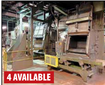
VIEW OF TUMBLE BLAST MACHINES