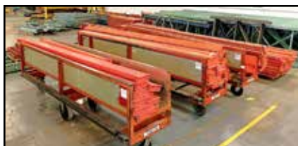
VIEW OF PALLET RACKING