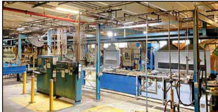
MABCO SYSTEMS NICKEL PLATING LINE