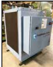
THERMAL CARE NQA05 CHILLER