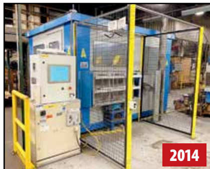
ACT RFC-50.2-T ROBOTIC FINISHING CELL

Day 2 Sale Date: Thursday, August 20 at 9:00 AM MT