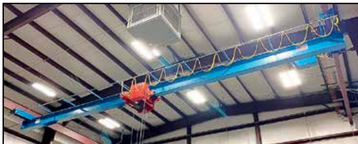
WAZEE 5-TON BRIDGE CRANE SYSTEM