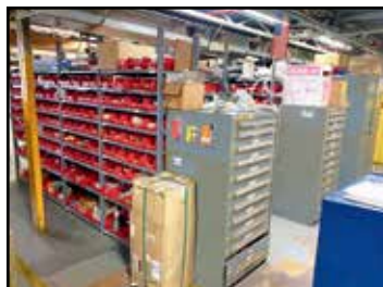
VIEW OF STORES