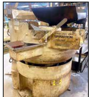
ROTO-FINISH VIBRATORY FINISHER