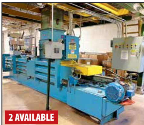
MAREN 111 297 15 HP BALER

PLEASE NOTE: The Regrind/Pelletizer System Will Be Offered as Both a Bulk Bid for the Complete System and Piecemeal for the Individual Components. See the Lot Catalog for Details.