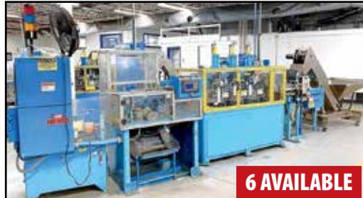
6 AVAILABLE SCREWDRIVER STAMP AND ASSEMBLY LINES