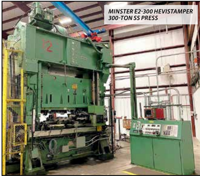
MINSTER E2-300 HEVISTAMPER 300-TON SS PRESS