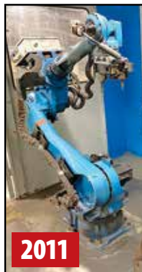
YASKAWA MOTOMAN MH 50 ROBOT