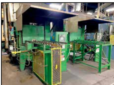
(2) DOW PRS304824 HEAT TREAT FURNACES

Location: 4607 Forge Road, Colorado Springs, CO 80907 Inspection: Monday, August 17 & Tuesday, August 18, By Appointment Only