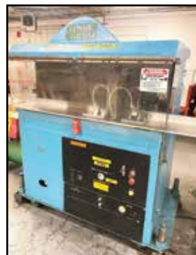
CONAIR GATTO HS-2-4/24 FLYING CUT-OFF