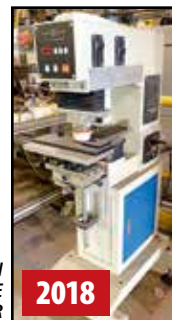
ALL AMERICAN SPC814E PAD PRINTER