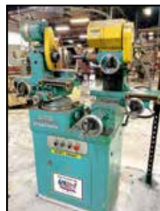
CINCINNATI MILACRON MONOSET T&C GRINDER