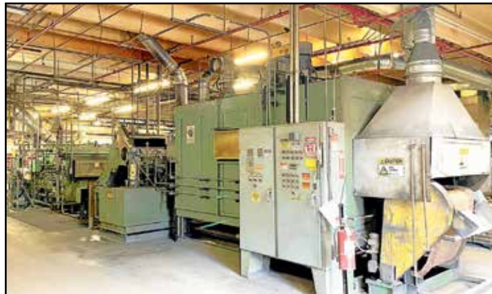
ATMOSPHERE FURNACE CO. HEAT TREAT SYSTEM