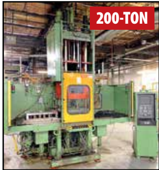
ENGEL ES600/200VSH VERTICAL INJECTION MOLDER