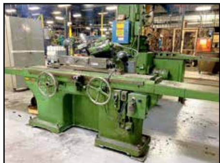
HUDSON LAPOINTE SIZE 60 GRINDER