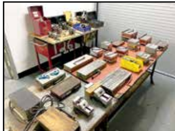
VIEW OF GRINDING ACCESSORIES