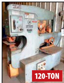
SCOTCHMAN 12012-24M IRONWORKER

ALSO: CROWN 15MT 1,500 LB ELECTRIC WALKIE STACKER, s/n 1A211173, DOW FURNACE BXA-369636G 800,000 BTU DIE HEATER FURNACE, s/n PBX-104G, LARGE ASSORTMENT OF DIE LIFT CARTS