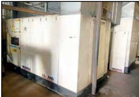
INGERSOLL RAND SSR-XFE300 300 HP ROTARY SCREW AIR COMPRESSOR