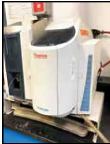
THERMO SCIENTIFIC ICE 3000 SERIES ATOMIC ABSORPTION SPECTROMETER