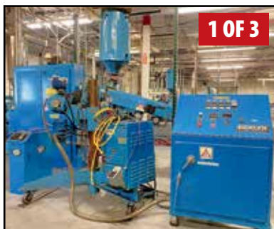
BERLYN 1-1/2 1.5\"/>