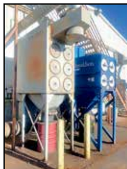
DUSTHOG AND TORIT DUST COLLECTORS