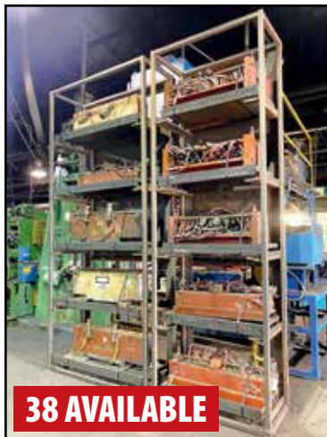
INDUCTION HEATING COILS