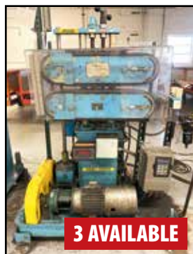
FARRIS C550VT CATERPULLER