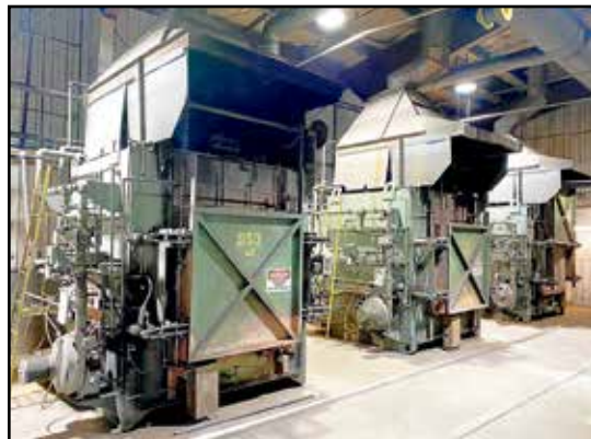
(3) DOW FURNACE CO. SINGLE ANNEAL GAS FURNACES

Day 2 Sale Date: Thursday, August 20 at 9:00 AM MT