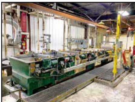
7-STATION BLACK OXIDE BARREL PLATING LINE