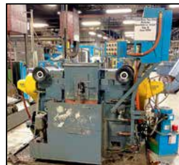
BESLEY .25"- .75" FACE GRINDER

To avoid any public gatherings, there will be no onsite participation in this Webcast-only auction.