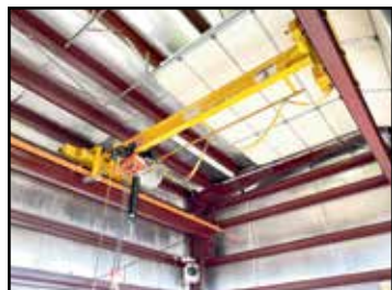
WAZEE 3-TON BRIDGE CRANE SYSTEM