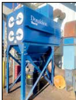
DONALDSON TORIT DOWNFLO EVOLUTION DFE2-8 DUST COLLECTOR