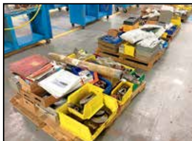
VIEW OF BROWN & SHARPE SPARE PARTS