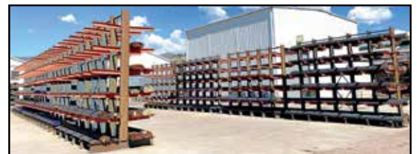
VIEW OF BAR STOCK AND CANTILEVER RACKING

ALSO: RAMPACTOR 4036HT DRUM CRUSHER, s/n 04995349, LANDA NHP4-30024C 3000 PSI LPG PRESSURE WASH SYSTEM, s/n P0106-115924, STRONGHOLD CABINETS, KNAACK GANG BOXES, TOOL BOXES, ROLLING GANTRIES, PALLET RACKING, ELECTRIC PALLET JACKS, PALLET JACKS, LADDERS, SAFETY LADDERS, LARGE QUANTITY OF STEEL STOCK, BALER, SPILL KITS AND PLATFORMS, STOCK CARTS, SEALED AIR PACKAGING SYSTEMS, HARTZELL 412-38-FA03 TRUE GDM-41 REFRIGERATOR, HOSHIZAKI DCM-500BAH-OS ICE MAKER, MAINTENANCE CRIB INCLUDING LARGE ASSORTMENT OF SWITCHES, CONTACTORS, BREAKER BOXES, FUSES, BELTS, BOARDS, MOTORS, BEARINGS, VALVES, HOSES, BALLASTS, LIGHTS, CHAIN, GEARS, CYLINDERS, FILTERS, SPROCKETS, CAMS, SOLENOIDS AND MORE