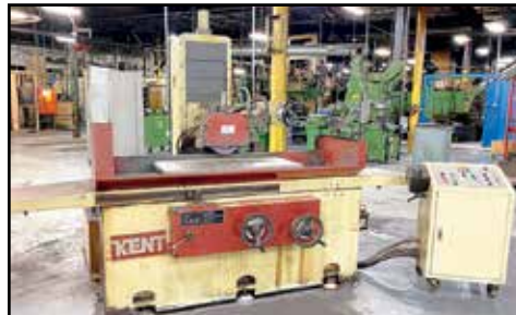
KENT KGS-410AHD 16" X 40" HYDRAULIC SURFACE GRINDER