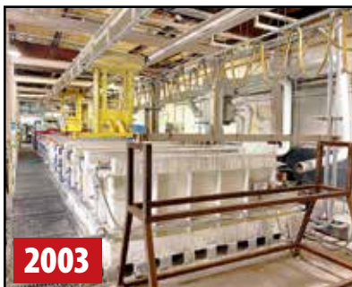
CLEARCLAD 26-STATION E-COAT LINE