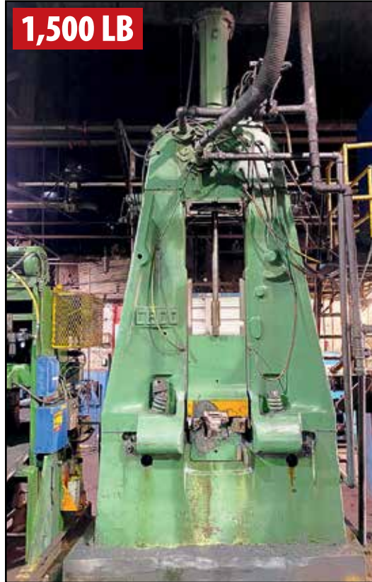
CECO 15CDE AIR DROP FORGING HAMMER

(2) CECO "E" 2,500 LB AIR DROP FORGING HAMMERS , s/n 2696-L (#330, Hammer #8), 2354-L (Hammer #5), w/27.25" x 19" Anvil Capacity, 21" x 24" Ram