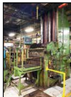
LAPOINTE 15-TON X 66" DOUBLE RAM VERTICAL BROACH

LAPOINTE 15-TON X 66" DOUBLE RAM BROACH , s/n 50071, w/Allen Bradley PanelView 1000 PLC