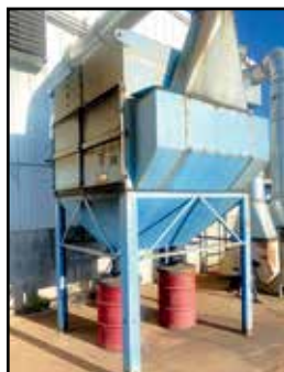
FARR TENKAY 20D DUST COLLECTOR