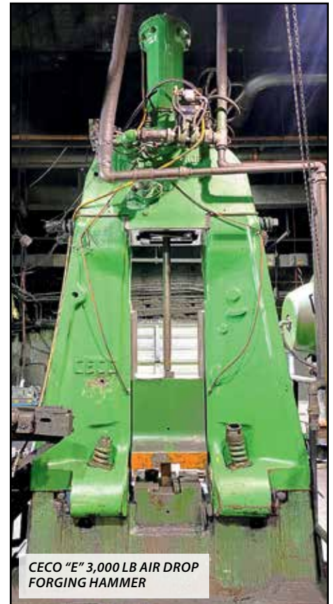
CECO "E" 3,000 LB AIR DROP FORGING HAMMER