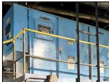
AMERICAN INDUCTION HEATING PSCS-400-3 400 KW INDUCTION HEATER