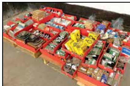
VIEW OF BEARINGS