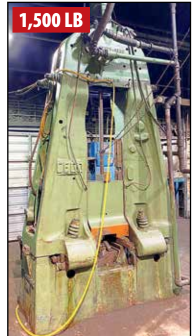
CECO AIR DROP FORGING HAMMER

Inspection of Assets in the Sale is By Appointment Only. Anyone showing up to the site without a scheduled appointment will be denied entry. All coming on site for inspection day must sign a liability waiver and must be wearing long pants, close-toed shoes, and facemask. Call our office at +1-847-545-6374 to schedule your inspection.