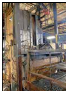
DETROIT BROACH VTT-15-66 15-TON X 66" DOUBLE RAM VERTICAL BROACH