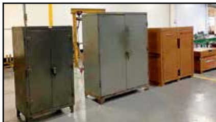
VIEW OF CABINETS AND JOB BOXES