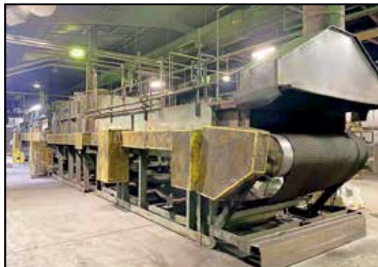
AFC-HOLCROFT NORMALIZING BELT TYPE ELECTRIC FURNACE SYSTEM