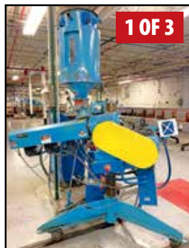
BERLYN 1-1/2 1.5\"/>