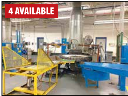
4 AVAILABLE BLASDEL ENTERPRISES DIAL TEMP PAINT MACHINE LINES