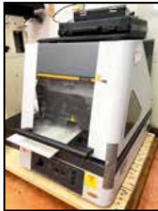
FISCHER TECH FISCHERSCOPE X-RAY XDL SPECTROMETER