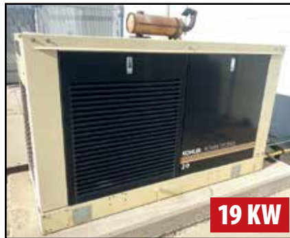
19 KW KOHLER POWER SYSTEMS 20RZ LP GENERATOR