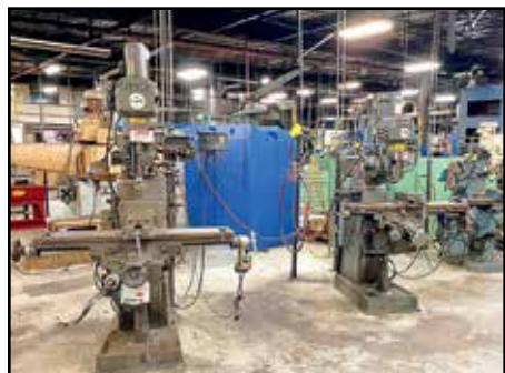
VIEW OF MILLS