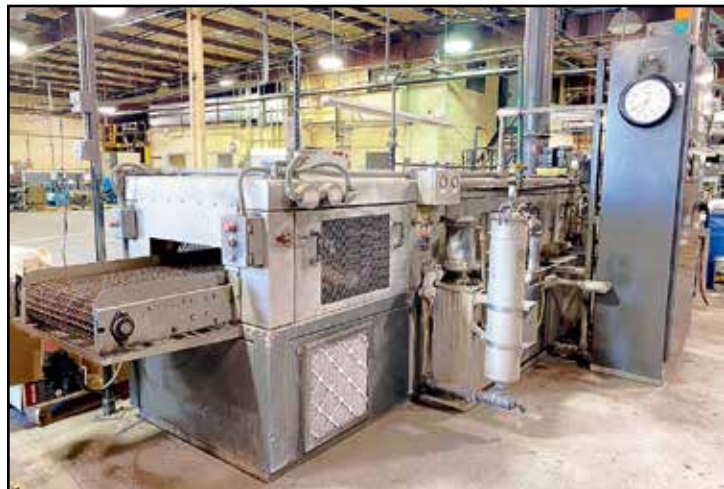
HURRICANE SYSTEMS 5024 PRE-WASH/WASH/RINSE/BLOW-OFF LINE