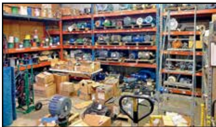
VIEW OF MOTORS

Location: 4607 Forge Road, Colorado Springs, CO 80907 Inspection: Monday, August 17 & Tuesday, August 18, By Appointment Only