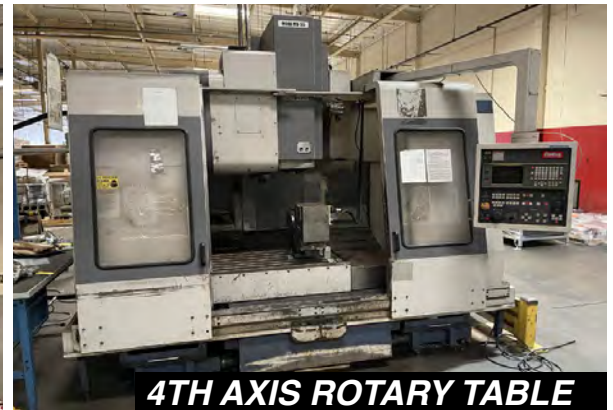
4TH AXIS ROTARY TABLE