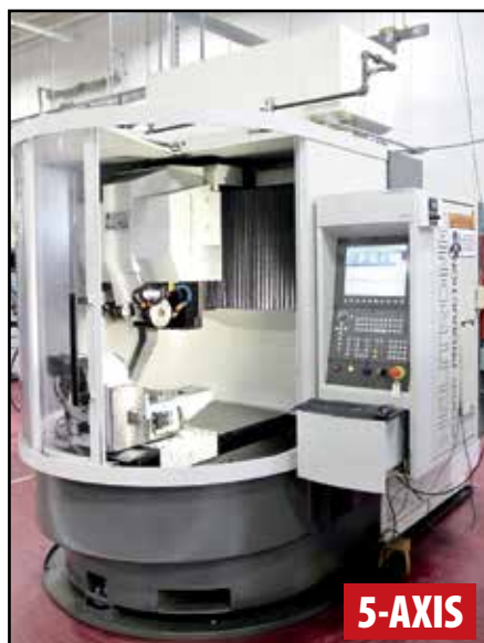
WALTER HELITRONIC POWER CNC PRECISION GRINDER

JONES SHIPMAN NO1600 CENTER HOLE GRINDER EX-CELL-O CENTER HOLE GRINDER