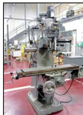
BRIDGEPORT 2 HP VERTICAL MILL