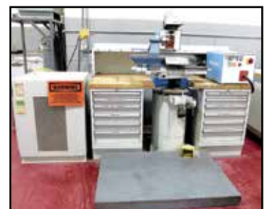
RADYNE FLEXITUNE INDUCTION HEATING BRAZING STATION

View our current auction schedule at www.perfectionindustrial.com