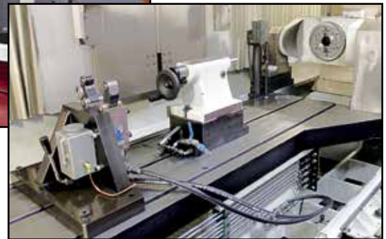
VIEW OF STAMA WORK ENVELOPE