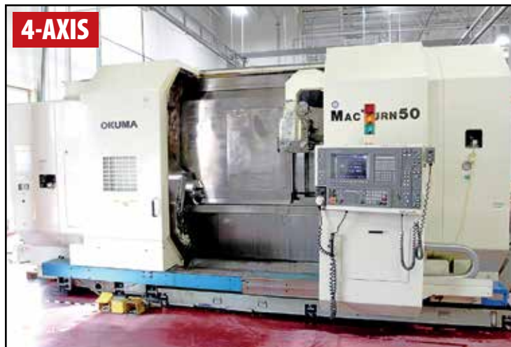
OKUMA MACTURN 50 MILLING/TURNING CENTER