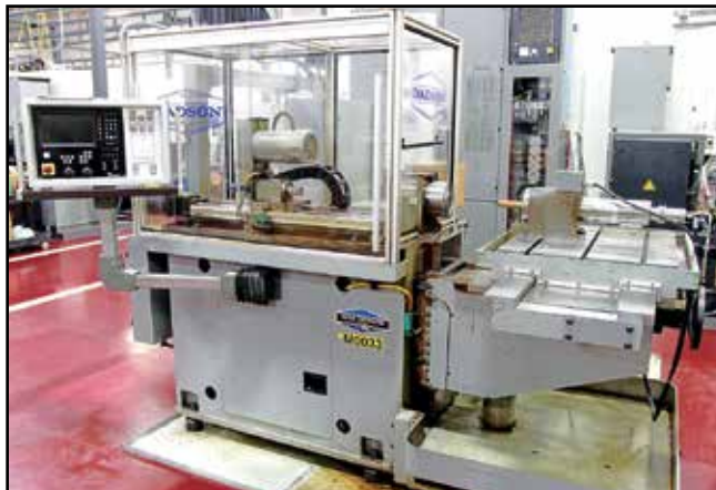
DADSON DS7530-KM CNC GUN DRILL