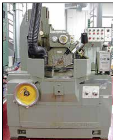
FAVRETTO TR60 ROTARY SURFACE GRINDER

Live Webcast Bidding Available Through BidSpotter.com