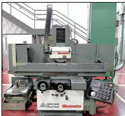
OKAMOTO ACC-20-24DX HYDRAULIC SURFACE GRINDER