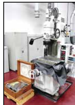
MOORE G18 JIG GRINDER