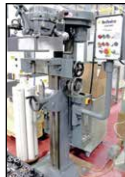
TECHNICA ZSM 5100 CENTER HOLE/VALVE GRINDER