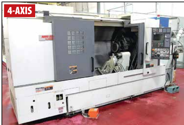
2005 MORI SEIKI NL2500Y/1250 TURNING CENTER