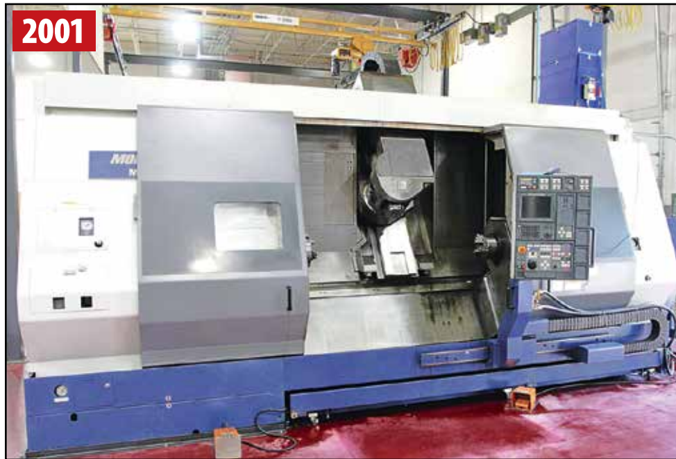
MORI SEIKI MT 253S/1500 5-AXIS MILLING/TURNING CENTER