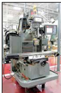
TRAK DPM3 3 HP VERTICAL MILL