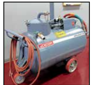
CECOR SA5-140AT SUMP CLEANER/FILTER

ALSO: ADJUSTABLE PALLET RACKS, DUMPING SCRAP HOPPERS, PALLET JACKS, HAND TRUCKS, DIE TRUCKS, SHOP CARTS, METRO RACKING, RIGGING SLINGS/CHAINS