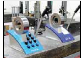
(2) SCHUNK TRIBOS TOOL CLAMPING SYSTEMS