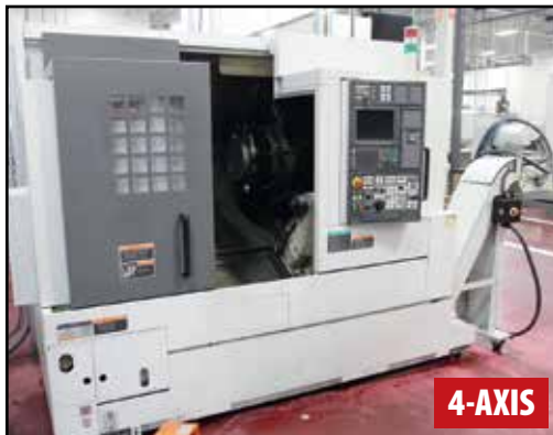
2005 MORI SEIKI NL2000/500 TURNING CENTER

FEATURING: OVER 1,000 TOTAL LOTS INCLUDING 5-AXIS MACHINING CENTERS, CNC LATHES, TOOL & CUTTER GRINDERS, TOOL PRESETTERS, GRINDERS, GUN DRILLS, MACHINE TOOLS, TOOLING, QUALITY CONTROL DEPARTMENT, OFFICE AREA & FACTORY SUPPORT