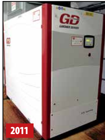
GARDNER DENVER VS50A 50 HP VARI-SPEED AIR COMPRESSOR