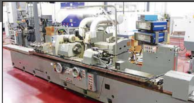
SHIGIYA G-45-500 UNIVERSAL CYLINDRICAL GRINDER