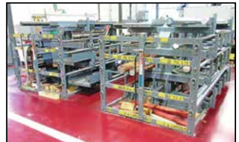
SSS 24" SPACE SAVER RACKS