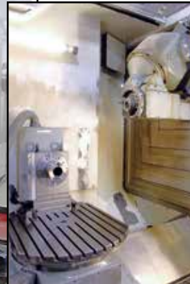
VIEW OF DMG DECKEL MAHO WORK ENVELOPE

To discuss your requirements for an auction, please call Perfection Industrial +1-847-545-6374 or sales@perfectionindustrial.com