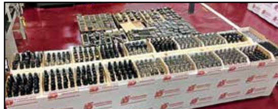
VIEW OF CAPTO C6 AND C4 TOOL HOLDERS