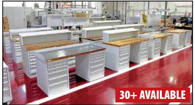
PRISTINE LISTA WORK STATIONS