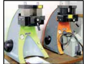
(2) ABNOX TOOL CLAMPING PRESSES