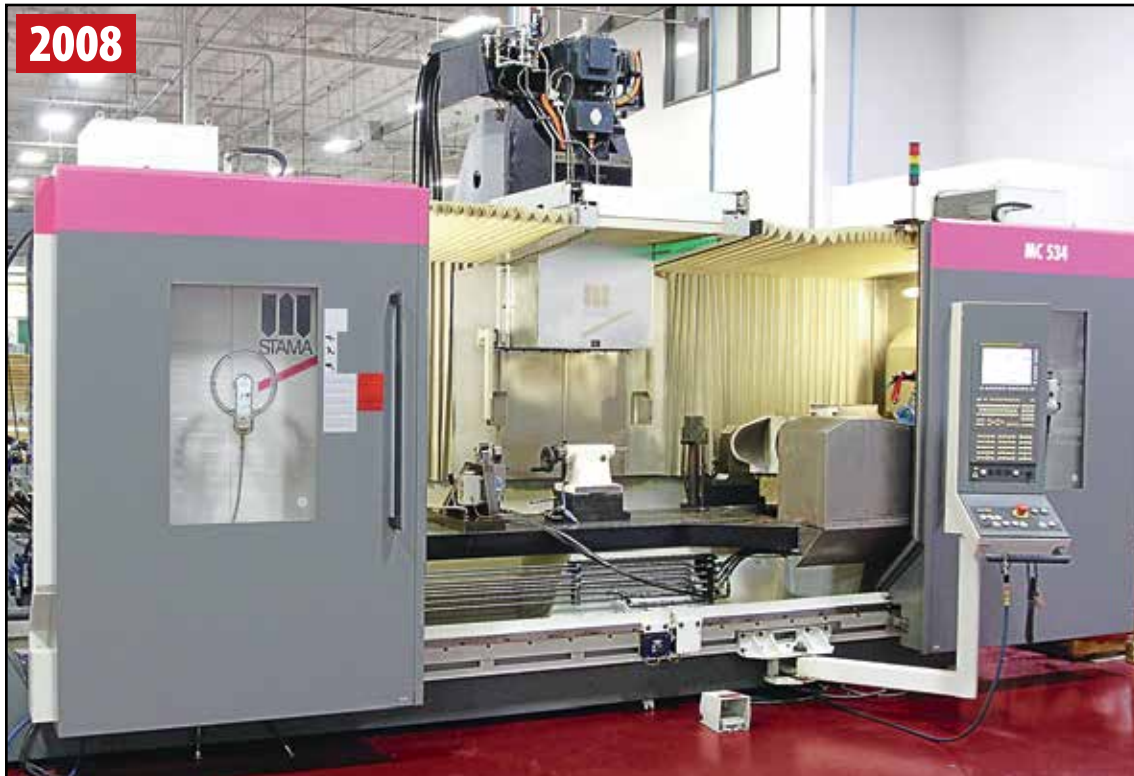
STAMA MC534 LONG BED 5-AXIS VMC