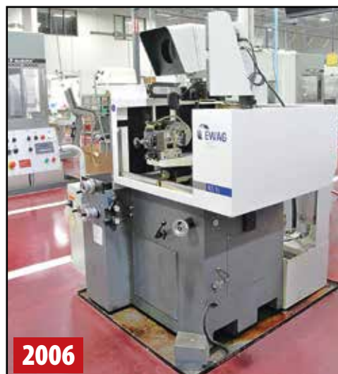
EWAG RS15 UNIVERSAL 6-AXIS TOOL GRINDER