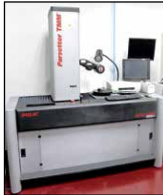
PARLEC PARSETTER TTM SERIES 2500 TOOL PRESETTER