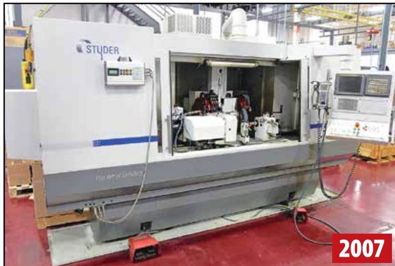
STUDER S31 CNC UNIVERSAL GRINDER