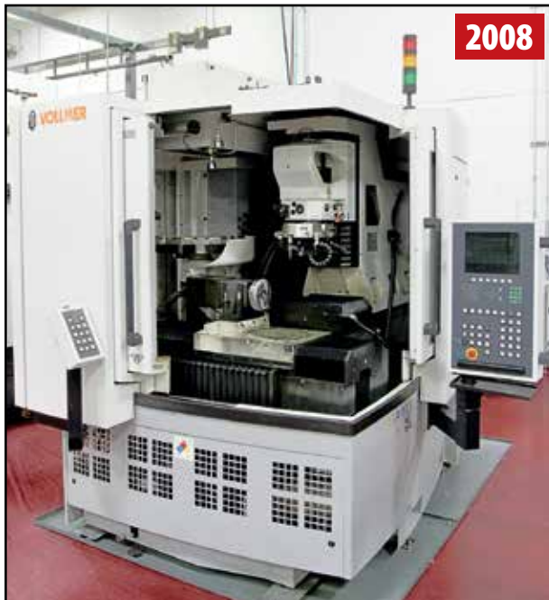
VOLLMER QWD 750H CNC 5-AXIS WIRE EROSION MACHINE