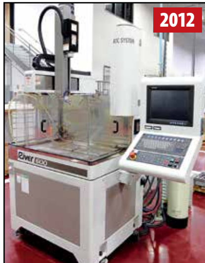
OCEAN TECH RIVER 600 CNC DRILLING EDM