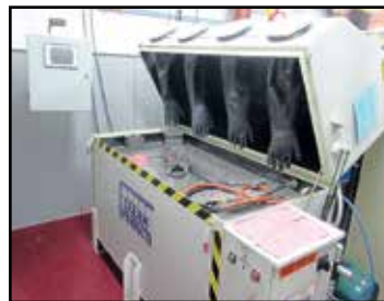
CLEAN PRODUCTS SS 2-STATION HI-PRESSURE WASHER