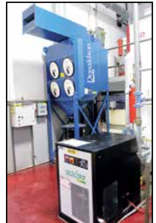
DONALDSON TORIT DF02-4 DUST COLLECTOR