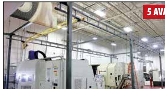
SPANCO FREE-STANDING CRANE SYSTEM

ALSO: ADJUSTABLE PALLET RACKS, DUMPING SCRAP HOPPERS, PALLET JACKS, HAND TRUCKS, DIE TRUCKS, SHOP CARTS, METRO RACKING, RIGGING SLINGS/CHAINS