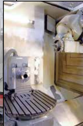
VIEW OF DMG DECKEL MAHO WORK ENVELOPE

To discuss your requirements for an auction, please call Perfection Industrial +1-847-545-6374 or sales@perfectionindustrial.com