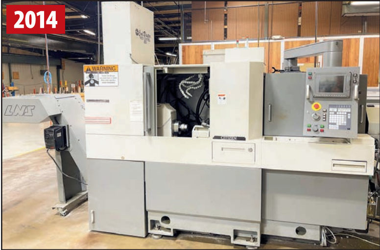
CITIZEN A32-2M7P CNC SWISS TYPE LATHE