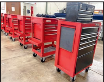
VIEW OF TOOL CHESTS