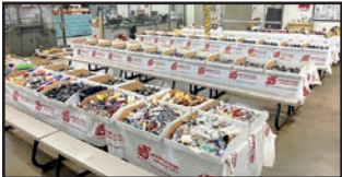
VIEW OF PERISHABLE TOOLING