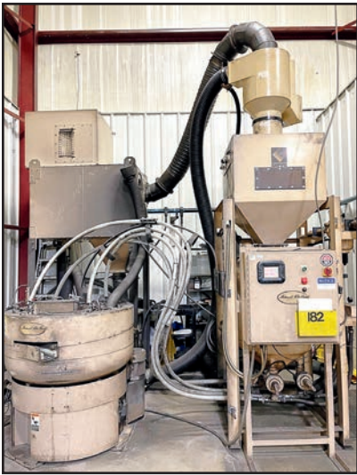
HAMMOND ROTO-FINISH SPIRA-BLAST VIBRATORY FINISHER