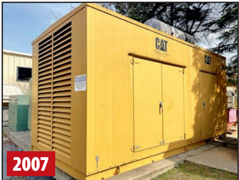
CATERPILLAR SR48 800 KW DIESEL GENERATOR

ALSO: (37) KENNEDY WOOD TOP WORK BENCHES, SPACEGUARD CUSTODIAL CAGE W/(2) 11'L WALLS OF FENCING, LOCKING DOOR, SHOP CABINET, WOOD RACK, CUSTODIAL CART, FOLDING GUARD WOV-N-WIRE CRIB FENCING, APPROX. 125' TOTAL LENGTH, SLIDING DOOR AND HINGE DOOR, FOLDING GUARD QWIK-FENCE 8' X 12' FENCING CELL W/LOCKING DOOR, LISTA CABINETS, RIDGID K-400 DRUM MACHINE, TOOL CHESTS, ROLLING SHOP AND STEP LADDERS, (23) DUMPING HOPPERS, POWER AND HAND TOOLS, SHOP FANS, PALLET JACKS, HAND TRUCKS, CONSUMABLES, GRINDING TABLES, JOHNSON BAR, AND MORE