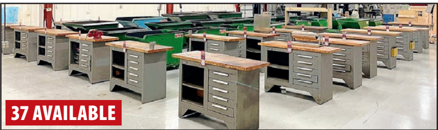
VIEW OF KENNEDY WORK BENCHES