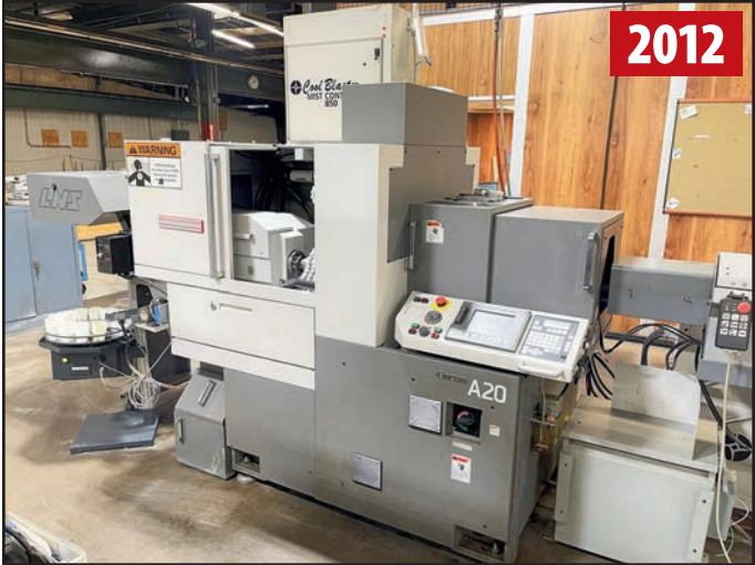
(1 OF 2) CITIZEN A20 VIPL CNC SWISS TYPE LATHES