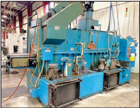
DUNNAGE PTU-1612EDRB 3 STAGE GAS PASS-THRU WASHER

HAMMOND ROTO-FINISH SPIRA-BLAST VIBRATORY FINISHING BLAST MILL, s/n NA, w/PLC Control, Approx. 36" Dia., EMPIRE Reclaim System and Dust Collector