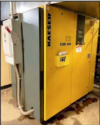
KAESER CSD100 100 HP ROTARY SCREW AIR COMPRESSOR

2007 CATERPILLAR SR48 800 KW DIESEL GENERATOR, s/n AFR01045, w/412 CAT Diesel Engine, 1,000 KVA