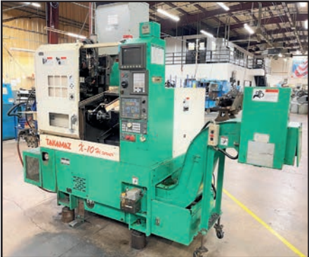
2000 TAKAMAZ X-10 HI SERVER CNC LATHE