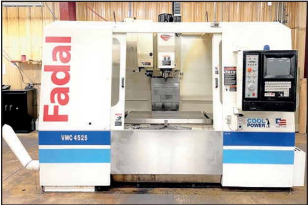
2002 FADAL 4525 CNC VERTICAL MACHINING CENTER

(10) BROTHER TC-S2A CNC TAPPING CENTERS, s/n Posted in Catalog, w/11.75" x 23.5" Table, Travels: X-18.9", Y-14.2", Z 10.6", 14-ATC, BT30 Taper, New as 2007, (3) Machines Equipped w/ YUKIWA YNC170L Rotary Tables (Sold Separately)