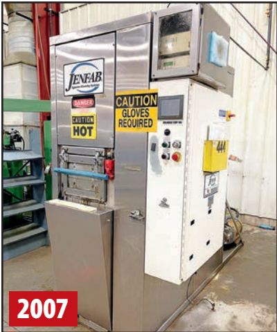
JENFAB STAINLESS STEEL AQUEOUS CLEANING SYSTEM

BUILD ALL CORP RT26 PARTS WASHER, s/n 89521735