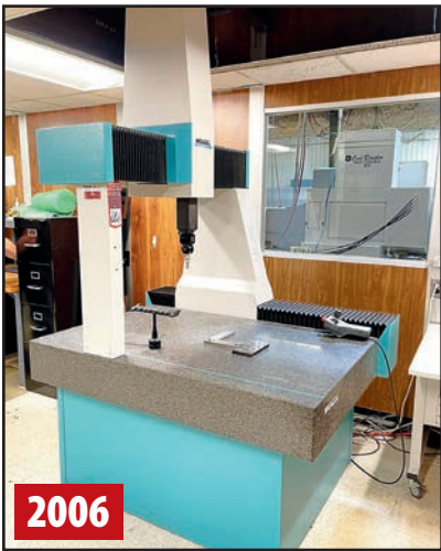
WENZEL LH65 CMM

2006 WENZEL LH65 CMM, s/n 064755, RENISHAW PH10M Probe and PHC 10-2 Probe Controller, Computer w/OPEN DMIS XSPECT Software and Dongle