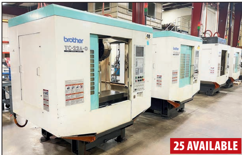
VIEW OF BROTHER CNC TAPPING CENTERS