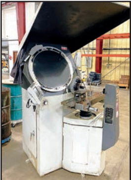
JONES & LAMSON CLASSIC 20 OPTICAL COMPARATOR

ALSO: (12) LEICA AND OLYMPUS MICROSCOPES, ASSORTED MICROMETERS, DROP INDICATORS, THREAD GAUGES, (35) BLACK AND PINK GRANITE SURFACE TABLES (VARIOUS DIMENSIONS), BENCH CENTERS, HEIGHT GAUGES, GAUGE BLOCKS, PIN GAUGES