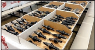
VIEW OF TOOL HOLDERS