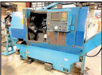
MIYANO JNC 45 TURNING CENTER

2014 CITIZEN A32-2M7P CNC SWISS TYPE LATHE, s/n V25198, w/COOL BLASTER CB2 Chiller and 850 Mist Control System, LNS Turbo HB Chip Conveyor, 2014 EDGE C-332 Bar Feed, s/n C2201425215, NOTE: Sold Separately