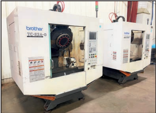
(2 OF 10) BROTHER TC-S2A-O CNC TAPPING CENTERS