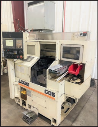
2003 TECNO WASINO G05 GANG STYLE TURNING CENTER

Pre-Auction Offers Invited on Major Assets