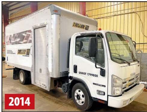
ISUZU NPR-HD DIESEL CABOVER BOX TRUCK