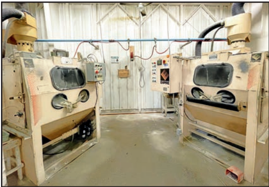
(2) EMPIRE BLAST SYSTEMS