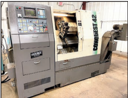
HARDINGE CONQUEST CS-42 TURNING CENTER