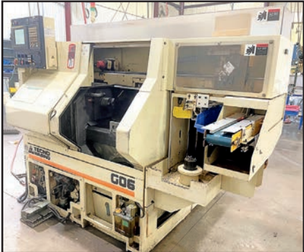
2004 TECNO WASINO G06 GANG STYLE TURNING CENTER