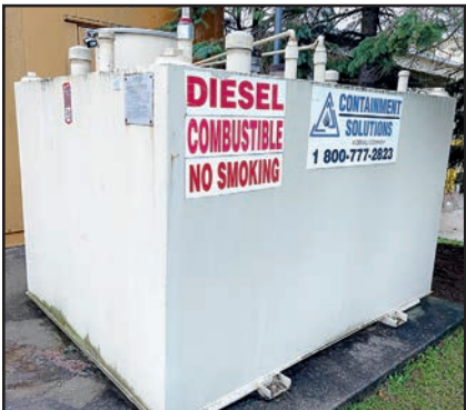
CONTAINMENT SOLUTIONS 1,000-GALLON DIESEL TANK