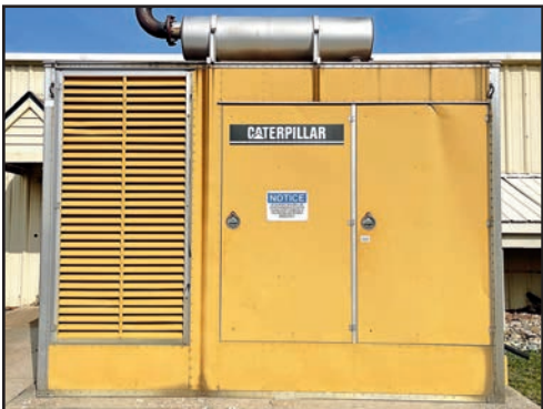
CATERPILLAR EMCP 350 KW DIESEL GENERATOR