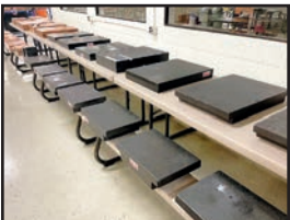
VIEW OF GRANITE SURFACE PLATES