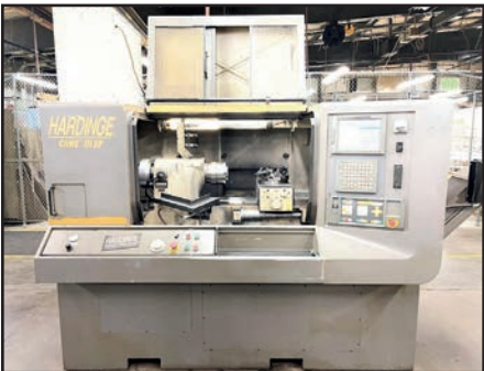
HARDINGE CHNC IIISP CNC LATHE