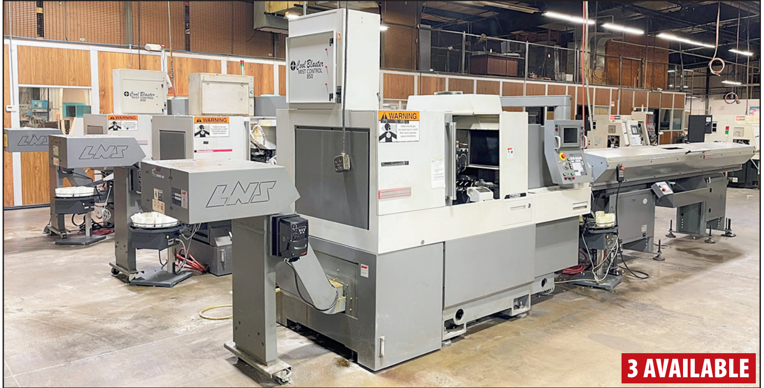
VIEW OF CITIZEN CNC SWISS TYPE LATHES

FEATURING: (3) CITIZEN CINCOM Automatic Lathes, (25) BROTHER Drilling & Tapping Centers, (10+) MAZAK, TECNO WASINO, TAKAMAZ, HARDINGE & MIYANO Turning Centers, FADAL 4525 VMC, 2014 ENGIS 1416 Bore Finishing & Honing System, STUDER S20 CNC Grinder, Blast Cabinets, Bandsaws, Tool Room, Inspection/QA & Plant Support