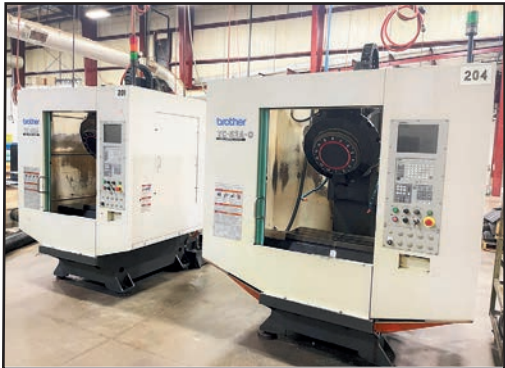
(2 OF 10) BROTHER TC-S2A-O CNC TAPPING CENTERS