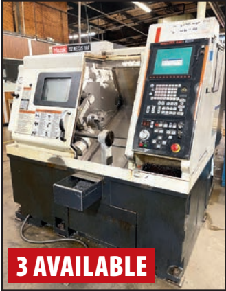
2004 MAZAK QUICK TURN NEXUS 100 TURNING CENTER

Pre-Auction Offers Invited on Major Assets