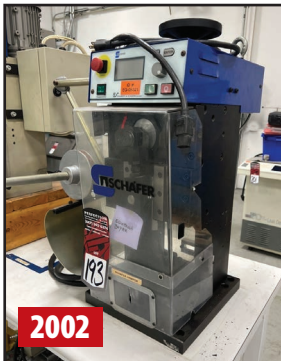
SCHAFAER ESP 2001 CRIMP PRESS