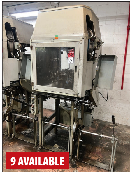
WARDWELL 16-C WIRE BRAIDER