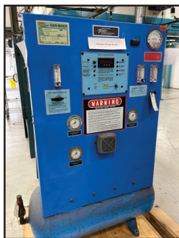
THERMCO 8300HN50-80AN1100 GAS MIXER