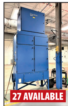
DONALDSON TORIT DUST COLLECTOR