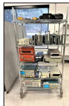
VIEW OF TEST EQUIPMENT

For auction inquiries, please contact Jennifer Reiner at (847) 545-6374 or jennifer@perfectionindustrial.com