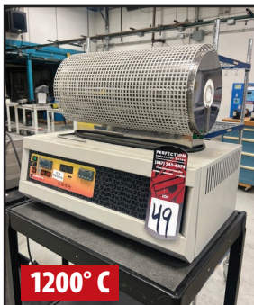
CARBOLITE TYPE TZF 12/38.400 TUBE FURNACE