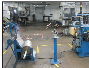
(1 OF 3) STERLING DAVIS ELECTRIC CRS-30 30" RESPOOLER