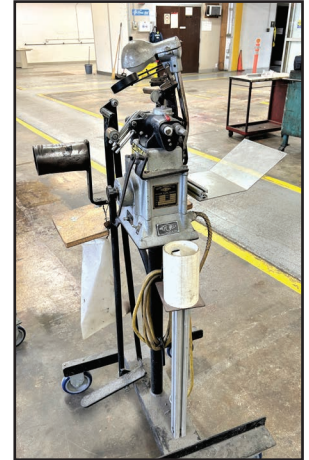
(1 OF 3) MICRO E1S BUTT WELDER