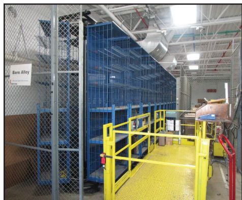
(1 OF 2) PARTS STORAGE CAROUSELS