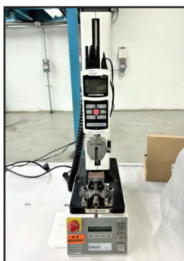
MARK 10 ESM 301 PULL TESTER

ALSO: FLUKE, BK PRECISION, TEKTRONIX, AGILENT, KEITHLEY, etc. Test Equipment, MACBETH Densitometer, Microscope, etc.