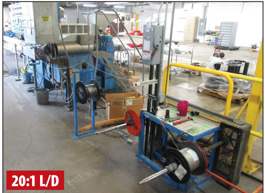
ROYLE 2" TEFLON EXTRUSION LINE

https://perfection.global/thermocouple-wire