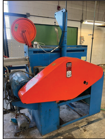
DAVIS STANDARD A4247 16" DUAL WHEEL CAPSTAN (EXTRUSION LINE)