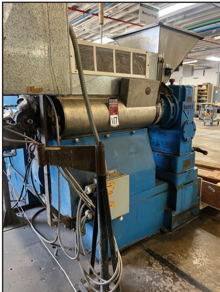
ROYLE 2" 20:1 L/D TEFLON EXTRUDER (EXTRUSION LINE)