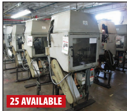
WARDWELL 16-C WIRE/FIBERGLASS/YARN BRAIDERS