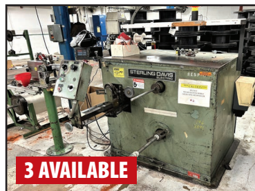
STERLING DAVIS ELECTRIC CRS-30 30" RESPOOLER