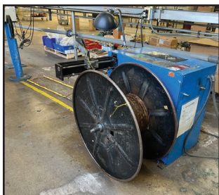
30" TAKE-UP (EXTRUSION LINE)