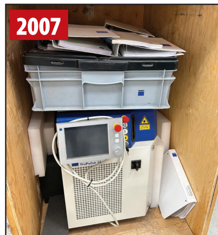
TRUMPF TRUPULSE 44 LASER