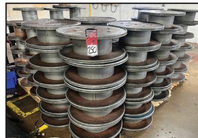
HUGE QUANTITY OF REELS & SPOOLS