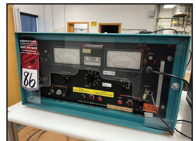
HIPOTRONICS HD100 HIPOT TESTER