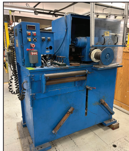
RMG D9941 SPCL 6 COIL STRAIGHTENER