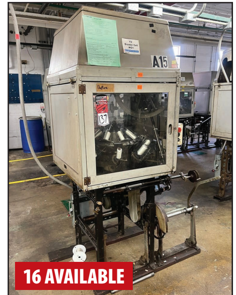
WARDWELL 16-C TEXTILE BRAIDER