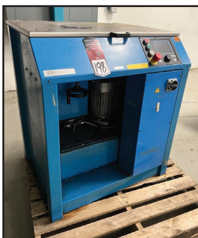
FINN-POWER NC201S NUT & CABLE CRIMPER

ALSO: WHITE Storage Parts Carousel, (27) Assorted DONALDSON TORIT Dust Collectors, LISTA Cabinets and Work Benches, Pallet Trucks, Ultrasonic Washers, Double Head Grinder/Buffers, Shot Blast Cabinets, Gaylord Tilters, Ladders, Racking, Storage Cabinets, Ice Makers, Power Supplies, and more