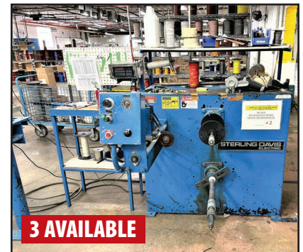
STERLING DAVIS ELECTRIC CRS-30 30" RESPOOLER

FEATURING: 250 + Lots including 2" Teflon Extrusion Line, (25) WARDWELL 16-C Braiders + Parts, (3) STERLING DAVIS 30" Respoolers, Butt Welders, Crimp Presses, TRUMPF TruPulse 44 Laser - NEW, NEVER USED, RMG Coil Straightener, Lab/Metallurgical Equipment, Parts Carousels, Mezzanines, 200+ Reel & Spools & more