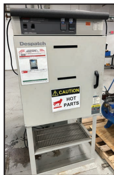
DESPATCH LBB1-43B-1 LAB OVEN