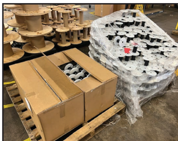
(900+) CARRIS 5" DIA. PLASTIC SPOOLS

(32) 10.5" DIA. X 11" ID (12" OAW) X 3.5" BARREL X 3/4" ARBOR HOLE, Plywood w/Cardboard Barrel Spools