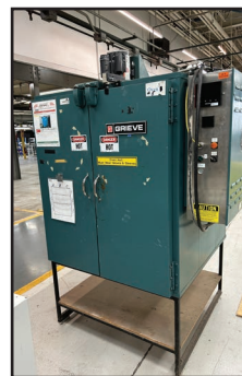
GRIEVE 333 ELECTRIC OVEN