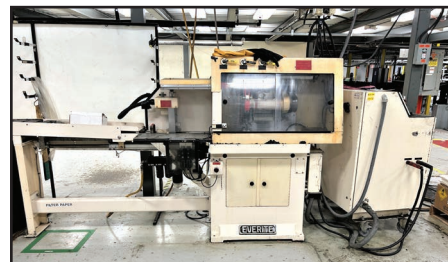
EVERITE TC10 ELECTROCHEMICAL TUBE CUTTER

PRE-AUCTION OFFERS INVITED ON MAJOR ASSETS