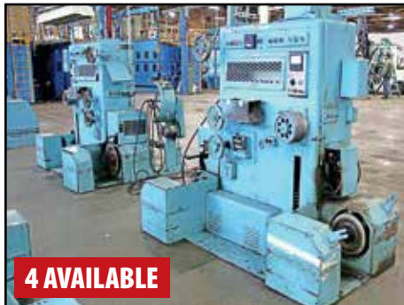
ECCC 20" H.S. REWINDERS