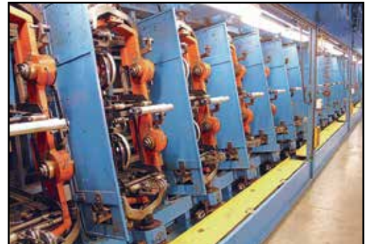
CORTINOVIS INSIDE VIEW