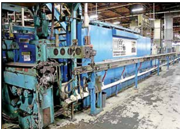
TANDEM INSULATING LINE #9