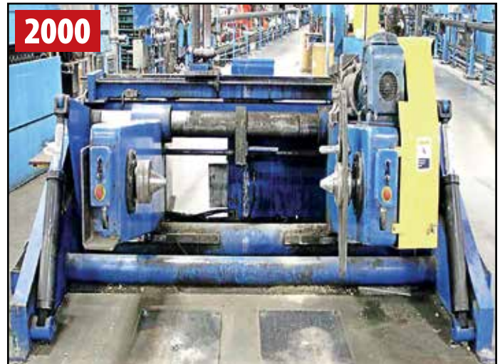
2000 BARTELL SLTUX84-1262-RH 84" SHAFTLESS TAKE-UP