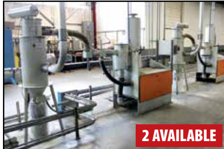
2006 PROCESS CONTROLS RDJEEGFDXU VACUUMS