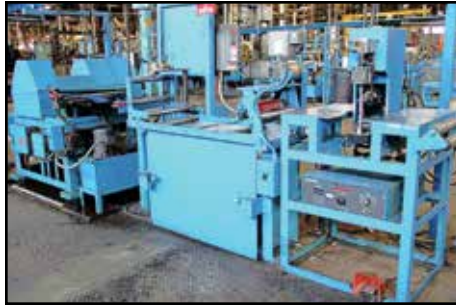
SONOBOND FC2015 WELDER, ACCUMULATOR AND CORRUGATOR