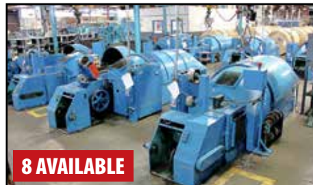
EECC 20" D.T. TWINNERS