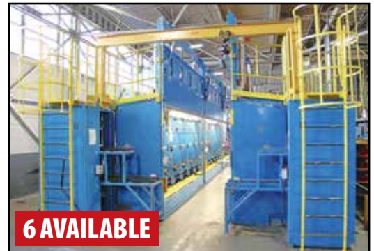
CORTINOVIS TTS 25-PAIR GROUP TWINNERS