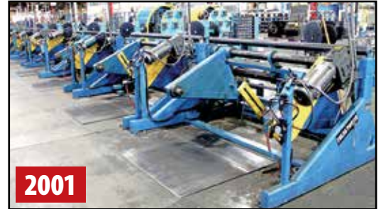
(8) TULSA FSPO5 POWERED PAYOFFS