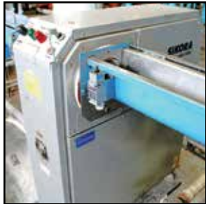
SIKORA 2120 X-RAY UNIT