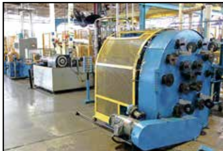
OSCILLATOR, JELLY FILL TANK, (2) BINDER HEADS

CEEEO 72" FORK TYPE ROTATING CABLER , w>Loading Platform, (8) 2001 Tulsa FSPO5 60" x 5,000 LB Powered Payoffs w/Dancers, Turn Sheaves, Guide Stands, Oscillator, Jelly Fill Tank, (2) Binder Heads, Counter, Operator Console.