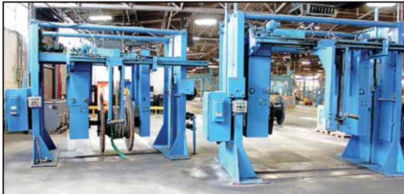
(2) STERLING/DAVIS ELECTRIC 96" GANTRY TAKE-UPS