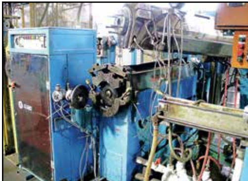
DAVIS STANDARD 2.5" EXTRUDER AND GENCA CO-EXTRUDER