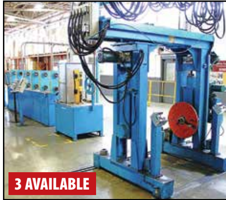
CORTINOVIS 60" TRAVERSING REEL TAKE-UP