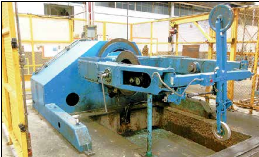
CEEEO 72" FORK TYPE ROTATING CABLER

Inspection: Wednesday, March 4, 2015 from 9:00 AM to 4:00 PM & by Appointment