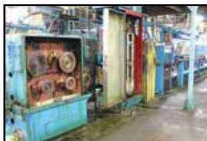
VAUGHN 3C 17-DIE WIRE DRAWER AND VAUGHN ANNEALER