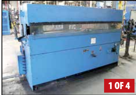
MGS LC50.4D 50" CATERPULLER CAPSTAN