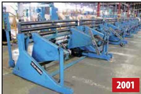
(7) TULSA FSPO5 POWERED PAYOFFS