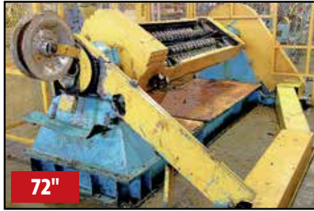
ROTATING CATERPULLER CAPSTAN (ON 96" CABLER LINE)

CEEEO 96" FORK TYPE ROTATING CABLER , w>Loading Platform, (7) 2001 Tulsa FSPO5 60" x 5,000 LB Powered Payoffs w/Dancers, (9) Ceeco 60" Powered Payoffs w/Dancers, (2) 60" Payoffs, 72" Rotating Caterpuller Capstan, Turn Sheaves, Guide Stands, (2) Oscillators, Jelly Fill Tank, (2) Binder Heads, Operator Console, Counter.