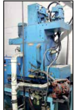
ALFA LAVAL MICRO SEPARATOR