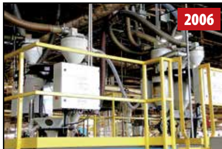
PROCESS CONTROL XL SERIES GRAVIMETRIC BLENDER