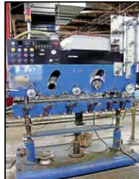
TAYMER HF2000 HOT FOIL PRINTER

4.5" JACKET EXT LINE , L-R (Ref. #4) w/(2) MGS POSL84 84" Shaftless Payoffs, Mylar Tape Accumulator, (2) 2-Position 20" Payoffs, (1) 12-Position 20" Payoff, Double Binder Head, (2) Corrugator Systems, Davis Standard 45T 4.5" 20:1 L/D Extruder, Taymer HF2000 Hot Foil Printer, Beta Counter, MGS LC50.4D 50" Caterpuller Capstan, Spark Tester, 2000 Bartell SLTUX84-1262-RH 84" Shaftless Take-Up.