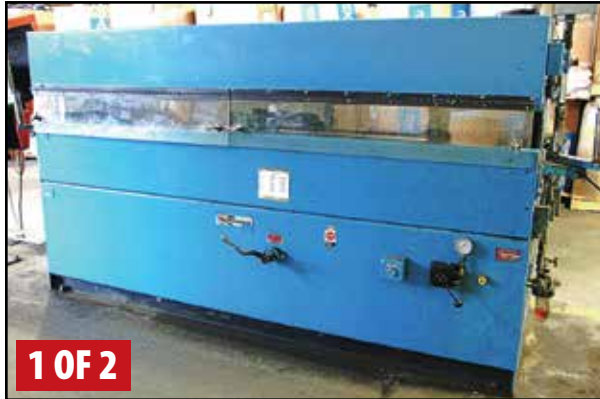
MGS 72" CATERPULLER CAPSTAN