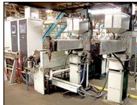
TANDEM EXTRUDER LINE #16

View our current auction schedule at www.perfectionindustrial.com To discuss your requirements for an auction, please call Perfection Industrial 847.427.3333