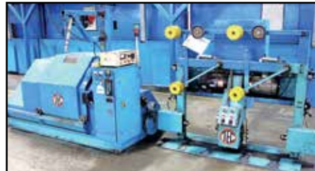
TEC 22DTCA2-400-1 D.T. CABLER

(8) EECC 20" D.T. TWINNERS W/24" TAKE-UPS , Motors (Inside/Outside Twinners).