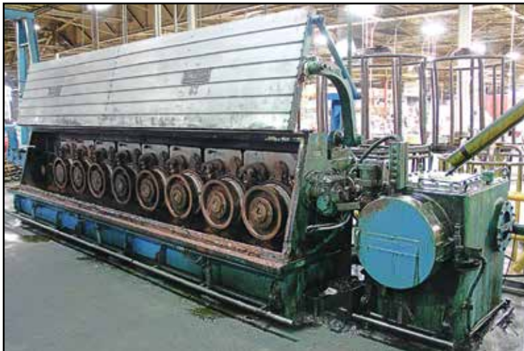
VAUGHN 10DMT 10-DIE ROD BREAKDOWN DRAWER

OVER 500 LOTS OFFERED: MAILLEFER INSULATION LINE W/EKP50 DUAL REEL TAKE-UP, (9) TANDEM INSULATION LINES W/EKP50 DUAL REEL TAKE-UPS, (6) CORTINOVIS 500MM GROUP TWINNERS, VAUGHN 10DMT ROD BREAKDOWN MILL, ESSEX HERMAN ROD BREAKDOWN MILL, SAMP TR/2-TP-2 DRAWER/ANNEALER, CEEEO 96" FORK TYPE CLOSING LINE, CEEEO 72" FORK TYPE CLOSING LINE, (6) 6" & 4.5" JACKET EXTRUSION LINES, 24-WIRE 48" RIGID CABLER LINE PLUS: BARTELL, TULSA, CORTINOVIS, ROYLE 60", 84", 96" PAYOFFS & TAKE-UPS, MGS & BARTELL 50", 72" CATERPULLER CAPSTANS, DCM TEST SETS, TEC & EEC TWINNERS, REPAIR & REWIND LINES, SZ TWISTERS, ENDEX DOWNCOILER, COMPOUND HANDLING EQUIPMENT, FILTRATION EQUIPMENT