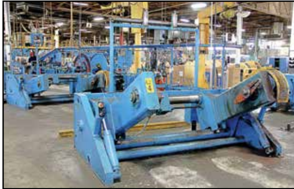
(2) MGS POSL84 84" SHAFTLESS PAYOFFS