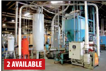
2006 PROCESS CONTROLS VF15ZNDPU MASTER BATCH PUMP