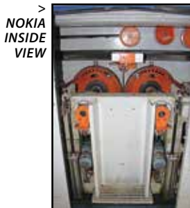
NOKIA INSIDE VIEW