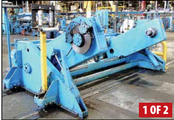
BARTELL 96" SHAFTLESS PAYOFFS