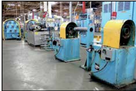
(2) OSCILLATORS, JELLY FILL TANK, (2) BINDER HEADS