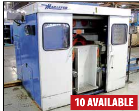
NOKIA EKP50 PARALLEL AXIS DUAL REEL TAKE-UP