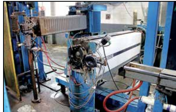
MAILLEFER BM45-20D AND BMUS80-24D EXTRUDERS