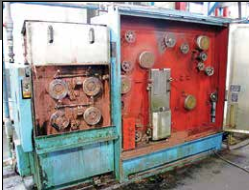
NIEHOFF WIRE DRAWER AND RDA200.1.R.1350 ANNEALER

TANDEM EXTRUDER LINE #16 , w/NO Wire Drawer, 16" x 8-Groove Dual Wheel Capstan, Guide Wheel, Dancer, Maillefer BM80 24D Extruder, Conair GBM40 Loader, (2) 1994 Maillefer BM45 20D Extruders, Premier Pro Rate Hopper Loader and 5215-11 Inline Filter Assembly, Temp Panel (Upgraded) w/Yokogawa Touch Screen, 50' Maillefer OU460 S.S. Water Trough w/Capacitance Probe, Beta Capscan 2000 Capstan, Air Wipes, Clinton Arc Spark Tester, Nextrom EKP50 Parallel Axis Dual Reel Take-Up.