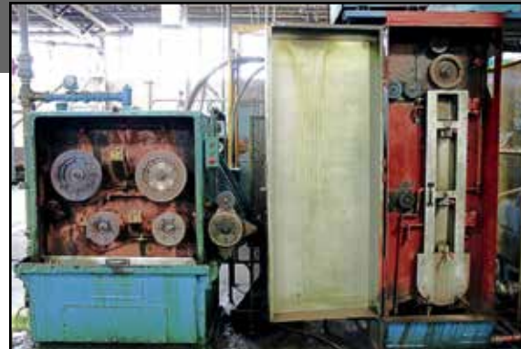
VAUGHN 3B 14-DIE WIRE DRAWER AND SYNCRO C3 ANNEALER