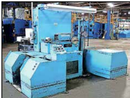
ECCC 20" H.S. REWINDERS