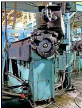
DAVIS STANDARD 2.5" EXTRUDER AND MAILLEFER BM45