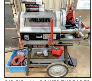
RIDGID 1224 POWER THREADER