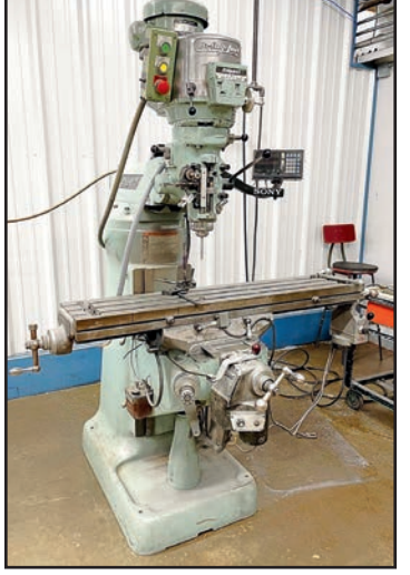
BRIDGEPORT 2 HP VERTICAL MILL

ALSO: AVEY 2VSA 4-SPINDLE GANG DRILL, s/n A89060; ROCKWELL 17-540 DRILL PRESS, s/n 35L790288; DELTA DP300L DRILL PRESS, s/n 2010 34-XL 017163; DELTA 20-400 DRILL PRESS, s/n 1364246; ROCKWELL 17-600 DRILL PRESS, s/n 1775537; DOALL 3613-20 VERTICAL BANDSAW, s/n 399-80257; DOALL ZV-3620 VERTICAL BANDSAW, s/n 265-82243; DOALL ZW-3614-1H3 VERTICAL BANDSAW, s/n 266-79244; (2) ROCKWELL 28-3X5 VERTICAL BANDSAWS, s/n 1750595, 1802519; PEERLESS HVC-20P VERTICAL VERTICAL BANDSAW, s/n 1121618; DOALL C-916 HORIZONTAL BANDSAW, s/n 438-84196; (2) DEWALT 3571 20" RADIAL ARM SAWS, s/n 82080040, 78320034; DEWALT 3558 20" RADIAL ARM SAW, s/n 83140013; POWERMATIC 72A TILTING ARBOR TABLE SAW, s/n 9372087; WILTON 4421 DISC SANDER GRINDER, s/n 09362; ROCKWELL 86-044 DISC SANDER GRINDER, s/n CA143TTFR7046ADW; POWERMATIC DISC GRINDER; OKAMOTO GRINDER; RIDGID 1224 PIPE THREADER, s/n EB13191J97; (3) CHICAGO PNEUMATIC CA-450 COMPRESSION RIVETERS, s/n H-649327, H-959411, H-695959; CHICAGO PNEUMATIC CP-625 COMPRESSION RIVETER; MARCHANT 6FG SHRINKING AND STRETCHING MACHINE, s/n 109: STRETCHING MARCHANT 12F SHRINKING AND MACHINE, s/n 2; SO-LOW C80-27 ULTRA-LOW FREEZER, s/n 0607730; 2012 TRAVAINI PUMPS EVO 10M VACUUM PUMP, s/n 49364-11; MILLER GOLD STAR 302 STICK WELDER; MILLER SYNCROWAVE 300 TIG WELDER, s/n JE760795, MILLER BOBCAT 250 AC/DC ENGINE DRIVEN WELDER, s/n MA240202H; ALSO AVAILABLE: LARGE ASSORTMENT OF BENCH TOP DRILL PRESSES, PEDESTAL GRINDERS, AND MORE