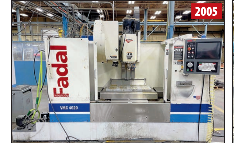
FADAL VMC4020 VERTICAL MACHINING CENTER