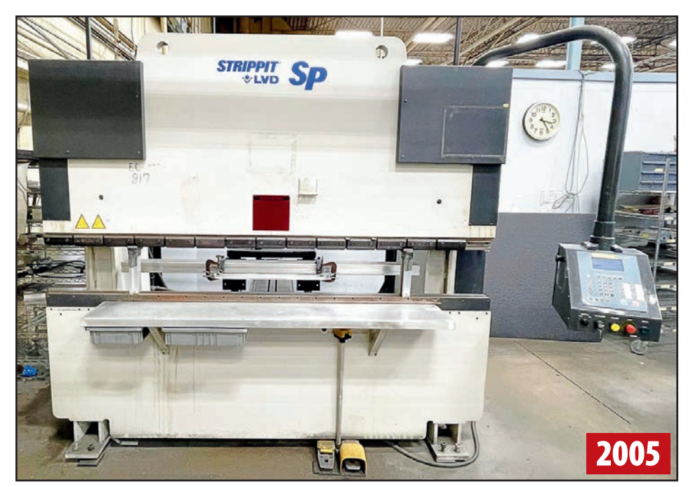
LVD STRIPPIT SP 8120 CNC HYDRAULIC PRESS BRAKE