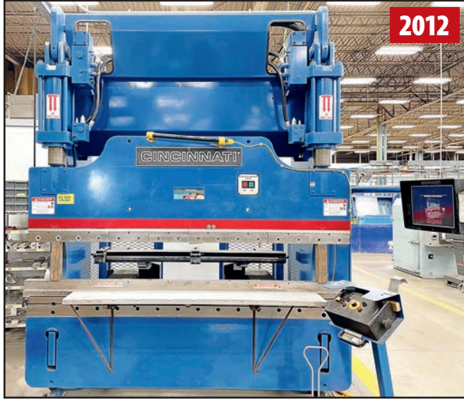
CINCINNATI 90PF6 90-TON CNC HYDRAULIC PRESS BRAKE