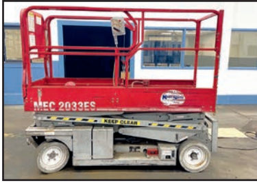
MEC 2033ES SCISSOR LIFT