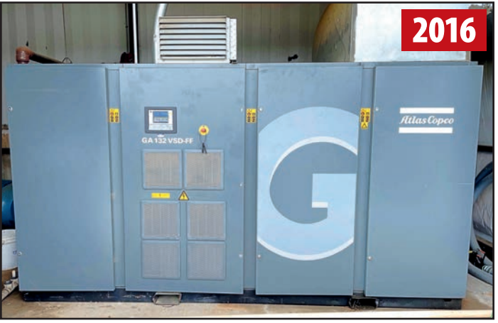
ATLAS COPCO GA132 VSD-FF 175 HP VARI-SPEED AIR COMPRESSOR