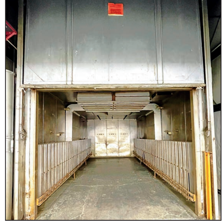
DESPATCH NATURAL GAS SPECIAL BATCH OVEN