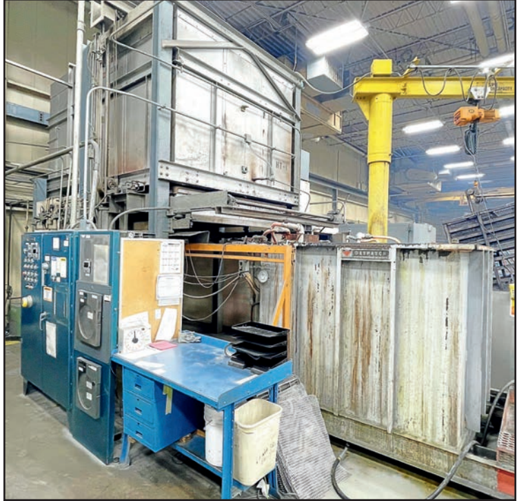
DESPATCH QUICK QUENCH FURNACE