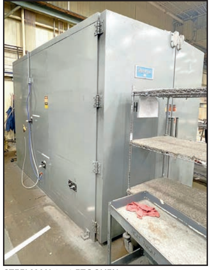
STEELMAN 6710 ETC OVEN