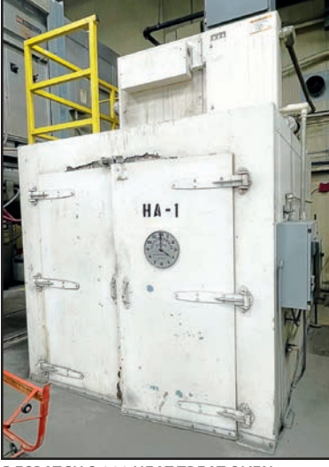
DESPATCH S-200 HEAT TREAT OVEN