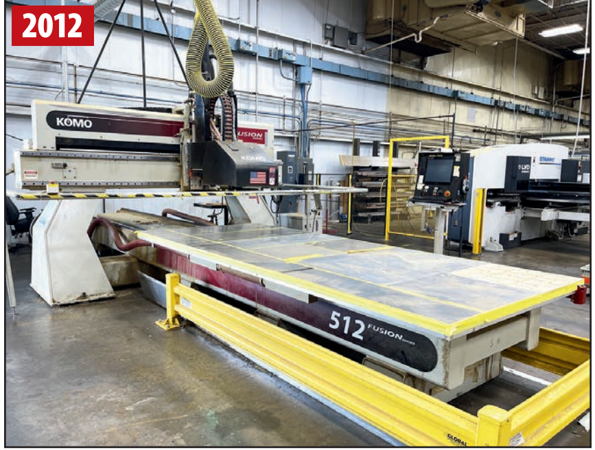
KOMO FUSION 512 5-AXIS CNC ROUTER