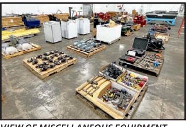
VIEW OF MISCELLANEOUS EQUIPMENT