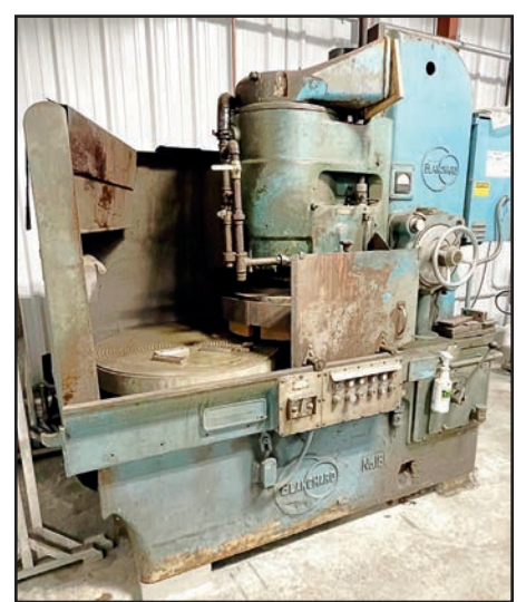
BLANCHARD NO. 18 GRINDER