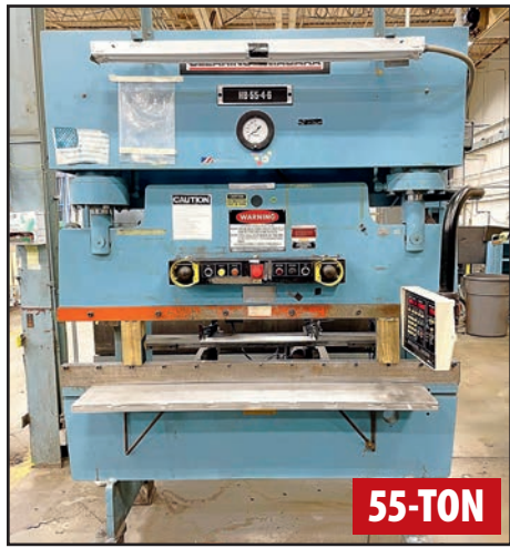
CLEARING NIAGARA HB 55-4-6 HYDRAULIC PRESS BRAKE