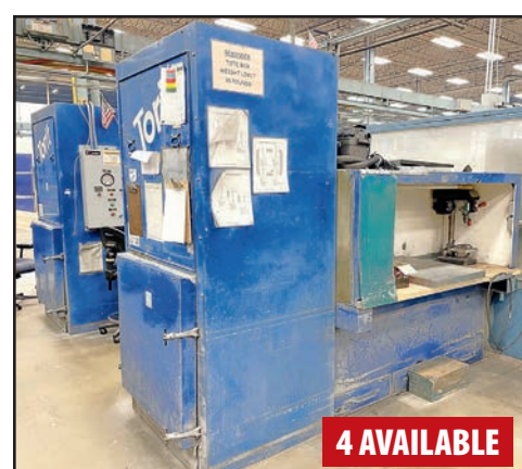
DONALDSON TORIT ECB-1