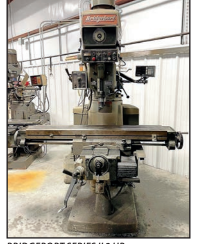
BRIDGEPORT SERIES II 2 HP