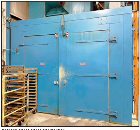
BINKS 11'X 11'X 11' OVEN