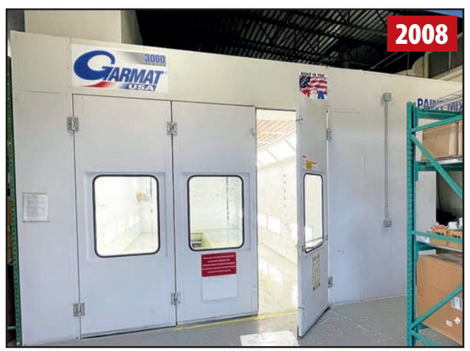
GARMAT 3000 SERIES MANUAL SPRAY ROOM

FILTER 1 DFF6-6-5WOOD DOWNDRAFT TABLE, s/n 01-44-104, ALSO: (3) VIBRATORY FINISHERS