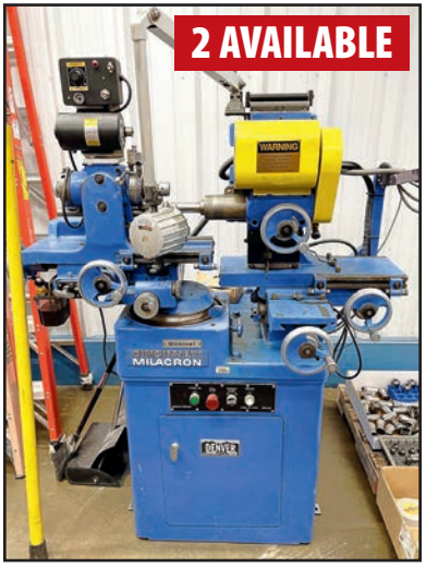
CINCINNATI MILACRON MT MONOSET TOOL AND CUTTER GRINDER