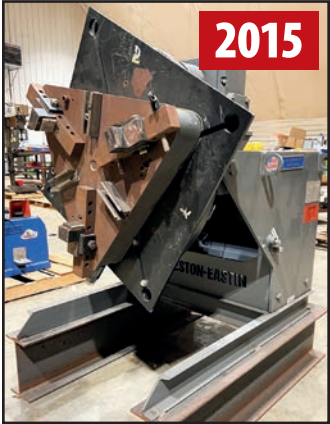
2015 PRESTON-EASTIN PE30HD 3,000 LB POSITIONER