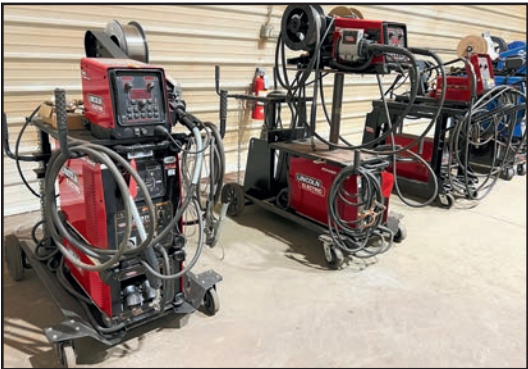
VIEW OF LINCOLN WELDERS

2005 MILLER DIMENSION 652 MULTI-PROCESS WELDER, w/LN-8 Multi-Process Wire Feed