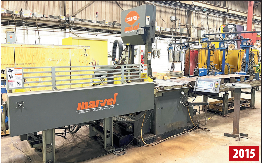
MARVEL AUTO VERTICAL TILT-FRAME BANDSAW

2019 AKYAPAK AHS 30/10 10' X .500" HYDRAULIC 4-ROLL PLATE BENDING ROLL, s/n SY300-211, w/PLC Control, 11.80" Top Roll, 10.62" Pinch Roll, 8.25" Side Rolls, 16 FPM Max. Rolling Speed