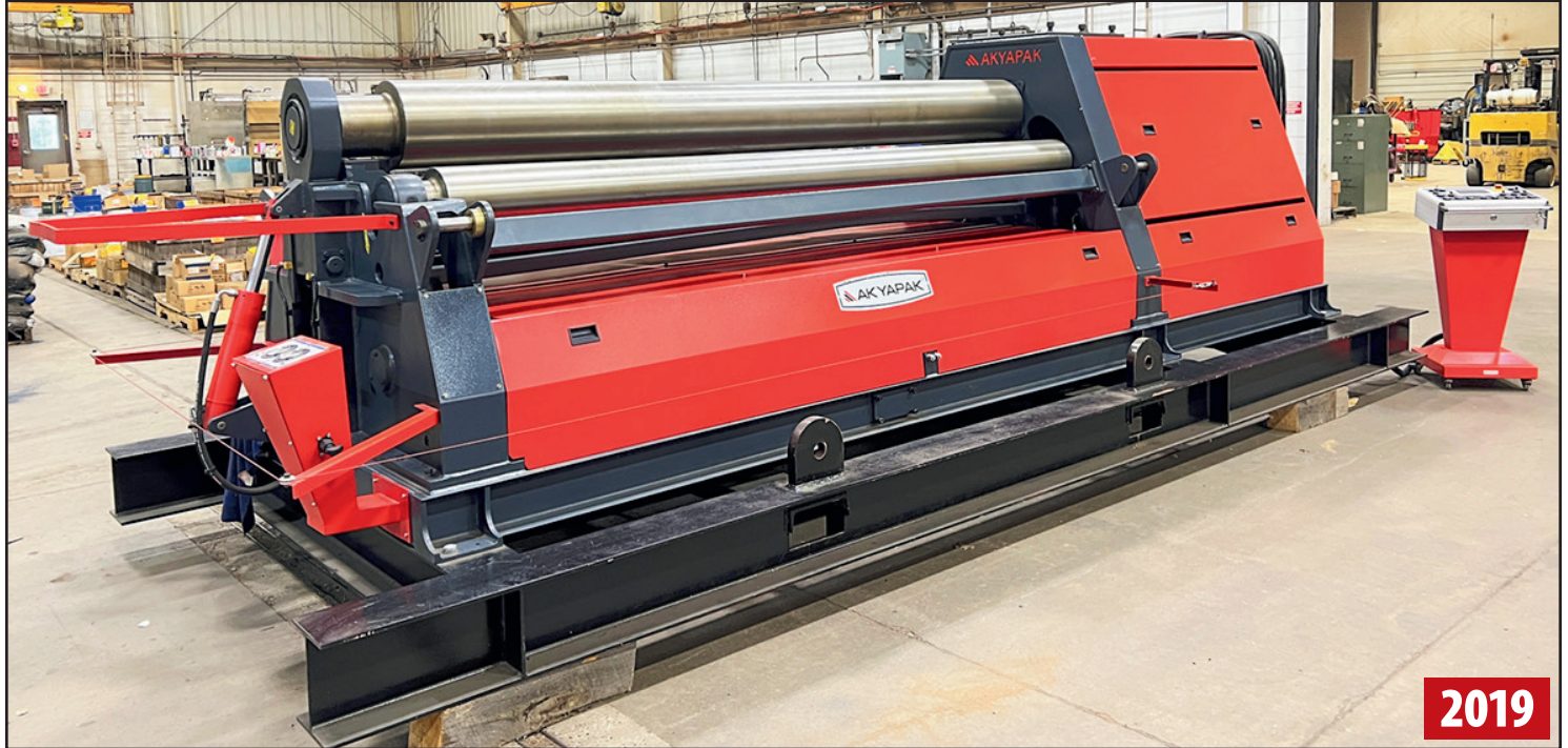
AKYAPAK 10' X .500" 4-ROLL PLATE BENDING ROLL

FEATURING: 2019 AKYAPAK AHS 30/10 Plate Bending Roll, 2015 MARVEL E2125PC3S Vertical Band Saw, 2015 EDWARDS E12015 Ironworker, YALE GDP360 Forklift, Large Selection of Welders & Welding Positioners, Turning Rolls, Pipe Bevelers, Shot Blast Booth w/Reclaim Unit, Paint Booth, Compressors, Electrical, New Cable Trays, Plant Support & More