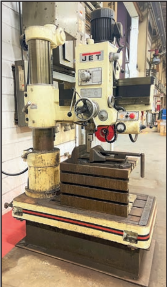
JET J-720R 3' RADIAL ARM DRILL