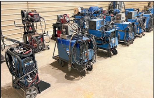
VIEW OF MILLER MIG WELDERS