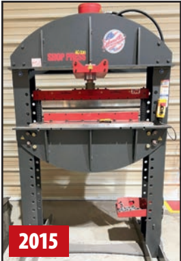
EDWARDS 40-TON SHOP PRESS

ELECTRO-MAGIC 1600 GRIME FIGHTER STEAM CLEANER, s/n NA