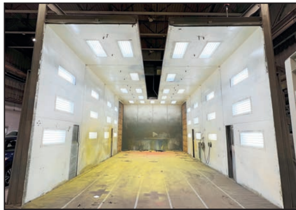
JB1 T-73-WPDT-S 44'L X 20'W X 15'6"H PAINT BOOTH