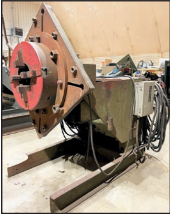
PANDJIRIS WELDMORE 30-6 3,000 LB POSITIONER