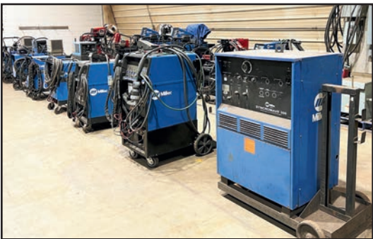
VIEW OF MILLER TIG WELDERS

LINCOLN POWER WAVE 355M MULTI-PROCESS WELDER, w/10M POWER FEED Wire Feed