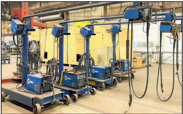
VIEW OF WELDER BOOM PLATFORM CARTS

THERMAL DYNAMICS PAK MASTER 100 XLP PLUS PLASMA CUTTER, s/n 00130083