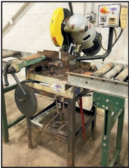
TOMET INDUSTRIES 14" MITERING COLD SAW