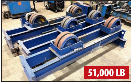
PANDJIRIS PR 50/17 TANK TURNING ROLLS