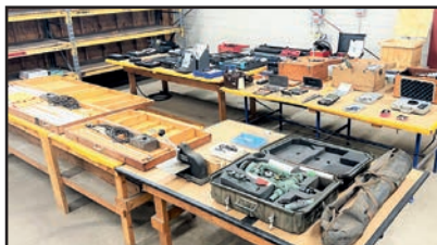
VIEW OF QA EQUIPMENT