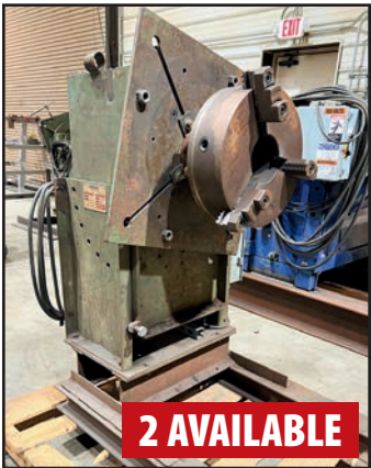
2 AVAILABLE PANDJIRIS BETA 12-5 1,250 LB POSITIONERS

MBC BP-2 200 LB WELDING POSITIONER, s/n 2855, w/12" Dia. Table, 6" 3-Jaw Chuck