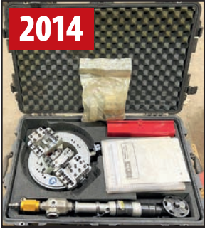
2014 FASTENAL EBA-12S CARBIDE BEVEL MATE