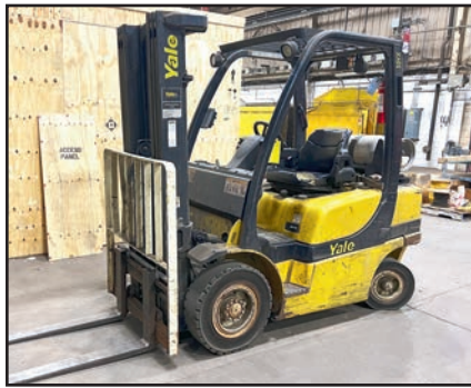
YALE GLP050VX 4,500 LB LP FORKLIFT