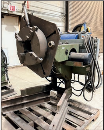
PANDJIRIS WELDMORE 10-4 1,000 LB POSITIONER