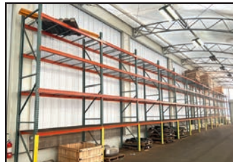
ADJUSTABLE PALLET RACKING

ALSO: ASSORTMENT OF FASTENERS, CABLE TRAY, WIRE SPOOLS, ELECTRICAL FITTINGS, LIQUATITE, BUSWAY SWITCHES, CABLE HEAT SHRINK, FUSES, CONTROLLERS, ELECTRICAL BOXES, MOTORS, STEEL WORK BENCHES, WELDING TABLES, DUMP HOPPERS, HAND TOOLS, POWER TOOLS, PNEUMATIC TOOLS, PIPE THREADERS, LADDERS, PALLET RACKING, STEEL WORK BENCHES, GATE VALVES, NYLON STRAPS, SHACKLES, CALDWELL 90-2-48 COIL HOOK, FORKLIFT BOOM ATTACHMENT, PLATE CLAMPS, SAFETY HARNESES, CHAIN BINDERS, HOISTS, FANS, SHOP LIGHTS, PALLET RACKING, MEYER X2206 AND X1604 AG TRAILERS, TITANIUM TUBING, VALVES, PARTS AND MORE