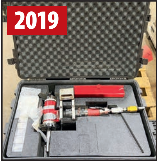
2019 EH WACHS SDB 103 PIPE BEVELER