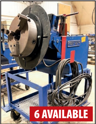
6 AVAILABLE PRESTON-EASTIN PA-5MT 500 LB POSITIONERS