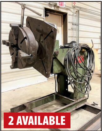
2 AVAILABLE PANDJIRIS WELDMORE 15-4 1,500 LB POSITIONERS