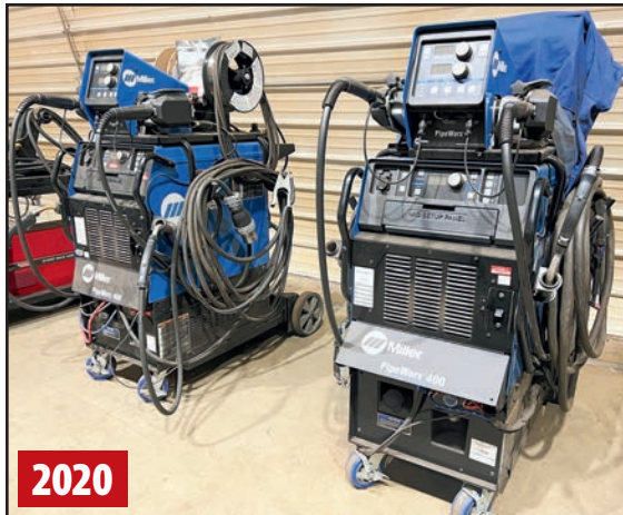
MILLER PIPEWORX 400 MULTI-PROCESS WELDER