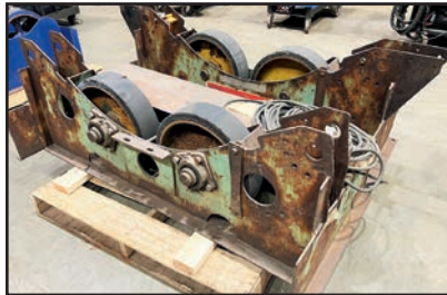
PANDJIRIS TANKER 150 15,000 LB TANK TURNING ROLLS