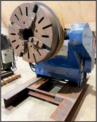
WORTHINGTON 3,000 LB POSITIONER