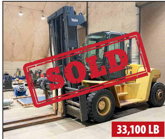
YALE GDP360 33,100 LB DIESEL FORKLIFT