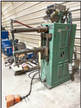
PEER 50 KVA SPOT WELDER

2020 MILLER PIPEWORX 400 MULTI-PROCESS WELDER, w/PipeWorx Wire Feed