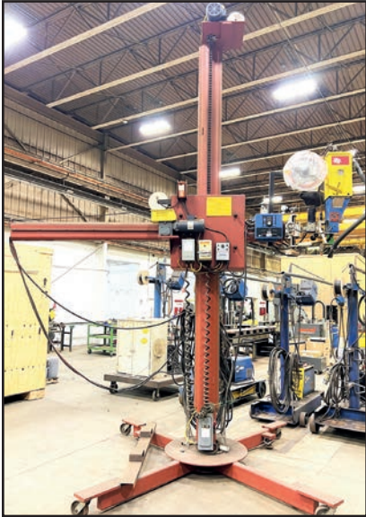
NORTHERN WELDING SUB ARC WELDING SYSTEM

PROMOTECH BM-20 BEVELING MACHINE 2012 EH WACHS 60-AIR-06 LOW CLEARANCE SPLIT FRAME KIT, s/n 2399