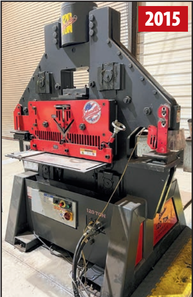
EDWARDS 120-TON IRONWORKER