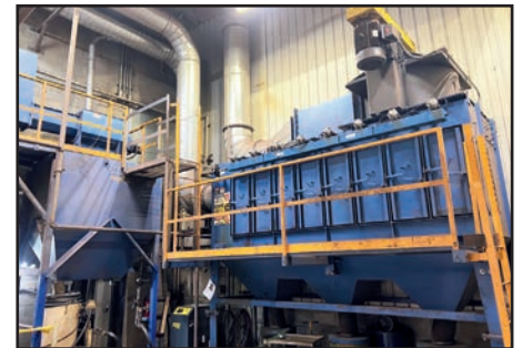
BLAST ROOM RECLAIM AND DUST COLLECTOR SYSTEM

LARGE SELECTION OF WELDING TABLES , Assorted Wire Feeds, Coolers, Welding Curtains, Guns, Tips, Foot Pedals, Stick, TIG Kits, Torch Carts, Regulators, Track Torches, Claps Abrasives, Face Mask and Shields, Protective Clothing, Etc.