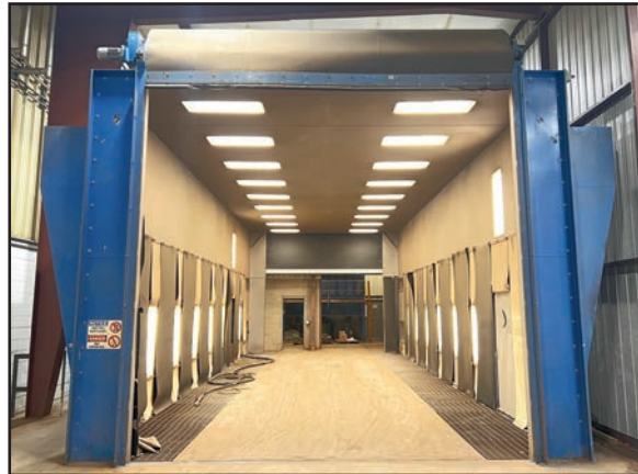
USF DE0000TB 45'L X 20'W X 16'H BLAST ROOM