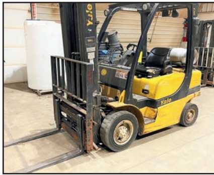
YALE GLP050VX 4,500 LB LP FORKLIFT