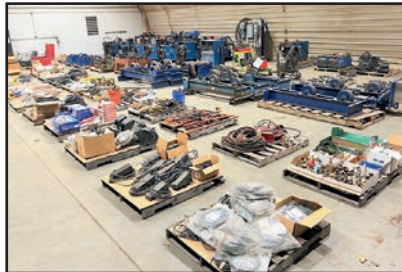
VIEW OF WELDING CONSUMABLES AND SUPPLIES