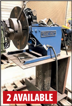
2 AVAILABLE PRESTON-EASTIN PA-2MT 250 LB POSITIONERS