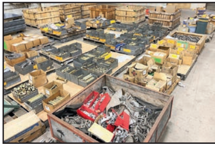
VIEW OF HARDWARE AND CONSUMABLES