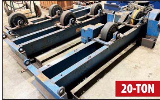
JOE FULLER JFRD-20/ JFRI-20 TANK TURNING ROLLS