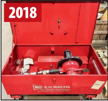
2018 EH WACHS SPEEDPREP SDB 412/2 PNEUMATIC PIPE BEVELER