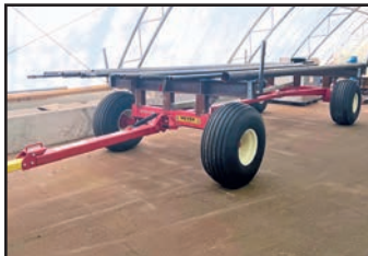
MEYER X1604 FARM WAGON