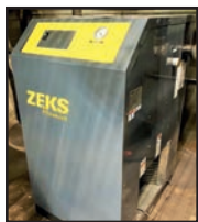
ZEKS PNA500A400 REFRIGERATED AIR DRYER

ARROW A-250-4 REFRIGERATED AIR DRYER , s/n VA301