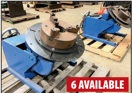
6 AVAILABLE PRESTON-EASTIN PA-5MT 500 LB POSITIONERS