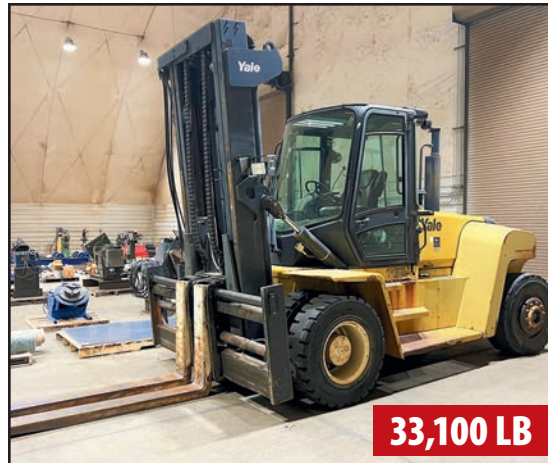
YALE GDP360 33,100 LB DIESEL FORKLIFT