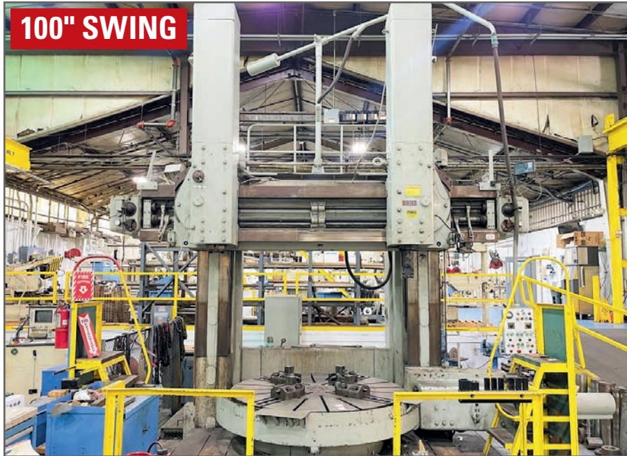
VULCAN RAFAMET KCF 200 VERTICAL BORING MILL