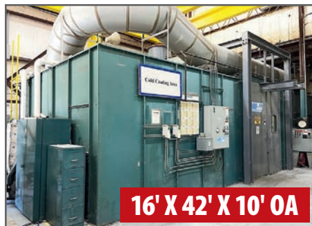
JB I DUAL ROOM PAINT SPRAY BOOTH SYSTEM