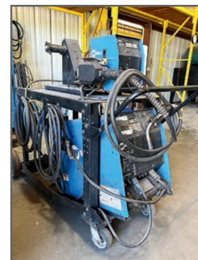
MILLER MAXTRON 450 ARC WELDER