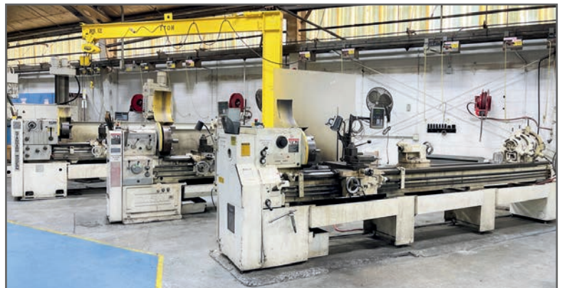
VIEW OF (3) ENGINE LATHES