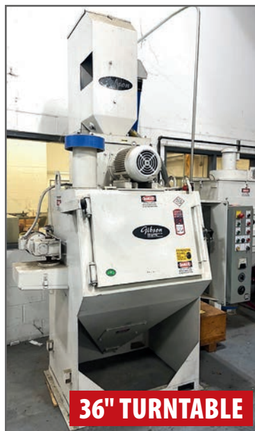
GIBSON SHOT BLAST SYSTEM