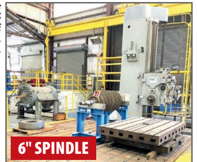
GIDDINGS & LEWIS FLOOR-TYPE HORIZONTAL BORING MILL