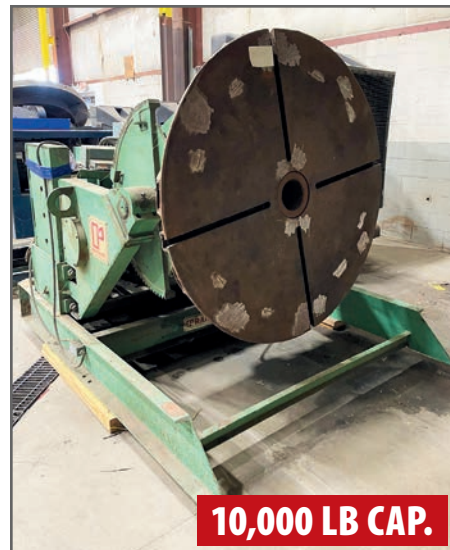
RANSOME 50PA WELDING POSITIONER