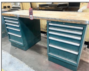
LISTA WOOD TOP WORK BENCH