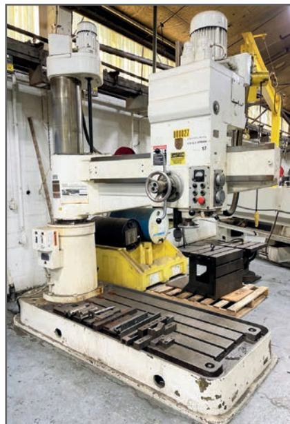
STANKO 2M55 RADIAL ARM DRILL