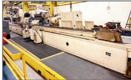
CINCINNATI 22" X 180" PLAIN CYLINDRICAL GRINDER