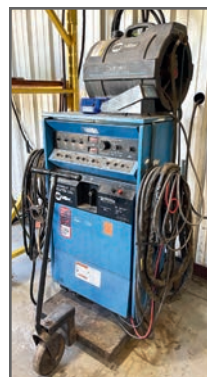
MILLER SYNCROWAVE 351 ARC WELDER

Pre-Auction Offers Invited on Major Assets