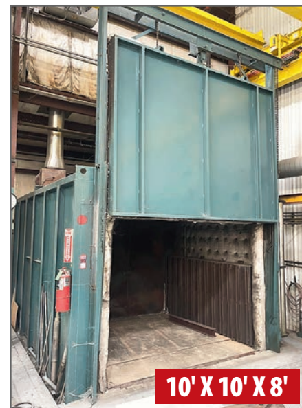
ADVANCED DESIGN CONCEPTS NATURAL GAS FURNACE