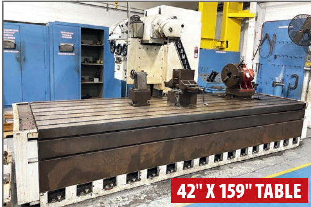
BUTLER CS10 ELGAMILL BED MILL