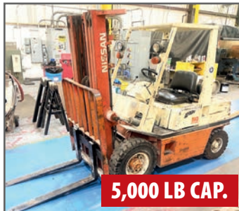
NISSAN 50 LP FORKLIFT