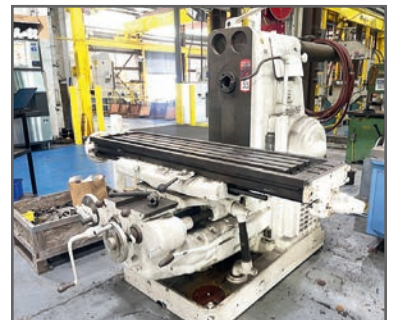
MILWAUKEE/K & T NO. 3K UNIVERSAL HORIZONTAL MILL

SALE DATE Tuesday, June 15 at 10:00 AM CT