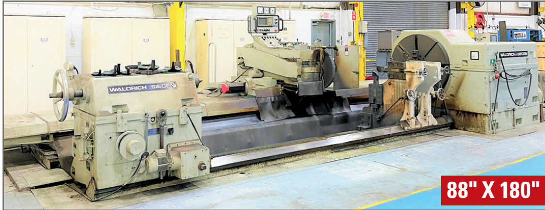
WALDRICH CNC CYLINDRICAL GRINDER