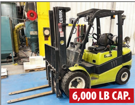
CLARK C30L LP FORKLIFT