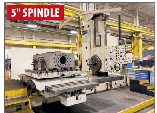
WMM HECKERT UNION BFT130/5 HORIZONTAL BORING MILL