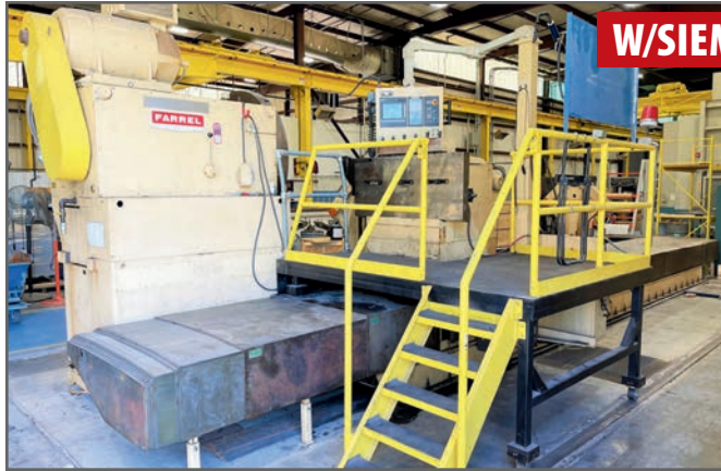
FARREL 118" X 310" CNC LATHE