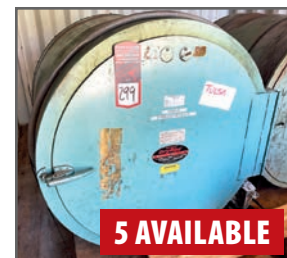
PHOENIX DRYROD ELECTRODE STABILIZING OVEN

ALSO: (5) PHOENIX DRYROD ELECTRODE STABILIZING OVENS, 550 DEG. MAX. TEMP., BERNARD 2000 SERIES AND 6500SS COOLERS, ESAB PERFORMANCE ALLOYS, PHOENIX AND KOBELCO WELDING WIRE, GAGES, GROUND CLAMPS, TIPS, AND OXY/ACETYLENE HOSE, WELDING TABLES AND MORE