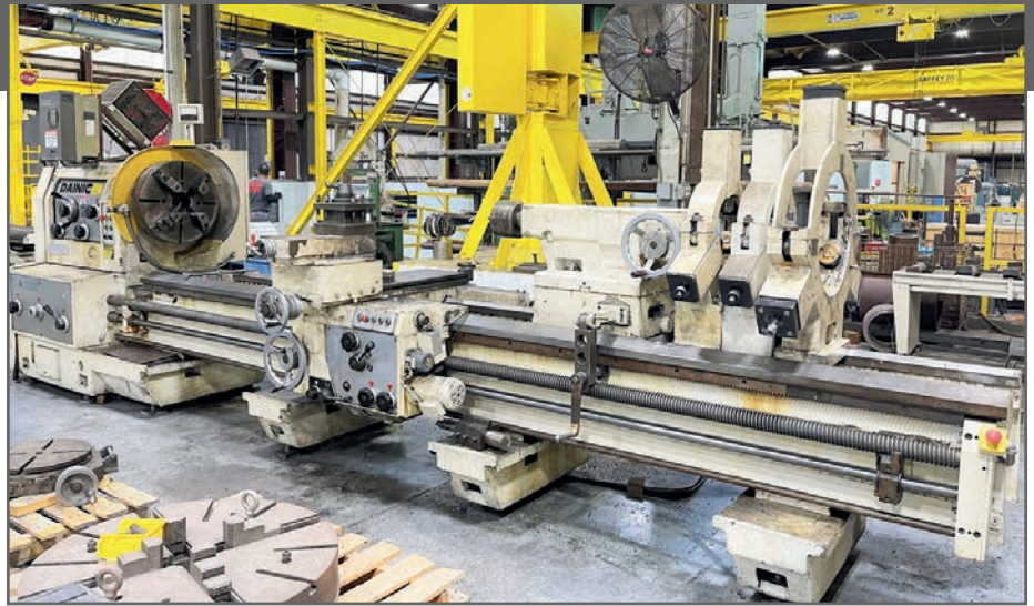
DAINICHI 35" X 236" ENGINE LATHE

LEBLOND REGAL 13E 20" X 164" ENGINE LATHE , s/n 13E-279, 3" Hole, 15" 4-Jaw Chuck, ALORIS Tool Post, Taper, Steady Rests, DRO