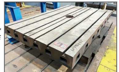
60" X 96" X 8.5" ROTARY TABLE

To discuss your requirements for an auction, please call Perfection Industrial +1-847-545-6374