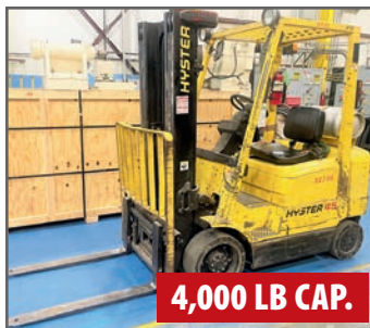
HYSTER S40XM LP FORKLIFT