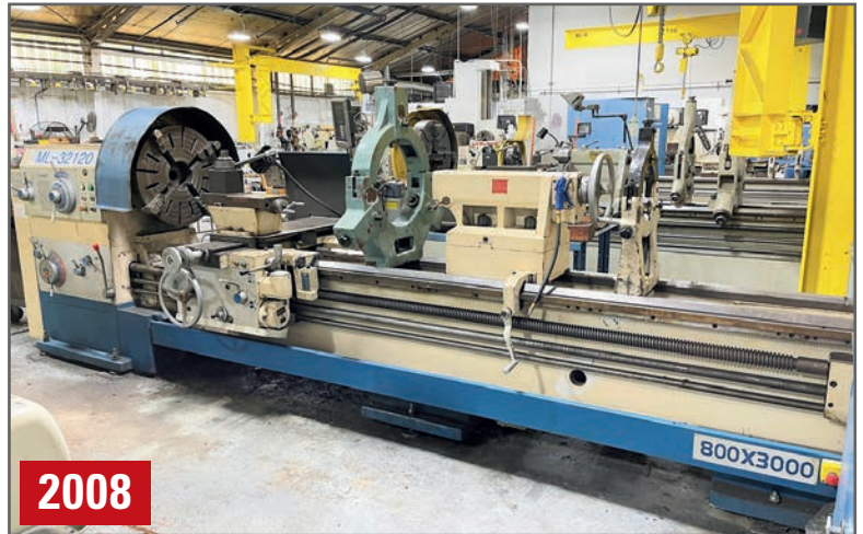
MIGHTY USA 32" X 120" ENGINE LATHE