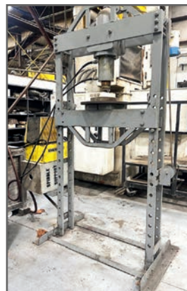
KR WILSON 37F 75-TON H-FRAME PRESS

ALSO: PEDESTAL GRINDERS, BENCH GRINDERS, SANDERS, ROTARY TABLES, CHUCKS, MACHINE VISES, TOOL HOLDERS, TOOLING, ABRASIVES, AND MUCH MORE