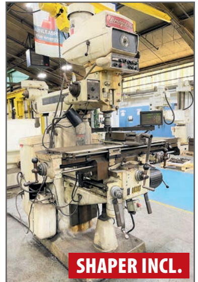
BRIDGEPORT SERIES II VERTICAL MILL