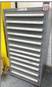
LISTA MODULAR CABINET

ALSO: 60" AND 42" FORK SETS, DRUM LIFT ATTACHMENTS, JOHN BARS, PALLET JACKS, SPREADER BARS, RIGGING CHAIN AND STRAPS, HAND TRUCKS, CRANE SCALES AND MORE