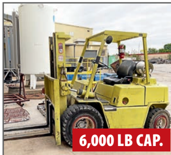
CLARK C500 Y60 LP FORKLIFT