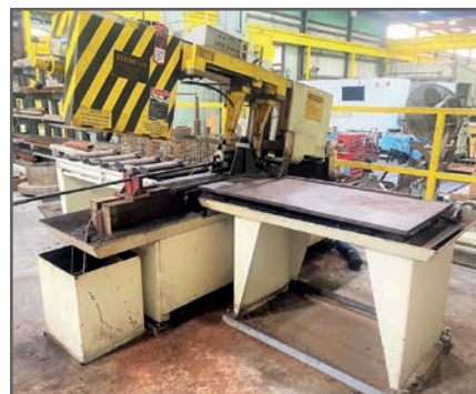
HEM 1200LR HORIZONTAL BANDSAW

Pre-Auction Offers Invited on Major Assets