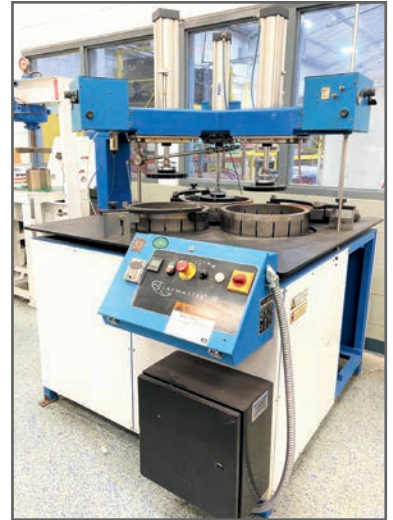
LAPMASTER SS-36H SINGLE SIDE LAPPING MACHINE

BLANCHARD NO. 18 ROTARY SURFACE GRINDER , s/n NA