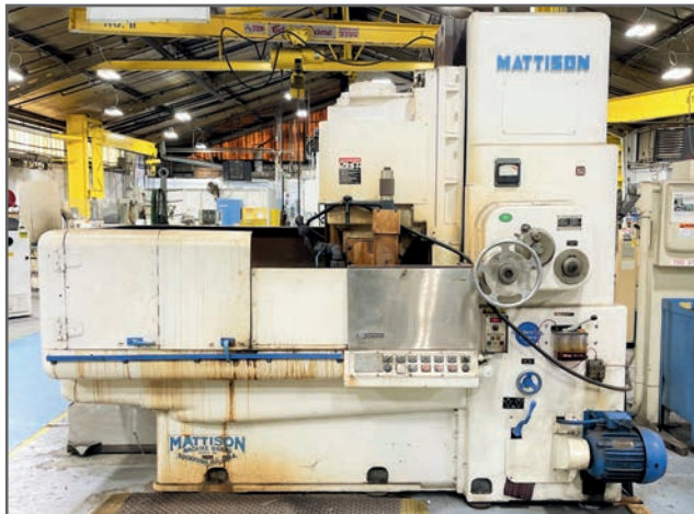
MATTISON 24K42 ROTARY SURFACE GRINDER