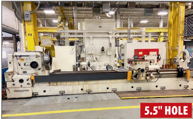
GURUTZ 58"/44"/28" X 208" GAP BED ENGINE LATHE