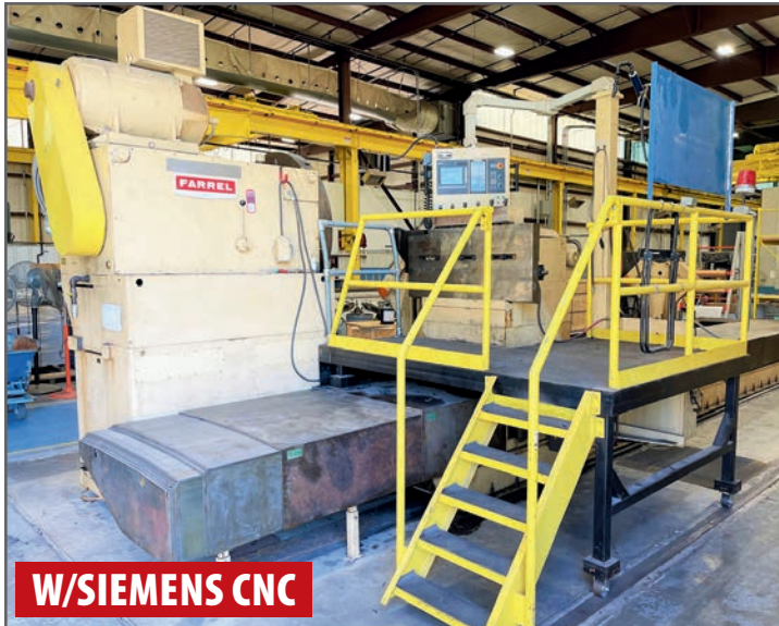
FARREL 118" X 310" CNC LATHE