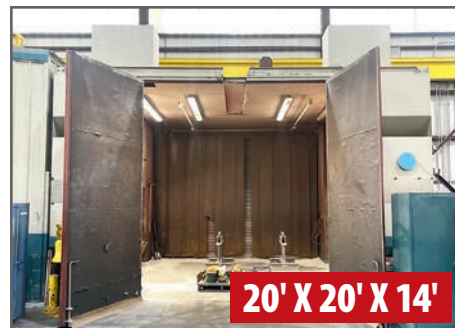
HOFFMAN BLAST ROOM