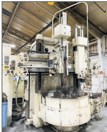
TOS SK12 VERTICAL TURRET LATHE