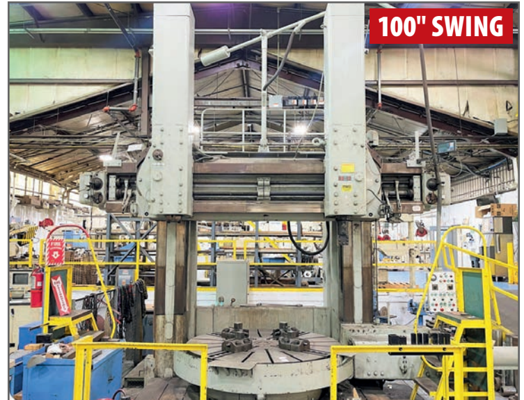
VULCAN RAFAMET KCF 200 VERTICAL BORING MILL

COMPLETE CATALOG & INFORMATION: https://perfection.global/siemenstulsa