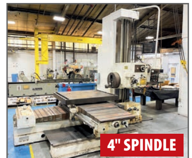
SUMMIT HORIZONTAL BORING MILL