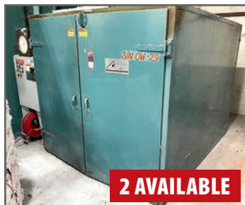
ADVANCED DESIGN CONCEPTS ELECTRIC OVENS

Pre-Auction Offers Invited on Major Assets