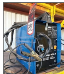
CHICAGO ELECTRIC EASY MIG 101/1 MIG WELDER