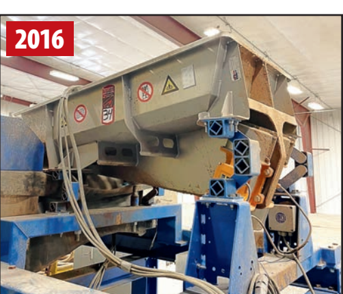
2016 VDL TR84824-01 DIRECTLY DRIVEN SHAKER

INDUSTRIAL CONTROL PANEL, w/Siemens Simatic Panel Touch Screen PLC