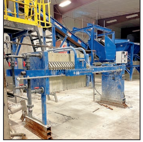
M.W. WATERMARK FILTER PRESS