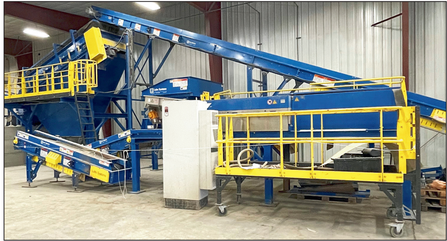
VDL SYSTEMS SPECIAL BUILT METAL RECOVERY EDDY CURRENT SEPARATION LINE