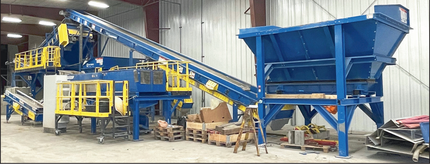
VDL SYSTEMS SPECIAL BUILT METAL RECOVERY SHAKER SEPARATION LINE

INDUSTRIAL CONTROL PANEL, w/SIEMENS Simatic Panel Touch Screen PLC, 85 A, 480/270 V, 3 Phase + GND 60 Hz, Class J Max. 100A, Type 1 Enclosure