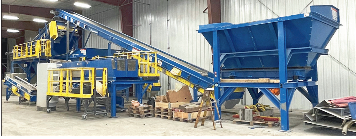
VDL SYSTEMS SPECIAL BUILT METAL RECOVERY SHAKER SEPARATION LINE

FEATURING: (3) 2015 VDL SYSTEMS Separation Lines, Including (1) Eddy Current EC-III Separation Line, (1) Shaker Separation Line, & (1) Washer Separation Line, CARDINAL 160,000 Lb. Electronic Truck Scale w/80' Deck