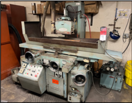
NICCO NSG-6H SURFACE GRINDER