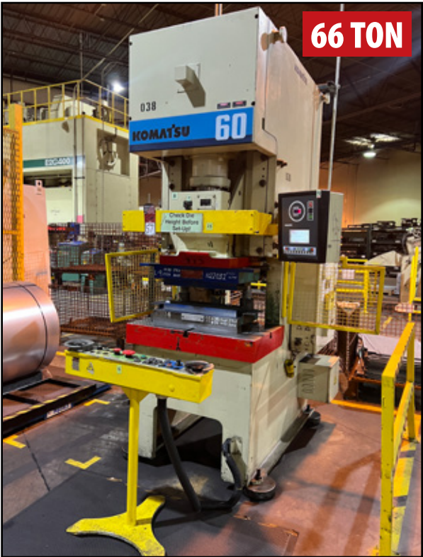
KOMATSU OBS60S-VS-3 GAP FRAME PRESS