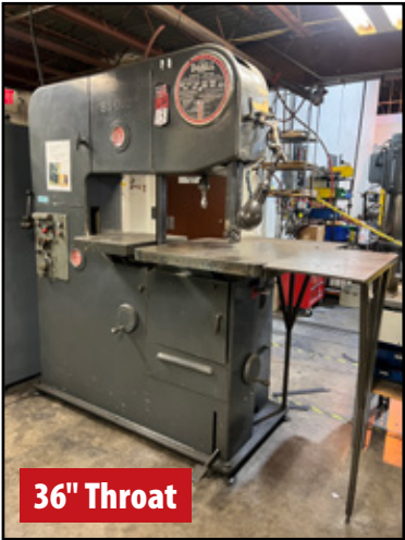
DOALL 3613-1 VERTICAL BANDSAW

LUCIFER HL7-H18 LAB FURNACE, s/n 5254, w/ 2300 Degrees F Max Temp, 18" x 12" x 9" Furnace Area CRESS C1228 ELECTRIC DRAW FURNACE, s/n 5409, w/ 15" x 11" x 7.5" Furnace Area ZERO BNP55-300 BLAST CABINET, s/n 49140, w/ Dust Collection System