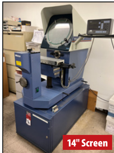
MITUTOYO PH-R14 OPTICAL COMPARATOR