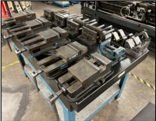
VIEW OF VISES