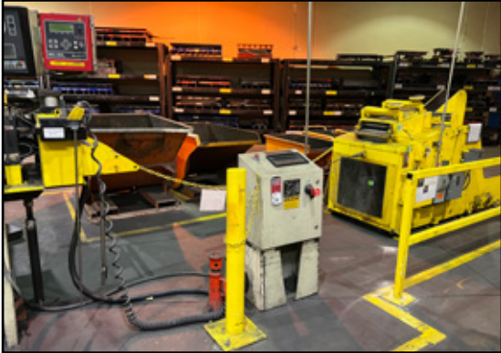
ROWE 8,000 LB X 15" FEED LINE

ROWE 8,000 LB X 15" FEED LINE , w/ B15-C8000 15"x .150" x 8,000 lb. Coil Cradle/ Straightener, s/n 10180, CWP SMX24 15" Straightener Feeder