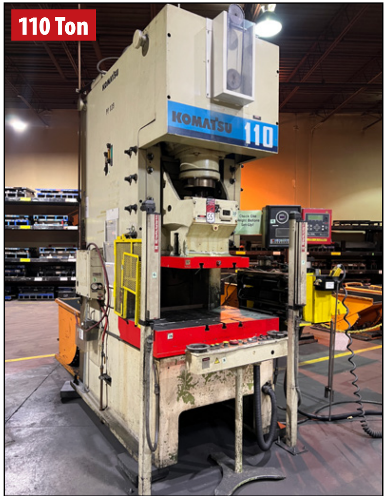
KOMATSU 110H-VS-3 OBS GAP FRAME PRESS

PRE-AUCTION OFFERS INVITED ON MAJOR ASSETS