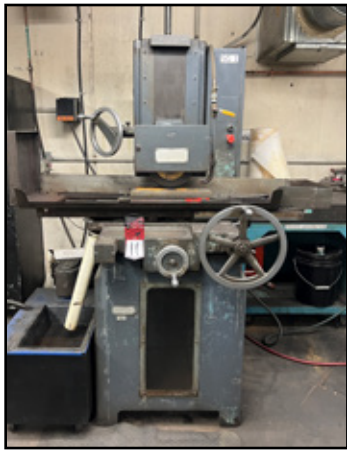
GARDNER 1015 SURFACE GRINDER