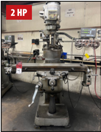
BRIDGEPORT SERIES I MILL