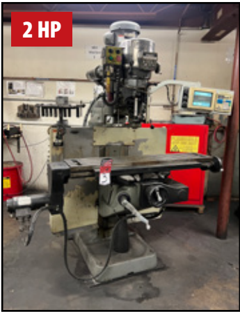
BRIDGEPORT SERIES I EZ TRAK DX MILL

KEARNEY & TRECKER TF415 UNIVERSAL MILLING MACHINE , s/n 4-7786, w/ 15" x 80" Table, 50 Taper, 15-1500 RPM, Right Angle Head