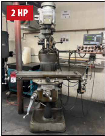
BRIDGEPORT SERIES I MILL