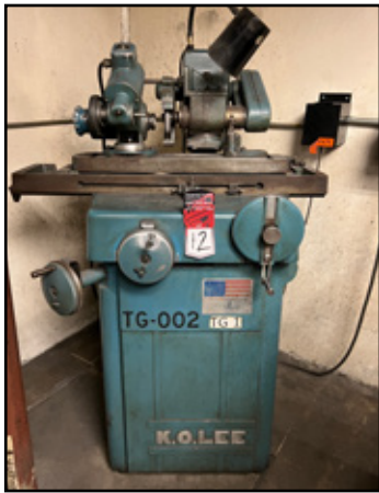
KO LEE BA 960 TOOL & CUTTER GRINDER