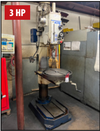
ACRA KRTG-660 GEARED HEAD DRILL PRESS