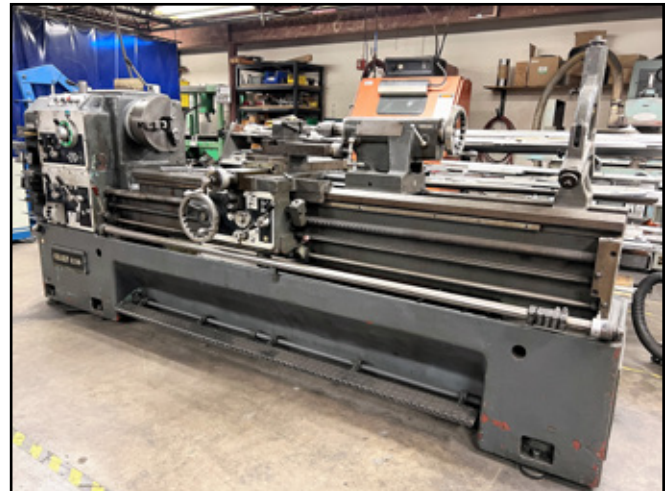
SHARP 2180 GAP BED ENGINE LATHE