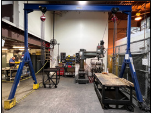
4 TON GANTRY

For auction inquiries, please contact Jennifer Reiner at (847) 545-6374 or jennifer@perfectionindustrial.com