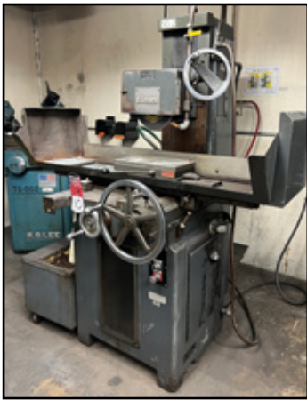
GARDNER 1015 SURFACE GRINDER