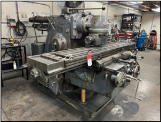
KEARNEY & TRECKER TF415 UNIVERSAL MILL