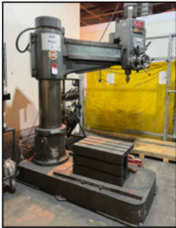
IKEDA RM-1775 4'X 12" RADIAL ARM DRILL