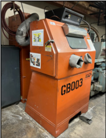
ZERO BNP55-300 BLAST CABINET

4-TON ADJUSTABLE MOBILE GANTRY W/ (2) COFFING 2-TON CHAIN HOISTS, 14' Between Uprights, 12' Under Rails, 10' Travel of Rails, 6" Height Adj.