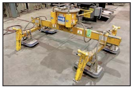
4,400-LB. ANVER M50M-L SUCTION SHEET LIFT

Sale Closing From: Thursday, June 23, 2016 at 1:00 PM CDT