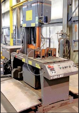
HEM V100LM-3 VERTICAL BANDSAW