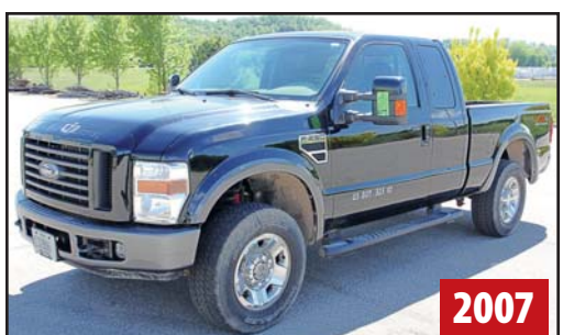
FORD F-250 SUPER DUTY PICKUP TRUCK

(10) LIFTING MAGNETS, from 400–1,500 Lb Capacity