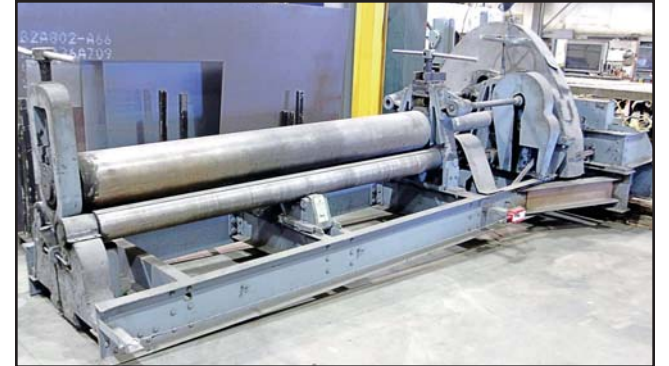
1/2" X 8' 3-ROLL PLATE ROLLER