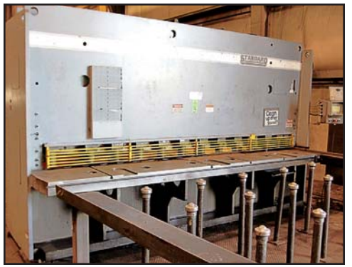
STANDARD 12' X 1/2" SHEAR