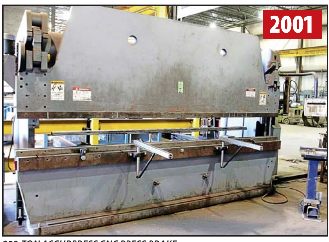
250-TON ACCURPRESS CNC PRESS BRAKE

Sweeper, Steel Storage Systems, Storage Racks, Tool Room & More