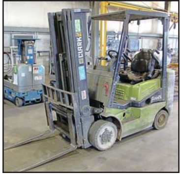
CLARK CGC25 LP FORKLIFT