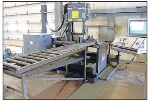
HEM V100LM-3 VERTICAL BANDSAW