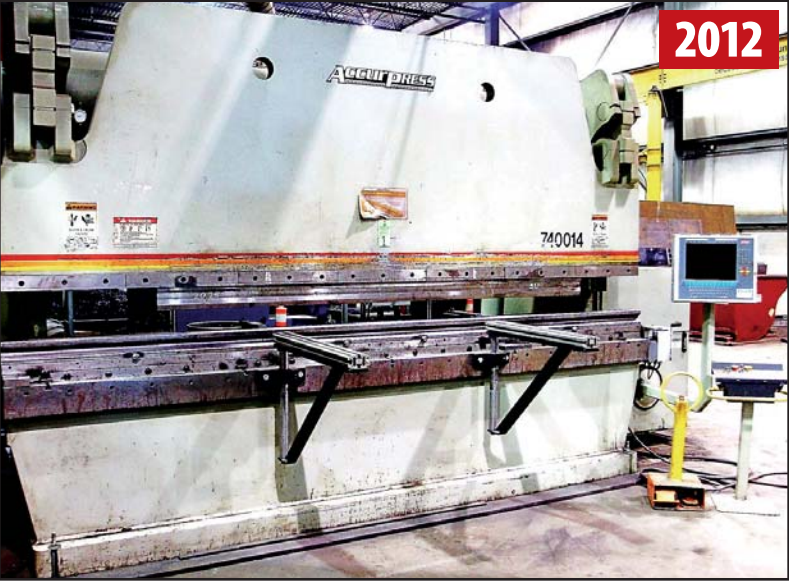
400-TON ACCURPRESS 4-AXIS CNC PRESS BRAKE