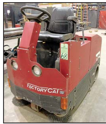
FACTORY CAT RIDE-ON FLOOR SWEEPER