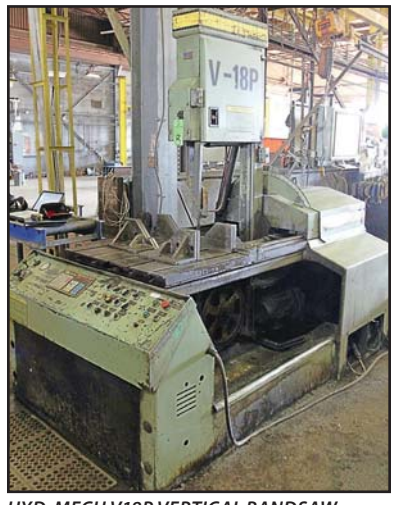
HYD-MECH V18P VERTICAL BANDSAW