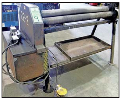
3-ROLL 4" DIA. X 48" MANUAL BENDING ROLL