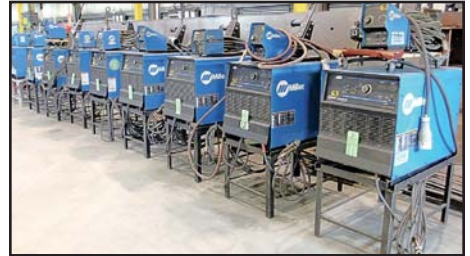
VIEW OF MILLER WELDERS

HYD-MECH V18P VERTICAL BANDSAW, s/n 891505, (Location: 817 Bainbridge Street, Lacrosse, WI), 31" x 18" Capacity, w/Hyd-Mec PLC 100P Control