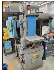
HAMMOND BELT GRINDER