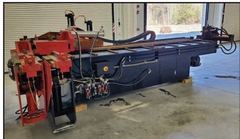
PINES NO 4 HYDRAULIC TUBE BENDER

ALSO: Belt Grinders, Double End Grinders, Dust Collectors, Machinist Vises, Rotary Tables, Roller Conveyor, Power Tools, and more