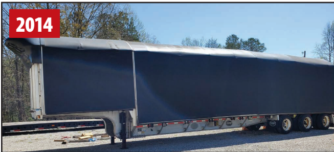
MAC 53' TRI-AXLE ENCLOSED STEP DECK CONESTOGA SEMI TRAILER