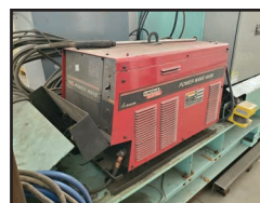
LINCOLN POWERWAVE 455M