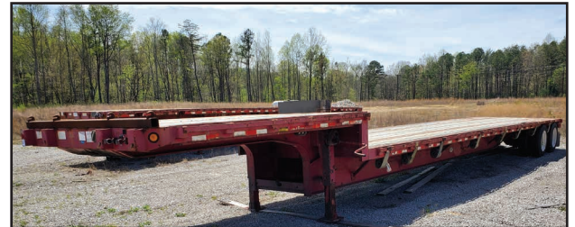
GREAT DANE GPMS248 48' STEP DECK SEMI TRAILER