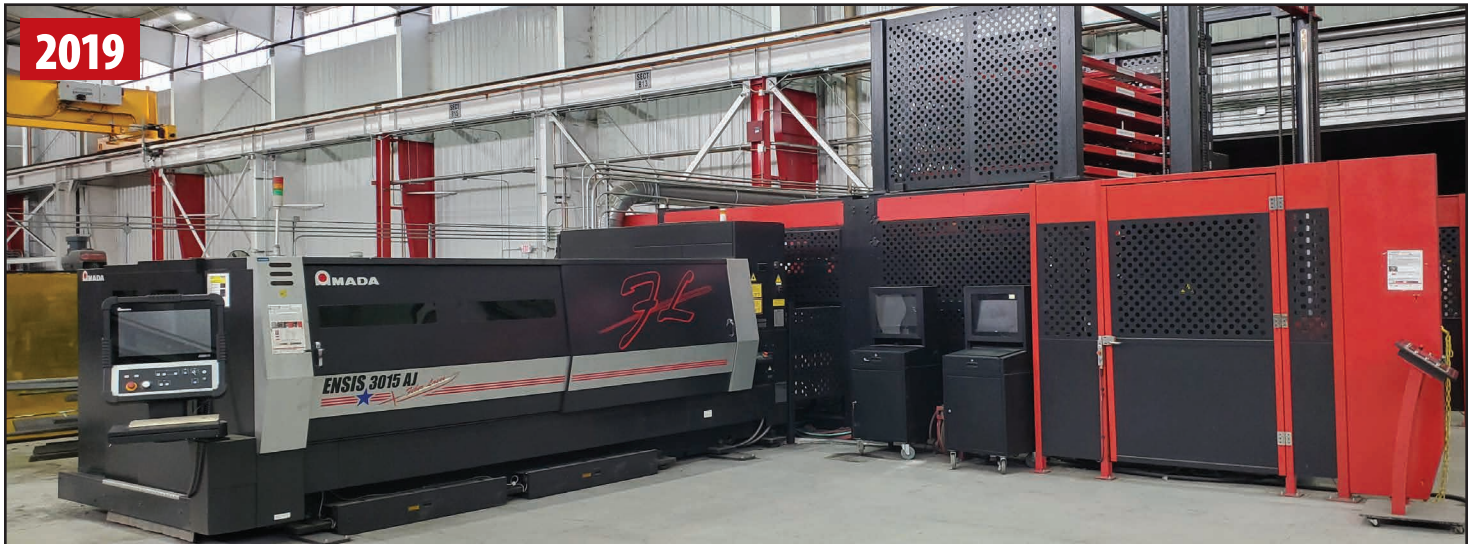
AMADA ENSIS 3015 AJ 3150-WATT CNC FIBER LASER & STORAGE SYSTEM

FEATURING: ALL 2019 - AMADA HG2204-ATC 247 Ton CNC Press Brake w/ Tool Changer, AMADA 3.15kW Fiber Laser w/ Loading System; AMADA EMK-3612-M2 CNC Turret Punch; AMADA ID-TOGU Tool Grinder; AMADA FabriVISION 3Di Laser Inspection System; AMADA HKB6050CNC Bandsaw; AMADA MARVEL 800A-PC3S Bandsaw; Robotic Welding Cells, Highway Trailers, Powered/Roller Conveyor and more