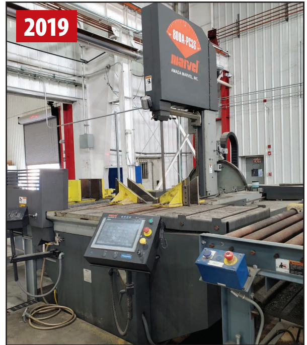
AMADA MARVEL G800APC3S TILTING COLUMN VERTICAL BANDSAW