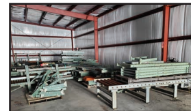
ASSORTED ROLLER CONVEYOR