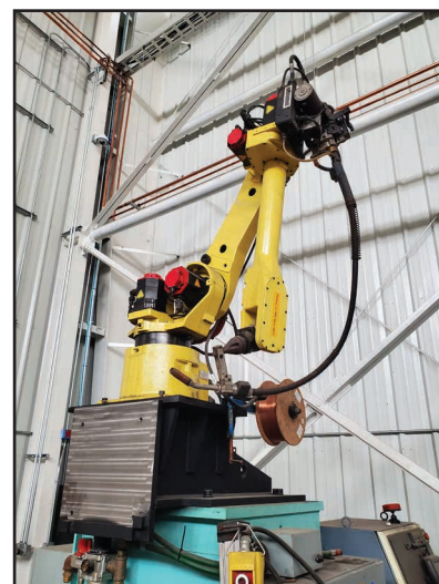
FANUC ARC MATE 120iB ROBOT