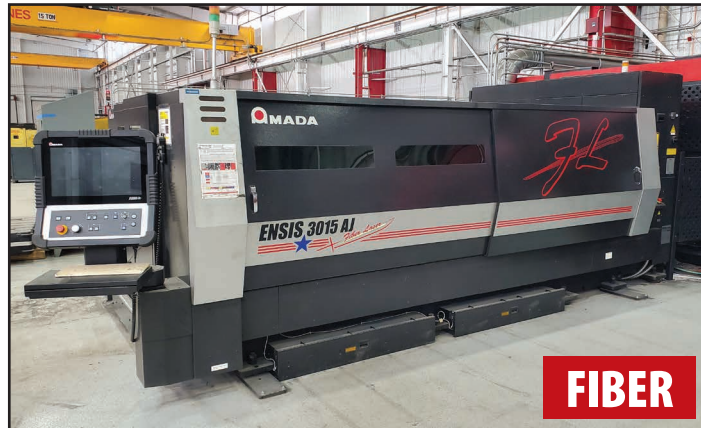
2019 AMADA ENSIS 3015 AJ 3150-WATT CNC FIBER LASER