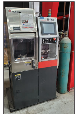
2019 AMADA ID-TOGU AUTOMATIC TOOL GRINDER