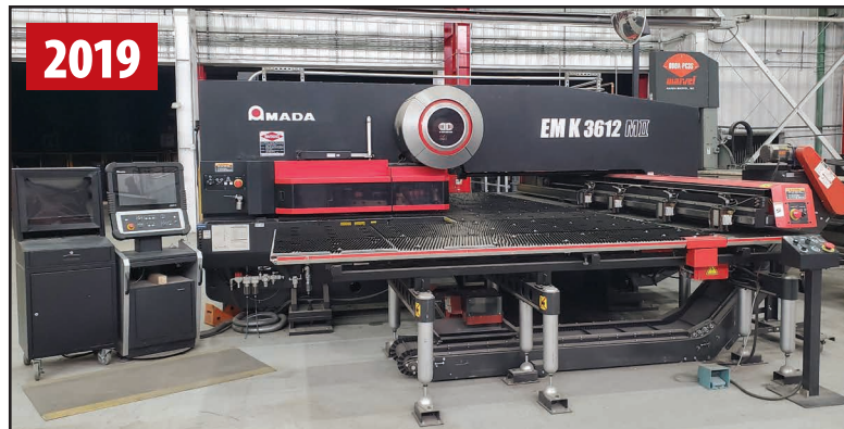
AMADA EMK3612M2 CNC TURRET PUNCH PRESS