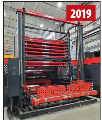
AMADA AMS 3015 CL ROBOTIC LOAD/UNLOAD & STORAGE SYSTEM