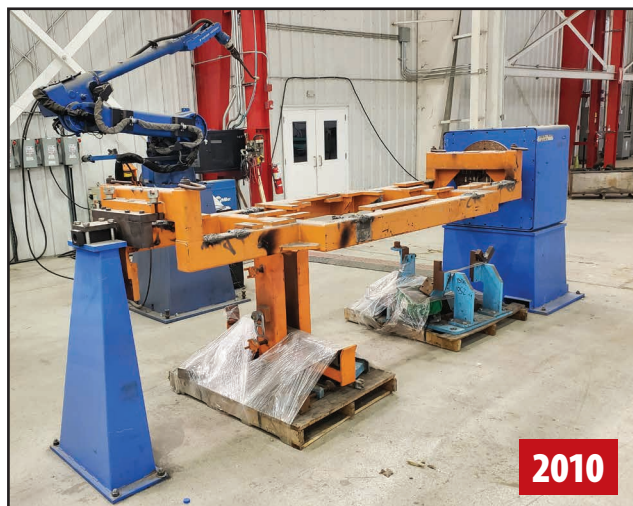
YASKAWA/MILLER ROBOTIC WELDING CELL