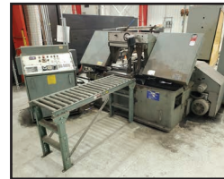
MARVEL NO 15 HORIZONTAL BANDSAW