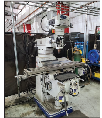
KBC TUM-40VS 5 HP VERTICAL MILL