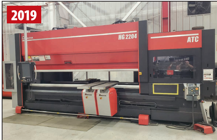
AMADA HG2204ATC 8-AXIS 247 TON CNC PRESS BRAKE