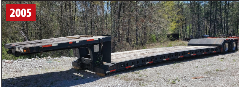
FONTAINE 353WDMR 48' T/A DOUBLE DROP TRAILER