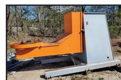
KOIKE ARONSON WELDING POSITIONERS