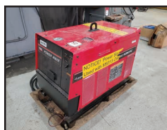
LINCOLN POWERWAVE 455M