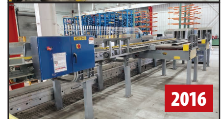
LEWCO HD POWER FEED & EXIT ROLLER CONVEYOR SYSTEMS