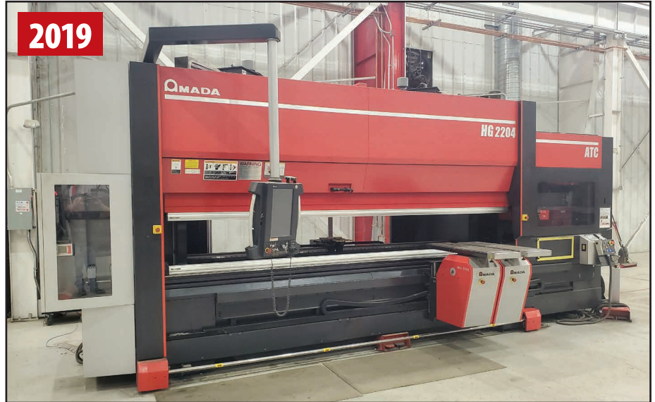
AMADA HG2204ATC 8-AXIS 247 TON CNC PRESS BRAKE