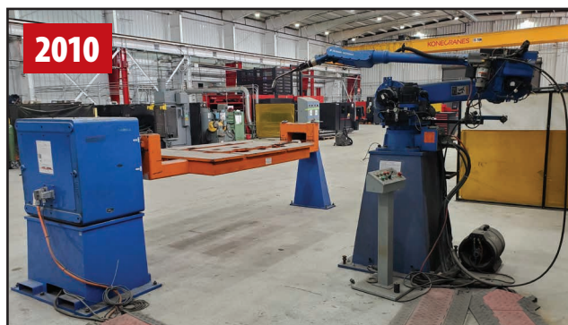
YASKAWA/MILLER ROBOTIC WELDING CELL