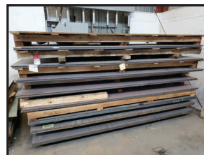
VIEW OF STEEL STOCK