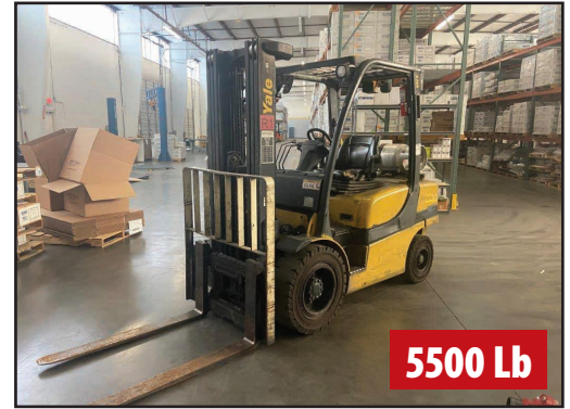
YALE LP FORKLIFT

FACTORY CAT RIDE-ON SWEEPER , s/n 40-7401, 24V, w/ LTD-FERRO Battery Charger, Note: Located in Houston Texas