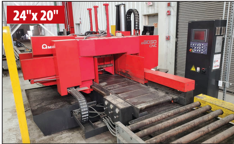
2019 AMADA HKB6050CNC CNC HORIZONTAL BANDSAW

2016 LEWCO HD POWER FEED & EXIT ROLLER CONVEYOR SYSTEM , s/n NA, w/ 32" x 36' Roller Feed Conveyor, 52" x 18' Roller Exit Conveyor, (2) Chain Transfer Sections