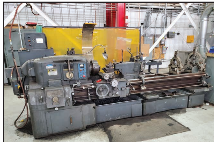
MONARCH NO 612 20" X 78" ENGINE LATHE