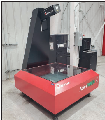
2019 AMADA VIRTEK FABRIVISION LASER INSPECTION SYSTEM

2019 AMADA VIRTEK FABRIVISION LASER INSPECTION SYSTEM , s/n NA, w/ 48" x 48" Scan Area, w/ VIRTEK LPS-1EA Laser Scanner