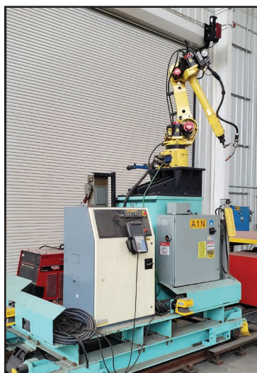
FANUC ARC MATE 120iB ROBOT