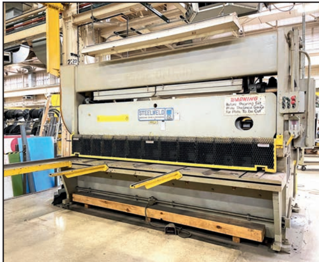
STEELWELD 8D-10 10' X 1/2" SQUARING SHEAR