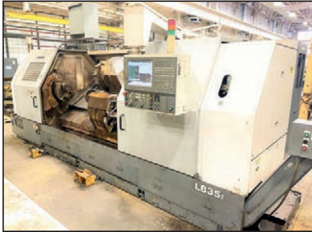
OKUMA LB35II TURNING CENTER