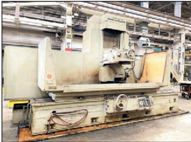
MATTISON 30" X 72" HYDRAULIC SURFACE GRINDER