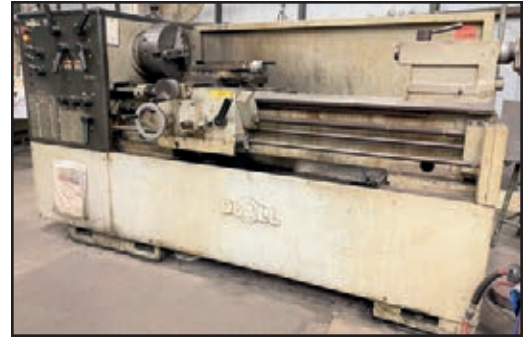
DOALL 17" X 48" TOOL ROOM LATHE