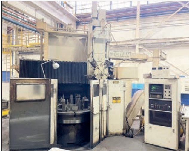
GRAY 60" CNC VERTICAL TURRET LATHE