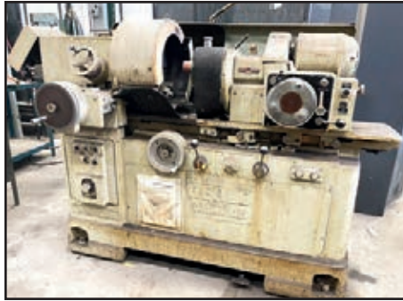
HEALD NO 271 UNIVERSAL INTERNAL GRINDER