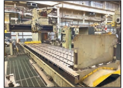
GRAY OPEN SIDE PLANER MILL

ROCKFORD PLANER MILL, s/n NA, w/18' x 48" Table