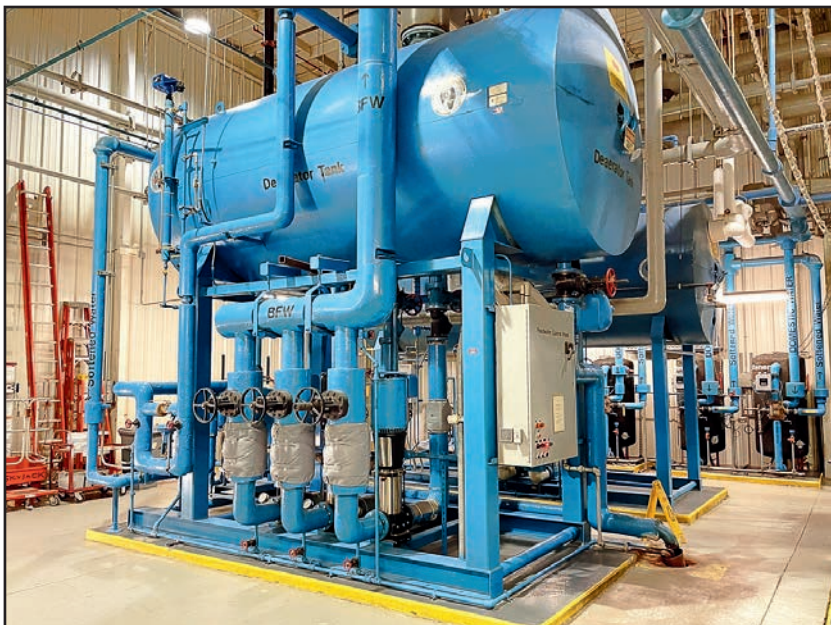
VIEW OF BOILER ROOM

(2) LINCOLN NS-E-59 BOILERS , w/350 PSIG Max. Allowable Working Pressure, 70,000 Lb/Hr Max. Steam Capacity, TODD COMBUSTION VS90IGO 90.9 MMBTU/Hr Gas Burners, (2) Economizers, Deaerator System, Condensate System, Feed Water System, Water Conditioning System, (2) Fire Pump Systems, (2) 572-Gallon Tanks, CLARK Detroit Diesel-Allison Motors, JOSLYN CLARK Fire Pump Controller