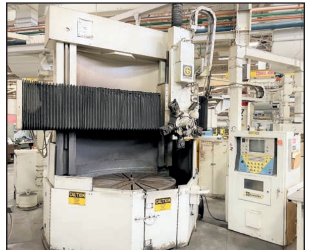
GIDDINGS & LEWIS 60" CNC VERTICAL TURRET LATHE