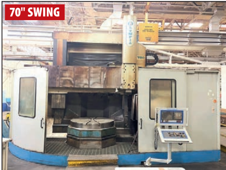
2001 OLYMPIA V60-2 CNC VERTICAL TURNING CENTER