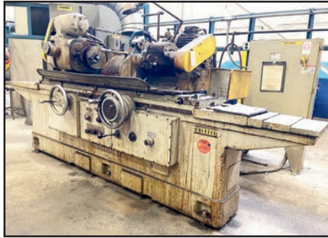
CINCINNATI 18LX 36 UNIVERSAL CYLINDRICAL GRINDER