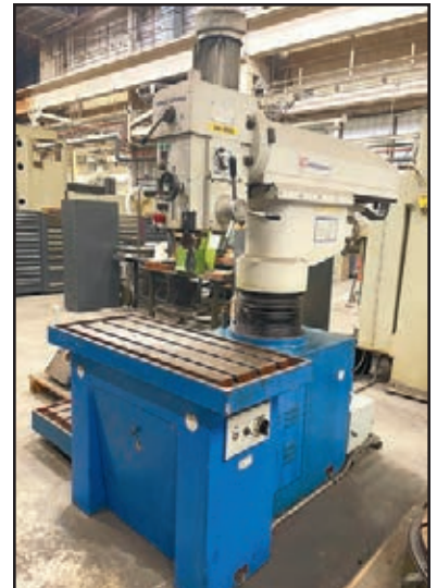
KNUTH KSR40 ADVANCE RADIAL ARM DRILL

SALE DATE Tuesday, May 18 at 9:00 AM CT SALE LOCATION 9301 W. 55th St., McCook, IL 60525