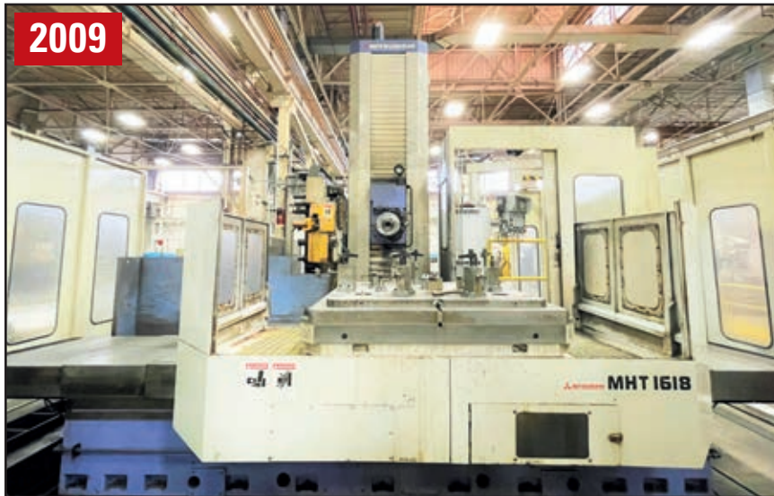
(1 OF 2) MITSUBISHI MHT1618 CNC 5-AXIS TABLE TYPE HORIZONTAL BORING MILLS