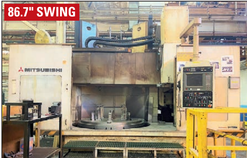
MITSUBISHI M-VT20A CNC VERTICAL BORING MILL