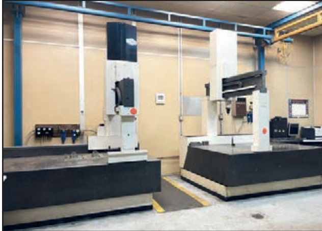
VIEW OF CMMs

Featuring: Hundreds of Lots of Tooling, CMMs, QA & Inspection Items, (150+) Cranes Including Bridge Cranes up to 120-Ton, Free Standing Bridge Crane Systems, Free Standing Jib Cranes, Wall-Mount Jib Cranes, Electric Hoists, Rigging Supplies, Forklifts, Scissor Lifts, Boom Lifts, Carry-Deck Cranes, Utility Carts, Trunnions, Welding Supplies, Tool Room Machinery, Tool Boxes, Power, Hand & Pneumatic Tools, VIDMAR Ball Bearing Tool Cabinets, Stronghold Cabinets, & More