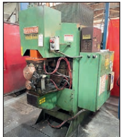
BANNER 2CPS50A18 50 KVA CIRCULAR SEAM SPOT WELDER