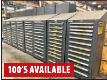
VIEW OF VIDMAR CABINETS

ALSO: PRATT & WHITNEY 12" MODEL B SHAPER, HUGE SELECTION OF TOOLING, MODULAR TOOL CABINETS, STRONGHOLD CABINETS, AIR TOOLS, PNEUMATIC TOOLS, POWER TOOLS, GRINDING ACCESSORIES, SETUP TOOLING, SHOP FANS, AND MORE