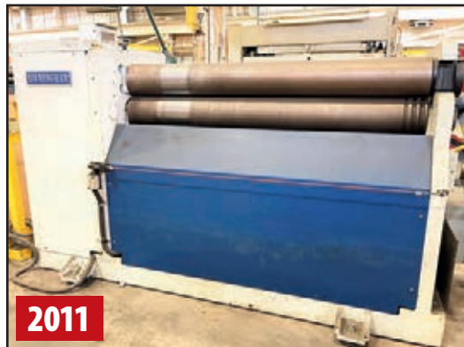
BIRMINGHAM R-0465H 4' X 1/4" HYDRAULIC BENDING ROLL

MILLER/JETLINE SWCB-3AB SEAM WELDING SYSTEM, s/n 2016-138, w/LINCOLN 375 Precision Tig Welder