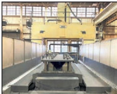
REKO MEDVE-8700WXR GANTRY TYPE VERTICAL BORING MILL

Friday, May 14 & Monday, May 17 By Appointment Only