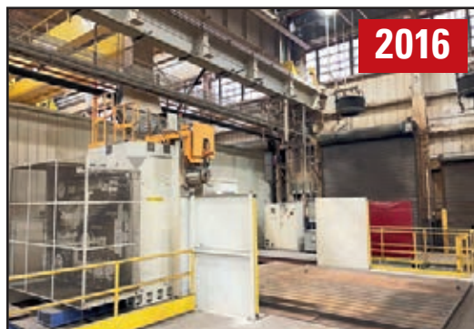
MITSUBISHI MAF150S-C CNC HORIZONTAL BORING MILL

Featuring: Large Capacity CNC Machine Tools, Parallel Kinematics Machine, Gun Drill, Conventional Machine Tools, Fabrication Equipment, Welding, Heat Treat, Finishing, Complete Boiler Room, Tooling, QA/Inspection, Cranes, Rigging, Material Handling, Ball Bearing Tool Cabinets, Strongholds, MRO, Complete Switchgear Facility, Racking, Commercial Cafeteria, Office, Break Room, Shipping/Receiving & MUCH, MUCH MORE!