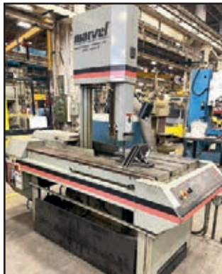
MARVEL SERIES 8 MARK II VERTICAL BANDSAW