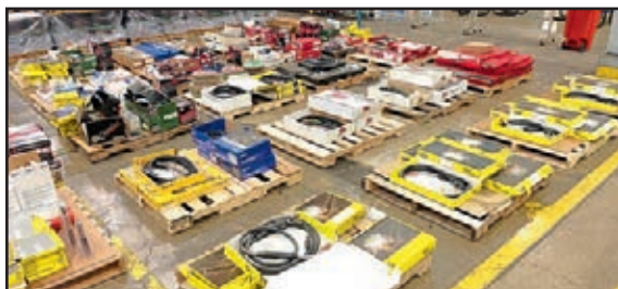
VIEW OF WELDING SUPPLIES