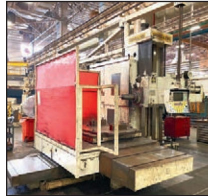
GIDDINGS & LEWIS G60-RTX 4-AXIS TABLE TYPE HORIZONTAL BORING MILL

INGERSOLL CNC TWIN BORE MACHINING CENTER , s/n NA, w/FANUC Oi-MD Control