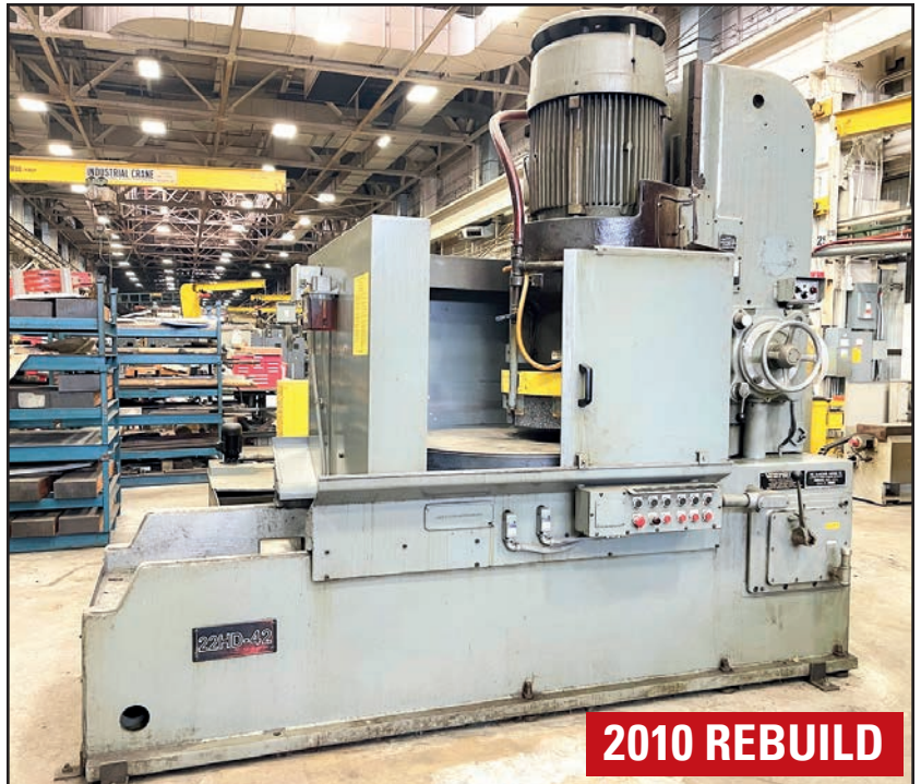
BLANCHARD 22HD-42 ROTARY SURFACE GRINDER