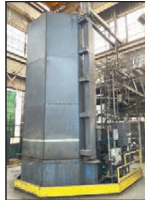
MART HURRICANE 84 WASH SYSTEM