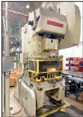
BLISS C-75 75-TON OBI PRESS