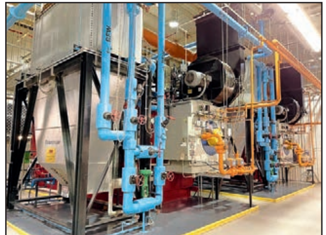
VIEW OF BOILER ROOM

PRECISION QUINCY 102-450TMMDD OVEN SYSTEM , s/n 12967