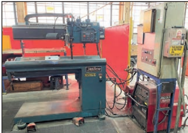
MILLER/JETLINE SWCB-3AB SEAM WELDING SYSTEM