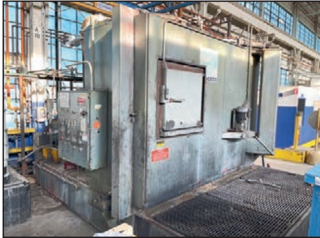
PROCECO 84" SS ROTARY TABLE WASH SYSTEM