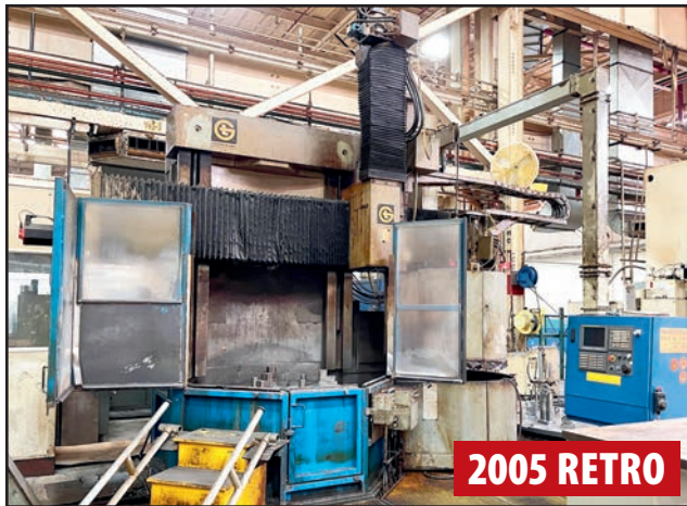
GIDDINGS & LEWIS 48" CNC VERTICAL BORING MILL

(2) OKUMA MC-50VA VERTICAL MACHINING CENTERS , s/n 0381, 0380, w/OSP7000M Control, TSUDAKOMA PCA901SN-20 Pallet Changer