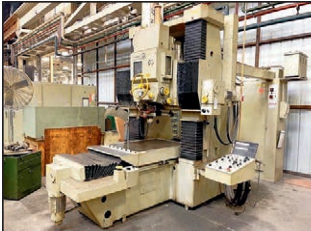
HAUSER SIP S50-DR BRIDGE TYPE PRECISION JIG GRINDER