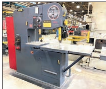
DOALL 3613-20 VERTICAL BANDSAW