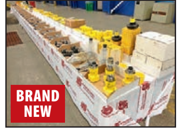
VIEW OF TAPER TOOL HOLDERS