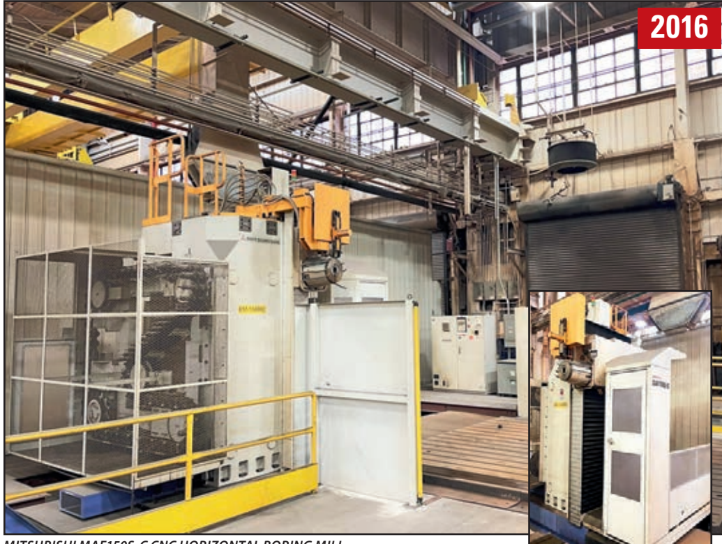
MITSUBISHI MAF150S-C CNC HORIZONTAL BORING MILL

Bearing Tool Cabinets, Strongholds, MRO, Complete Switchgear Facility, Racking, Commercial Cafeteria, Office, Break Room, Shipping/Receiving & MUCH, MUCH MORE!