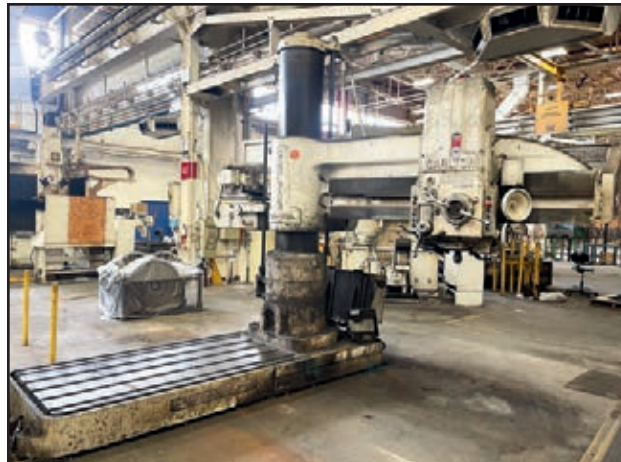
CARLTON 7' RADIAL ARM DRILL

KNUTH KSR40 ADVANCE RADIAL ARM DRILL, s/n D05007, 16" x 41" Table, 50-2,000 RPM Spindle Speed