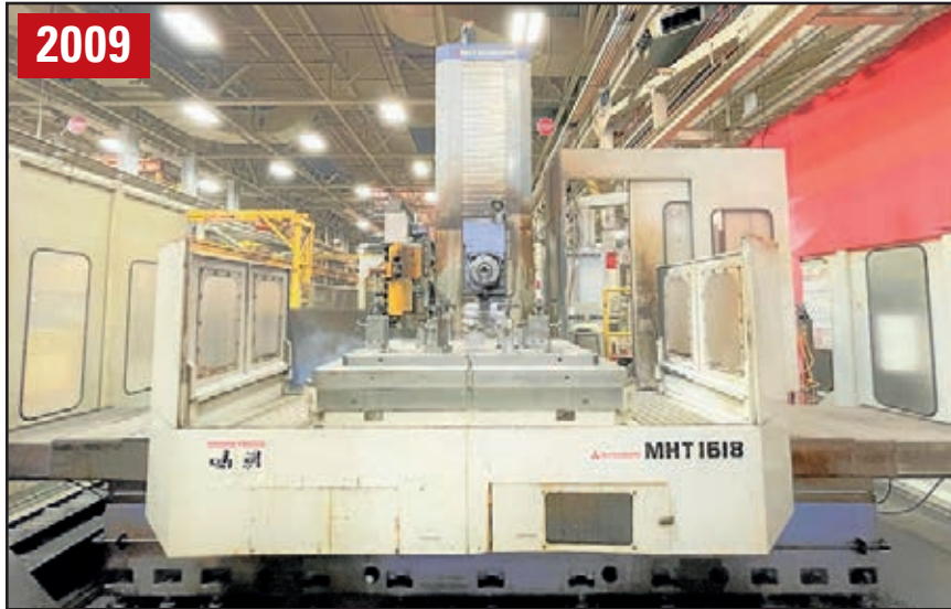
(1 OF 2) MITSUBISHI MHT1618 CNC 5-AXIS TABLE TYPE HORIZONTAL BORING MILLS