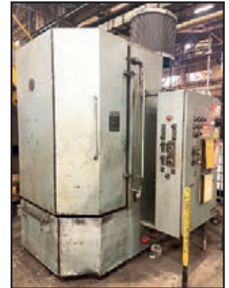
BETTER ENGINEERING F5000LXP ROTARY TABLE WASH SYSTEM