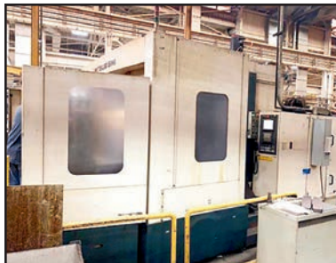
MITSUBISHI M-80EN CNC 4-AXIS HORIZONTAL BORING MILL