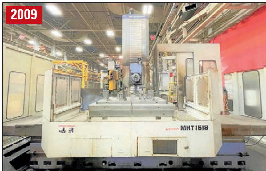
(1 OF 2) MITSUBISHI MHT1618 CNC 5-AXIS TABLE TYPE HORIZONTAL BORING MILLS