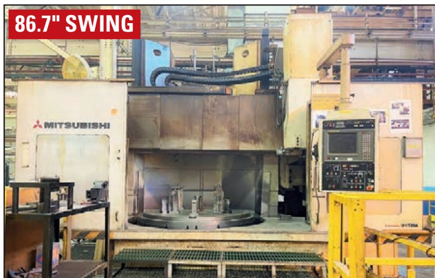
MITSUBISHI M-VT20A CNC VERTICAL BORING MILL