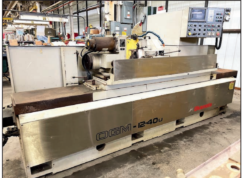
OKAMOTO OGM-1240U CNC UNIVERSAL CYLINDRICAL GRINDER

OKUMA GC-34NH CNC CAMSHAFT GRINDER, s/n 0809.00118, w/ OSP5020 Control