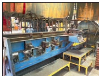
CUTTINGS SYSTEMS 10-STATION FLAME CUTTING SYSTEM