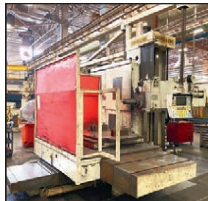
GIDDINGS & LEWIS G60-RTX 4-AXIS TABLE TYPE HORIZONTAL BORING MILL

INGERSOLL CNC TWIN BORE MACHINING CENTER , s/n NA, w/FANUC Oi-MD Control