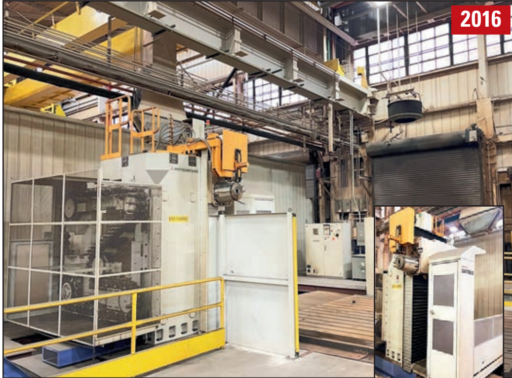
MITSUBISHI MAF150S-C CNC HORIZONTAL BORING MILL

Bearing Tool Cabinets, Strongholds, MRO, Complete Switchgear Facility, Racking, Commercial Cafeteria, Office, Break Room, Shipping/Receiving & MUCH, MUCH MORE!