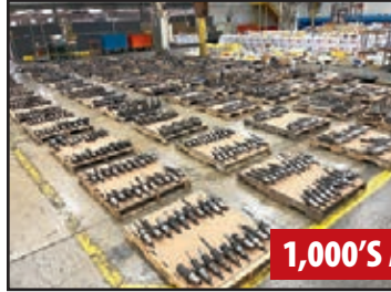
VIEW OF TAPER TOOL HOLDERS