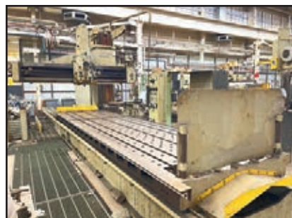
GRAY OPEN SIDE PLANER MILL

ROCKFORD PLANER MILL, s/n NA, w/18' x 48" Table