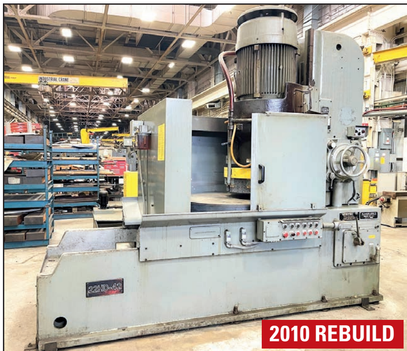
BLANCHARD 22HD-42 ROTARY SURFACE GRINDER