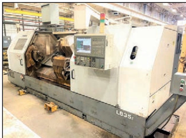
OKUMA LB35II TURNING CENTER