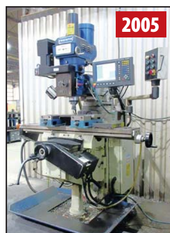
FREJOTH FVTM-5VK 5 HP CNC MILL

ALSO: PALLET JACKS, SPREADER BARS, DUMPING SCRAP HOPPERS, SECURITY CAGE, ROLLING SHOP CARTS, MOTORS, DRIVES, SCISSOR TABLES, (2) WHEEL DOLLIES, PARTS BINS, STRAPPING CADDIES AND TOOLS, JOB BOXES, SHOP AND STEP LADDERS, PERSONNEL LOCKERS, STORAGE RACKS, PNEUMATIC AND ELECTRIC HOSE REELS, CONVEYORS, SHOP FANS, SHOP VACS, JANITORIAL EQUIPMENT AND SUPPLIES, LARGE QUANTITY OF HAND TOOLS, BOLT CUTTERS, CRIMPERS, ALL SIZES OF PIPE WRENCHES, HAND FILES, ELECTRIC DRILLS, CORDLESS DRILLS, C-CLAMPS, PRY BARS, BESSEY CLAMPS, VISE GRIPS, HAMMERS, SCREW DRIVERS, MITRE SAWS, ELECTRIC AND PNEUMATIC GRINDERS, NIBBLERS, SAWS, SANDERS, SLEDGE HAMMERS, ROUTERS, CUT-OFF SAWS, STAPLERS, LEVELS, PNEUMATIC HAMMER AND IMPACT GUNS, GRINDER WHEELS, DISCS, BRUSHES, DRILLS, REAMERS, HOLE SAWS, TOOLBOXES, STEEL BANDING AND AUTOMATIC STRAPPING TOOLS, LARGE ASSORTMENT OF PIPE BENDING DIES, PERISHABLE TOOLING INCLUDING DRILLS, REAMERS, CUTTERS, CARBIDE INSERTS, TAPS, V FLANGE TOOLS HOLDERS, BORING BARS