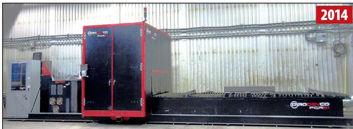
PRODEVCO PCR 31 ROBOTIC 6-AXIS PLASMA CUTTING SYSTEM