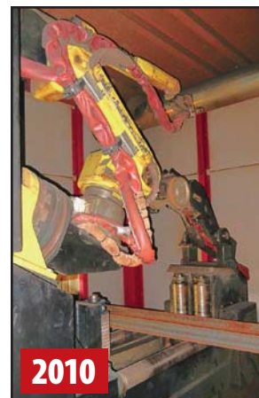
PCR 42-FANUC ARC MATE 120IC/10L ROBOT