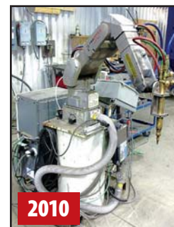
FANUC PAINTMATE 200IA 5-AXIS ROBOT

Online Bidding Available Through BidSpotter.com