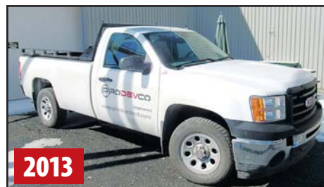
GMC SIERRA 1500 PICKUP

Auction is Being Held in Canadian Dollars