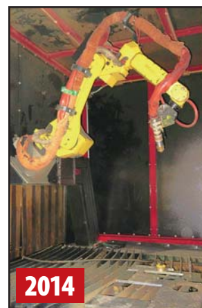
PCR 31-FANUC ARC MATE 100IC/12 ROBOT