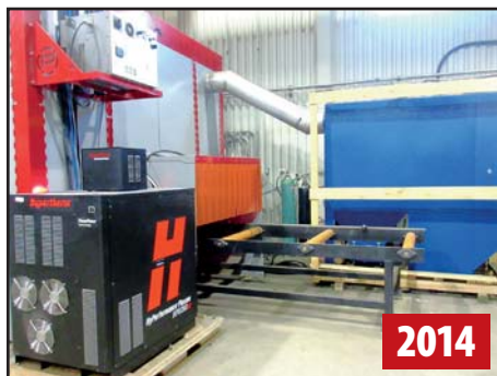
PCR 42-PLASMA AND FUME FILTER