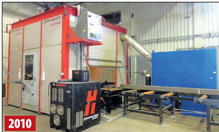
PRODEVCO PCR 42 ROBOTIC 8-AXIS PLASMA CUTTING SYSTEM