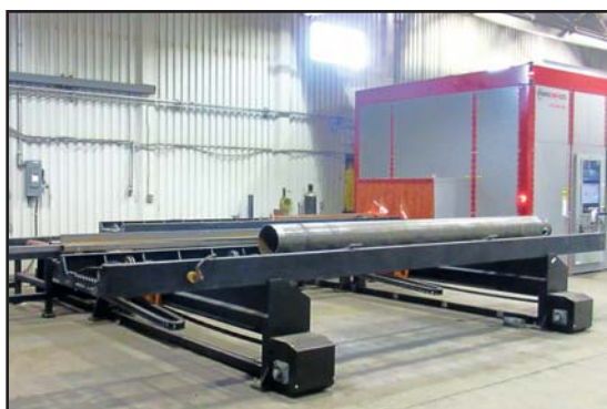
PRODEVCO POWER IN-AND-OUT FEED CONVEYOR