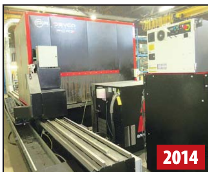
PCR 31-ROBOT CONTROL AND PLASMA UNIT