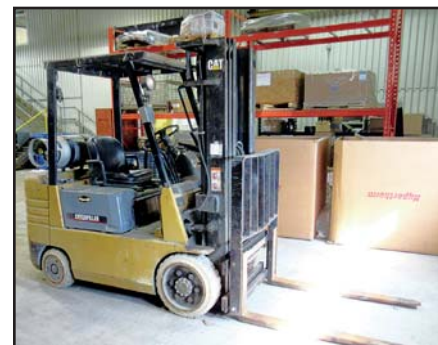
CATERPILLAR GC25 4,700-LB. FORKLIFT