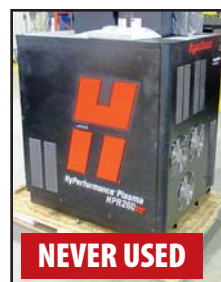
2015 HYPERTHERM HPE260 XD PLASMA UNIT