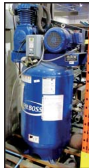
< DEVAIR 7.5 HP VERTICAL TANK AIR COMPRESSOR

CATERPILLAR GC25 4,700 LB FORKLIFT , s/n 4EM07985, w/Side Shifter