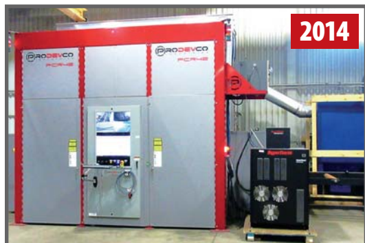
PRODEVCO PCR 42 ROBOTIC 8-AXIS PLASMA CUTTING SYSTEM