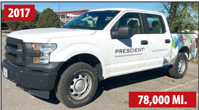
FORD F-150 XLT 4WD TRUCK