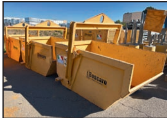
BOSCARO AND JCRANE SELF DUMPING BINS