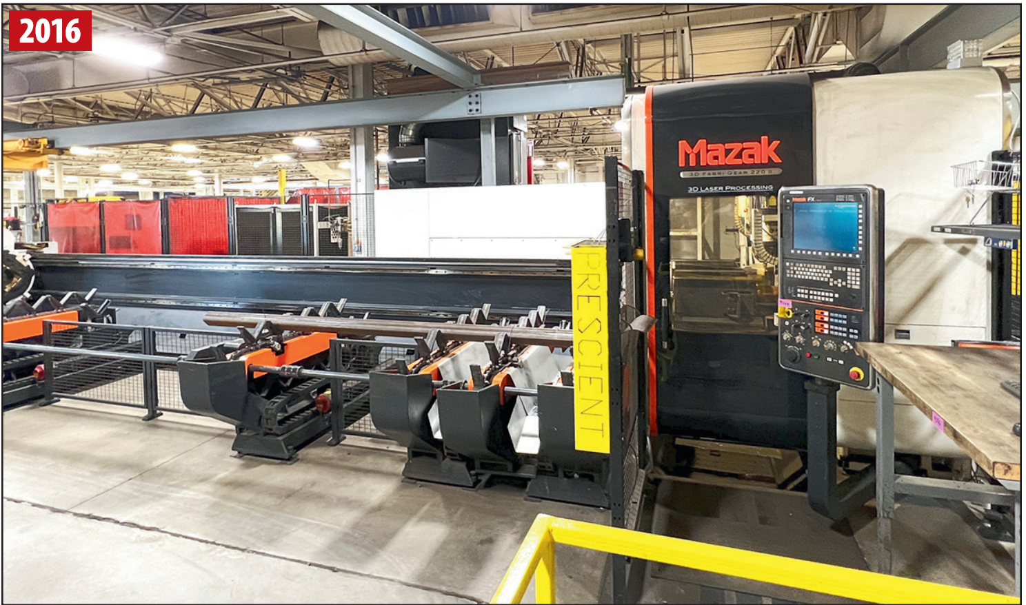
MAZAK 3D FABRIGEAR 220 II (4K GEN 2) TUBE LASER

COMPLETE CATALOG & INFORMATION AVAILABLE: https://perfection.global/prescient