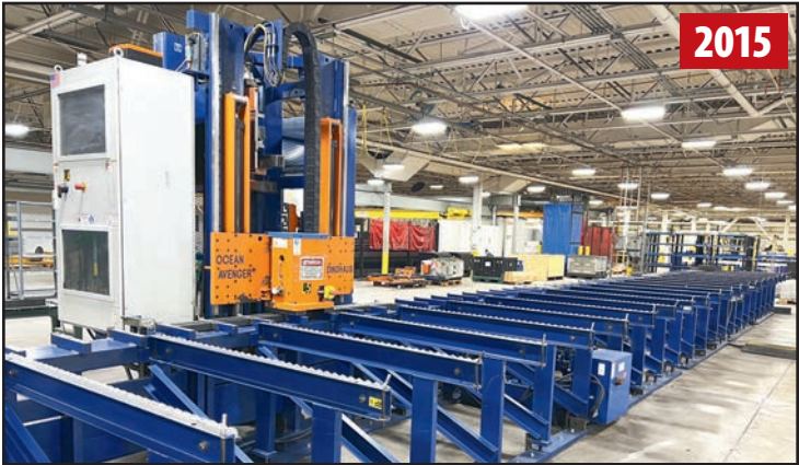
PEDDINGHAUS OCEAN AVENGER PLUS 1250/1C BEAM DRILL LINE

NOTE: THE ROOF DECK LINE WAS DECOMMISSIONED BY SAMCO TECHNICIANS, Professionally Disassembled, Packed and Shrink Wrapped and is in Storage in Wilson, North Carolina.