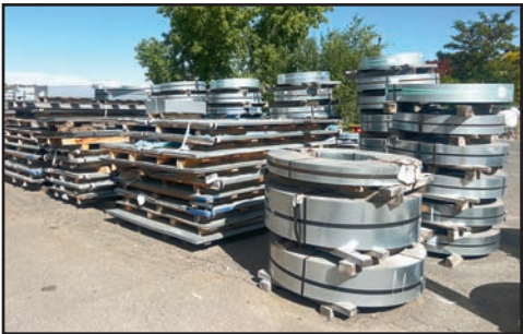
ASSORTED COIL AND SHEET STOCK