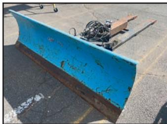
84" FORKLIFT PLOW