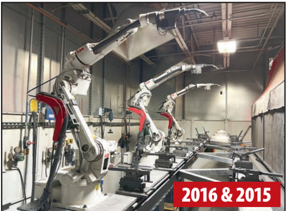
ABB WELD CELL-INTERIOR VIEW