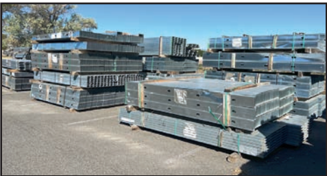
HUGE QUANTITY OF ASSORTED TUBE AND CHANNEL STOCK