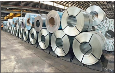
(18) COILS OF 39.375" X 18 GA GALVANIZED STEEL