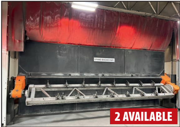
ABB FLEXARC (3) ROBOT X 18' TRUNNION ROBOTIC WELDING CELL