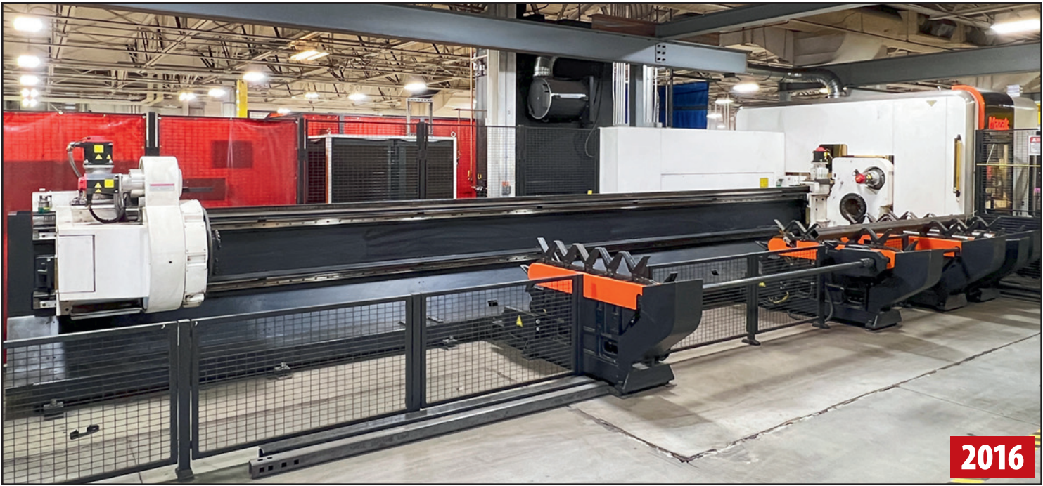
MAZAK TUBE LASER-LEFT VIEW