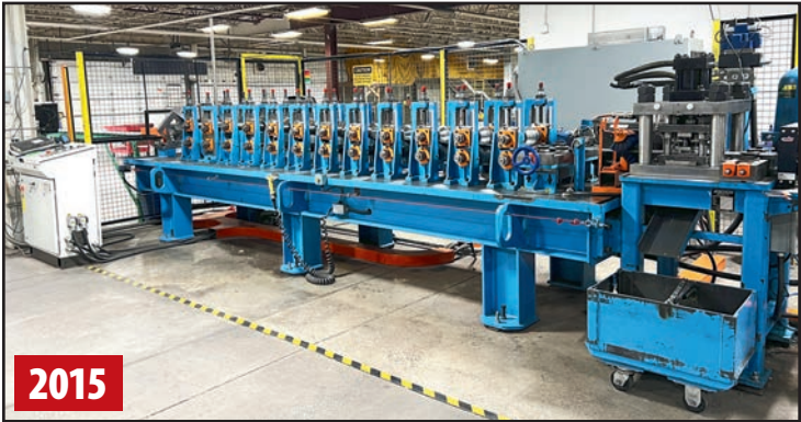
SAMCO 12-STAND ROLL FORMING LINE (CHORD)