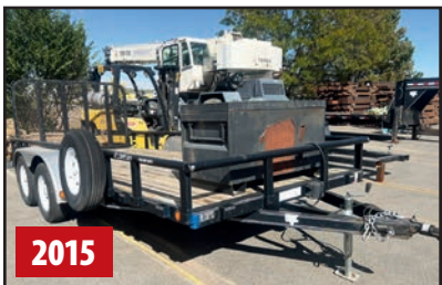
PJ TRAILERS T/A UTILITY TRAILER