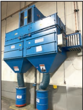
FILTER 1 FLOWTRON FUME EXTRACTOR