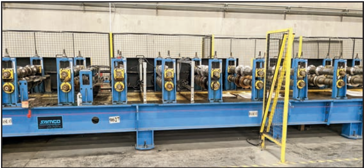
2018 SAMCO ROOF DECK 30-STAND ROLL FORMING LINE