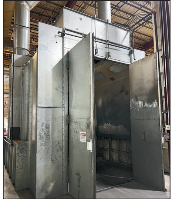
COL-MET 15' L X 12' W PAINT BOOTH