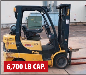
YALE GLC070VXNVSF0088 LP FORKLIFT