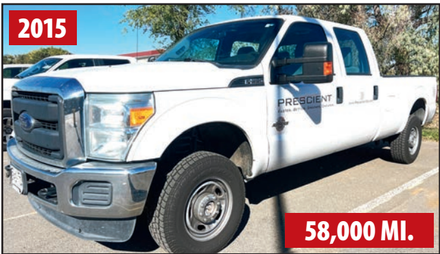
FORD F-350 POWER STROKE 4WD TRUCK