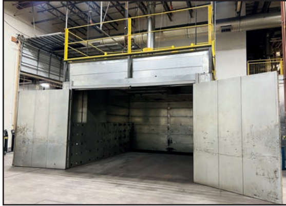
ROHNER 20' X 15' W CURE OVEN