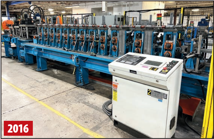
SAMCO 12-STAND ROLL FORMING LINE (STUD 2-B LINE)