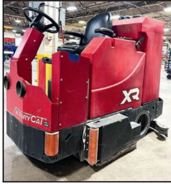
FACTORY CAT XR 40-C FLOOR SCRUBBER