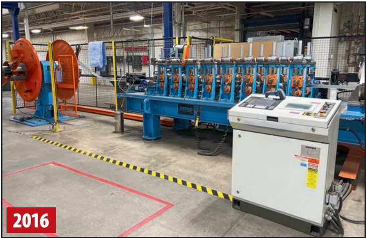
SAMCO 8-STAND ROLL FORMING LINE, S/N 9505 (BRACE LINE)

2020 SAMCO 14-STAND ROLL FORMING LINE W/ SAMCO FL 2-1/2-9-16 FLATTENER , s/n 9791, w/ AMS PLC Controls, 2" Shafts, 4.5"-9.5" Vertical Centers, 13.5" Horizontal Centers, 11" Max. Strip Width, 14-Gauge, 20 HP Drive, Dual Side Uncoiler, (1) 27.5-Ton Punch/Notching Stations, HYDREX 40-Ton Cut-Off, UNIST SPR-2000 SPROLLER Auto Lube, VIDEO JET 1520DH Ink Jet Printer, Adjustable Tooling, NOTE: Enlarged Stud 3.5"-6" Line