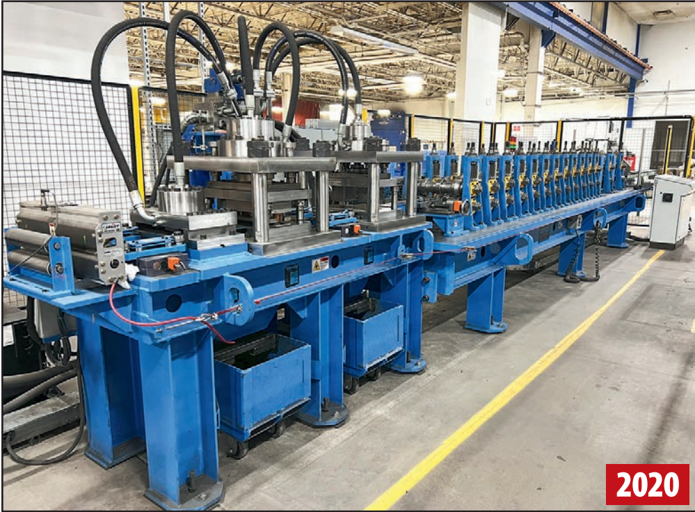
SAMCO 14-STAND ROLL FORMING LINE (ENLARGED STUD 3.5"-6" LINE)