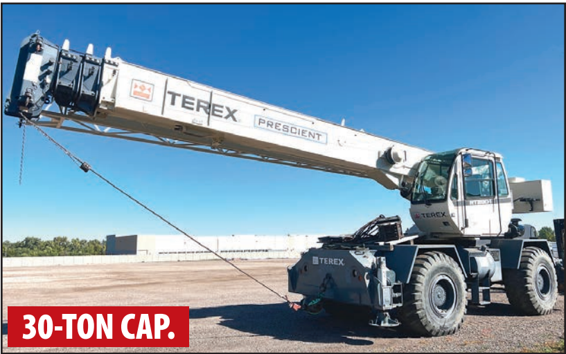
TEREX TR230-1 30-TON MOBILE CRANE