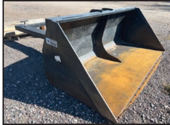
STAR 1496 HB-TK FORKLIFT BUCKET