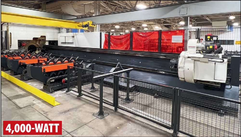
MAZAK TUBE LASER-RIGHT VIEW