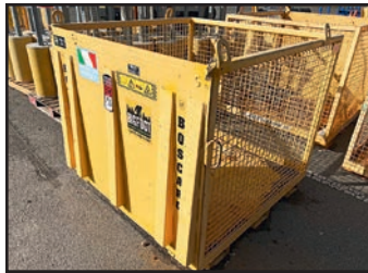
BOSCARO MATERIAL HANDLING BINS