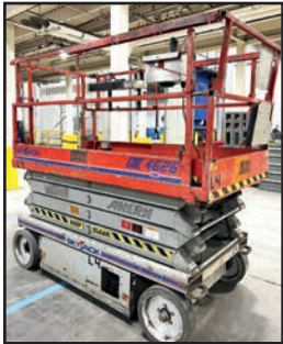
SKYJACK SJIII 4626 SCISSOR LIFT