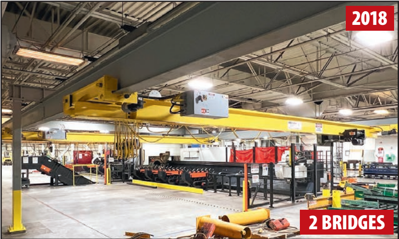
ACE GAFFEY 3-TON FREE STANDING CRANE SYSTEM