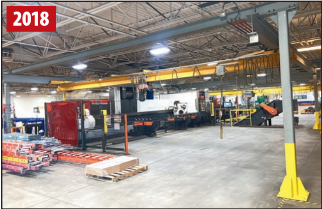
HS 1.5-TON CRANE SYSTEM