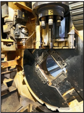
MAZAK WORK ENVELOPE, BEVEL HEAD, TAPPING UNIT

2016 MAZAK 3D FABRIGEAR 220 II (4K GEN 2) TUBE LASER, s/n 275751, w/ MAZAK FX Control, 8.66" Max. Round, 6" Max. Square, .875" Max. Material Thickness Mild Steel, 320" Max. Work Piece Length, 4,000-Watt CO2 Laser, 3-D Bevel Head, Tapping Unit, Chip Conveyor