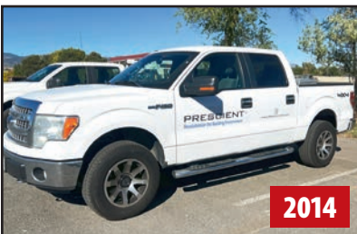
FORD F-150 XLT 4WD TRUCK