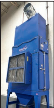
ROBOVENT FUME EXTRACTOR

(5) COILS OF ASTM A653 SS GRADE 50 MIN. G60, 9.6" x 16 Ga x Approx. 3,400 Lb per Coil