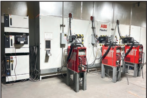
ABB WELD CELL-REAR VIEW