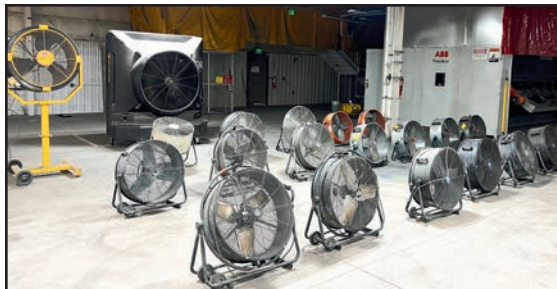
EVAPORATIVE COOLER AND SHOP FANS