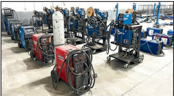
ASSORTED WELDING POWER SUPPLIES

MILLER XMT456 CC/CV MIG WELDER, (13) MILLER XMT450 MIG BOOM FEED WELDERS, (6) MILLER INVISION 352 MPA MIG WELDERS, (3) MILLER MILLERMATIC 350P MIG WELDERS, (2) LINCOLN 256 MIG WELDERS, (9) ROBOVENT AND FILTER 1 FUME EXTRACTOR/FILTERS, TECHNIA 50 KVA SPOT WELDER, (60) MILLER AIR PURIFIER MASKS, WELDING SUPPLIES, AND CONSUMABLES