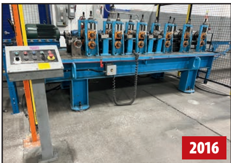
SAMCO 6-SAMCO STAND ROLL FORMING LINE, S/N 9461 (SHRINKER LINE)

COMPLETE CATALOG & INFORMATION AVAILABLE: https://perfection.global/prescient