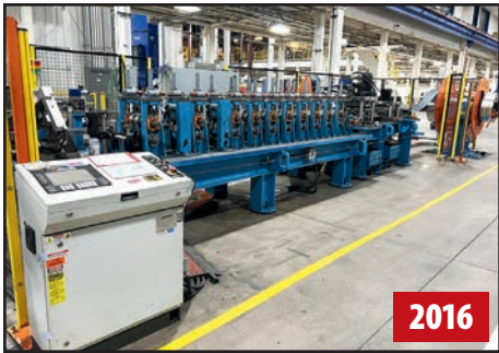
SAMCO 10-STAND ROLL FORMING LINE (TRACK MILL)

2016 SAMCO 6-STAND ROLL FORMING LINE , s/n 9461, w/ 2" Shafts, 4.5"-9.5" Vertical Centers, 13.5" Horizontal Centers, 11" Max. Strip Width, 14-Gauge, 20 HP Drive, NOTE: Shrinker Line