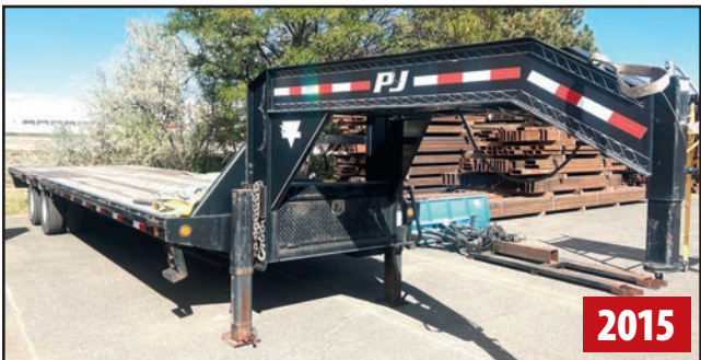
PJ TRAILERS T/A GOOSENECK TRAILER