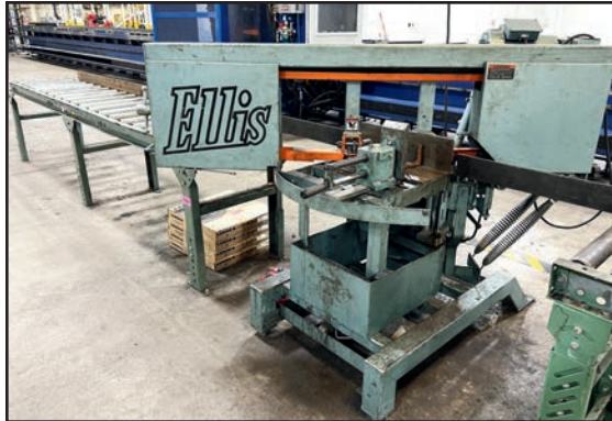
ELLIS 1800 MITERING BANDSAW