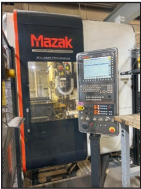
MAZAK FX CNC CONTROL