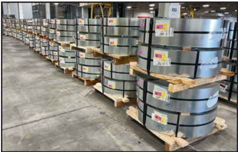
(130+) COILS OF 9.6" X 18 GA/16 GA GALVANIZED STEEL