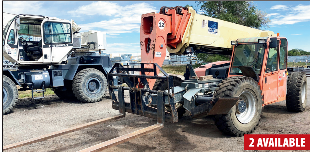
2011 JLG G12-55A 12,000 LB. TELEHANDLER

(2) 2011, 2010 JLG G12-55A 12,000 LB. TELEHANDLERS (Located in Colorado) 2015 COMBILIFT C10000XL 8,875 LB. SIDE LOADER, s/n 28649, 24" Load Centers, KOOL RG4-58-1400-1050 Reach Fork Attachment SKYJACK SJIII 4626 SCISSOR LIFT GORBEL 1,000 LB. OVER HEAD CRANE SYSTEM, 20' Span, Pendant Control (2) GORBEL 1,000 LB. FREE-STANDING JIB CRANES