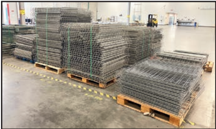
VIEW OF PALLET RACK DECKING