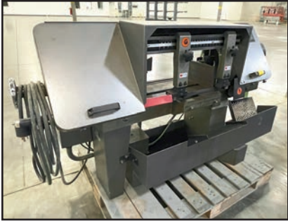
JET HORIZONTAL BANDSAW