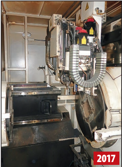
WORK ENVELOPE OF MAZAK LASER