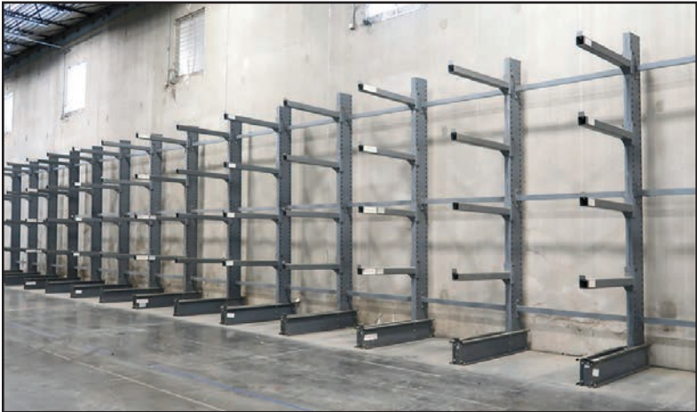
VIEW OF CANTILEVER RACKING