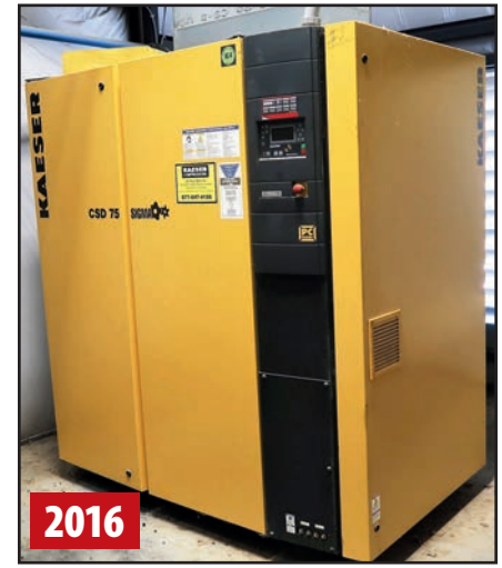
(1 OF 2) KAESER 75 HP AIR COMPRESSORS

Pre-Auction Offers Invited on Major Assets