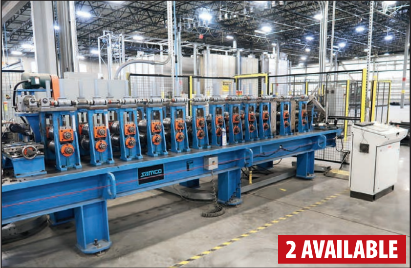
2017 SAMCO 12-STAND ROLL FORMING LINE

Pre-Auction Offers Invited on Major Assets