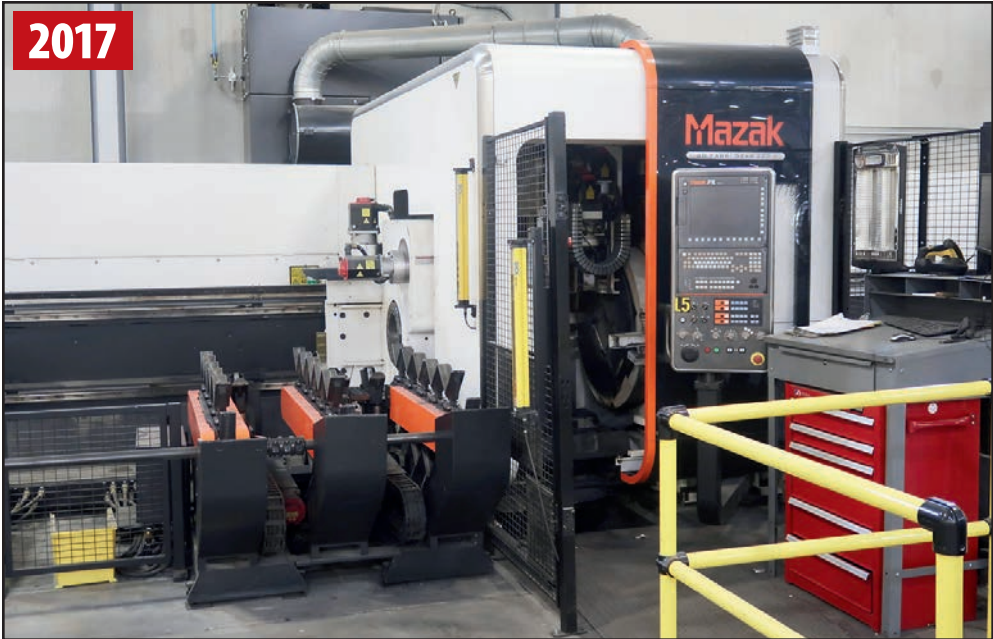
2017 MAZAK 3D FABRIGEAR 220 II (4K GEN 2) 3D TUBE LASER