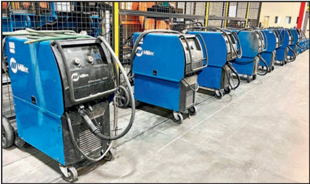
VIEW OF MILLER WELDERS