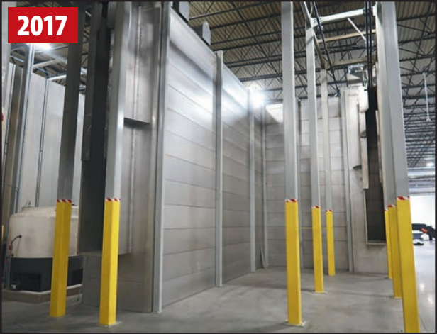
ROHNER PAINT LINE-CURE/BAKE OVEN

TUBE LASER 2017 MAZAK 3D FABRIGEAR 220 II (4K GEN 2) 3D TUBE LASER, s/n 275751, w/MAZAK FX Control, 8.66" Max. Round, 6" Max. Square, .875" Max. Material Thickness Mild Steel, 320" Max. Work Piece Length, 4,000-Watt CO2 Laser, 3-D Bevel Head, Tapping Unit, Chip Conveyor