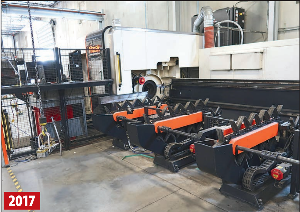
2017 MAZAK 3D FABRIGEAR 220 II (4K GEN 2) 3D TUBE LASER