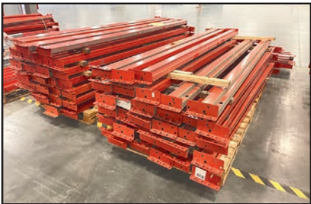
VIEW OF PALLET RACK LOAD BEAMS