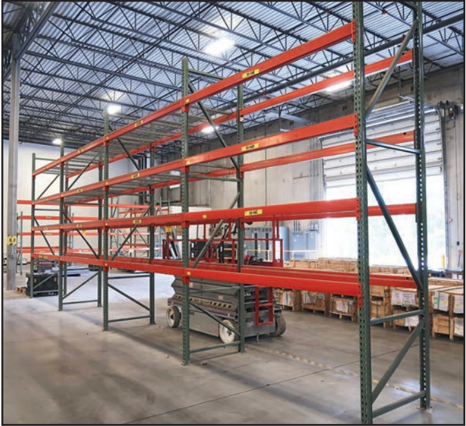
VIEW OF ADJUSTABLE PALLET RACKING