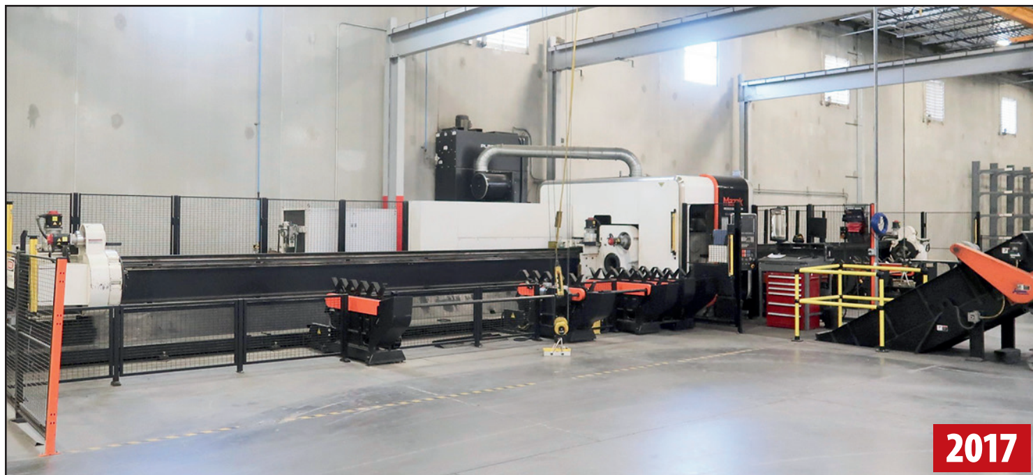
MAZAK 3D FABRIGEAR 220 II (4K GEN 2) 3D TUBE LASER