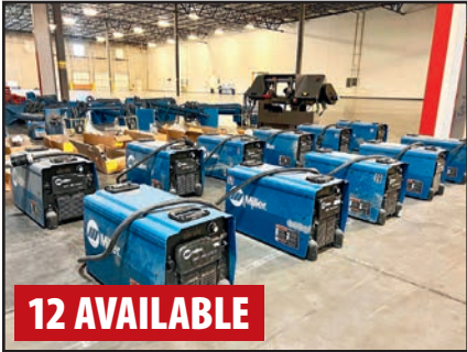
VIEW OF MILLER XMT 450 MIG WELDERS

Pre-Auction Offers Invited on Major Assets