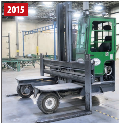
COMBILIFT 8,875 LB. LPG SIDE LOADER