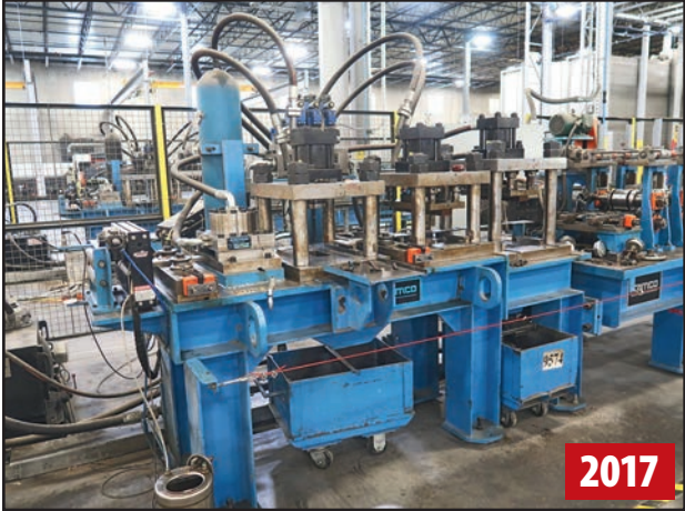
(4) SAMCO 27.5-TON PUNCHING/NOTCHING STATIONS