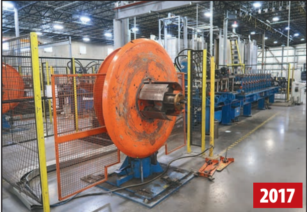
SAMCO DUAL SIDE UNCOILER