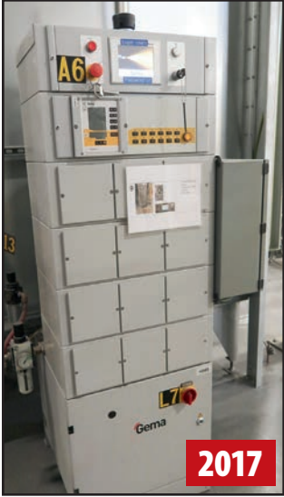
ROHNER PAINT LINE-GEMA PAINT SYSTEM