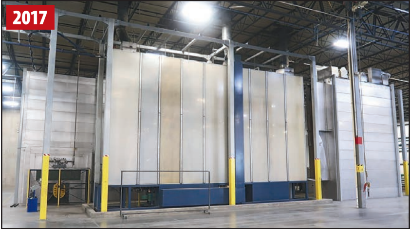
ROHNER PAINT LINE 2-STAGE WASH AND DRY-OFF OVEN