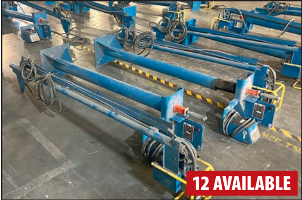
MILLER WELDING BOOM PLATFORMS