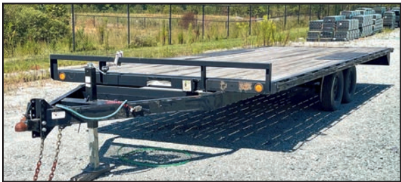
T/A TAG TRAILER