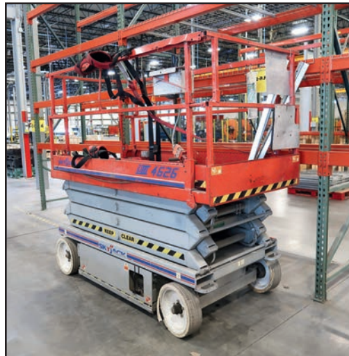
SKYJACK SJIII 4626 SCISSOR LIFT