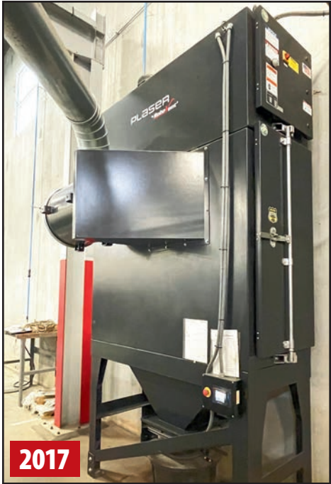
ROBOVENT PLASER FUME EXTRACTOR/FILTER (MAZAK LASER)