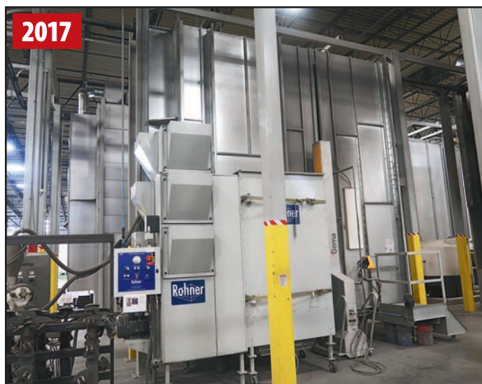
ROHNER POWDER COAT PAINT LINE