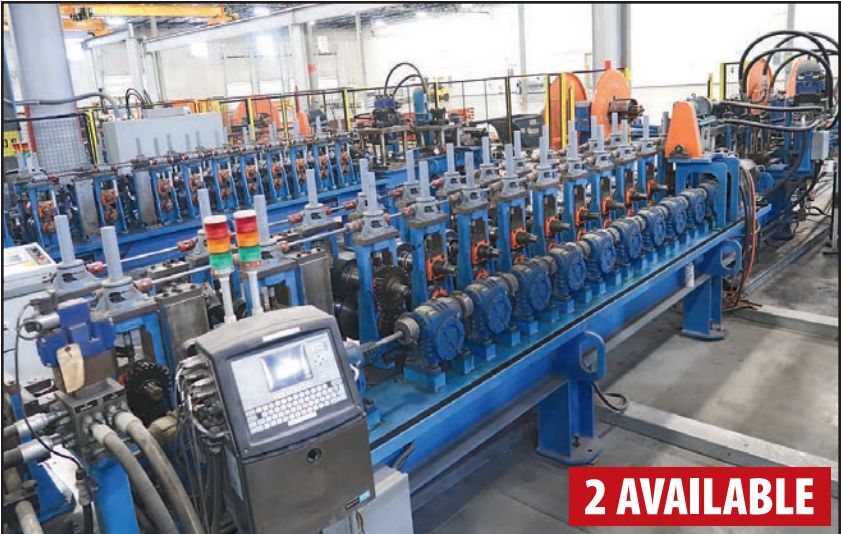
2017 SAMCO 10-STAND ROLL FORMING LINE

(2) 2017, (1) 2016 SAMCO 12-STAND ROLL FORMING LINES, s/n 9573-225 (STUD C: 3.5", 6"), 9560-025 (STUD B: 3.5", 6"), 9501-025 (STUD A: 3.5", 6"), w/AMS PLC Control, 2" Shafts, 4.5"-9.5" Vertical Centers, 13.5" Horizontal Centers, 11" Max. Strip Width, 14, 16, and 18-Gauge, 20 HP Drive, SAMCO Dual Side Uncoiler, (4) 27.5-Ton Punch/Notching Stations, HYDREX 30-Ton Cut-Off, REXROTH Hyd. Unit, UNIST SPR-2000 SPROLLER Auto Lube, VIDEO JET 1610DH Ink Jet Printer, 460 Volt