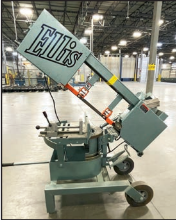
ELLIS MITERING BANDSAW