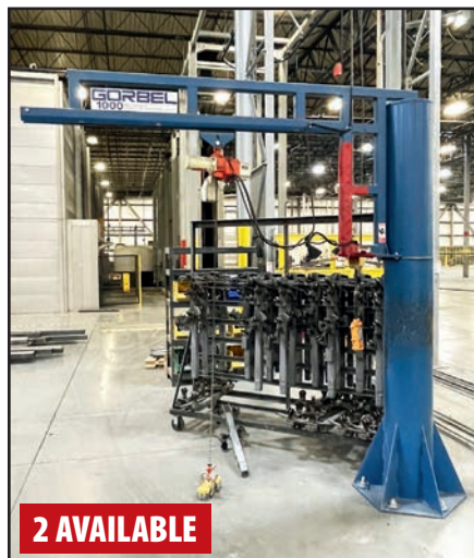
GORBEL 1,000 LB. FREE-STANDING JIB CRANES