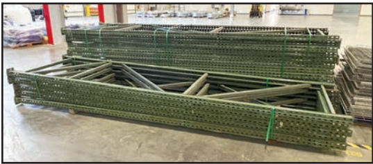
VIEW OF PALLET RACK UPRIGHTS

JET J-7020 HORIZONTAL BAND SAW, ELLIS 1600 MITERING BAND SAW, JET J-2550 20" FLOOR DRILL PRESS, LARGE QUANTITY OF PALLET RACKING, CANTILEVER RACKING, ROLLER CONVEYORS, FIREPROOF CABINETS, HOSE REELS, HOISTS, ENGINE HOIST, ROLLER-STANDS, DOCK BARRIER, SAFETY RAIL, MISCELLANEOUS LIGHTING, SHOP FANS, CABINETS, WORK TABLES AND SMALL TOOLS