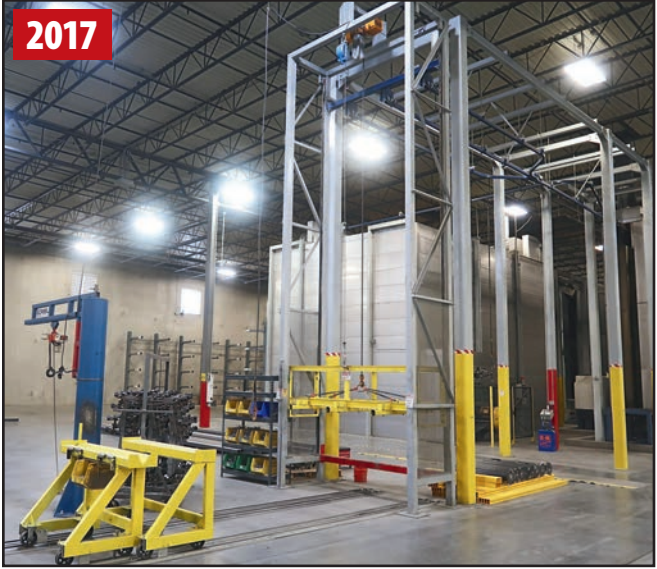
ROHNER PAINT LINE-LOADING STATION AND 2-STAGE WASH