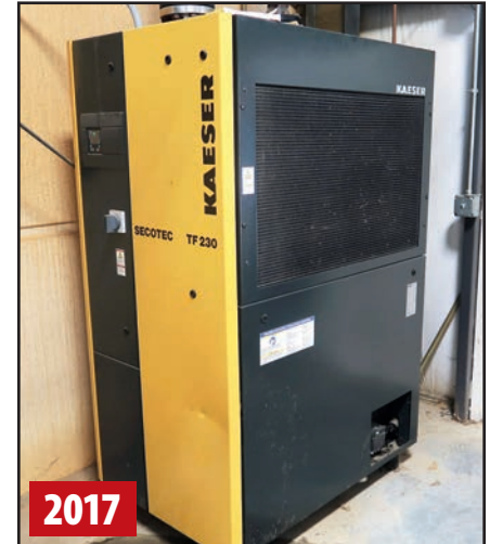
KAESER SECOTEC TF230 AIR DRYER

(2) 2016 KAESER CSD75 75 HP AIR COMPRESSORS, s/n 1045, 1041 w/175 PSIG, 283 CFM, Sigma 2 PLC Control 2017 KAESER SECOTEC TF230 AIR DRYER, s/n 1136, w/232 Max. Gauge Working Pressure KAESER KCF400 OIL/WATER SEPARATOR, s/n ANKCF400 2017 STEEL FAB AIR HOLDING TANK, MAWP 200 PSI at 400 Deg., s/n HD.353SH.375