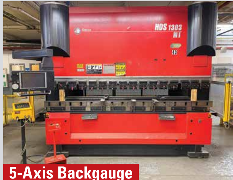
5-Axis Backgauge AMADA HDS-1303NT CNC HYDRAULIC PRESS BRAKE