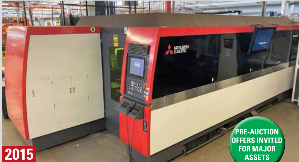
2015 2500W MITSUBISHI ML3015NX-F CNC FIBER LASER

FULL CLOSURE — MAJOR POP DISPLAY FABRICATION & ASSEMBLY FACILITY