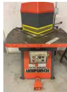
COMACA EHN 260 UNIPUNCH HYDRAULIC NOTCHER