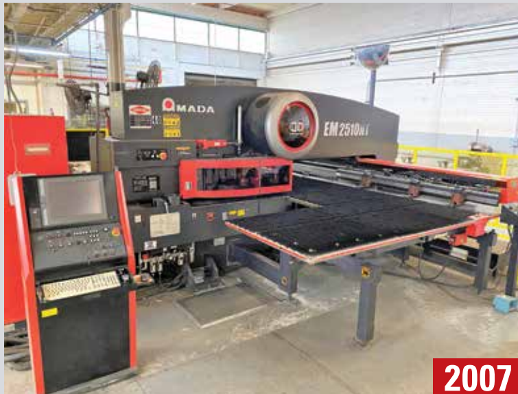
2007 AMADA EM2510NT CNC TURRET PUNCH PRESS