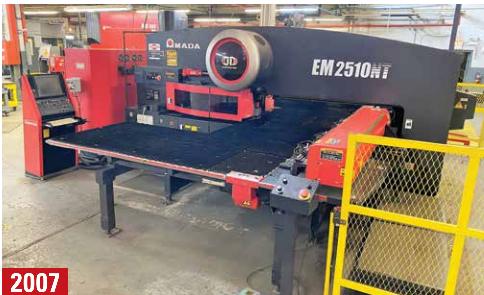
2007 AMADA EM2510NT CNC TURRET PUNCH PRESS