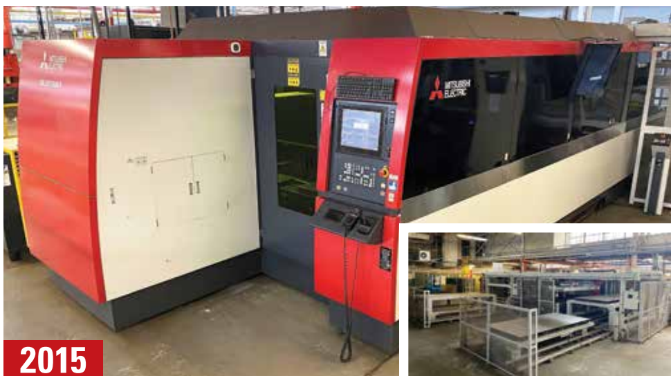
2015 MITSUBISHI ML3015NX-F CNC FIBER LASER

View our current auction schedule at perfectionindustrial.com