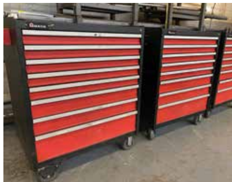
AMADA TOOLING CABINETS W/ LARGE SELECTION OF PUNCH TOOLING

Also Available: Amada Tooling Cabinets w/ Large Selection of Punch Tooling