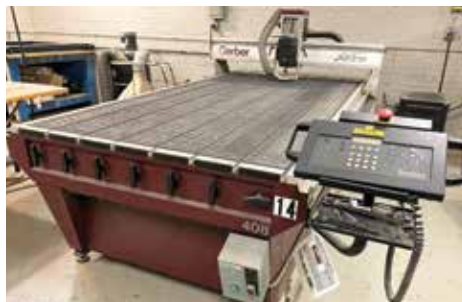
GERBER SABRE 408 ROUTER