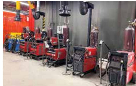
VIEW OF WELDERS