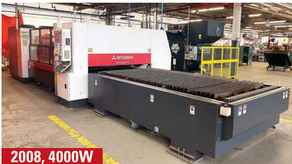
2008, 4000W MITSUBISHI ML3015LVP PLUS II CO2 CNC LASER SYSTEM