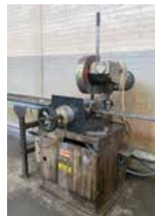
KALAMAZOO CS-350P COLD SAW