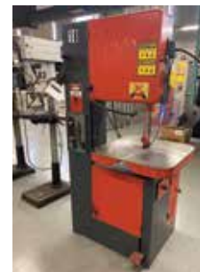
GROB NS18 VERTICAL BANDSAW