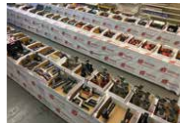
HAND, POWER, AND PNEUMATIC TOOLS

Also Available: Over (100) Sections of Pallet Racking, Large Selection of Sheet Stock, Hand Tools, Power Tools, Pneumatic Tools, Pallet Jacks, Shop Fans, Flammable Liquids Cabinets, Displays, Shipping Accessories, Collapsible Crates, Work Tables, Large Assortment of Fasteners, Office Area, Conference Tables, Seating Area, Breaks Rooms, Appliances, Flatscreen TVs and Monitors up to 82"!