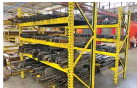
LARGE SELECTION OF PRESS BRAKE TOOLING