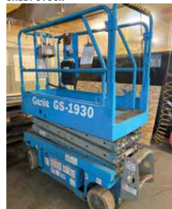
GENIE GS-1930 SCISSOR MAN LIFT