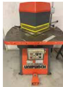
COMACA EHN 260 UNIPUNCH HYDRAULIC NOTCHER