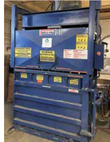
WASTE PROCESSING EQUIPMENT MAX-PAK MP60HD VERTICAL BALER