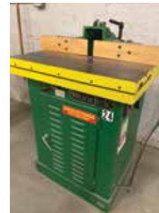
WOODTEK WOOD SHAPER