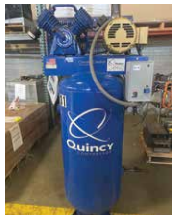
QUINCY QTS5QCB AIR COMPRESSOR