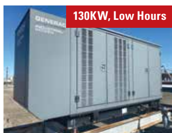
130KW, Low Hours