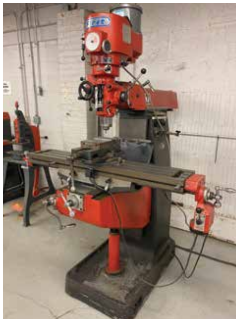
SHARP HCS MILLING MACHINE