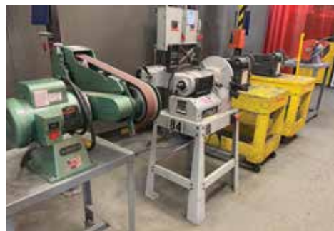
LARGE SELECTION OF GRINDERS/SANDERS