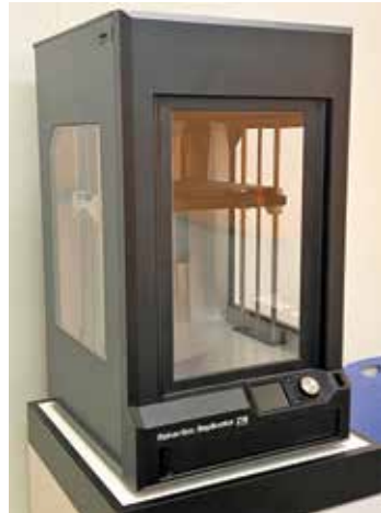
MAKERBOT REPLICATOR Z18 5TH GENERATION 3D PRINTER

MAKERBOT Replicator Z18 5th Generation 3D Printer , s/n MP05950