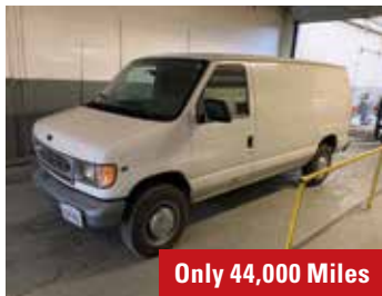
Only 44,000 Miles