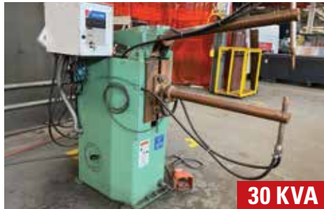
30 KVA FEDERAL RA2-30-30 SPOT WELDER

Also Available: ROYERSFORD EXCELSIOR No. 10 Kick Press, ROTEX R-12 Hand Rotary Punch, NIAGARA No. 3A Bar Folder Brake, Sanders, Drill Presses, Dual End Grinders, DEWALT Miter Saws, CHICAGO ELECTRIC 10" Industrial Tile/Brick Saw, ROCKWELL 34-461 10" Unisaw Table Saw and more