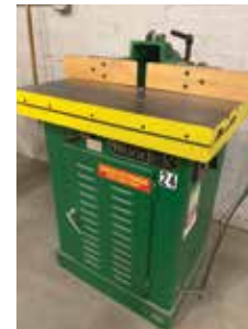
WOODTEK WOOD SHAPER