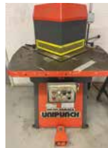
COMACA EHN 260 UNIPUNCH HYDRAULIC NOTCHER