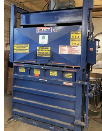
WASTE PROCESSING EQUIPMENT MAX-PAK MP60HD VERTICAL BALER