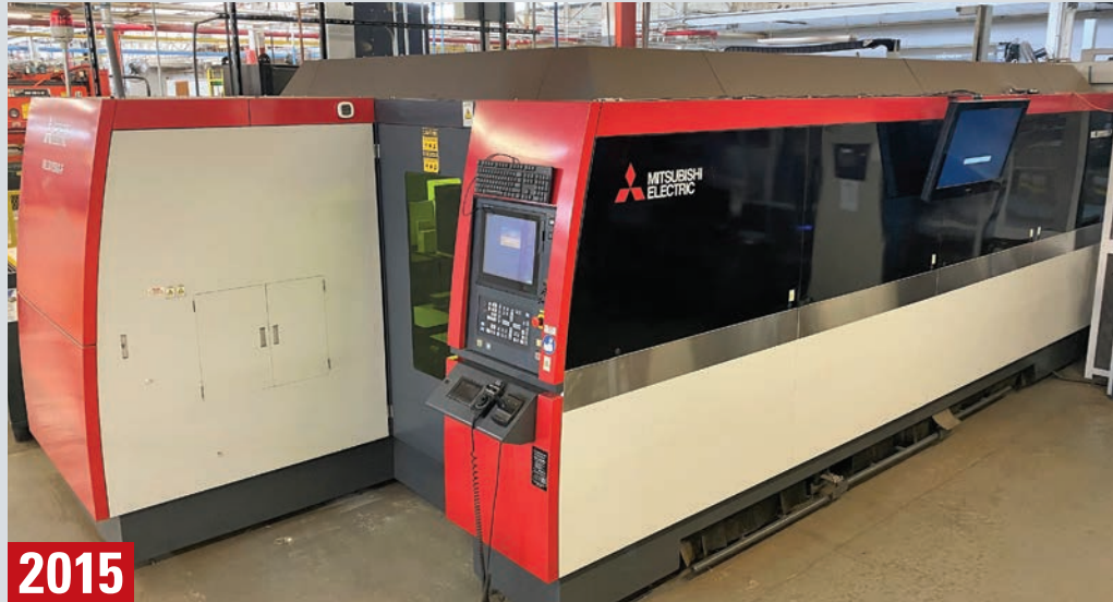
2015 2500W MITSUBISHI ML3015NX-F CNC FIBER LASER

FULL CLOSURE — MAJOR POP DISPLAY FABRICATION & ASSEMBLY FACILITY