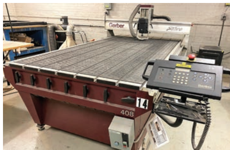
GERBER SABRE 408 ROUTER