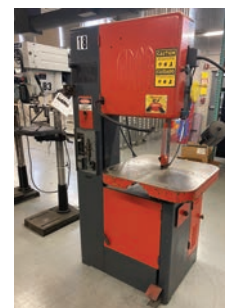
GROB NS18 VERTICAL BANDSAW