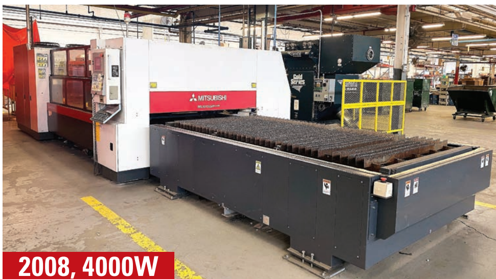
2008, 4000W MITSUBISHI ML3015LVP PLUS II CO2 CNC LASER SYSTEM