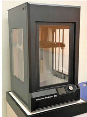
MAKERBOT REPLICATOR Z18 5TH GENERATION 3D PRINTER

MAKERBOT Replicator Z18 5th Generation 3D Printer , s/n MP05950