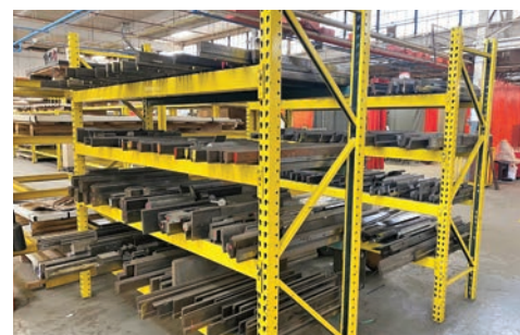
LARGE SELECTION OF PRESS BRAKE TOOLING