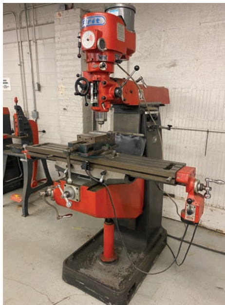
SHARP HCS MILLING MACHINE