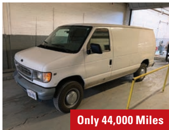
Only 44,000 Miles