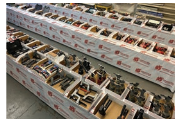
HAND, POWER, AND PNEUMATIC TOOLS

Also Available: Over (100) Sections of Pallet Racking, Large Selection of Sheet Stock, Hand Tools, Power Tools, Pneumatic Tools, Pallet Jacks, Shop Fans, Flammable Liquids Cabinets, Displays, Shipping Accessories, Collapsible Crates, Work Tables, Large Assortment of Fasteners, Office Area, Conference Tables, Seating Area, Breaks Rooms, Appliances, Flatscreen TVs and Monitors up to 82"!