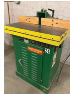
WOODTEK WOOD SHAPER