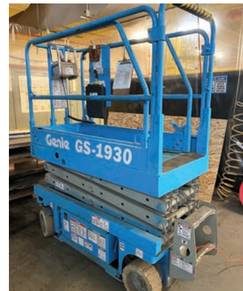
GENIE GS-1930 SCISSOR MAN LIFT