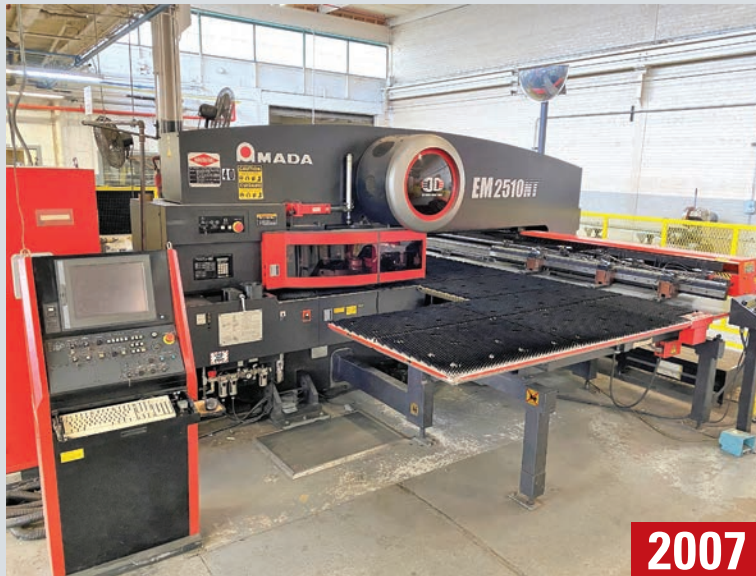
2007 AMADA EM2510NT CNC TURRET PUNCH PRESS