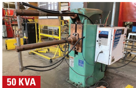
FEDERAL RA2-30-50 SPOT WELDER