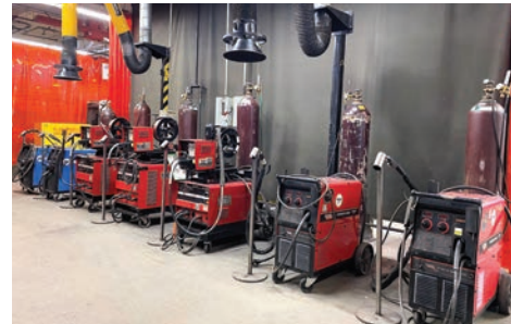
VIEW OF WELDERS