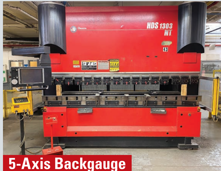
5-Axis Backgauge AMADA HDS-1303NT CNC HYDRAULIC PRESS BRAKE