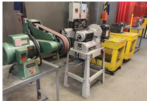
LARGE SELECTION OF GRINDERS/SANDERS

Also Available: ROYERSFORD EXCELSIOR No. 10 Kick Press, ROTEX R-12 Hand Rotary Punch, NIAGARA No. 3A Bar Folder Brake, Sanders, Drill Presses, Dual End Grinders, DEWALT Miter Saws, CHICAGO ELECTRIC 10" Industrial Tile/Brick Saw, ROCKWELL 34-461 10" Unisaw Table Saw and more