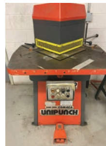
COMACA EHN 260 UNIPUNCH HYDRAULIC NOTCHER