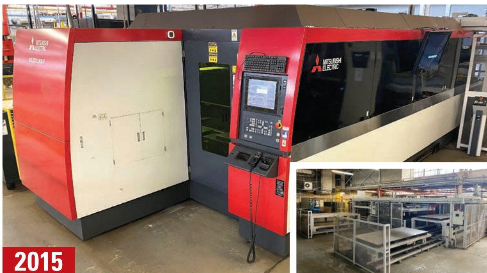
2015 MITSUBISHI ML3015NX-F CNC FIBER LASER

View our current auction schedule at perfectionindustrial.com