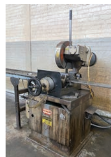
KALAMAZOO CS-350P COLD SAW