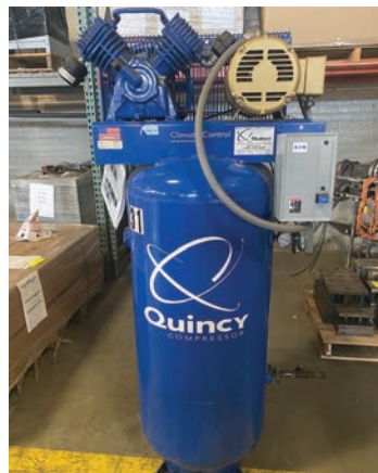
QUINCY QTS5QCB AIR COMPRESSOR