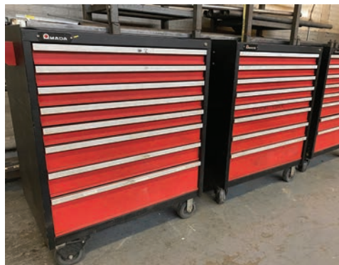
AMADA TOOLING CABINETS W/ LARGE SELECTION OF PUNCH TOOLING

Also Available: Amada Tooling Cabinets w/ Large Selection of Punch Tooling