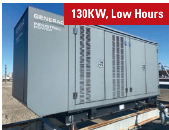
130KW, Low Hours