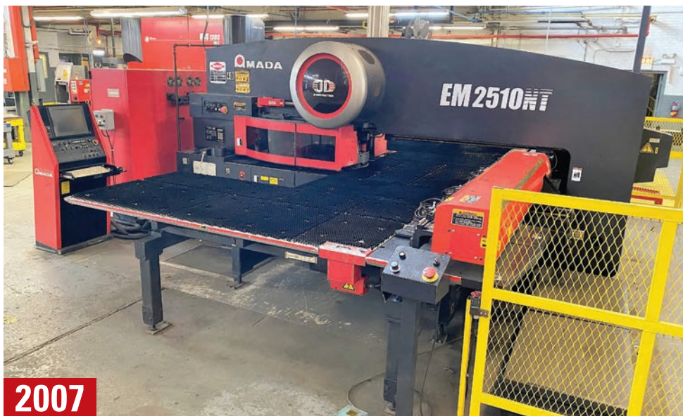
2007 AMADA EM2510NT CNC TURRET PUNCH PRESS