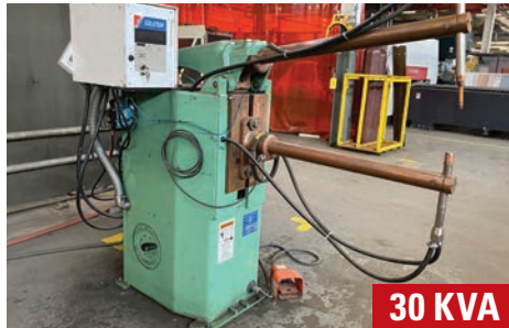
FEDERAL RA2-30-30 SPOT WELDER

Also Available: PLYMOVENT Snorkel Type Fume Extractors, Welding Clamps, Welding Tables, Welding Guns