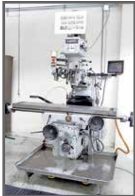
< LAGUN FTV-4L VERTICAL MILLING MACHINE