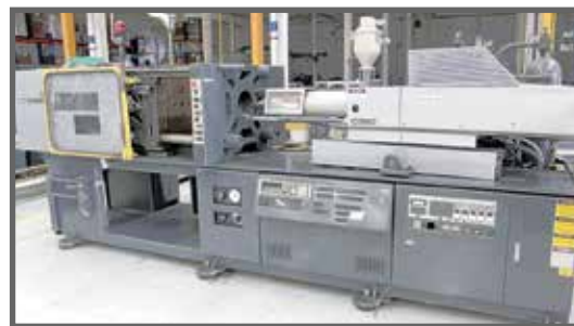
125 TON SUMITOMO SG125-HIIRO-M11A INJECTION MOLDING MACHINE