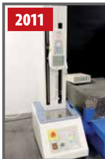
IMADA MX-5000N-E FORCE MEASURING MACHINE