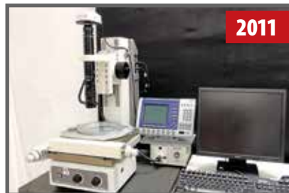
NIKON MM-400 MICROSCOPE