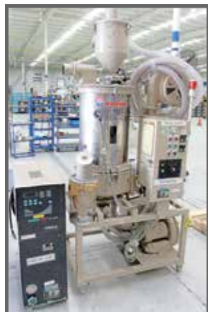
NISSUI KAKO NB-045-222 HOPPER/DRYER