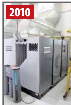
(2) 223 HP ATLAS COPCO GA160FF AIR COMPRESSORS