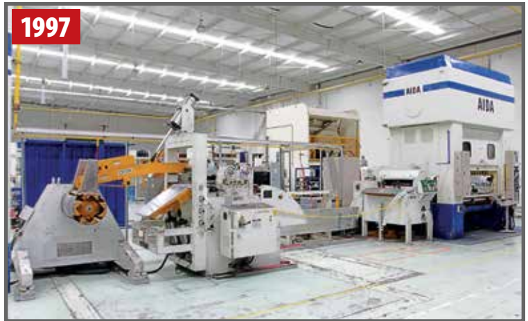
ORII MH-08HCAA-DZK UNCOILER, LHJ08ACAB-X STRAIGHTENER, ACB08NAFX ROLL FEEDER