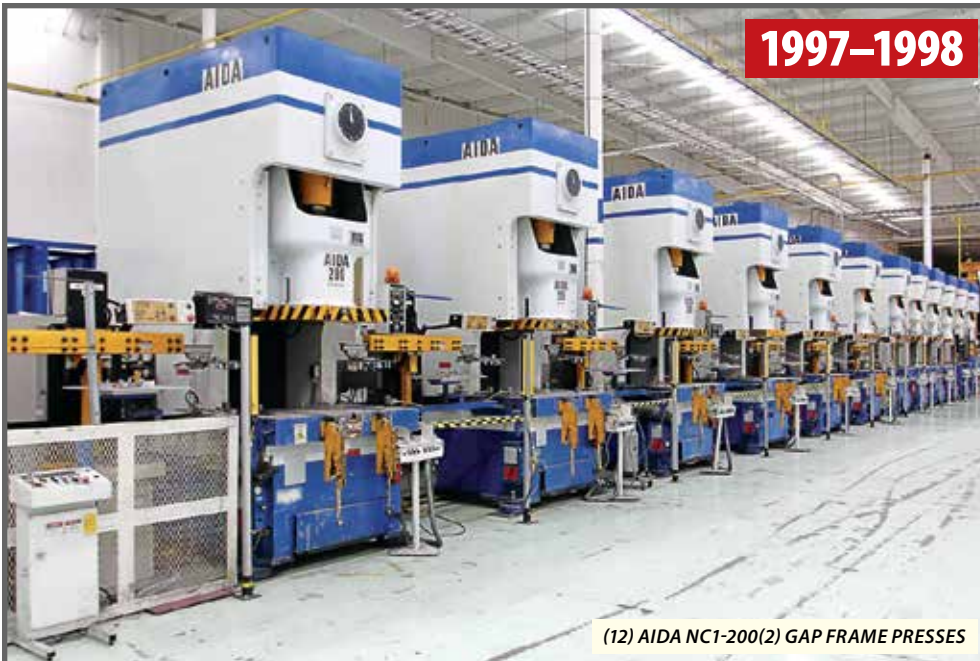
(12) AIDA NC1-200(2) GAP FRAME PRESSES