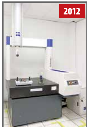
ZEISS CONTURA G2 CMM