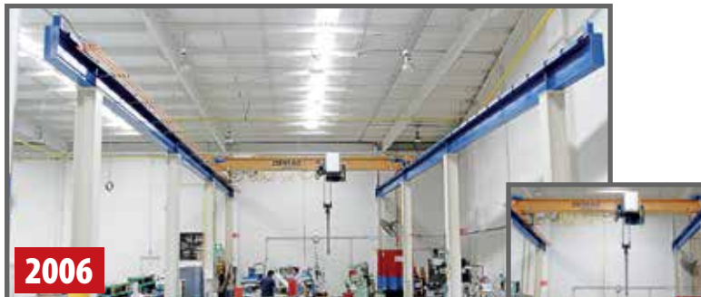
10 TON DEMAG 50' X 23' APPROX. FREE STANDING BRIDGE CRANE