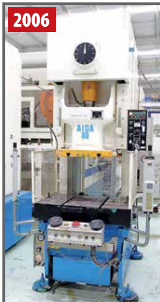
(2) AIDA NC1-80(2) GAP FRAME PRESSES