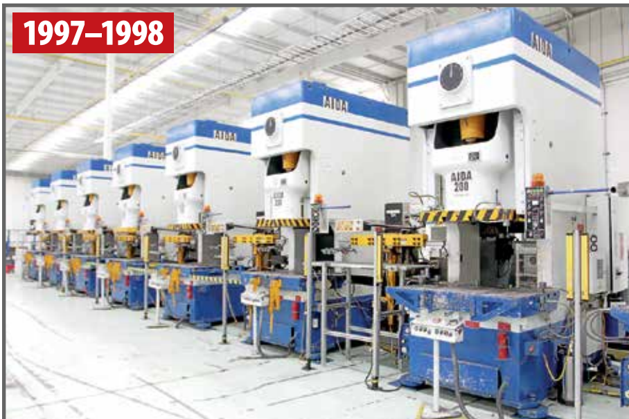
(7) AIDA NC1-200(2) GAP FRAME PRESS W/ORII TRANSFER ROBOTS