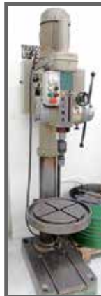
> KIWA KUB-560FS DRILL PRESS