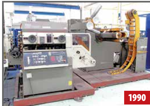
ORII LCC 08HP2JBX-YHS UNCOILER, STRAIGHTENER AND ROLL FEEDER