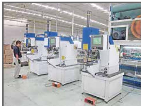
HAEGER 824 INSERTION MACHINES