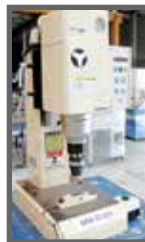
YOSHIKAWA US-66 RIVETING MACHINE