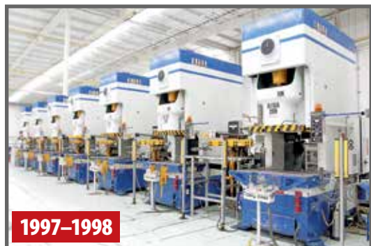
(7) AIDA NC1-200(2) GAP FRAME PRESS W/ORII TRANSFER ROBOTS

COMPLETE FACILITY CLOSURE OF ELECTRONIC PARTS MFR.