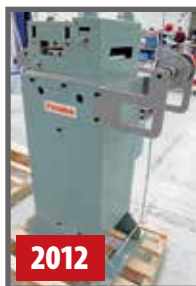
FUTABA UR-150-2 LEVELER