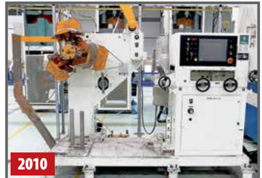
AIDA LFL-300E UNCOILER, STRAIGHTENER AND ROLL FEEDER

275 TON CHIN FONG G2-250 DOUBLE CRANK GAP FRAME PRESSES , S/N B00926, (2010), 11.02" Slide Stroke, 20–35 SPM, 21.65" Die Height, 4.72" Slide Adjustment, 82.67" x 27.55" Slide Area, 106.29" x 31.49" Bolster Area, 30 HP Main Motor