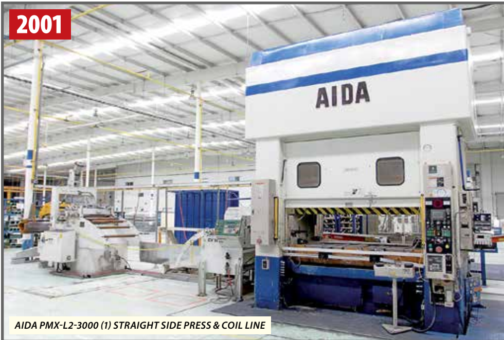
AIDA PMX-L2-3000 (1) STRAIGHT SIDE PRESS & COIL LINE