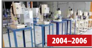
(7) YOSHIKAWA US-66 AND US-1 RIVETING MACHINES