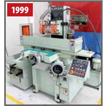
KURODA GS-BMHFL SURFACE GRINDER