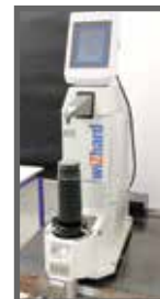
MITUTOYO WIZHARD HARDNESS TESTER