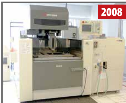
MITSUBISHI FA20S WIRE EDM