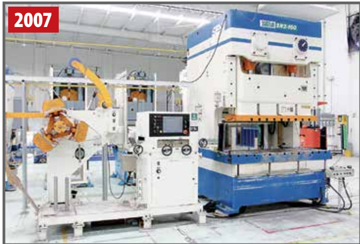
SEYI SN2-160 DOUBLE CRANK, GAP FRAME PRESS AND COIL LINE