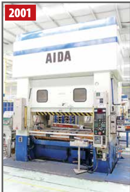
AIDA PMX-L2-3000 (1) STRAIGHT SIDE PRESS