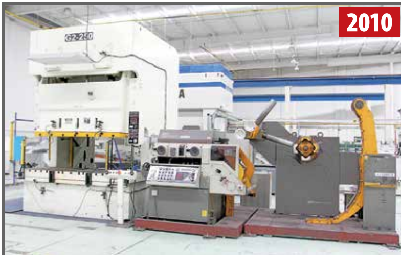
CHIN FONG G2-250 DOUBLE CRANK, GAP FRAME PRESS AND COIL LINE

(12) 220 TON AIDA NC1-200(2) GAP FRAME PRESSES, (1997–1998), 9.84" Slide Stroke, 25–45 SPM, 17.71" Die Height, 4.33" Slide Adjustment, 34.6" x 25.6" Slide Area, 54.7" x 33" Bolster Area, (7) with Cushions, Hydraulic Clamping, Die Rails, 20 HP Main Motor, w/(7) ORII RY-120L-2GS Transfer Robots