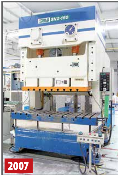
SEYI SN2-160 DOUBLE CRANK, GAP FRAME PRESS