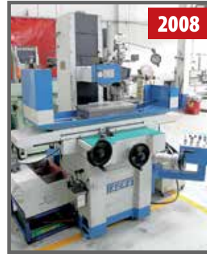
ACRA ASG-1020HS SURFACE GRINDER