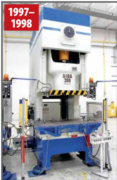
(12) AIDA NC1-200(2) GAP FRAME PRESSES