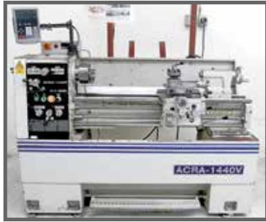
ACRA 1440V TOOL ROOM LATHE