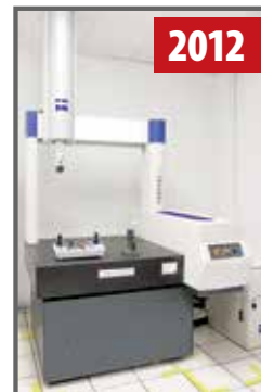
ZEISS CONTURA G2 CMM

Sale Date: Tuesday, June 24 at 10:00 AM PDT