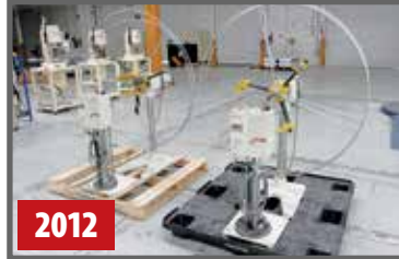
(2) FUTABA ARV100C AUTO COIL REELS