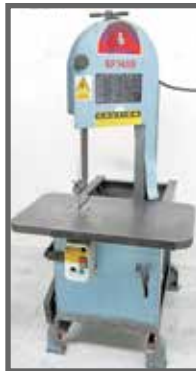
ROLL-IN SAW EF1459 VERTICAL BANDSAW