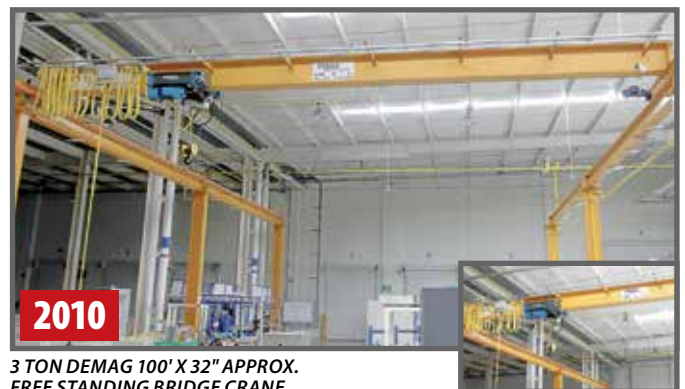
3 TON DEMAG 100' X 32" APPROX. FREE STANDING BRIDGE CRANE

LANTECH Q300 STRETCH WRAPPING MACHINE, S/N QM029414, (2012), 65" Dia. Table 120V, Single Phase