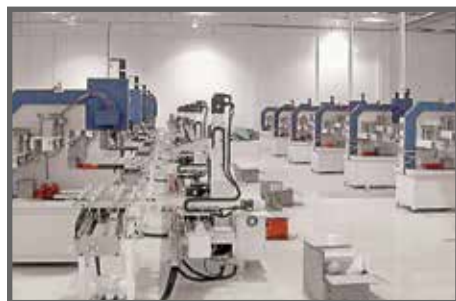
HAEGAR INSERTION MACHINES & SAILOR ROBOTS