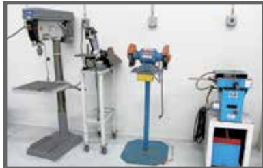
GRINDERS AND DRILLS