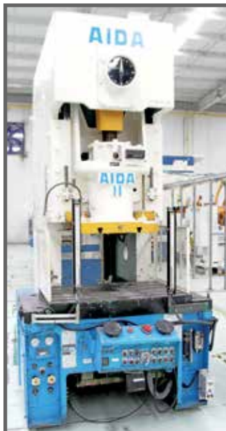
(2) AIDA C1-110(2) GAP FRAME PRESSES