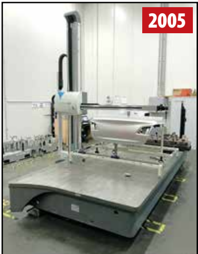
DEA PRIMA C1 40 21 CMM