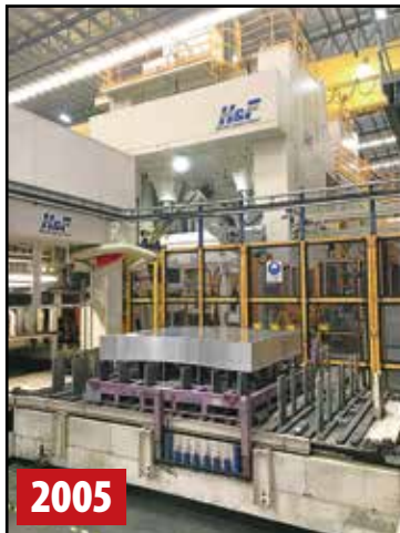
H&F DESTACKING FEEDER