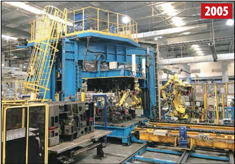
REAR DOOR LINE

2005 FRONT DOOR LINE-DUAL STATION HEM PRESS, 2500mm x 2500mm Bed Size Fanuc R-2000iA/200EW (Qty 3-2004), Fanuc R-2000iA/165EW (Qty 10-2004), Fanuc M-16iB/20 (Qty 2-2004)