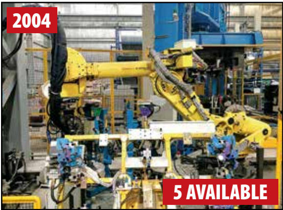
FANUC R-2000iB/165EW ROBOTS