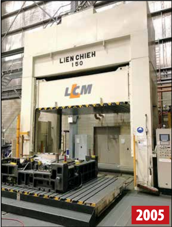
150-TON LIEN CHIEH LDSM-150 DIE SPOTTING PRESS

2005 150-TON LIEN CHIEH LDSM-150 DIE SPOTTING PRESS, s/n KHM08531, 1800mm Stroke, 2500mm Daylight, 4200mm x 2500mm Slide and Bolster Area, 60-Ton Raising Capacity, 70mm/sec Down and Up, 5mm/sec Pressing