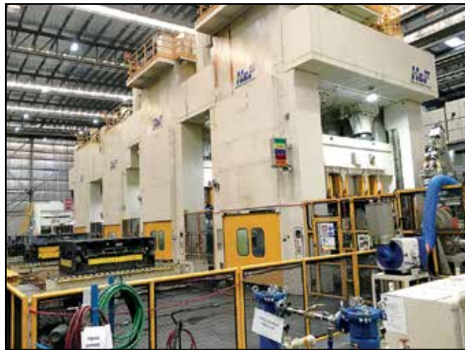
H&F PRESS SIDE PROFILE