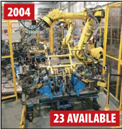
FANUC R-2000iA/165EW ROBOT