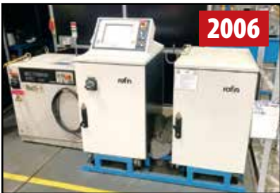
ROFIN DLO28Q CONTROLS