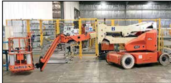
JLG E400AJP BOOM LIFT

GENERAL ASSETS FOR SALE INCLUDE: MACHINE TOOLS, GRACO PAINT MIXERS AND SEALING SYSTEMS, INSPECTION EQUIPMENT, MAINTENANCE DEPARTMENT, FANUC WELDING AND SEALING ROBOTS, ROBOT SPARES, FACILITY SPARES, MOBILE EQUIPMENT AND OFFICE FURNITURE