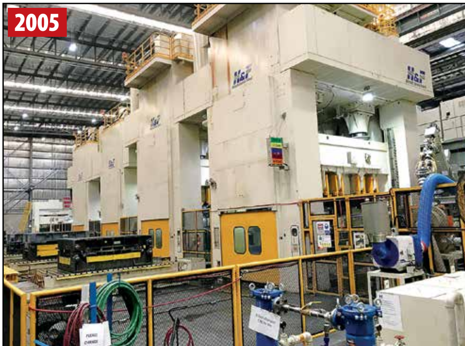
H&F PRESS SIDE PROFILE