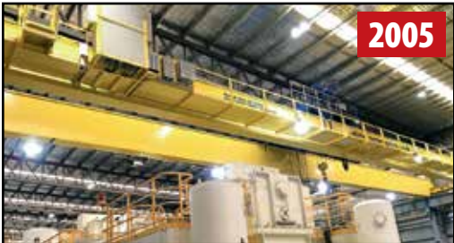
30-TON JON MONOCRANE BRIDGE CRANE