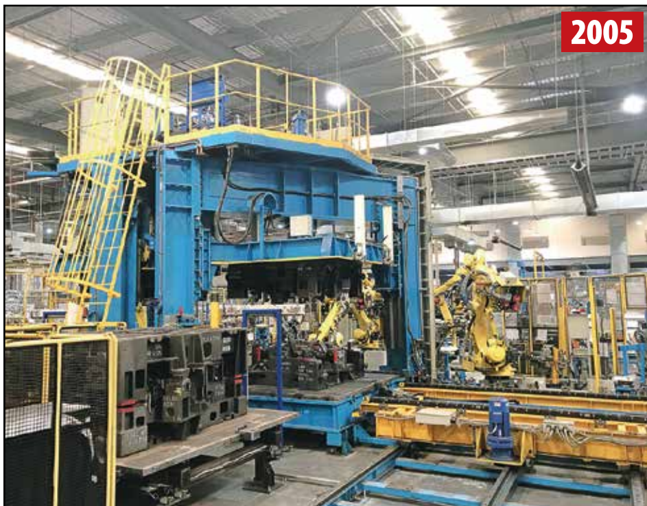
REAR DOOR LINE-DUAL STATION HEM PRESS