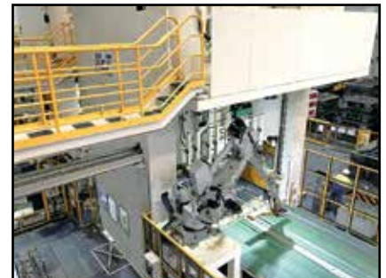
H&F EXIT CONVEYOR AND ROBOT