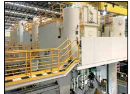
H&F PRESS CROWNS AND WALKWAYS