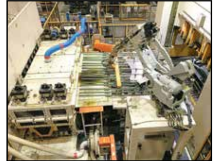
H&F MATERIAL DESTACKING ROBOT TRANSFER