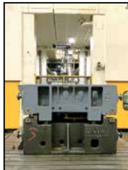
H&F ROLLING BOLSTER