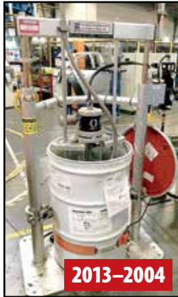
GRACO PAINT MIXER