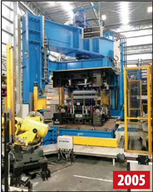
SINGLE STATION HEM PRESS

2005 REAR DOOR LINE-DUAL STATION HEM PRESS, 2500mm x 2500mm Bed Size Fanuc R2000iB/210F (Qty 2-2013), Fanuc R-2000iA/200EW (Qty 1-2004), Fanuc R-2000iA/165EW (Qty 7-2004), Fanuc M-16iB/20 (Qty 2-2004)