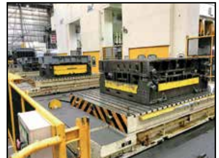
H&F ROLLING BOLSTERS