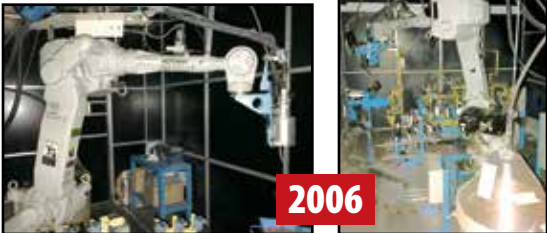
INSIDE ROFIN LASER – MOTOMAN ROBOT

30-TON JON MONOCRANE BRIDGE TYPE, DOUBLE GIRDER TOP RUNNING CRANE, w/10-Ton Auxiliary Hoist