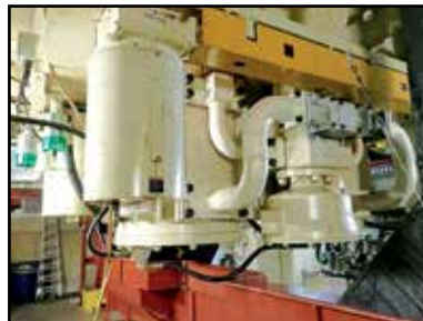
H&F PRESS CUSHION