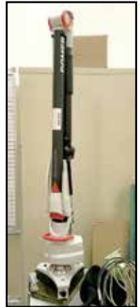
ROMER ABSOLUTE ARM PORTABLE CMM

To discuss your requirements for an auction, please call Perfection Industrial +1-847-545-6374