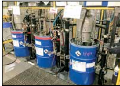
GRACO PAINT MIXERS