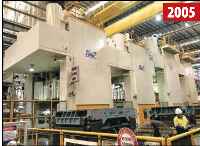
H&F PRESS SIDE PROFILE

(5) MOTOMAN EP4000 6-AXIS TRANSFER ROBOTS , 200kg Capacity, Yasnac XRC Controller