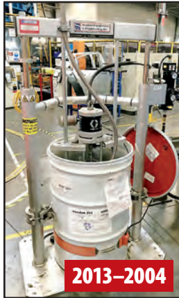
GRACO PAINT MIXER

To discuss your requirements for an auction, please call Perfection Industrial +1-847-545-6374