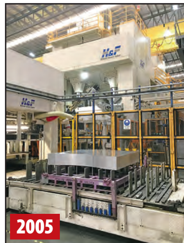
H&F DESTACKING FEEDER