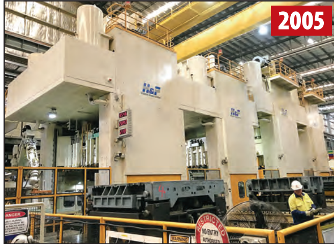
H&F PRESS SIDE PROFILE

(5) MOTOMAN EP4000 6-AXIS TRANSFER ROBOTS , 200kg Capacity, Yasnac XRC Controller