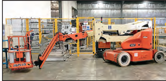
JLG E400AJP BOOM LIFT

GENERAL ASSETS FOR SALE INCLUDE: MACHINE TOOLS, GRACO PAINT MIXERS AND SEALING SYSTEMS, INSPECTION EQUIPMENT, MAINTENANCE DEPARTMENT, FANUC WELDING AND SEALING ROBOTS, ROBOT SPARES, FACILITY SPARES, MOBILE EQUIPMENT AND OFFICE FURNITURE