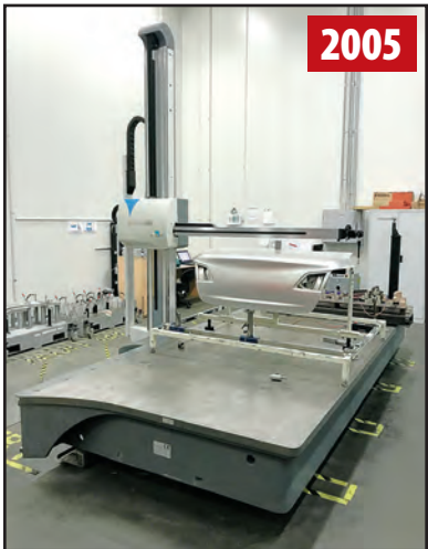
DEA PRIMA C1 40 21 CMM