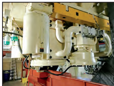
H&F PRESS CUSHION