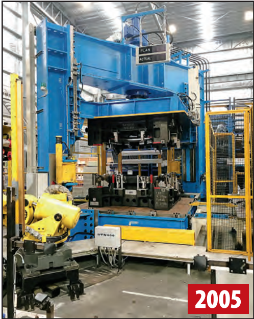
SINGLE STATION HEM PRESS

2005 REAR DOOR LINE-DUAL STATION HEM PRESS, 2500mm x 2500mm Bed Size Fanuc R2000iB/210F (Qty 2-2013), Fanuc R-2000iA/200EW (Qty 1-2004), Fanuc R-2000iA/165EW (Qty 7-2004), Fanuc M-16iB/20 (Qty 2-2004)