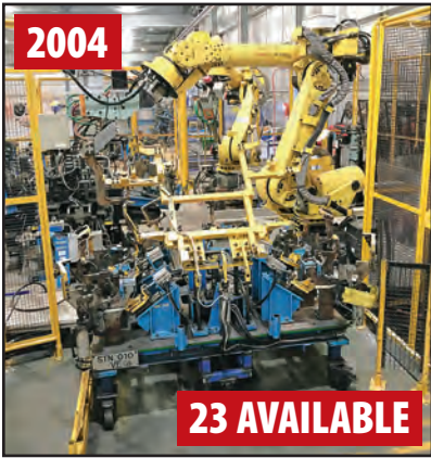
FANUC R-2000iA/165EW ROBOT