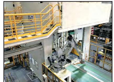
H&F EXIT CONVEYOR AND ROBOT