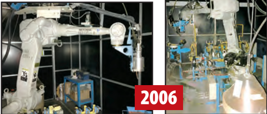
INSIDE ROFIN LASER – MOTOMAN ROBOT

30-TON JON MONOCRANE BRIDGE TYPE, DOUBLE GIRDER TOP RUNNING CRANE, w/10-Ton Auxiliary Hoist