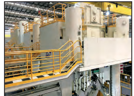
H&F PRESS CROWNS AND WALKWAYS