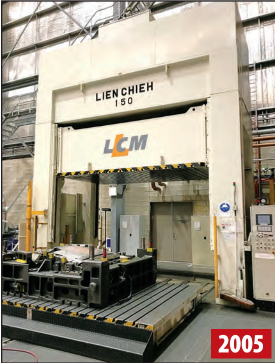
150-TON LIEN CHIEH LDSM-150 DIE SPOTTING PRESS

2005 150-TON LIEN CHIEH LDSM-150 DIE SPOTTING PRESS, s/n KHM08531, 1800mm Stroke, 2500mm Daylight, 4200mm x 2500mm Slide and Bolster Area, 60-Ton Raising Capacity, 70mm/sec Down and Up, 5mm/sec Pressing