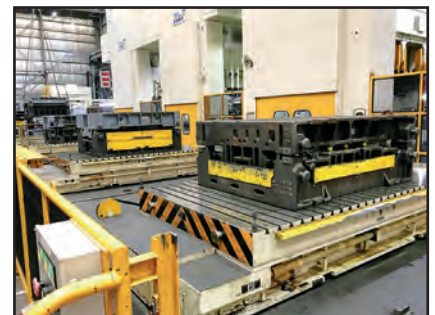
H&F ROLLING BOLSTERS

To view videos of the above press line under power, please visit www.perfectionindustrial.com , or email pressline@perfectionindustrial.com for further information, or to arrange an under power inspection of the line.