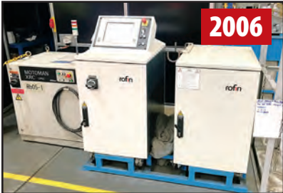
ROFIN DLO28Q CONTROLS