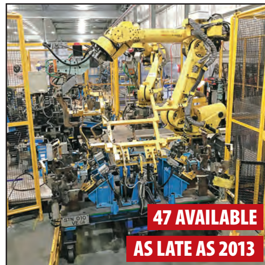
ASSORTMENT OF FANUC ROBOTS

Pristine Assets Including– H&F 1,800-Ton Press Line, Die-Spotting, FANUC Robots for Welding & Sealing, Tool Room, Inspection & Material Handling