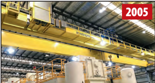
30-TON JON MONOCRANE BRIDGE CRANE