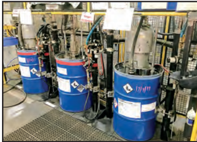
GRACO PAINT MIXERS

To discuss your requirements for an auction, please call Perfection Industrial +1-847-545-6374