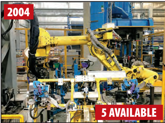
FANUC R-2000iB/165EW ROBOTS