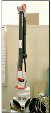
ROMER ABSOLUTE ARM PORTABLE CMM

The Auction sale will be conducted by Slattery Asset Advisory. Further information and specifics will be available shortly. Slattery Asset Advisory can be contacted below: