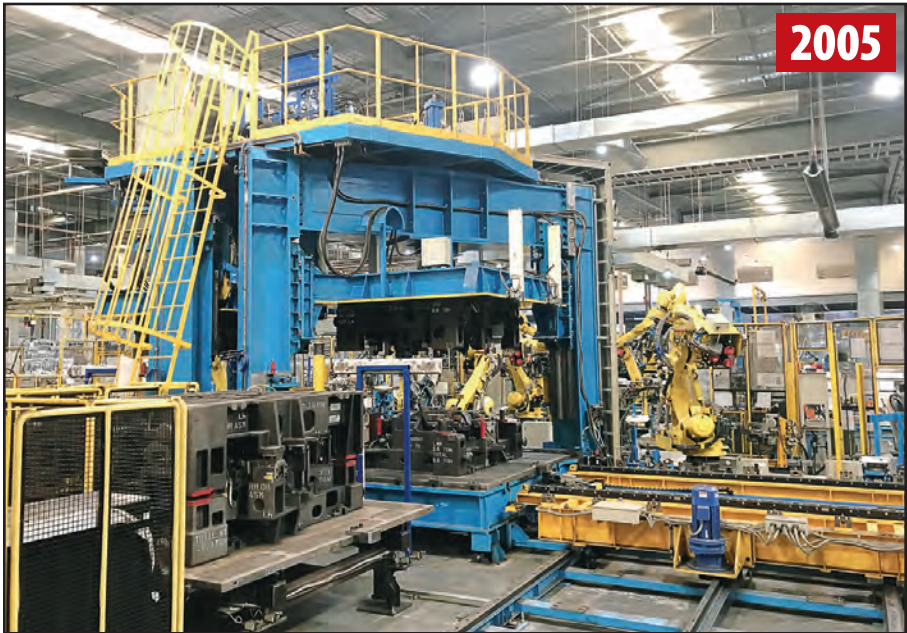
REAR DOOR LINE

2005 FRONT DOOR LINE-DUAL STATION HEM PRESS, 2500mm x 2500mm Bed Size Fanuc R-2000iA/200EW (Qty 3-2004), Fanuc R-2000iA/165EW (Qty 10-2004), Fanuc M-16iB/20 (Qty 2-2004)