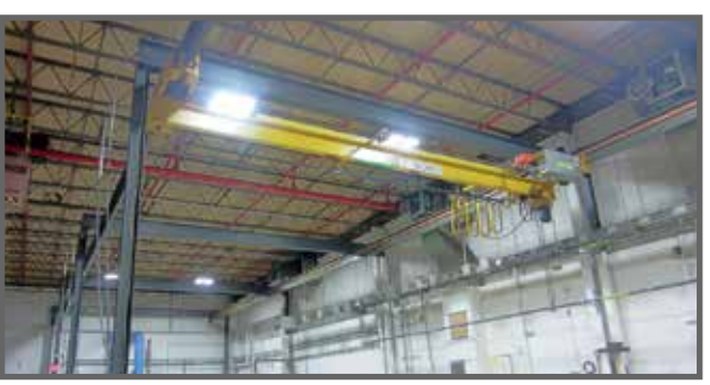
SPAN MASTER 2 TON FREE STANDING BRIDGE CRANE