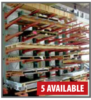
VIEW OF CANTILEVER RACKS