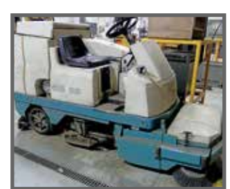
TENNANT FLOOR SCRUBBER

Online Bidding Available Through BidSpotter.com