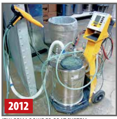
ITW GEMA POWDER COAT SYSTEM