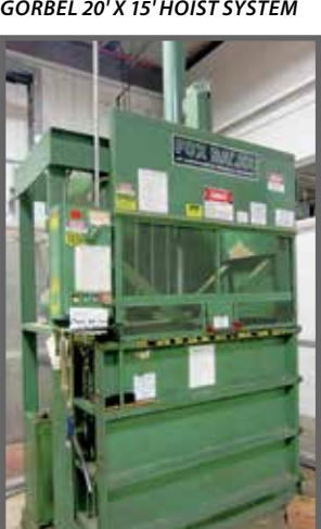
FOX CARDBOARD BALER

Online Bidding Available Through BidSpotter.com