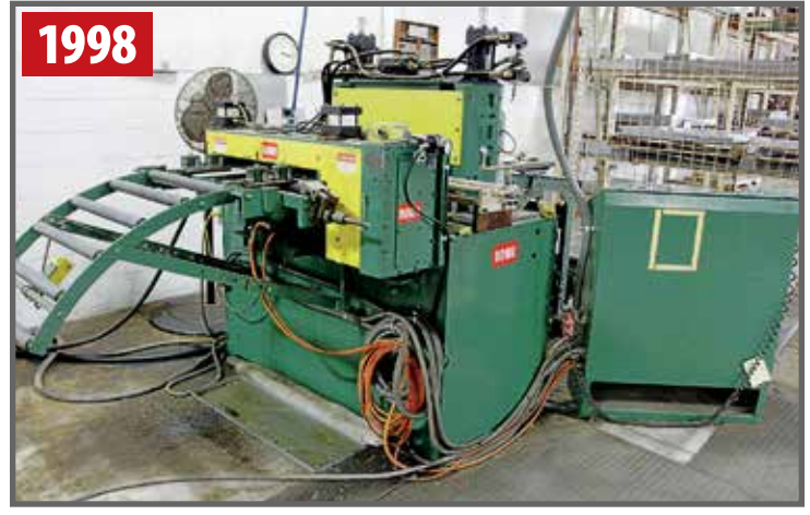
ROWE CUT-TO-LENGTH LINE - SHEAR VIEW