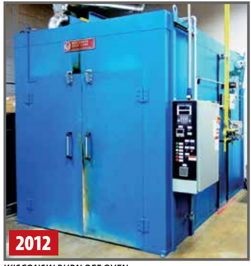
WISCONSIN BURN OFF OVEN