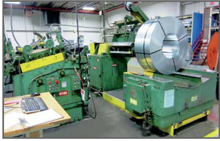
ROWE 30" X .150" X 10,000 LB SERVO COIL FEED SYSTEM

NOTE: OVER 3,000 PIECES OF TURRET TOOLING AVAILABLE