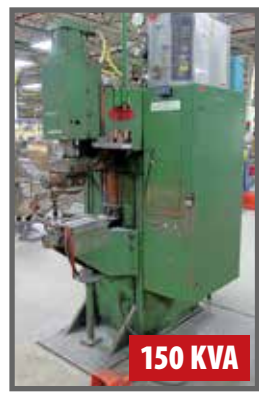
PEER SPOT WELDER