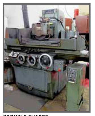
BROWN & SHARPE SURFACE GRINDER

(3) PEER SPOT WELDER, w/Interlock Industries Microprocessor Control, Up to 150 KVA; LINCOLN WIREMATIC 255 MIG WELDER; LINCOLN IDEALARC SP-100 WELDER, AIRCO HELIWELDER TIG WELDER; THERMAL DYNAMICS CUTMASTER 38 PLASMA CUTTER; ALSO: Welding Curtains; Welding Tables; Fume Exhausts; Down Draft Tables; Welding Wire and Rod; Chipping Hammers; Welding Supplies; Tips; Etc.