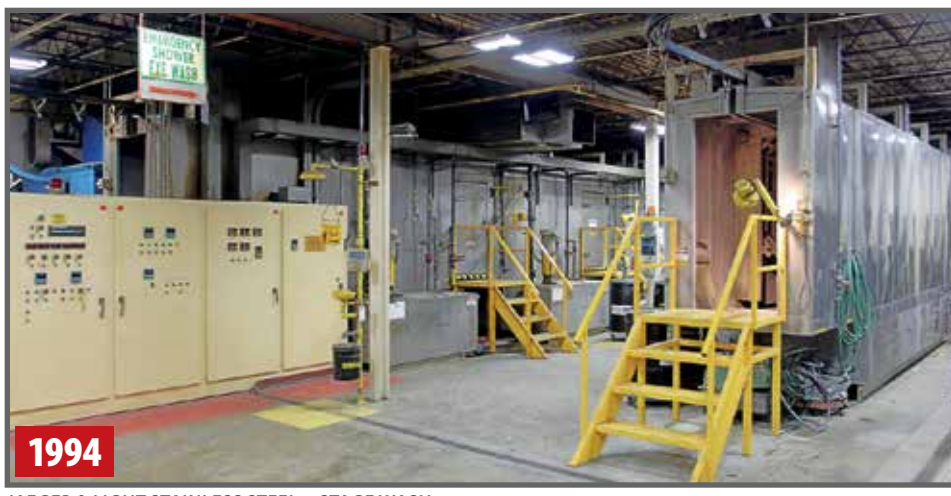
JAEGER & LIGHT STAINLESS STEEL 5-STAGE WASH

2012 WISCONSIN EWN-612-7G/EP BURN OFF OVEN, S/N 02894A1012, w/Natural Gas-Fired, 500 Deg. F