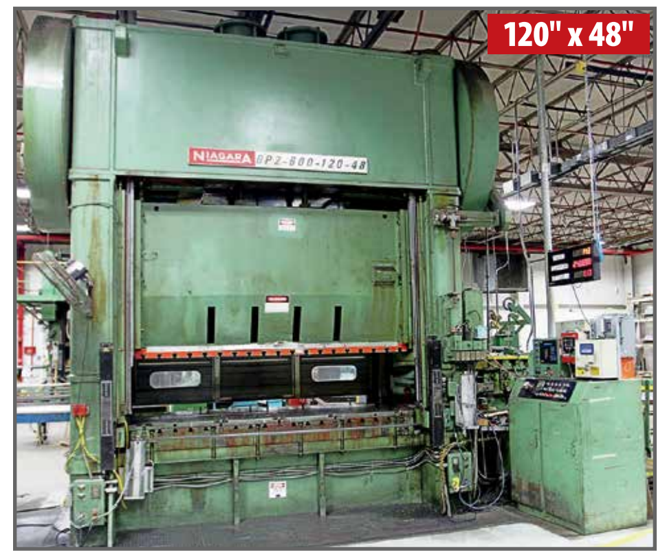
NIAGARA 600 TON SS PRESS