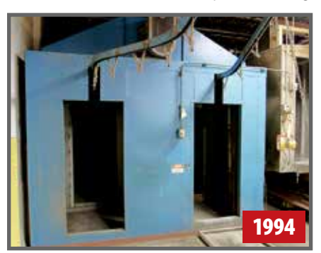
JAEGER & LIGHT DRY OFF OVEN

BROWN & SHARP 1224 MICROMASTER SURFACE GRINDER, S/N 523-1224-373; HARIG 612 SURFACE GRINDER; LEACH 618 SURFACE GRINDER; CLAUSING 5914 ENGINE LATHE, S/N 508345, 8" 3-Jaw Chuck; WESTOFF ENGINE LATHE; WELLSAW 600 HORIZONTAL BANDSAW, S/N 10805; (3) CLAUSING 1769 VARI-SPEED DRILL PRESSES; BUFFALO SUB-ASSEMBLY DRILL PRESS; HECK NIBBLER TRACE-A-MATIC PUNCH; INDEX HORIZONTAL MILL; ALSO: Double-End Grinders; Belt Grinders; Disc Grinders; KURT Vises; Rotary Tables; Shop Presses; Mag Base Drills; Corner Notchers; Hand Punches; Vertical and Horizontal Bandsaws; Drill Point Grinders; Hardness Testers; Granite Surface Plates; Inspection Tooling; Perishable Tooling; Carbide Inserts; Etc.