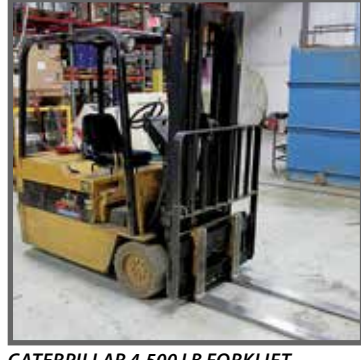
CATERPILLAR 4,500 LB FORKLIFT