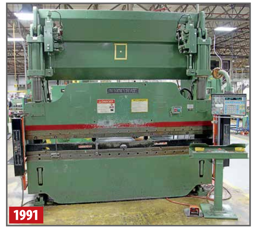
CINCINNATI 90 TON CNC BRAKE