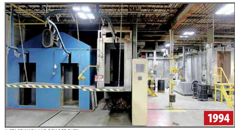
5-STAGE WASH AND DRY OFF OVEN