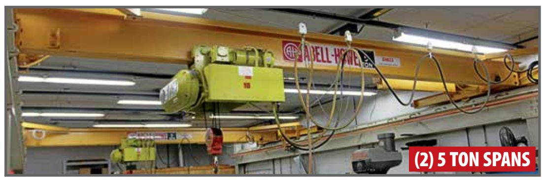
ABELL-HOWE 10 TON FREE STANDING BRIDGE CRANE