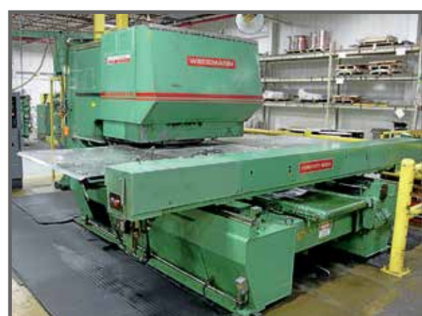
WIEDEMANN 45 TON TURRET PUNCH