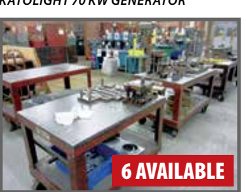
HD DIE TRUCKS