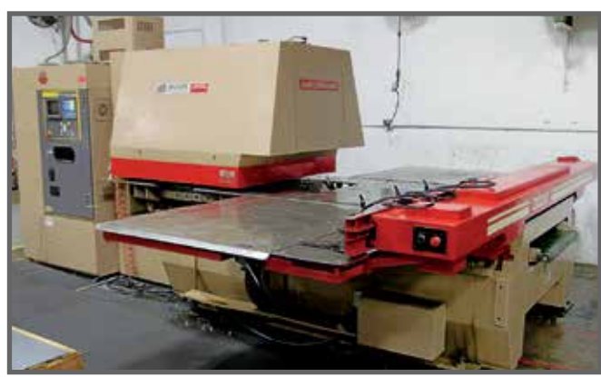
MURATA WIEDEMANN 33 TON TURRET PUNCH