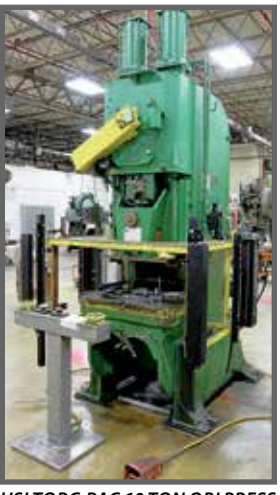
USI TORC-PAC 60 TON OBI PRESS