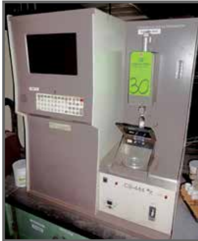
LECO CORPORATION CS-444 CARBON/SULFUR DETERMINATOR