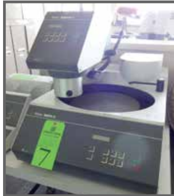
STRUERS ROTOPOL-31 METALLURGICAL POLISHER >

Sale Closing Date: Thursday, May 29 at 1:00 P.M. CDT