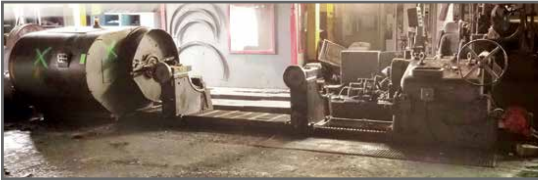
CINCINNATI SK-7728 36 X 192 TRAVELING HEAD ROLL GRINDER (56 MILL)

INCLUDING: LAB & BOF LAB EQUIPMENT, ROLL GRINDING, PUMPS & VALVES, LIFTING EQUIPMENT, AIR & GAS COMPRESSORS, DRYERS & BLOWERS, BRIDGE CRANES, COILER SPARE PARTS, FILTRATION SYSTEM, TOOLROOM & CNC MACHINERY, 56" MILL COMPONENTS