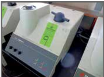
STRUERS LABOPRESS-3 MOUNTING PRESSES

Sale Closing Date: Thursday, May 29 at 1:00 P.M. CDT