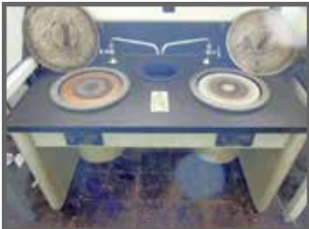
BUHLER DUAL 12" POLISHING STATION

Inspection: Wednesday May 28 From 9:00 A.M. to 4:00 P.M.