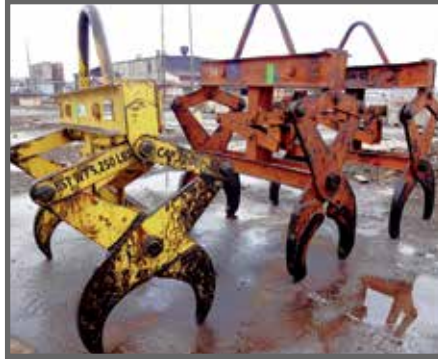
VIEW OF ROLL TONGS