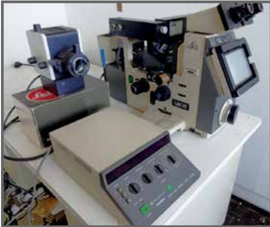
LECO OLYMPLUS PMG3 ELECTRON MICROSCOPE