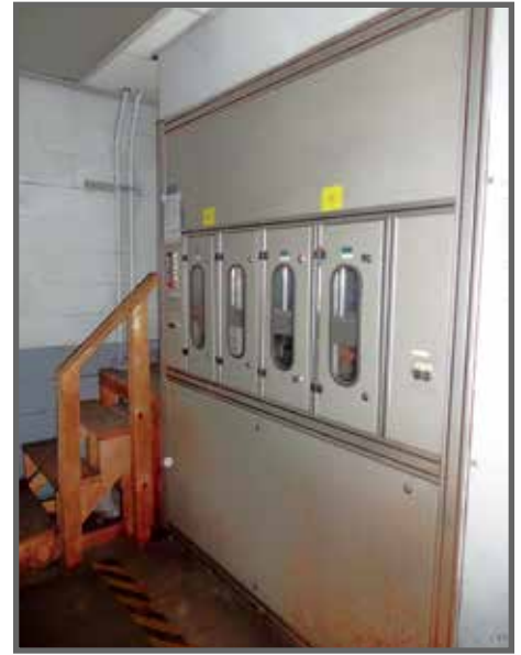
KELLY TUBE SYSTEM