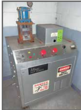
(1 OF 2) MINCO HOT PUNCHES

Inspection: Wednesday May 28 From 9:00 A.M. to 4:00 P.M.