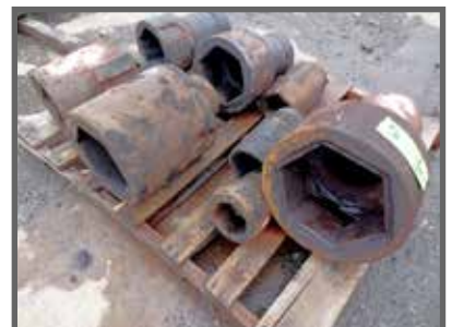
INGERSOLL RAND IMPACT WRENCHES W/SOCKETS