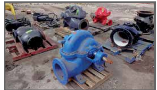
VIEW OF PUMPS AND VALVES