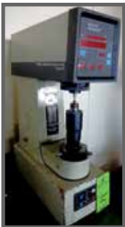
< WILSON/ROCKWELL 95-I SERIES HARDNESS TESTER