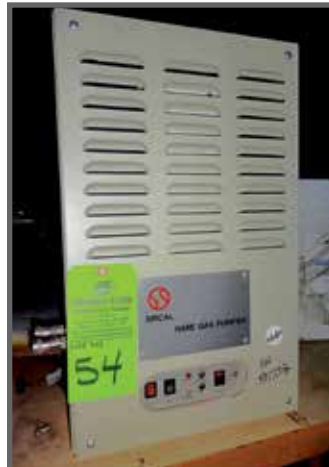
SIRCAL RARE GAS PURIFIER