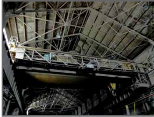
125 TON MORGAN BRIDGE CRANE