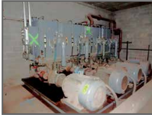
PUMP ROOM: (4) 100 HP WORLDWIDE ELECTRIC MOTORS; (4) PARKER DENISON P11V 2R5C 102A HYDRAULIC PUMPS AND TANKS