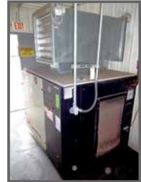
40 HP INGERSOLL RAND UP6-40-125