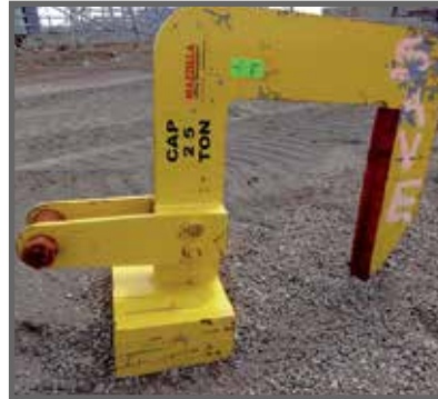
25 TON MAZZELLA C-HOOK