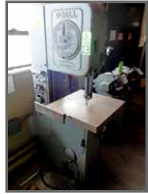
DOALL VERTICAL BANDSAW