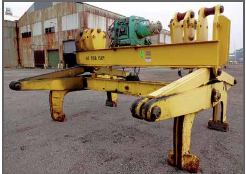
40 TON WINKLE SLAB TONGS

Sale Closing Date: Thursday, May 29 at 1:00 P.M. CDT