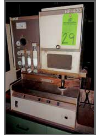
LECO CORPORATION HF400 FURNACE