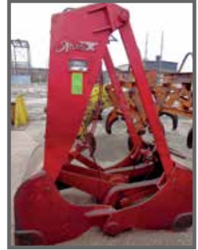
ANVER SLC-50 CLAM SHELL ATTACHMENT