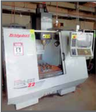
< BRIDGEPORT TORQ-CUT 22 CNC VERTICAL MACHINING CENTER