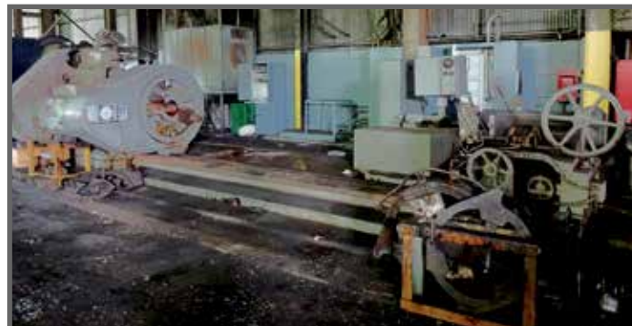
MESTA ROLL GRINDER