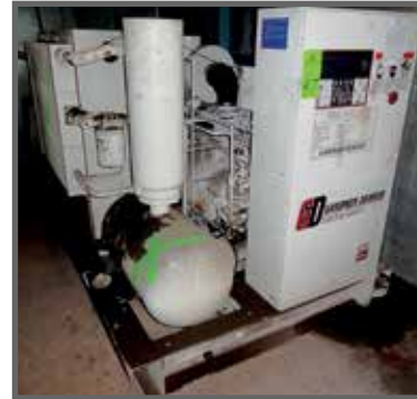
100 HP GARDNER DENVER EAP99J AIR COMPRESSOR