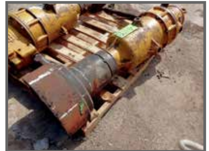
INGERSOLL RAND IMPACT WRENCHES W/SOCKETS