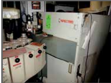
SPECTRA LAVWAM8B SPARKER