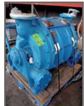
(1 OF 3) GARDNER DENVER NASH CL 2001 SS GAS COMPRESSORS