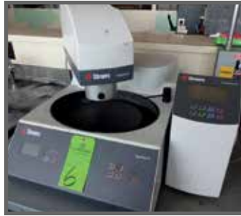
STRUERS TEGRA FORCE-5 METALLURGICAL GRINDING SYSTEM