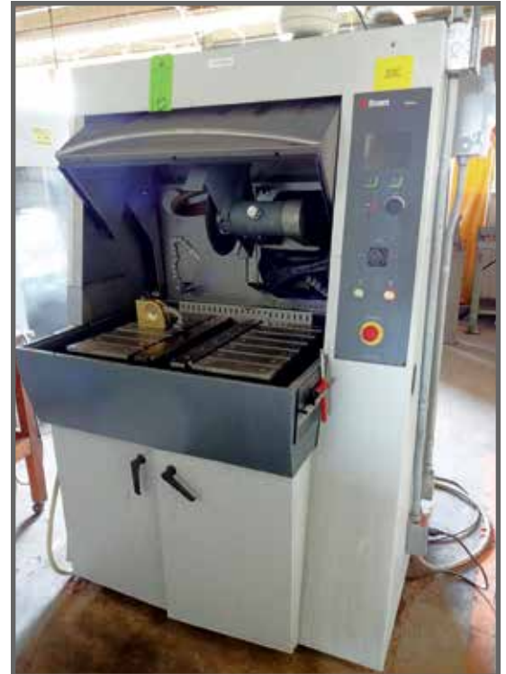
STRUERS TYPE D5486154 AXITOM SAW