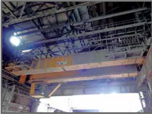
20 TON ALLIANCE BRIDGE CRANE