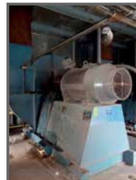
500 HP TECO WESTINGHOUSE BCN-SW BLOWER