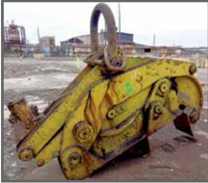
30 TON HEPPENSTALL EYE-TO-THE-SKY COIL LIFTER