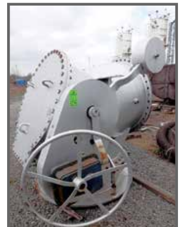
VALVES, INC. 45" VALVE