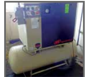
INGERSOLL RAND UP6-15C-125 ROTARY SCREW TYPE AIR COMPRESSOR

Online Bidding at www.perfectionindustrial.com