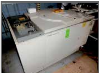
PHILIPS PW 2400 X-RAY SPECTROMETER