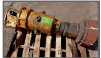
INGERSOLL RAND IMPACT WRENCHES W/SOCKET