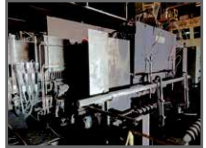
CASTER 60" GEGA DUAL HEAD TORCH CUT OFF