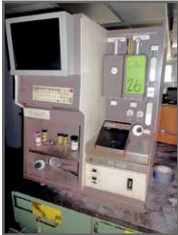
LECO CORPORATION 782-400-400 NITROGEN/OXYGEN DETERMINATOR