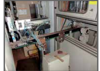
KELLY TUBE SYSTEM

To discuss your requirements for an auction, please call Perfection Industrial 847.427.3333