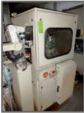
LAUER PCS 095 TOPLINE MINI CONTROL