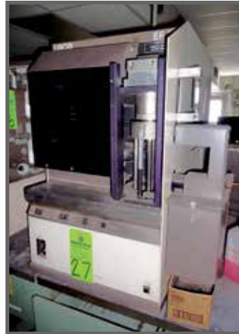
LECO CORPORATION EF-500 ELECTRIC FURNACE