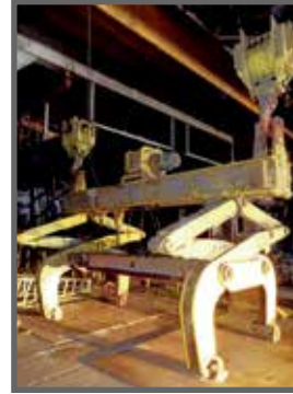
40 TON UNIFAB SLAB TONGS