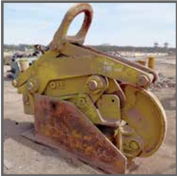
25 TON HEPPENSTALL EYE-TO-THE-SKY COIL LIFTER