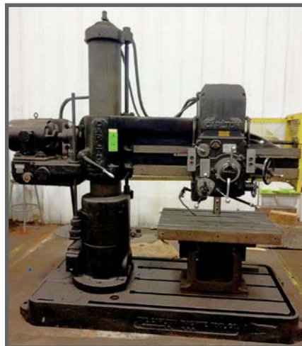
CARLTON 5' X 11" COLUMN RADIAL ARM DRILL

LEBLOND 16" HEAVY DUTY LATHE , S/N 2NE757, 11-1,330 Spindle Speed RPM, 14" 3-Jaw Chuck, 16" Swing x 90" Between Centers, Tool Post