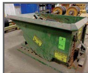
VIEW OF SELF-DUMPING HOPPERS