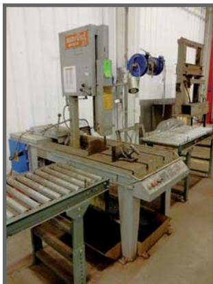
MARVEL SERIES 8 MK-1 VERTICAL BANDSAW