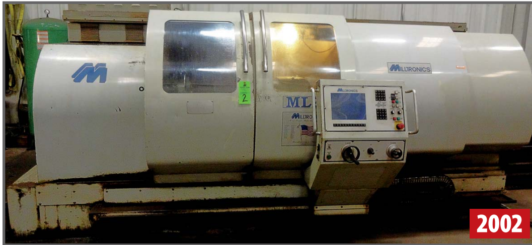
MILLTRONICS HL-22 CNC LATHE