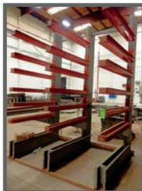
VIEW OF PALLET RACKING

(15) 6-8" Machine and Bench Type Vises; 12' Pallet Racking; (4) 1/4-1/2 Cu. Yd. Self-Dumping Hoppers; Clean Burn Used Oil Furnace; Granite Surface Plates; and More