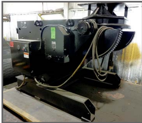
KOIKE ARONSON HD160A WELDING POSITIONER