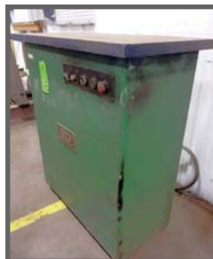
IRD B50-5V BALANCER