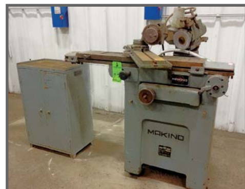
MAKINO C-40 TOOL CUTTER GRINDER

LYNX 85 PLASMA CUTTER , 11' x 80" Water Table, Single Head, Thermafil Dynamics SC-11 Remote Standoff Control