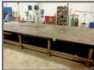
VIEW OF WELDING TABLES

20' X 8' X 1.5" WELDING TABLE 20' X 8' X 1.25" WELDING TABLE 20' X 8' X 1" WELDING TABLE 16' X 8' X 1.25" WELDING TABLE (2) 10' X 8' X 1.25" WELDING TABLE 10' X 5' X 1.5" WELDING TABLE 9' X 8' X 1.25" WELDING TABLE 8' X 5' X 1' WELDING TABLE 8' X 4' 3/4" WELDING TABLE 59" X 93" WELDING TABLE