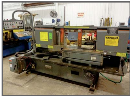
HEM CYCLONE HORIZONTAL BANDSAW