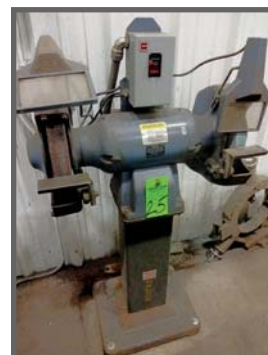
BALDOR 10" DUAL END GRINDER