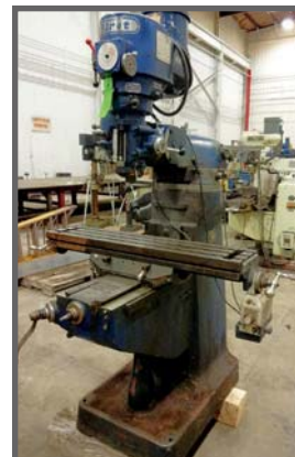
SHARP LMV TURRET MILLING MACHINE