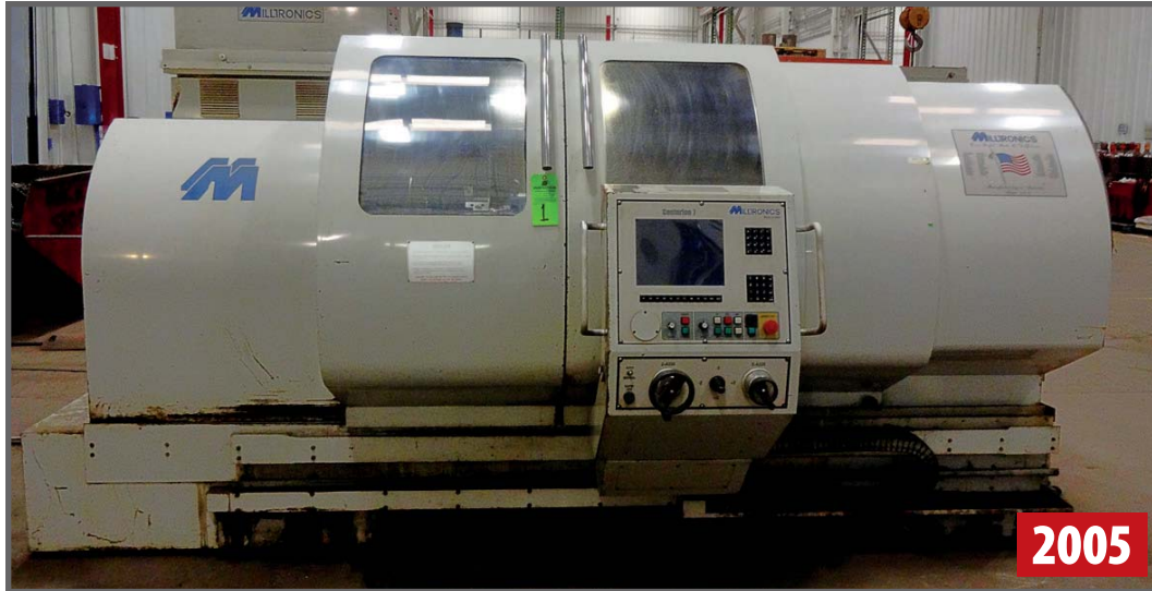
MILLTRONICS HL-22 CNC LATHE