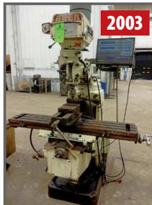
ACER ULTIMA 3V1 MILLING MACHINE