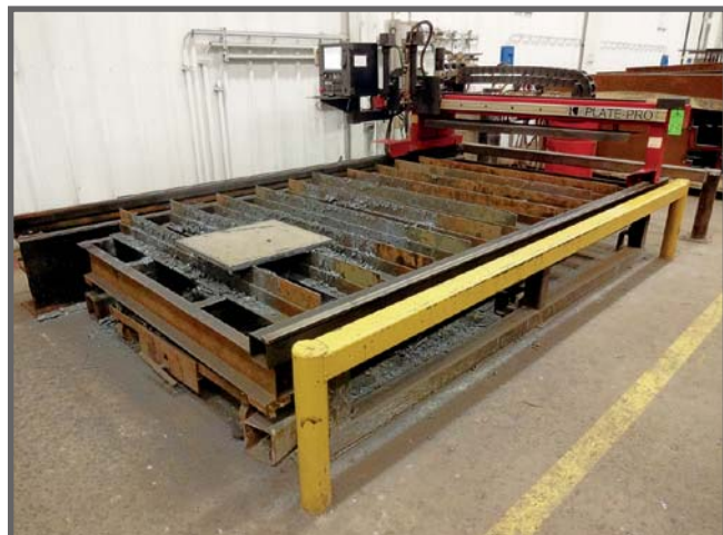
KOIKE PLP-150 PLATE PRO CNC TORCH CUTTER

ROLL IN ALL PURPOSE BANDSAW , 9" x 3/4" Blade, 300 FPM, 18.5" x 30.5" Table, 12" Throat