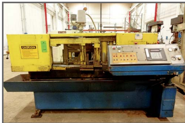
HEM H105A HORIZONTAL BANDSAW