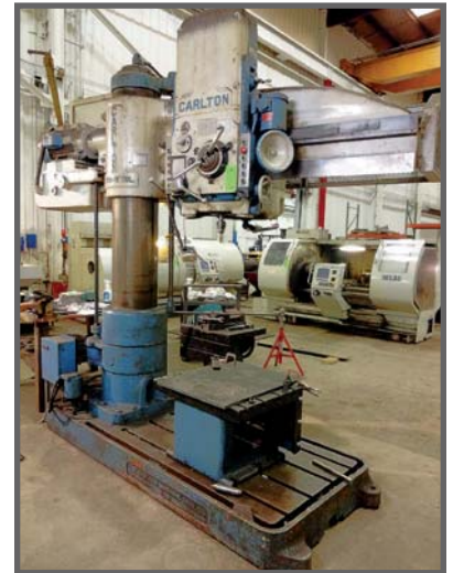
CARLTON 5' X 15" COLUMN RADIAL ARM DRILL