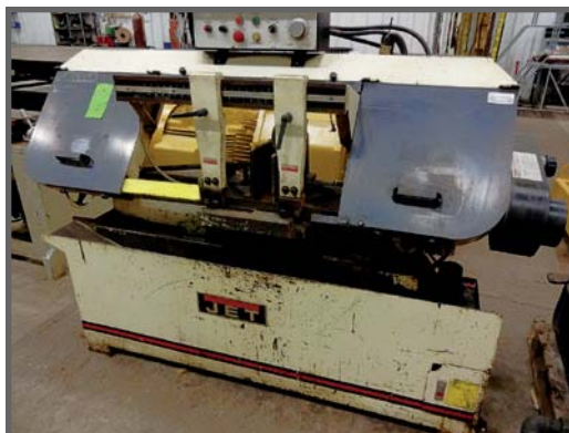
JET HORIZONTAL BANDSAW