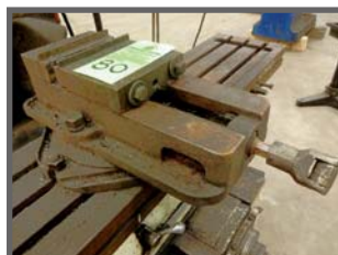
VIEW OF VISES