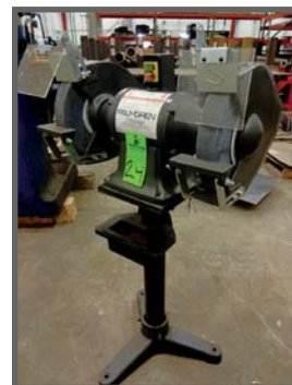
PALMGREN 12" GRINDER