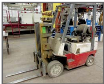
NISSAN OPTIMUM 40 LP SHORT MAST FORKLIFT

16,000 LB KOIKE ARONSON HD160A WELDING POSITIONER, S/N 99165