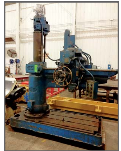
ASQUITH LTD 5' X 9" COLUMN RADIAL ARM DRILL

To discuss your requirements for an auction, please call Perfection Industrial 847.427.3333