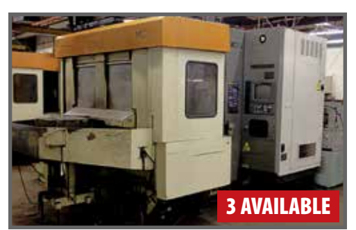
LEBLOND MAKINO MC65 HMC