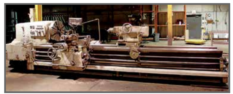
MONARCH 91 40" X 156" ENGINE LATHE