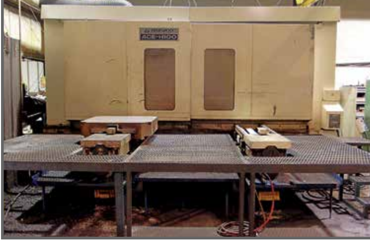
DAEWOO ACE-H100 CNC HMC