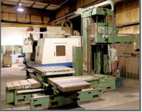
4" WOTAN B105M HORIZONTAL BORING MILL