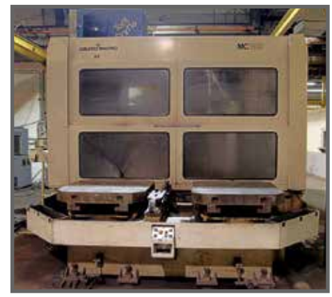
LEBLOND MAKINO MC1513 HMC

MAZAK SLANT TURN 25 UNIVERSAL 1000 TURNING CENTER, S/N 49918, w/Mazatrol T-1 Control, 8-Position Turret, 10" 3-Jaw Chuck