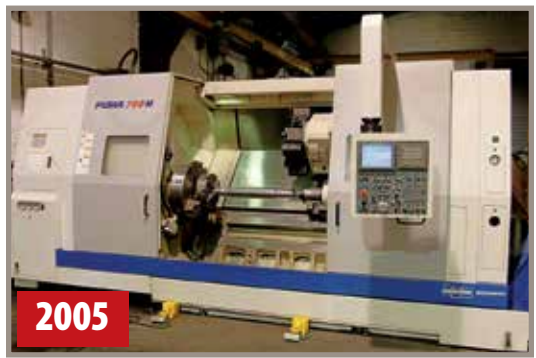
DOOSAN DAEWOO PUMA 700M TURNING CENTER

Featuring: Turning Centers & CNC Lathes, HMC's, CNC VMC's, CNC & Horizontal Boring Mills, Grinders, Vertical Turret & Engine Lathes, EDM'S, Fabricating Machinery, Milling Machines, Gun Drill, Keyseater, Welding, CMM & Inspection Equipment, Forklifts, Cranes, Air Compressors & Factory Support Equipment, Vehicles