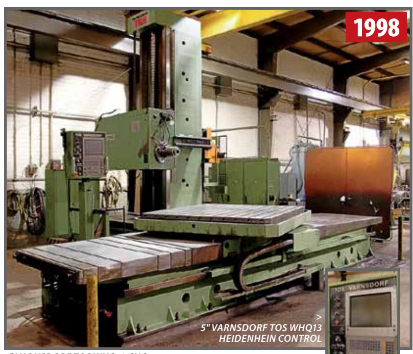
5" VARNSDORF TOS WHQ13 CNC HORIZONTAL 5-AXIS BORING MILL

(2) SHARNOA SDC 20 CNC VERTICAL MACHINING CENTERS, S/N 865281, 186072028, w/41" x 20" Table, Travels: X-22", Y-16", Z-20", 16 ATC MAHO MH600E CNC MILLING MACHINE, S/N 63654, w/19" x 35" Table, Travels: X-23", Y-15", Z-15", 4,000 RPM