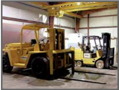
VIEW OF FORKLIFT TRUCKS 7,400 LB-20,000 LB CAPACITY