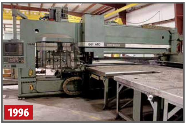
WHITNEY 667-250 PLASMA-PUNCH MACHINE

CINCINNATI EDM, S/N 41071V5W-0010, w/Sony Magnascale LM21 DRO, Hansvedt 502 H-Impulse Power Supply