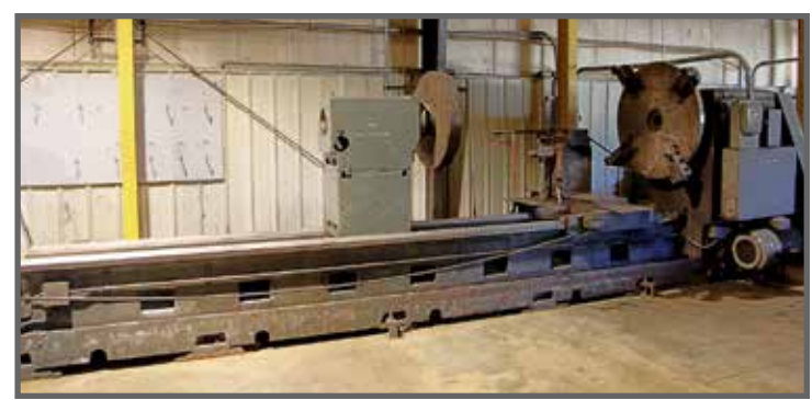
MEUSER & CO. 88" X 192" FACING/ENGINE LATHE

WARD-RUDDLE 2" GUN DRILL, w/Support Table