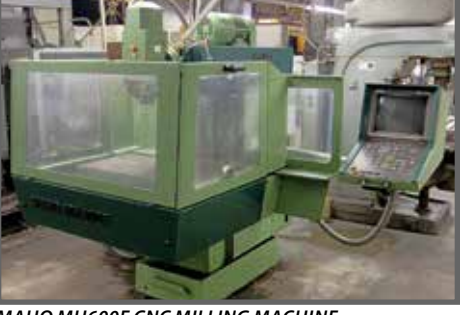
MAHO MH600E CNC MILLING MACHINE