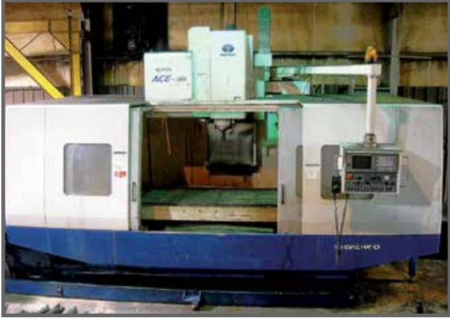
DAEWOO ACE-V850 3-AXIS VERTICAL MACHINING CENTER