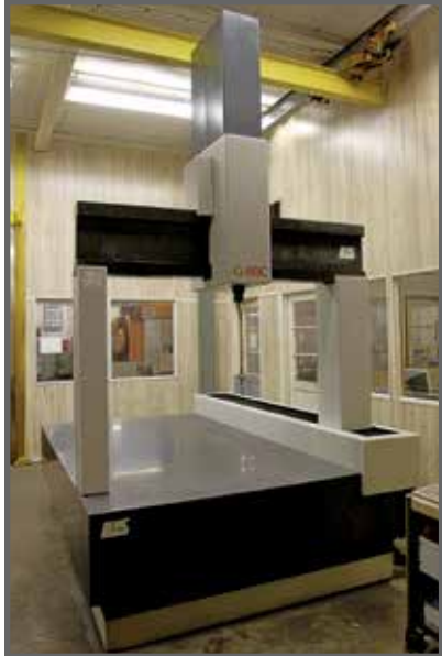
LK G-80C COORDINATE MEASURING MACHINE