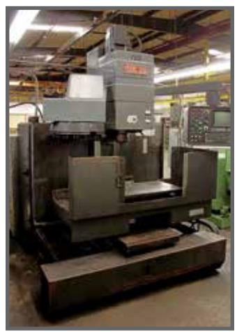
SHARNOA SDC 20 CNC MILLING MACHINE