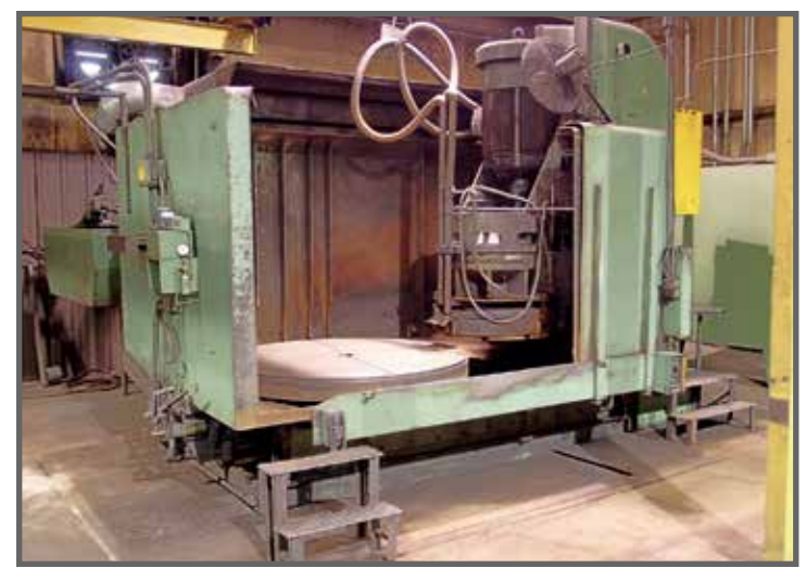
66" BLANCHARD 36HD-66 ROTARY SURFACE GRINDER